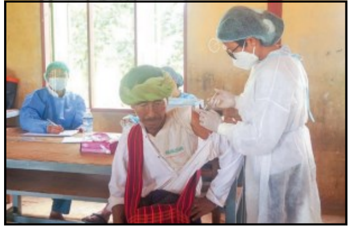
Vaccinating people against COVID-19 in respective regions and states