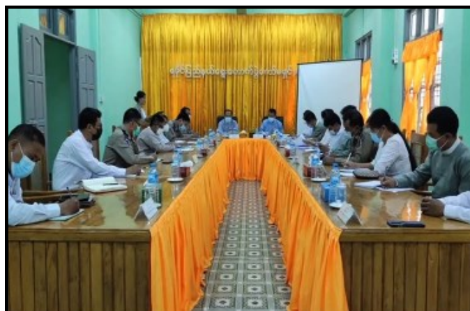
Inspections on Arakan Front Party (AFP)