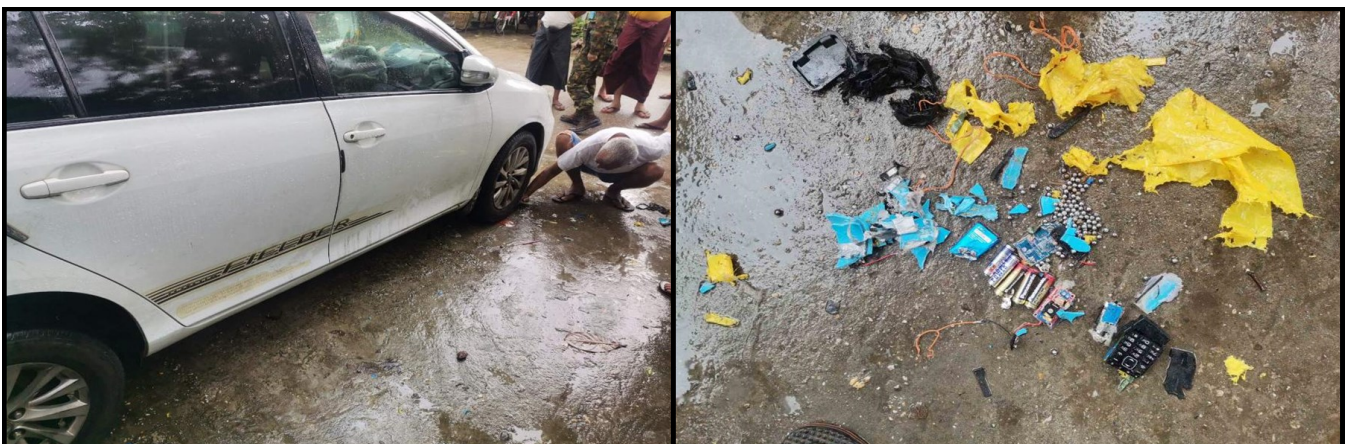
The explosion of homemade mine in front of the Ward Administration Office in No (18) ward of Hlaingthaya township