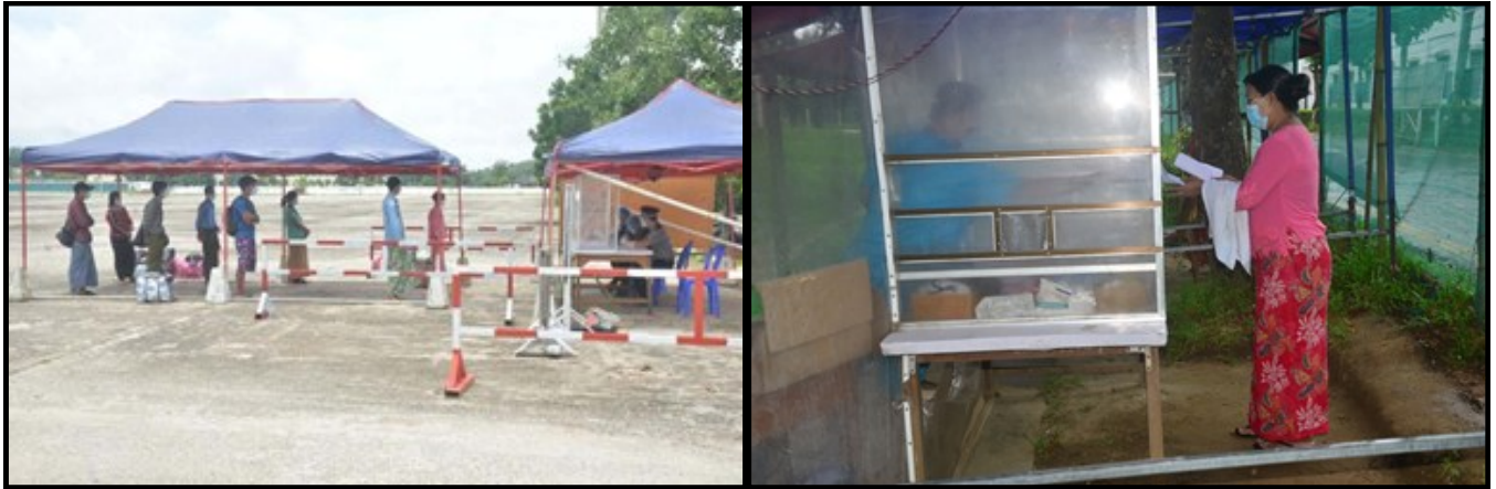
Receiving closed contacts at Interrogation and Accommodation Centres in Nay Pyi Taw and Hlaing townships

In every state and region of Myanmar, the officials are accelerating the COVID-19 prevention, control and treatment activities such as, opening quarantine centres and continuing vaccination processes.