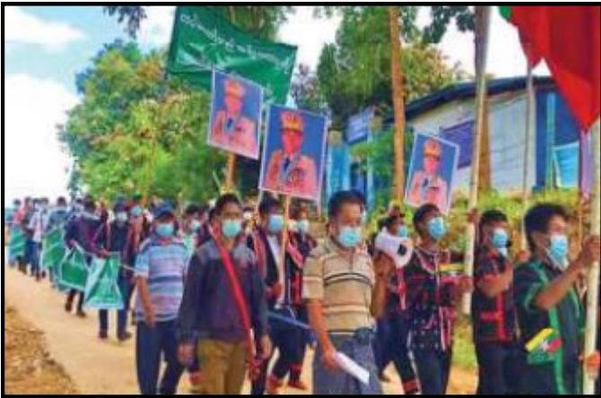
Mong Khet Township