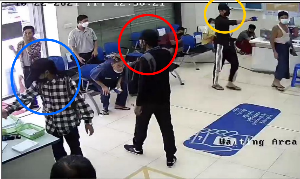
The offenders committing the bank robbery case at the branch of KBZ bank in Botahtaung Township

On 22 October, the four masked men arrived at the KBZ branch of Botahtaung township by a vehicle Fielder (white) and threatened the bank security by guns and took more than K300 million, including five mobile phones, by colluding with a man, who was waiting at the bank in advance.