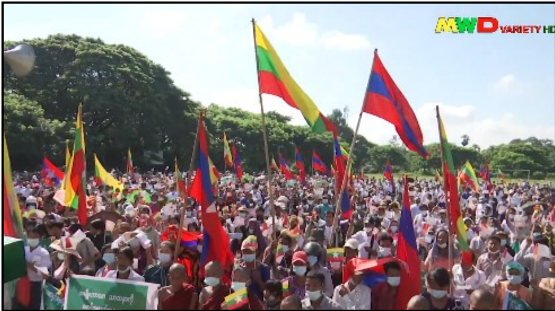
Local people in Naypyitaw supporting the activities of the State Administration Council

Mass rallies (a total of about 26,700 people) were organized to show support to the activities of the State Administration Council which assumed State's responsibilities in accordance with the 2008 Constitution in 13 townships on 27 October: Zabuthiri township of Nay Pyi Taw Council Territory, Hopang township in "Wa" Self-Administered Region of Shan state (North), Hopong and Nangseng townships in Paoh Self-Administered Zone of Shan state (South), Mong Khet township of Shan state (East), Kawthoung, Kyunsu, and Yebu