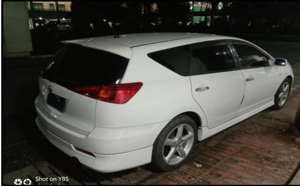
A vehicle used to transport robbed cash in bank robbery case