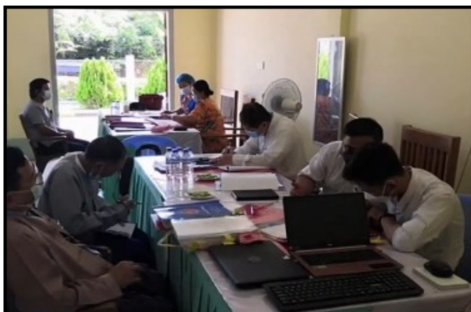
Inspection on New Democracy Party (Kachin) [NDP-Kachin]