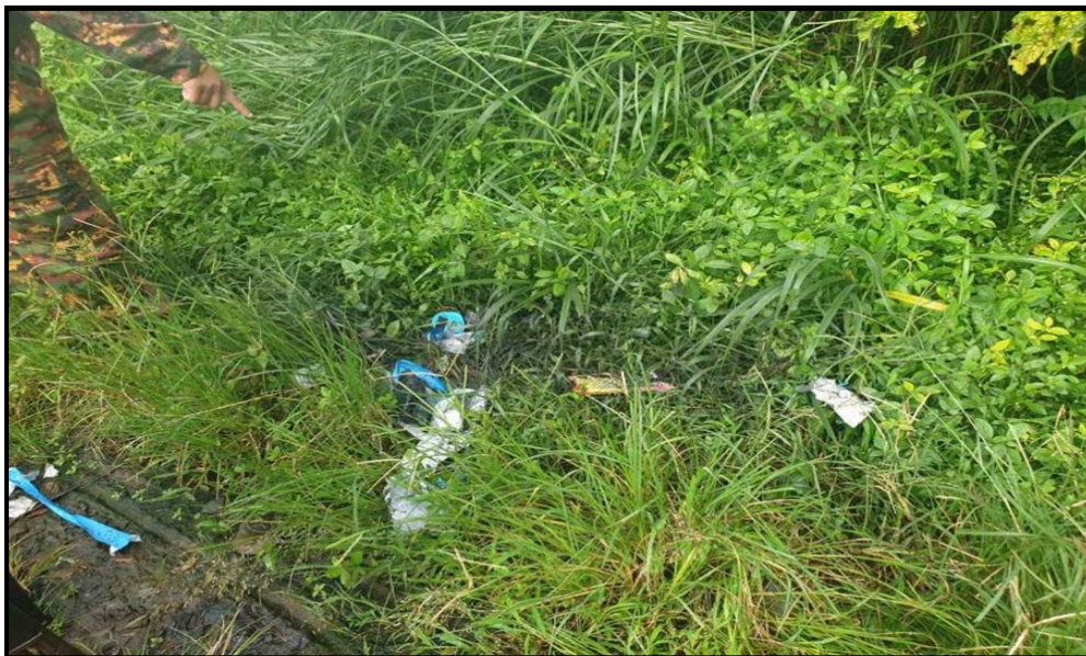
An IED explosion beside a rail-way track in Shwe Pyi Tha township