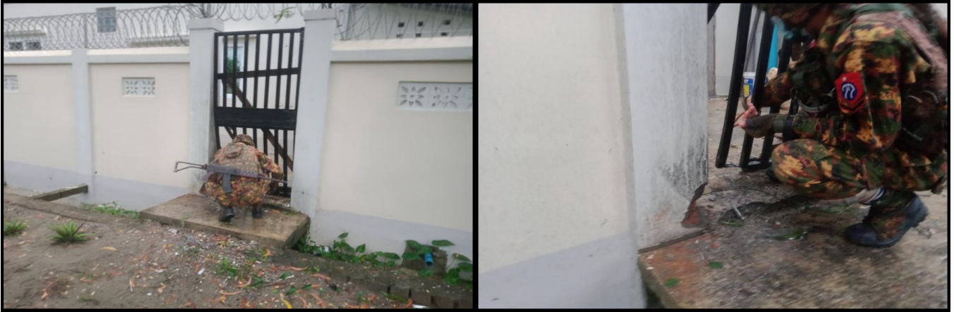
Homemade bomb explosion in the rear road of cinema in Shwepyithar township