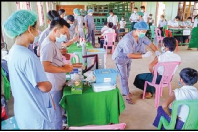
Vaccinating students aged 12 years and above against COVID-19 in respective regions and states