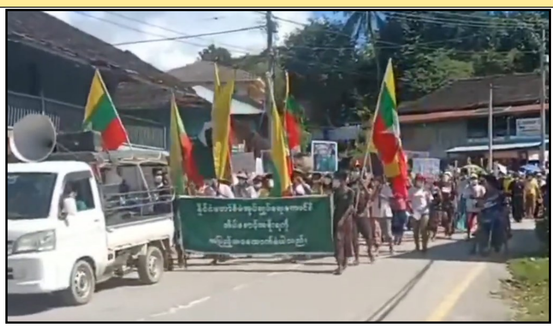
Local people in Mongbyin township supporting the activities of the State Administration Council

Mass rallies (a total of about 25,744 people) were gathered to show support to the activities of the State Administration Council which assumed State's responsibilities in accordance with the 2008 Constitution in 12 townships on 28 October: Kalaw and Mongshu townships of Shan state (South), Mongbyin township of Shan state (East), Dala and Thanlyin townships of Yangon region, Hinthada and Eainme townships of Ayeyarwady region, Butheedaung township of Rakhine state, Pakhokku township of