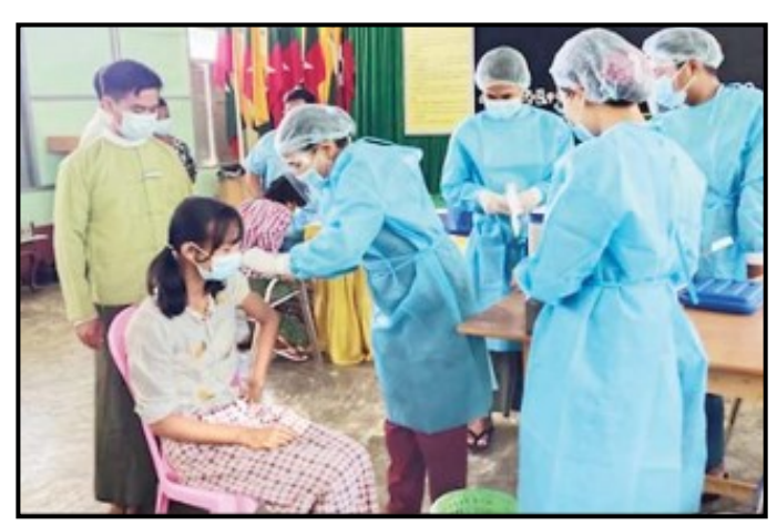
Vaccinating students aged 12 years and above against COVID-19 in Salingyi township