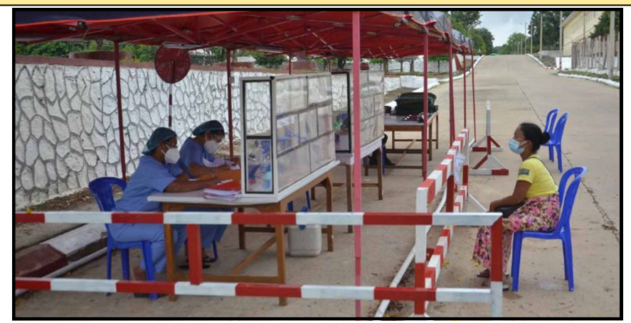
Receiving closed contacts at Nay Pyi Taw Interrogation and Accommodation Centre

In every state and region of Myanmar, the officials are accelerating the COVID-19 prevention, control and treatment activities such as, opening quarantine centres and continuing vaccination processes.