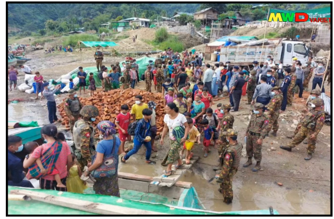
The IDPs being transported to their homes by the responsible officials

With the combined efforts of Chin state government and the Tatmadaw, mine clearance activities, house repairs were carried out in the villages of IDPs temporarily living in Platwa township of Chin state and the requirements of their livelihoods were fulfilled. Therefore, the IDPs in 7 villages from Platwa township were being transport-