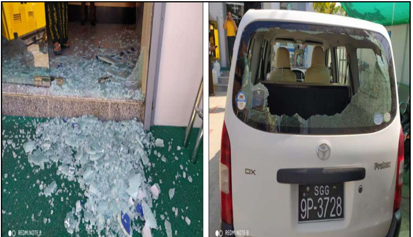
The damages in the aftermath of grenade explosion in Myawady bank in Shwebo township on 16 November 2021