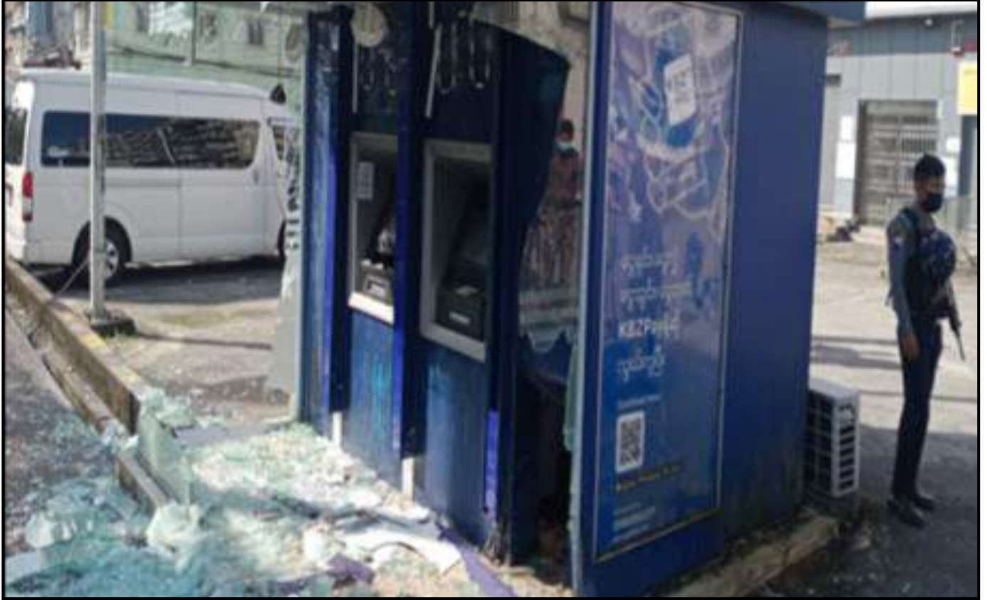
The ATM of KBZ bank in Mayangon township in the aftermath of a homemade mine explosion on 5 November 2021