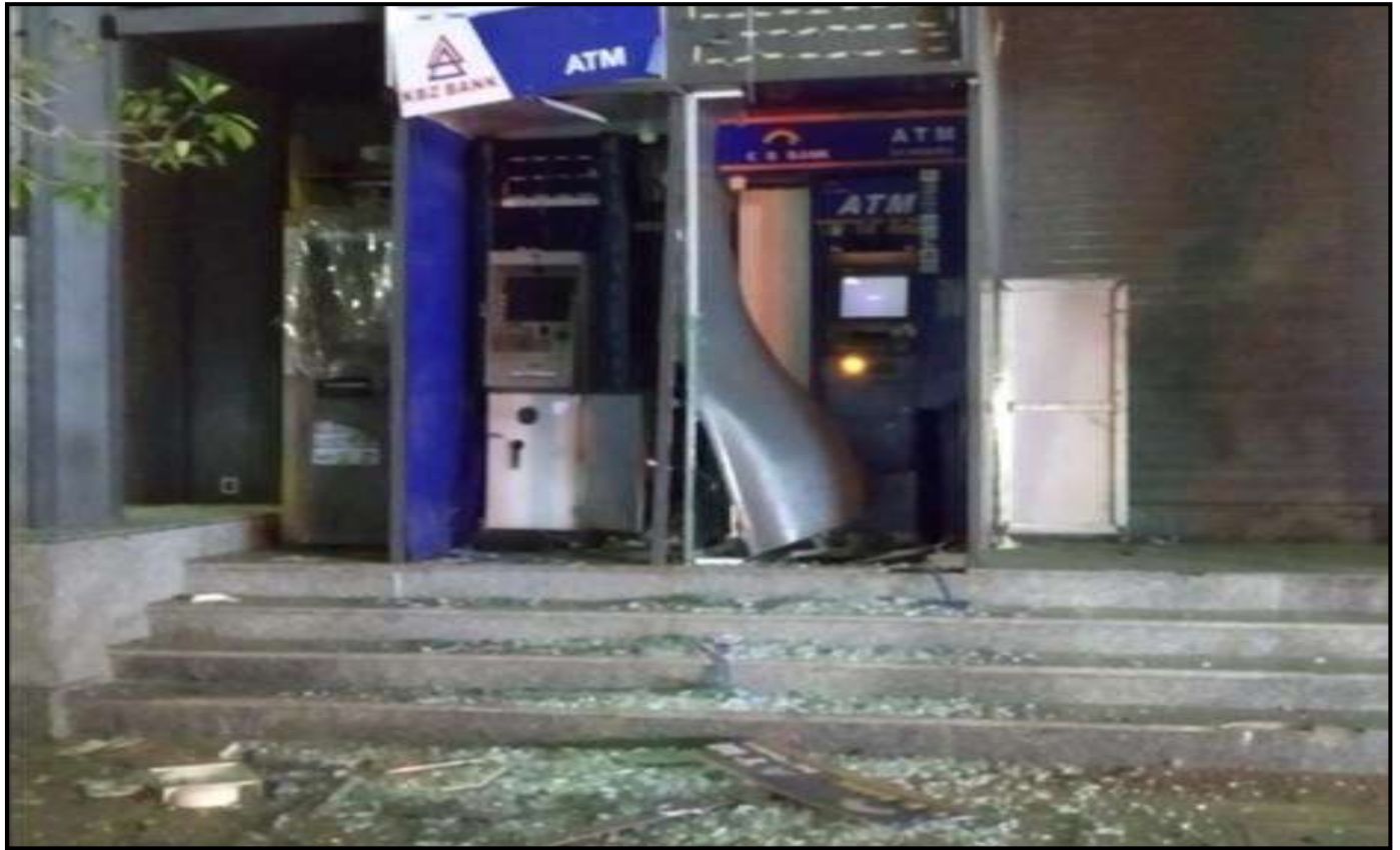
The ATMs in front of KBZ bank in Mahaangmyae township in the aftermath of homemade bomb explosion on 27 October 2021