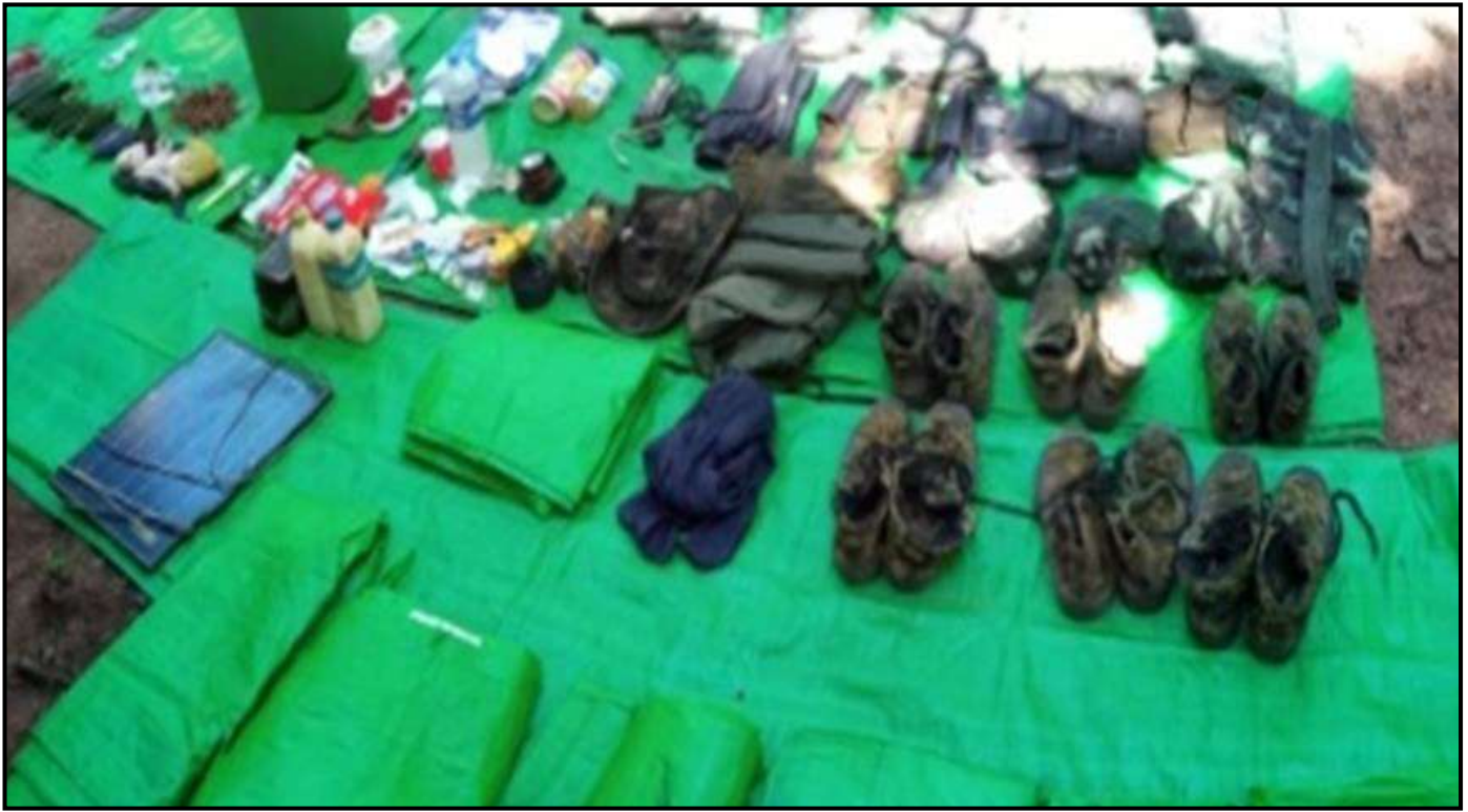
The seizures of items at Taungoo PDF station in KNLA Brigade (2) area

attacks in Yangon including Music Zone KTV, EPC offices of Kamayut, North Okkalapa and Thingangyun townships, arrested on 23 August, and arrested offender Kyaw Kyaw who was arrested in Taungoo township on 1 November,