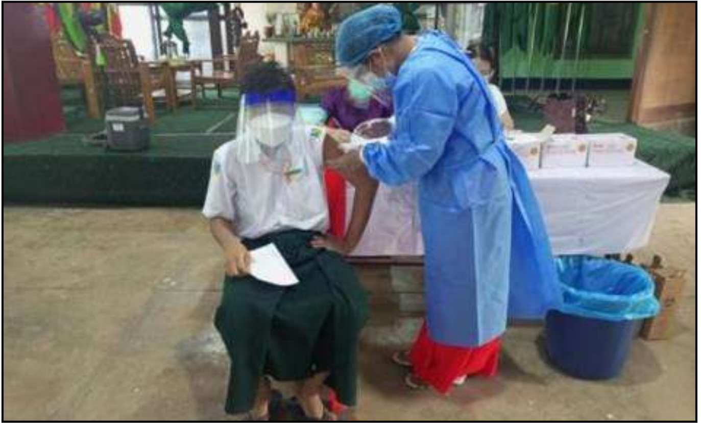
Close contacts tested for COVID-19 at Nay Pyi Taw Interrogation and Accommodation centre

COVID-19 prevention, control and treatment activities such as opening quarantine centres and vaccinating people against COVID-19 continue in respective regions and states.