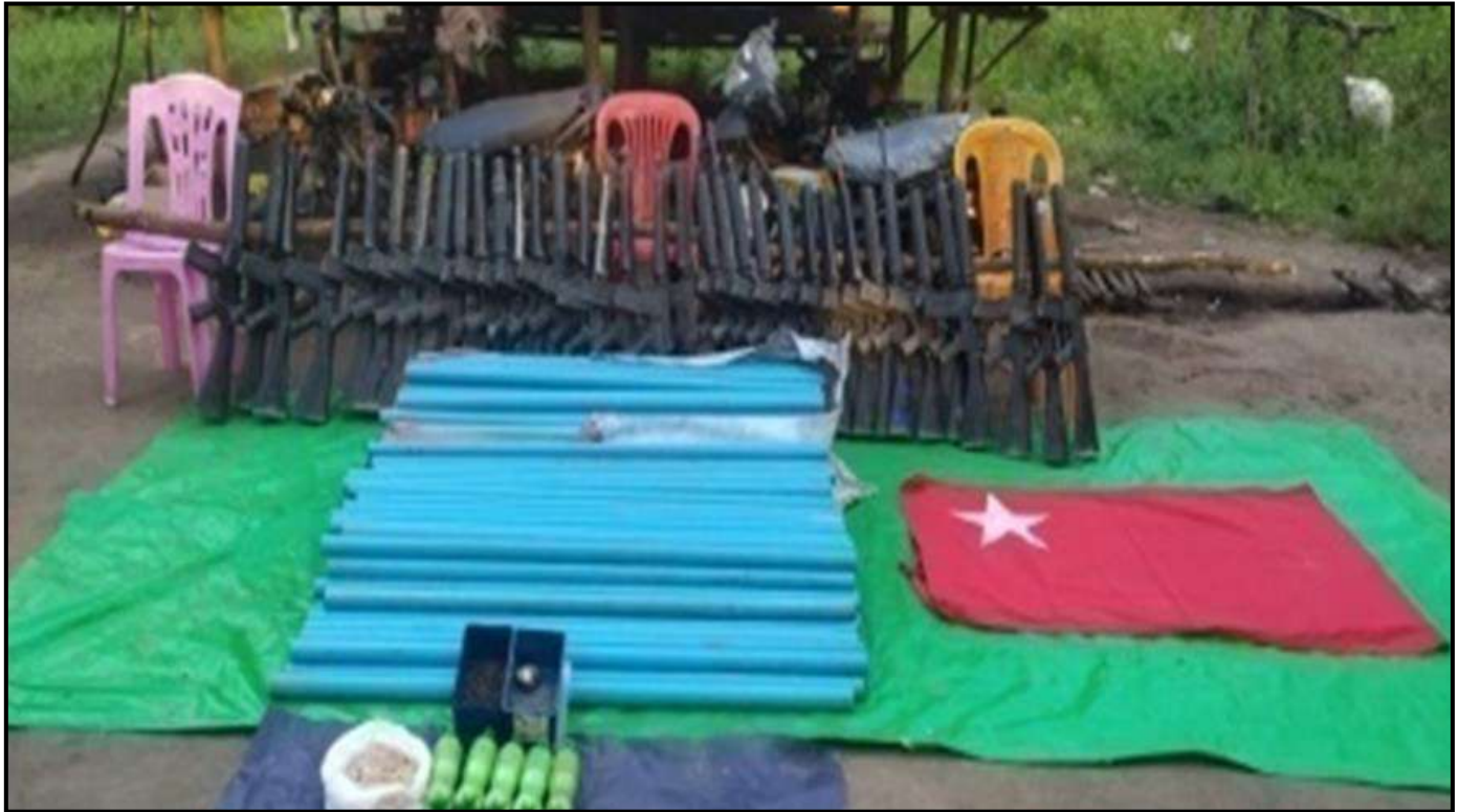
The seizures of items at Oattwin PDF station in KNLA Brigade (2) area

The terrorist group CRPH and NUG committed incitement to the NLD members/supporters, CDM participants and extremist youths to organize PDFs to perpetrate the acts of terrorism across the country. They also organized explosive training courses in KNU's controlled areas and sent those who completed the training to large cities to launch terrorist attacks.