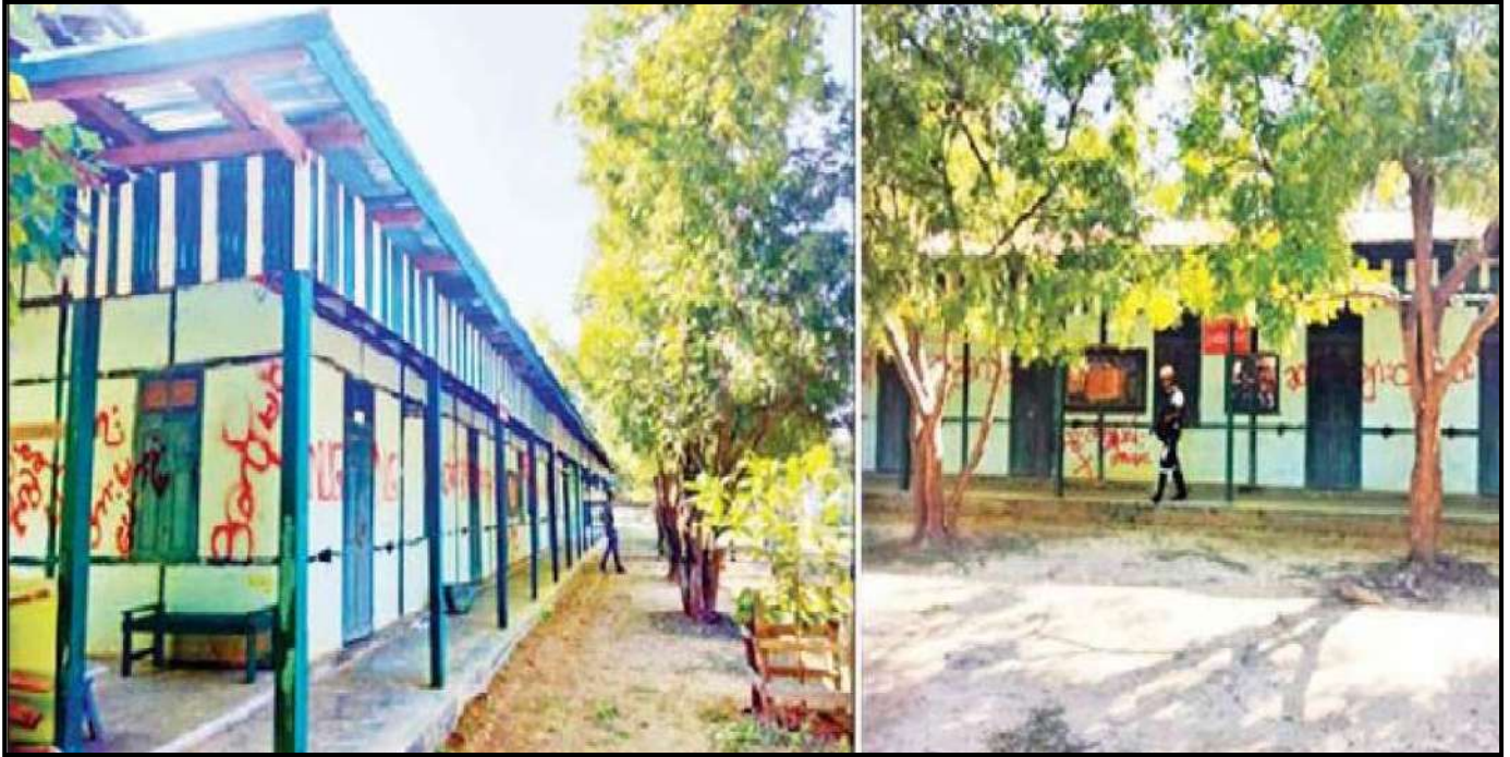
The terrorists wrote opposite words on the walls of buildings in Sub-Basic Education High School in Chakgyi village and exploded homemade mine to destroy it