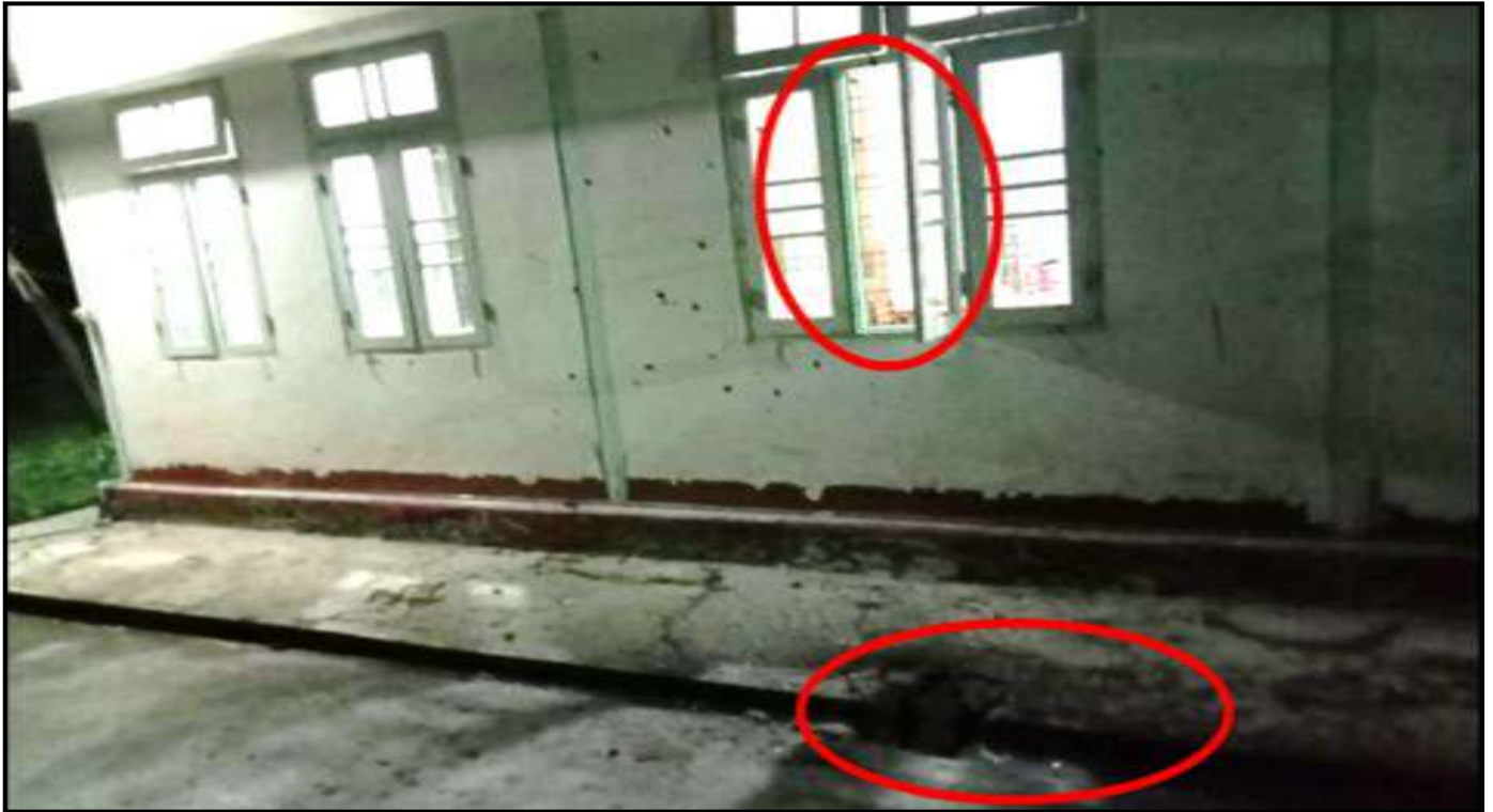
The damages in the aftermath of a sound bomb explosion near MEB in Nantkhan township on 14 June 2021