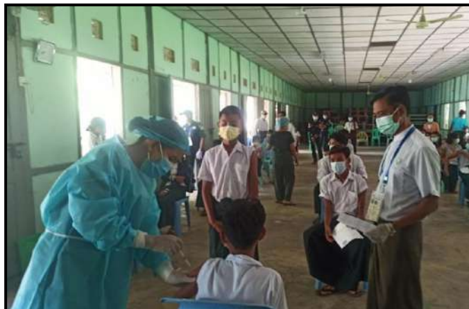
Vaccinating students against COVID-19 in Htantapin township