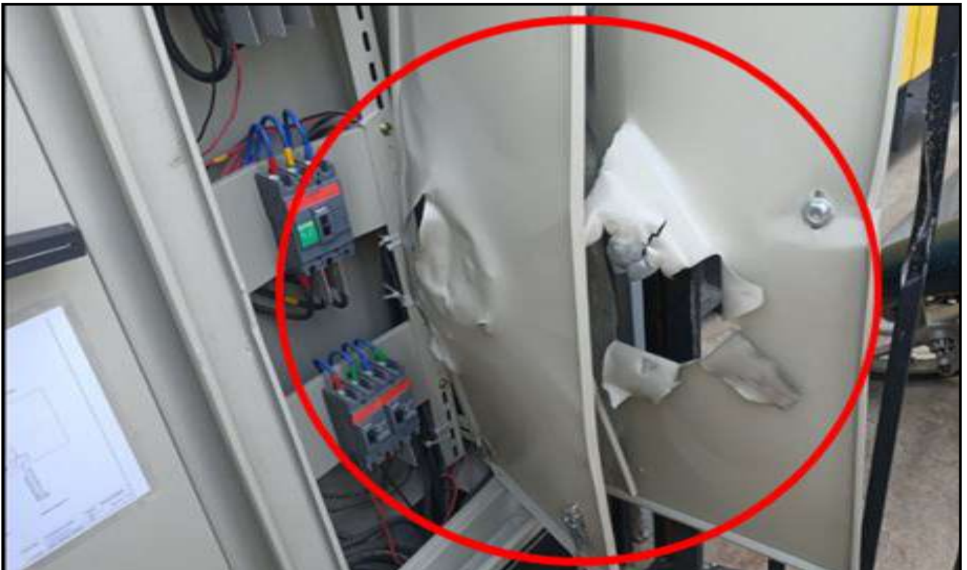
The damages in the aftermath of two homemade bombs in Myitkyina township on 19 April 2021