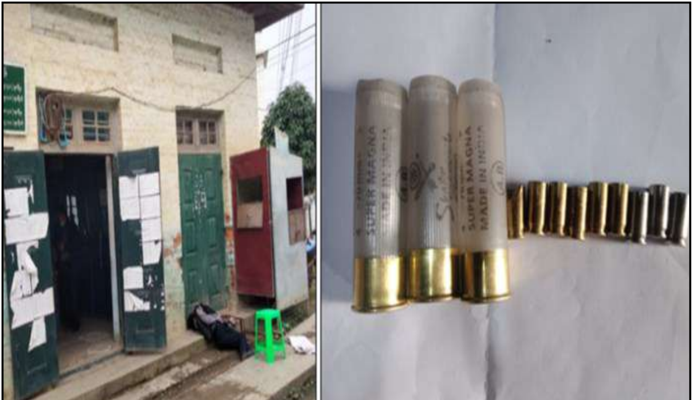
Three security members taking security measures at MEB in Tedim township died due to the attacks of terrorists on 25 August 2021