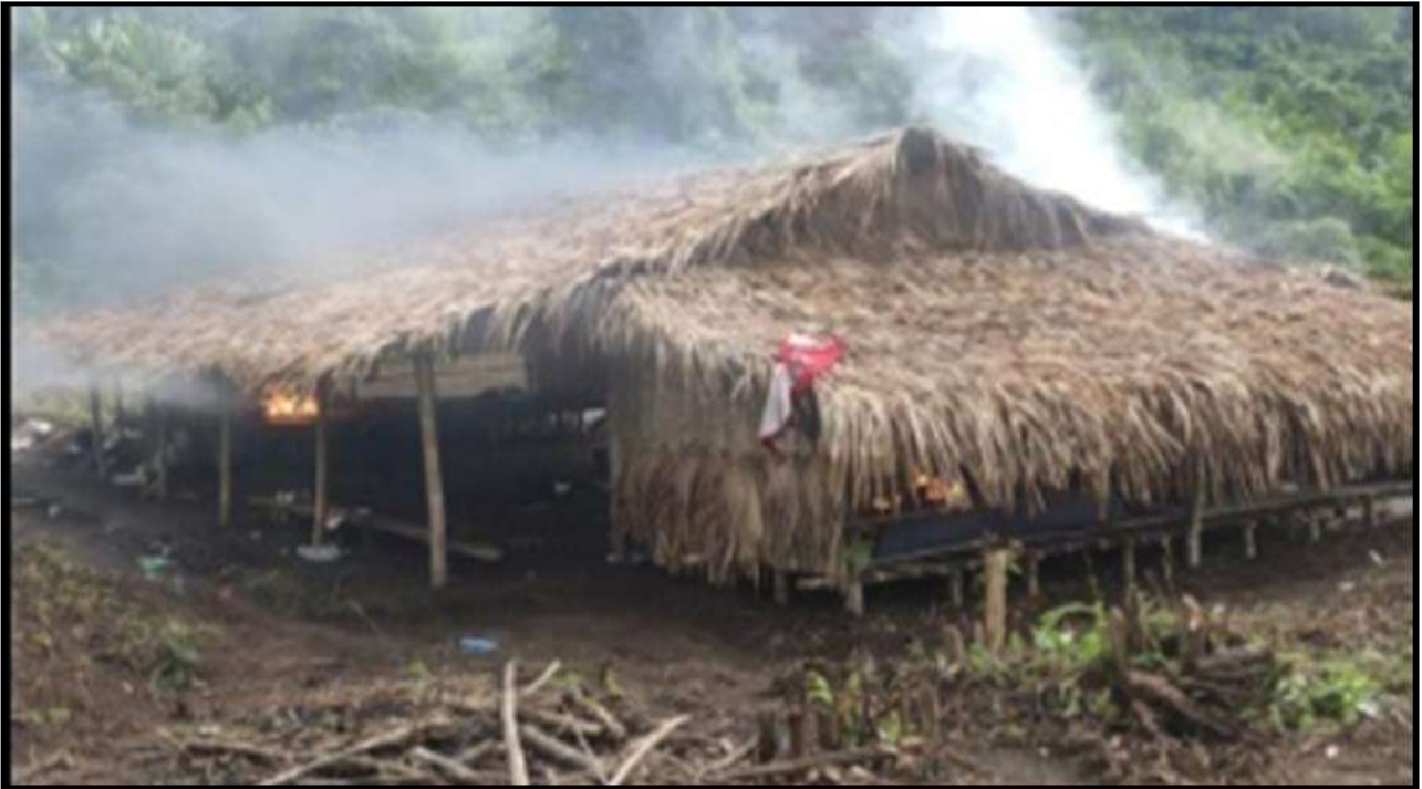
The captured place of explosive training course in KNLA Brigade (1) area

According to the confessions of arrested offenders at the above-mentioned incident, the CRPH/ NUG terrorist group sent the NLD members/ supporters, CDMers and extremist youths to the terrorism and explosive training conducted in ethnic armed group-controlled areas with their own plans. Those who completed the training have to launch bomb attacks, kill the people who want to live in peace and the close ones of governmental departments under the name of “informants/Dalan”, and attack the security members as well as to commit arson or bomb attacks on schools to threaten the teachers and students by taking weapons and ammunitions through the terrorist group with an intent to disrupt the governance mechanism and threaten people.