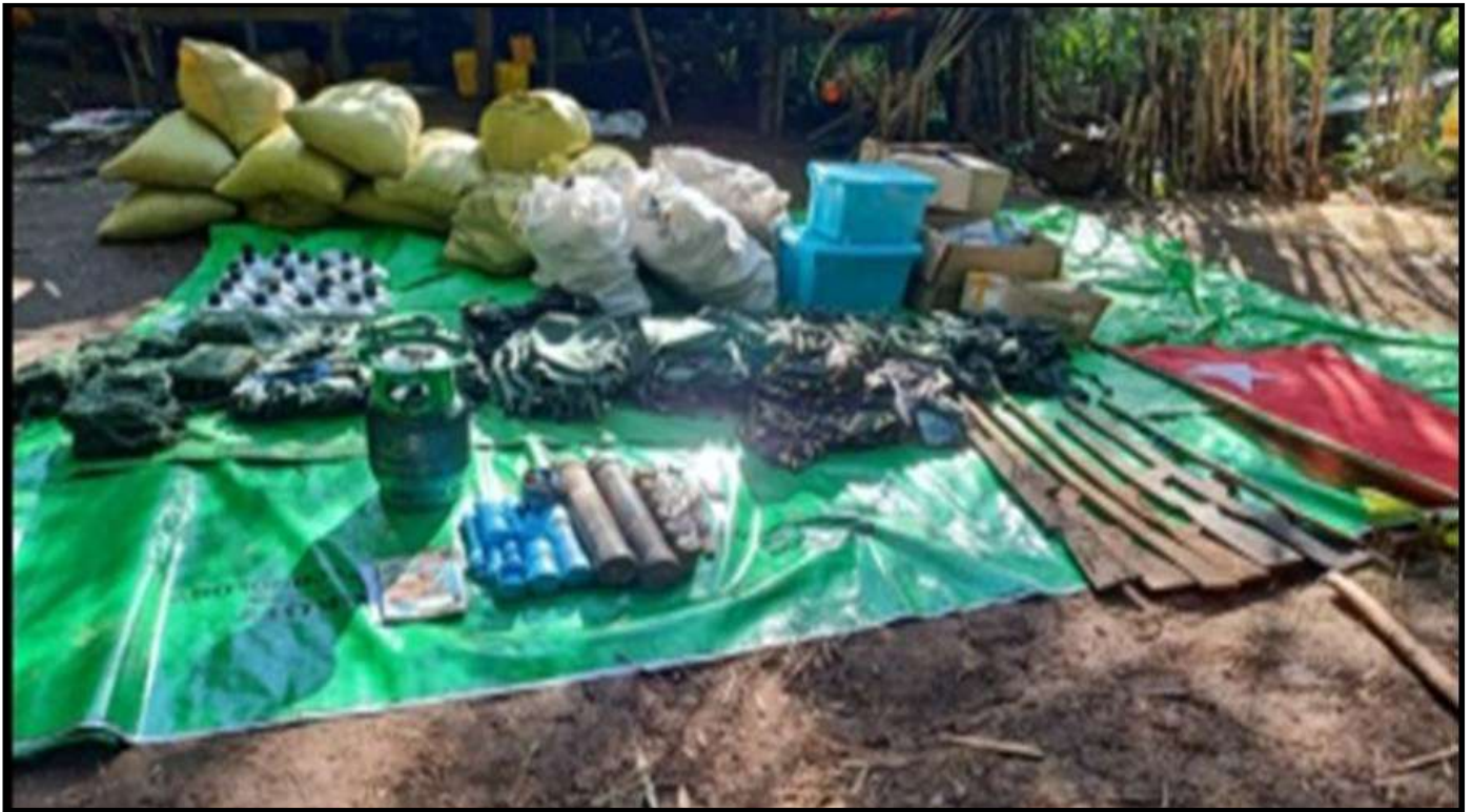
The seizures of items at Oattwin terrorist PDF camp in KNLA Brigade (2) area