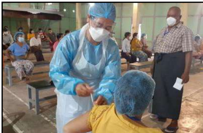
COVID-19 vaccination processes for second dose in Myittar township