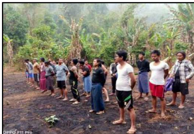
PDF Training course organized in KNLA Brigade (2) Area