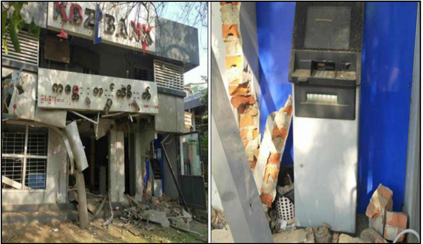
The No (1) KBZ Mini bank in Myingyan township in the aftermath of a homemade mine explosion on 18 April 2021

Terrorist groups of CRPH and NUG with the purposes of utter devastation after organizing PDF terrorists are committing acts of sabotages and terrorism such as murdering the people peacefully residing in some areas for various reasons, setting fire to State-owned buildings, public hospitals, schools, housings, villages and markets, State-owned banks and private banks as well as conducting robberies.