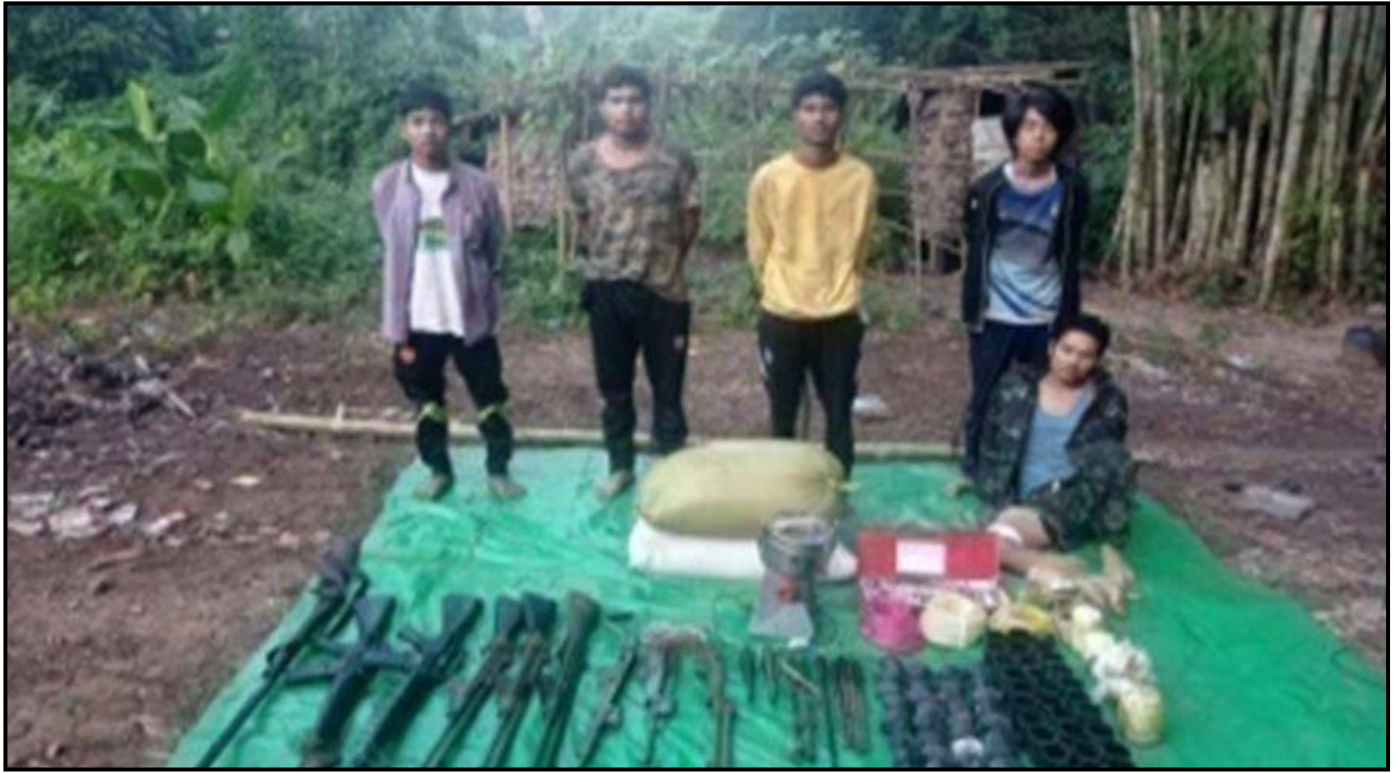
Five terrorists arrested along with weapons/ammunitions from Pyay terrorist PDF camp in KNLA Brigade (2)

and accepted those who are still at large.