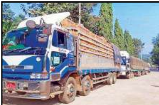
Importing COVID-19 preventive equipment by vehicles through the border trade posts