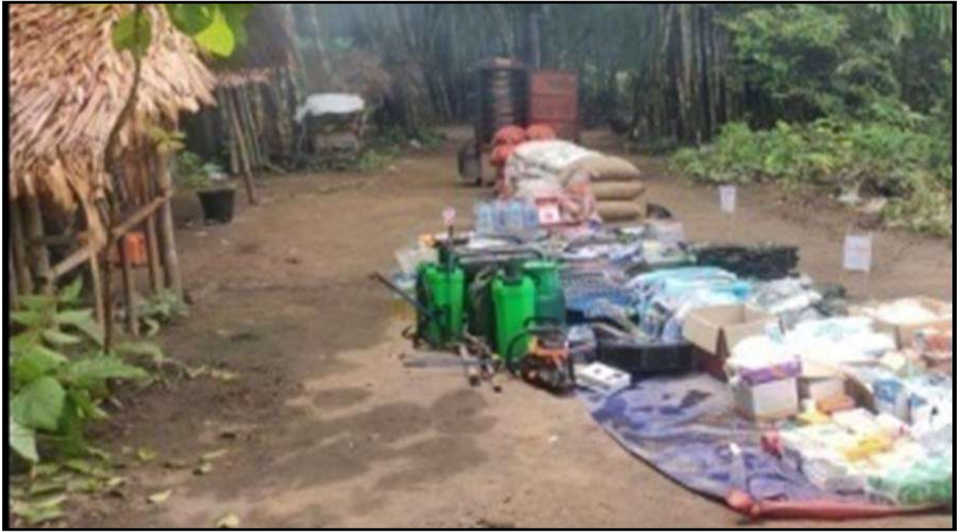
The captured place of explosive training course in KNLA Brigade (1) area

Myothit of Myawady township and Tar-bokhee station (locally called) in the eastern part of Dawna hill, and made the mines in practical sessions.