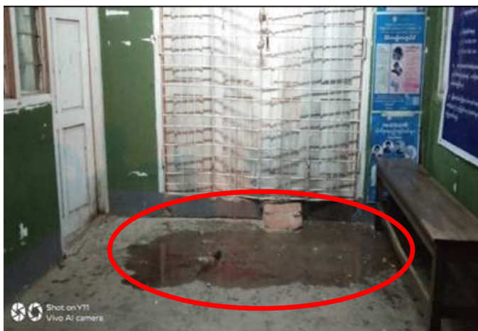
Fire bottle attack on Myanmar Agricultural Development Bank in Lewe township on 5 May 2021