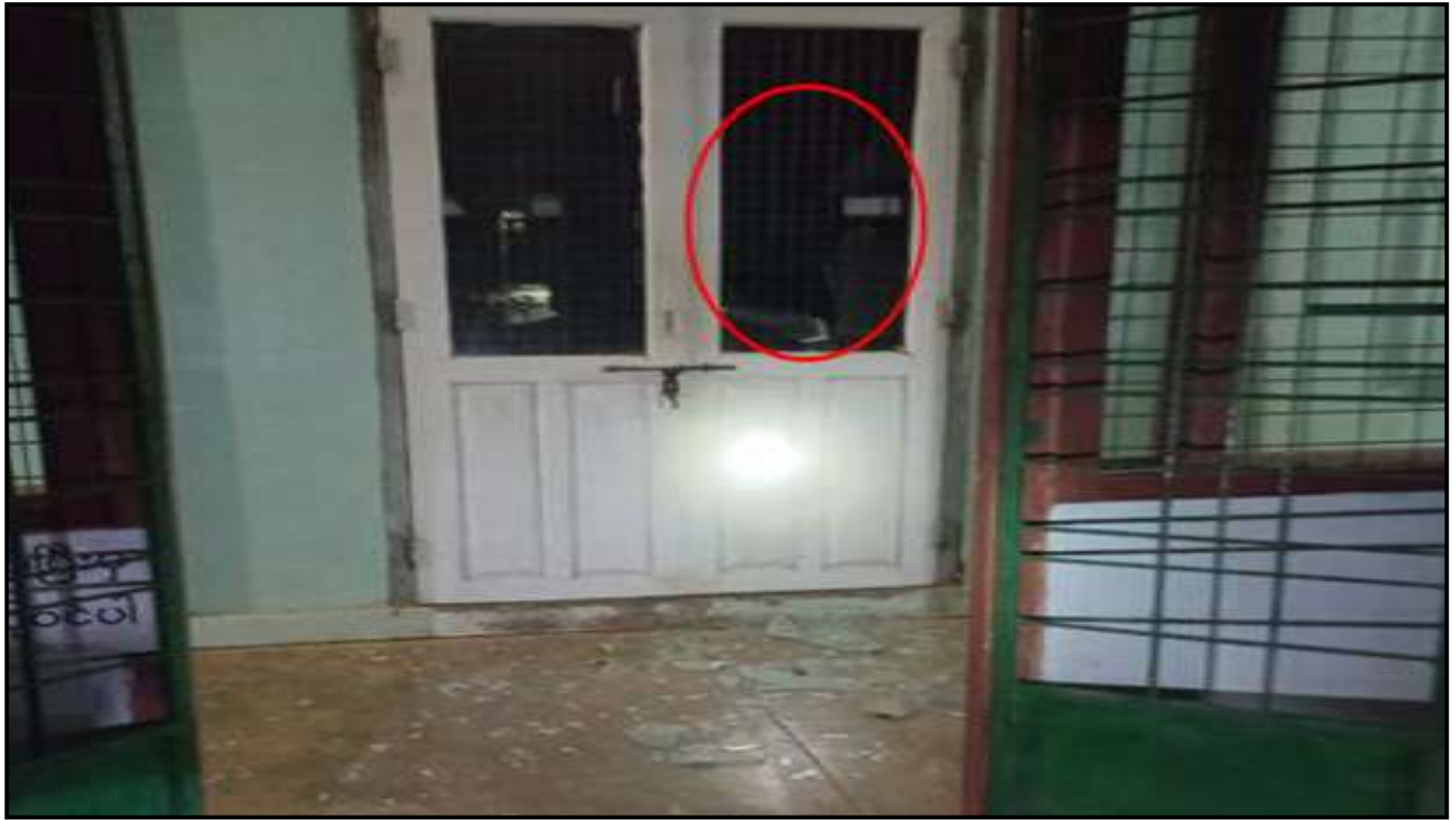
Explosion of a homemade bomb in front of Myanmar Agricultural Development Bank (State Branch) in Hpa-An