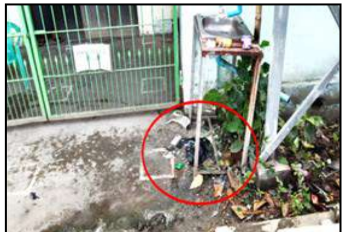
Explosion of homemade mine at Myanmar Agriculture Bank in Khayan township on 7 May 2021