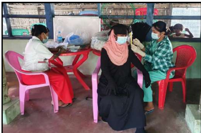
Vaccinating local people against COVID-19 in Maungdaw township of Rakhine state