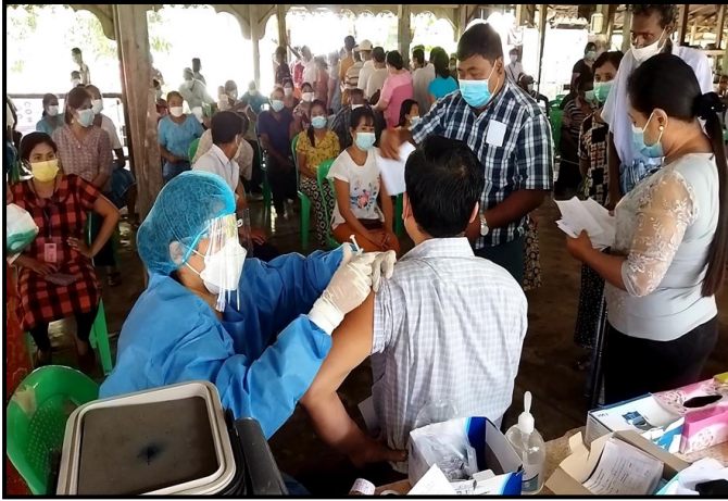
Vaccinating local people against COVID-19 in Mon state