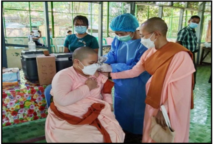
Vaccinating nuns against COVID-19 in North Okkalapa township