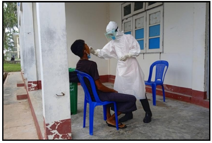
Receiving closed contacts at Nay Pyi Taw Interrogation and Accommodation Centre

respective regions and states. As per the priority programme, a total of 211,453 people have been vaccinated against COVID-19 as second doses and 78,046 people as first doses on 9 November.