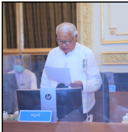
Discussions of the SAC member U Thein Nyunt