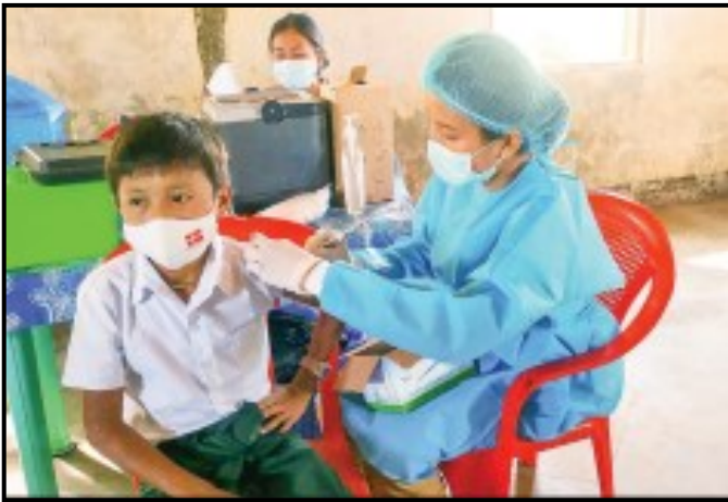
Students vaccinated against COVID-19 in Maung Taw township