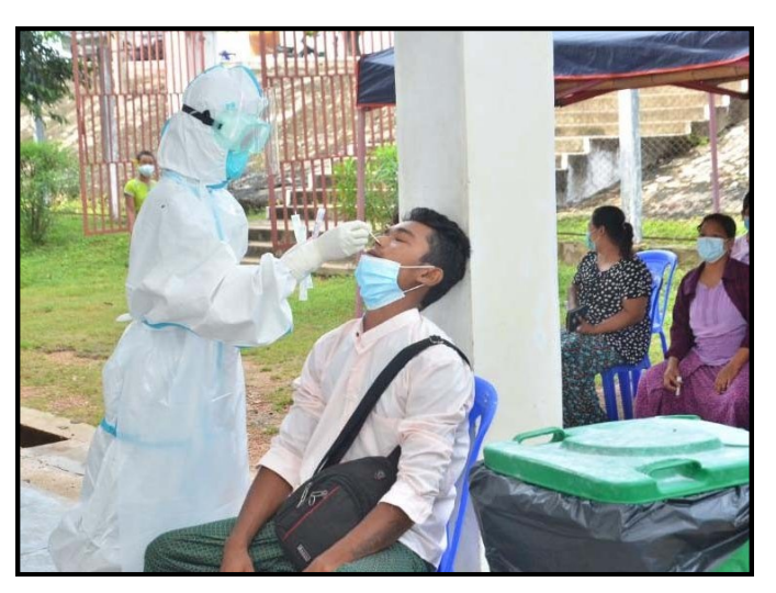
Receiving closed contacts at Nay Pyi Taw Interrogation and Accommodation Centre