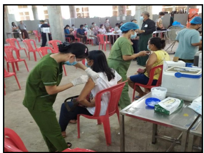
Vaccinating local people against COVID-19 in South Okkalapa township