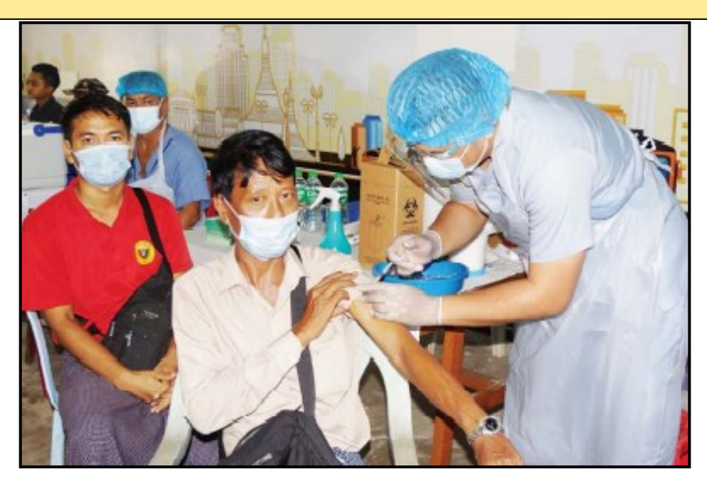
The drivers of YBS bus lines operating in Yangon region being vaccinated against COVID-19 as second dose

Opening quarantine centres and vaccinating people against COVID-19 continue in respective regions and states as the COVID-19 prevention, control and treatment activities.