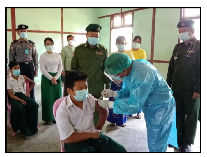
Students aged 12 years and above vaccinated against COVID-19 in Kandi township of Sagaing region