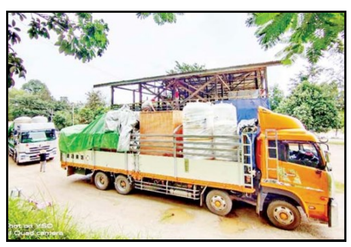
Importing liquid oxygen and medical supplies from abroad