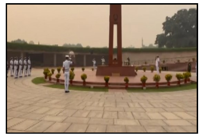
Commander-in-Chief (Navy) Admiral Moe Aung laying wreaths at National War Memorial in New Delhi to pay tributes