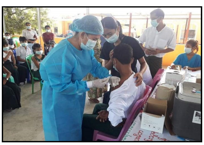
Vaccinating students against COVID-19 in respective townships in Rakhine state