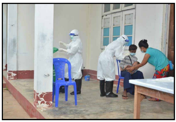
Receiving closed contacts at Nay Pyi Taw Interrogation and Accommodation Centre

COVID-19 were found from testing a total of 25,928 samples and the infected rates are 3.21 percent on 13 November. A total of 512,548 cases were found from testing a total of 5,187,223 samples and death toll reached 18,913 up to 13 November.