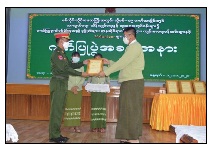
The Commander of North Western Command providing the certificates of hounour and honourable gifts to the staff who actively participated in COVID-19 preventive, control and treatment activities