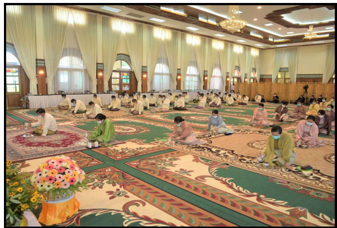
Taking the sermon delivered by Pali Sayadaw and sharing merits