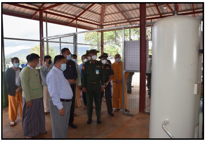
Shan state Chief Minister and the Commander of Eastern Central Command inspecting the oxygen plant in Kyethe township