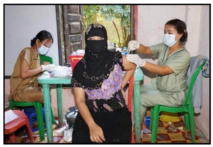
Vaccinating local people against COVID-19 in Sittwe township