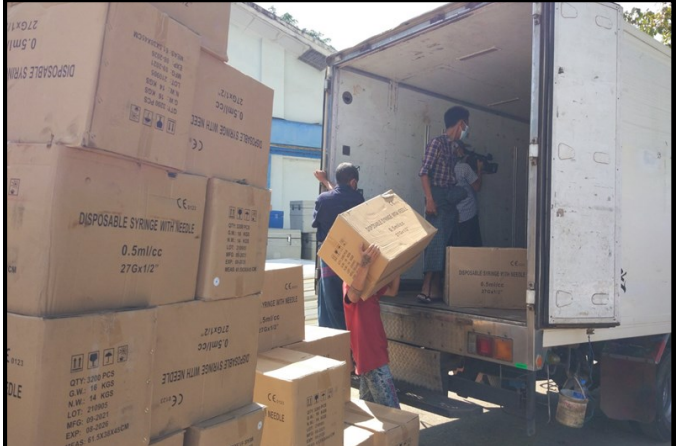
Distributing the Sinovac vaccines stored at the cold chain centre to respective regions and states