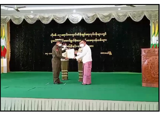
Deputy Commander of Coastal Region Command providing the certificates of hounour and honourable gifts to the staff who actively participated in COVID-19 preventive, control and treatment activities