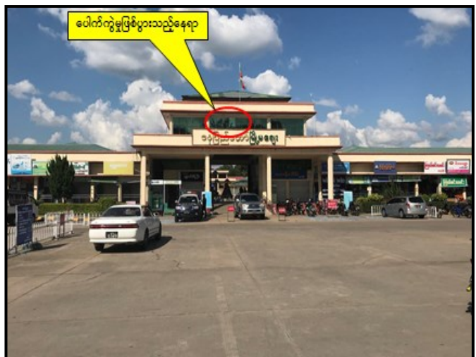
The terrorists throwing a homemade bomb to the office of a municipal market officer located at the second floor of Nay Pyi Taw Myoma market