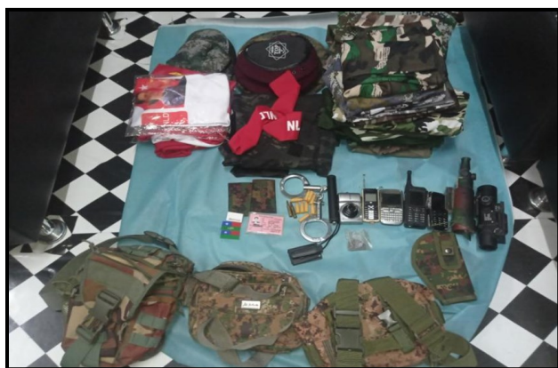
The items confiscated at No. (94) apartment, Kha Yae housing, Pyinnyatheddi ward of Zabuthiri township