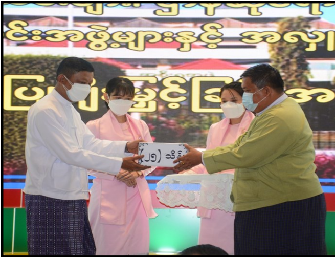
The Commander of Yangon region Command awarding honourable cash to those who participated in COVID-19 prevention, control and treatment activities