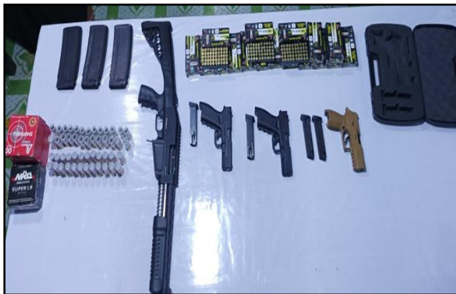
Seizures of weapons/ammunitions