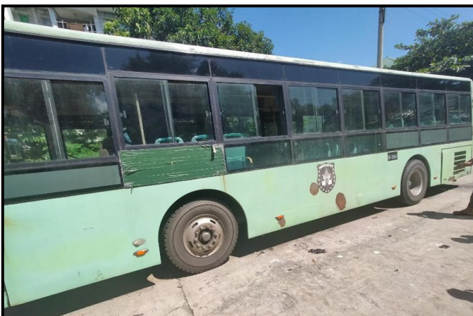
The explosion occurred near the ferry of the Ministry of Immigration and Population stopped near the building No (4356), Thukhatheikdi ward of Zabuthiri township