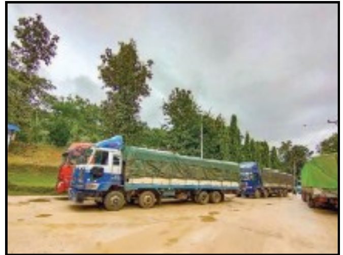
Importing liquid oxygen and medical supplies from abroad