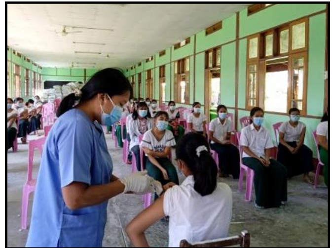
Students vaccinated against COVID-19 in Ingapu township