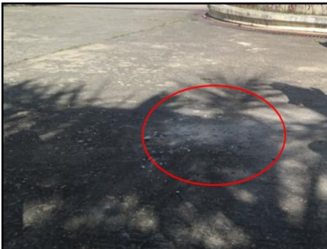
Photo of the homemade bomb explosion in the compound of township electric engineer office, Ottarathiri ward of Ottarathiri township