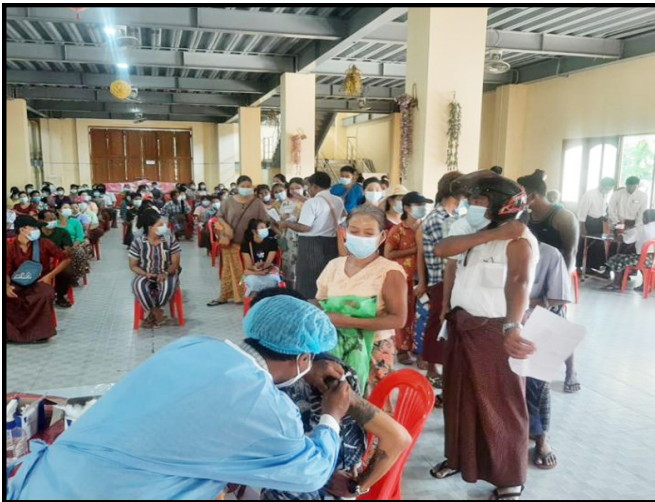
Local people in Thanlyin township vaccinated against COVID-19