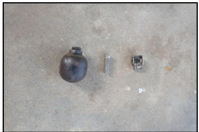
The homemade bomb found at Shwe Nant Thar police outpost in the compound of township administrator office in No (5) area, Shwe Nant Thar ward of Ottarathiri township