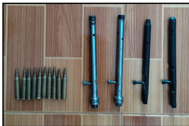
The pen gun confiscated at the house of Tin Ko Nyein (aka) Shwe Kaung near power station located on B-4 road in Ottarathiri township