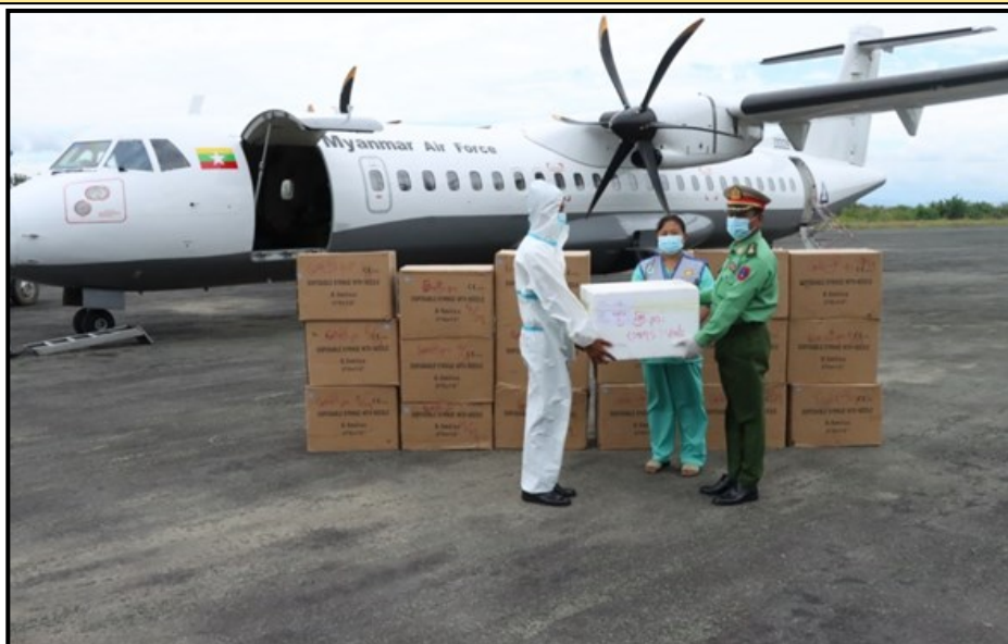
The officials receiving COVID-19 vaccines carried by Tatmadaw aircraft arrived in Myitkyina

COVID-19 prevention, control and treatment activities such as opening quarantine centres and vaccinating people against COVID-19 continue in respective regions and states.