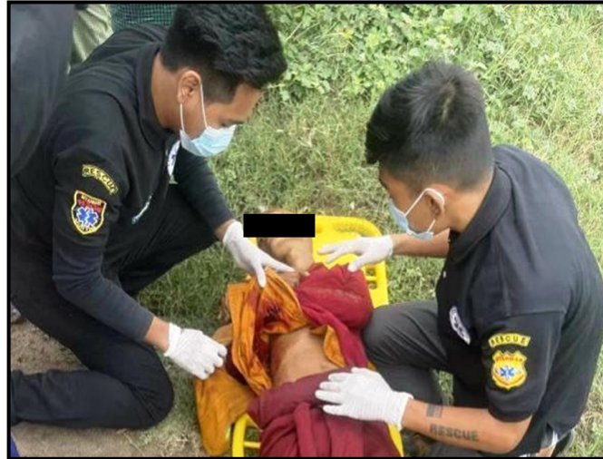
A monk shot to death by terrorists near the Pyidaungsu and Thazi junction in Dawna Ward of Monwya Township