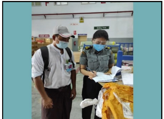
Importing COVID-19 medical supplies from abroad