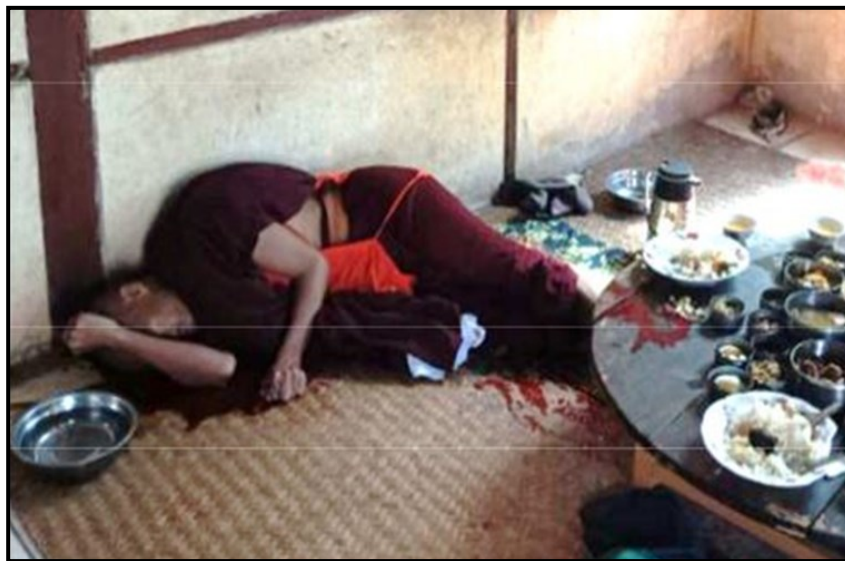
Photo of the deceased Sayadaw U Somana who was killed for no reason by the terrorists in Wundwin township on 11 Nov 2021

The world recognizes Myanmar as the most prosperous country in Theravada Buddhism among the Buddhist countries and majority of the citizens believe in Buddhism and grown up by the teachings of the monks.