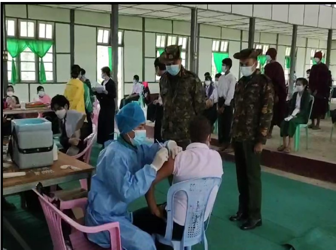
Vaccinating students against COVID-19 in Kun Long and Namsan township