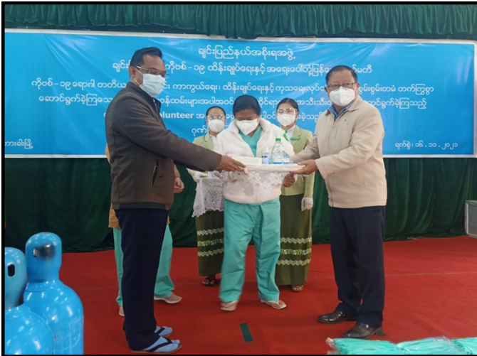
Chief Minister of Chin State providing the COVID-19 preventive and protective equipment to social charity associations