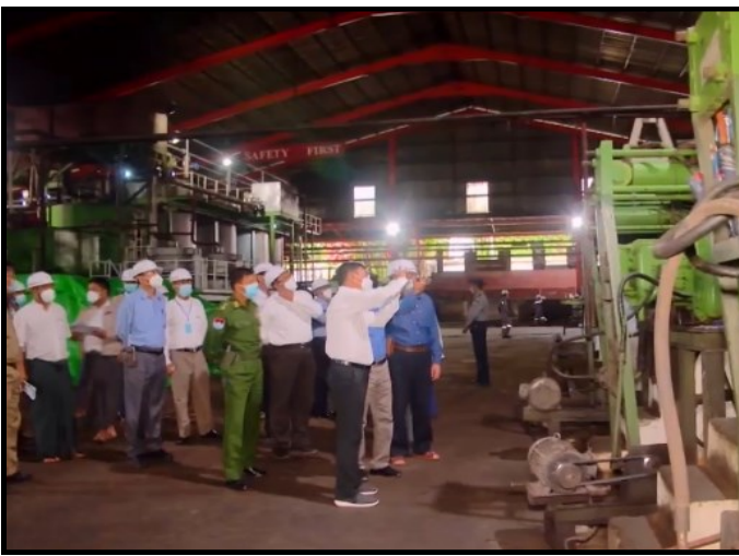
The in-charge of factory explaining to the Chief Minister and responsible officials