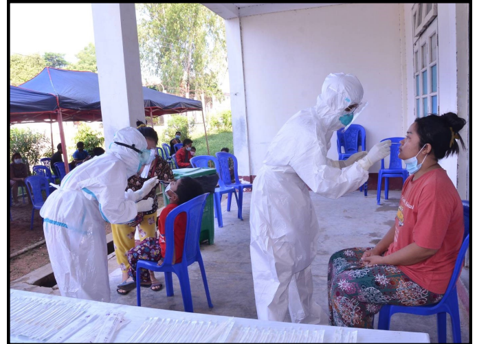
Receiving the people to be quarantined at the Interrogation and Accommodation Centre (Nay Pyi Taw)