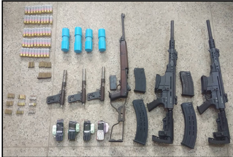
Weapons and ammunitions confiscated near APPOLO Hotel on alal baho street of Mayangone township