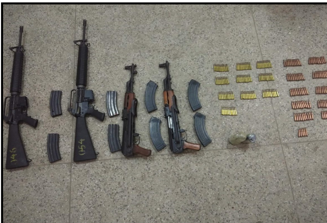
Weapons and ammunitions confiscated at No. (20) house on Bo Min Yaung street in No (3) Yan Pyay ward of Thingangyun township