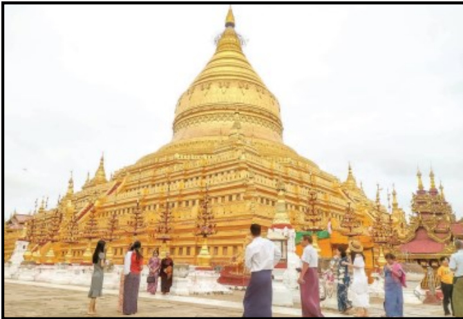
Historic Pagodas in the Bagan-Nyaung U Archeological Zone crowded with pilgrims

Photos of pilgrims from all over the country peacefully worshipping the famous ancient pagodas.