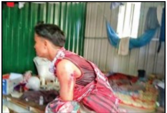
A security force member injured in the shootings of terrorists at security post of Yangon-Thanyin bridge in 10/ south ward of Tharkayta township