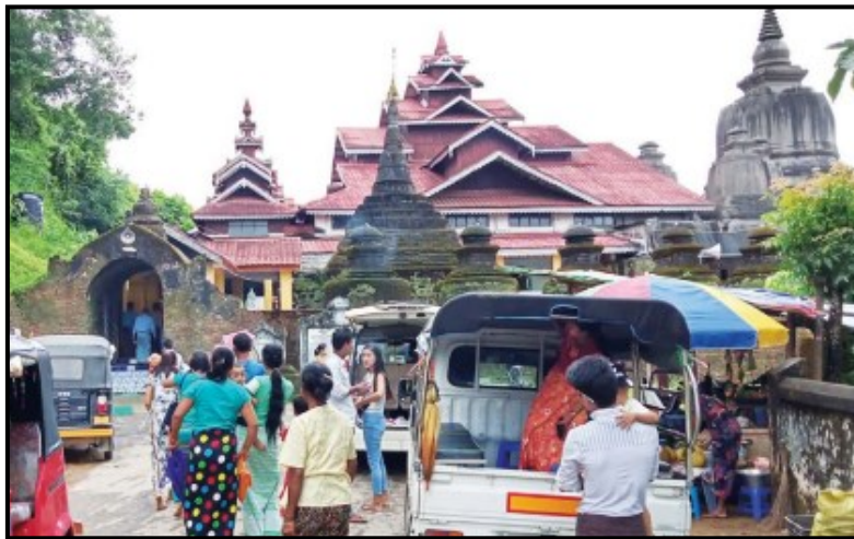
The ancient pagodas in Mrauk-U Township of Rakhine State crowded with pilgrims

During Tazaungdine holidays, the pagodas in every parts of the country including Nay Pyi Taw Council Territory, Yangon and Mandalay cities are thronged with pilgrims. Moreover, pilgrims from all over the country are also peacefully worshipping the famous ancient pagodas.