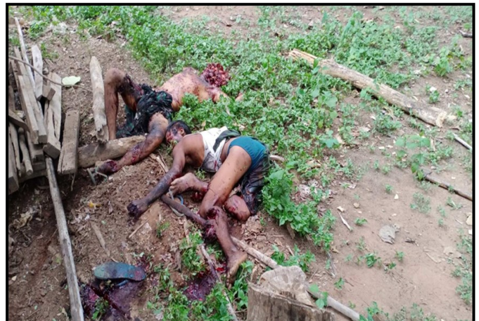
An IED blast which occurred in Post Primary School left Education staff dead in Sangyi village of Nattalin township