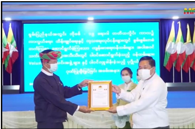
Shan State Chief Minister providing honor of certificates to those who actively participate in COVID-19 prevention, control and treatment activities