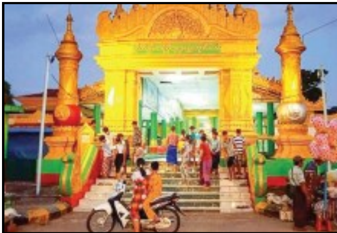
Shinpin Chanthagyi Pagoda at Eainmae township crowded with pilgrims