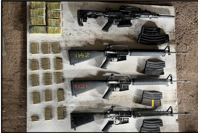
Weapons and ammunitions confiscated in Htun Brother iron construction yard in No (1) Industrial Zone in Dagon Myothit (South) township