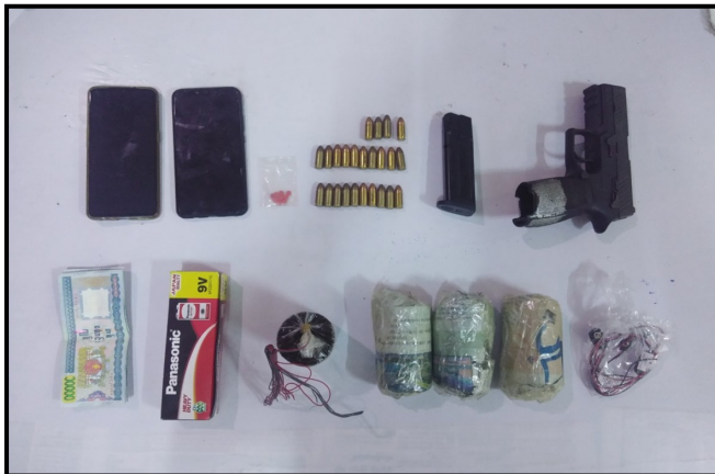
Weapons and ammunitions confiscated at a house on Autha Phaya street, No (33) ward in Dagon Myothit (north) township