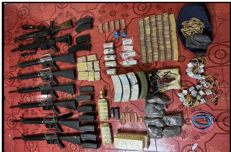
Weapons and ammunitions confiscated at United Condo in Bahan township