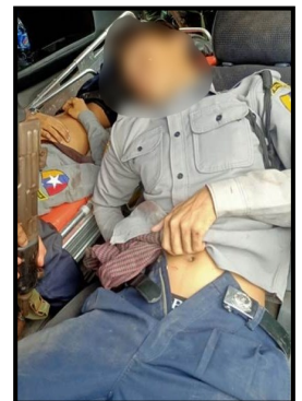
Security force members injured in the shooting of terrorists to the security check-point in Asugyi village of Htantapin township