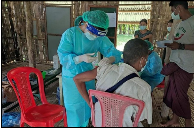
Vaccinating people against COVID-19 at Punna Gyun township of Rakhine State