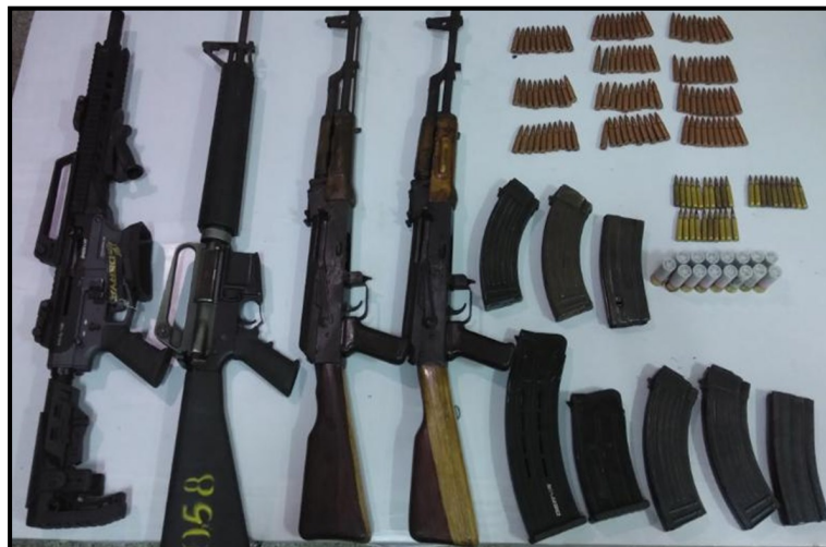
Weapons and ammunitions confiscated near municipal office on Thayattaw street, Zawunna ward of Thingangyun township