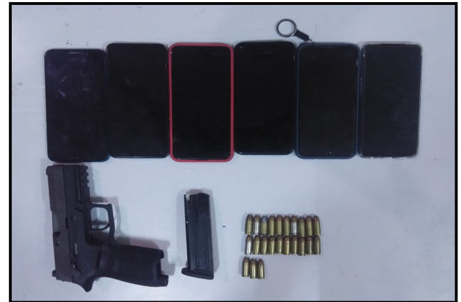
Weapons and ammunitions confiscated at 3rd floor of No (803) building on Kyaw Thu street in No (9) ward of South Okkalapa township