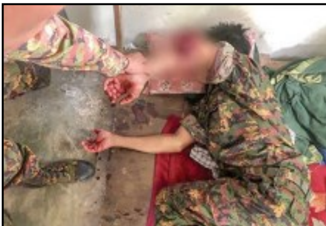
A security force member injured in the shootings of terrorists at Kyaw Thu bridge on Khay Mar Thi street, (e) ward of North Okkalapa township