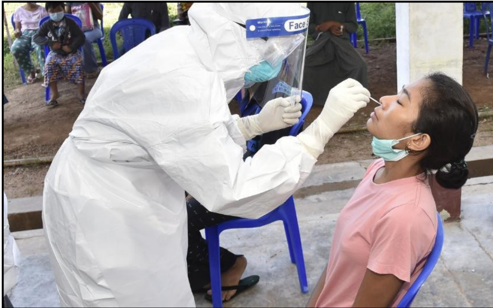
Taking lab test samples from close contacts at Nay Pyi Taw Interrogation and Accommodation Centre

COVID-19 prevention, control and treatment activities such as opening quarantine centres and vaccinating people against COVID-19 continue in respective regions and states.