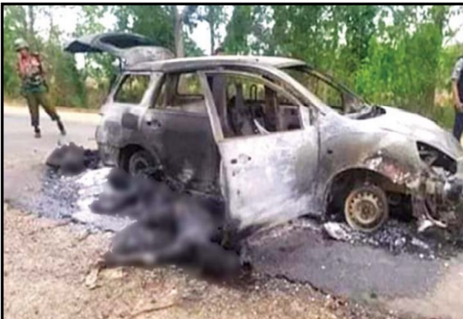
Education staff burnt to death by terrorists in Ganggaw township