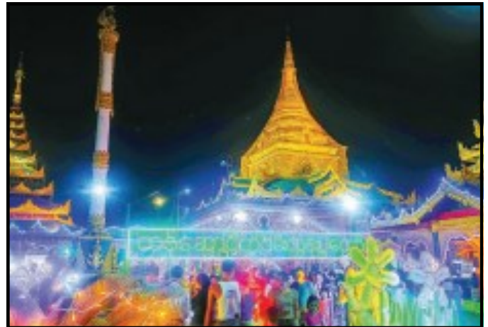
Zalun Pyitawpyan Pagoda at Zalun township crowded with pilgrims