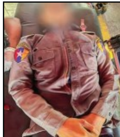
The security force members injured in the shootouts which occurred at the Berkayar traffic light office located at the corner of Berkayar street and Ahtet Kyi Myin Dine street in Bawga ward of Kyimyindine township