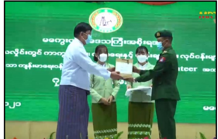
Magway region Chief Minister providing honor of certificates to those who actively participate in COVID-19 prevention, control and treatment activities