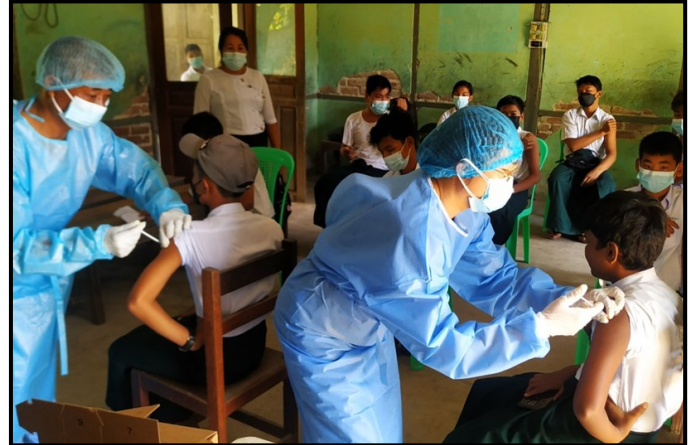
Vaccinating student against COVID-19 at Taungoo township