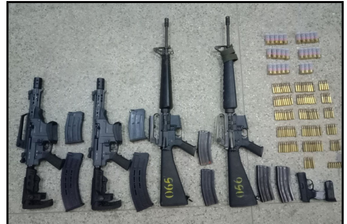
Weapons and ammunitions confiscated at 4th floor of No (291, A/B) building on Thamain Bayan street in Kyi Pwar Yay ward of Thingan Gyun township