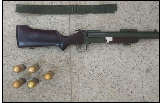
Weapons and ammunitions confiscated near City Mart on Sayar San road of Thingangyun township