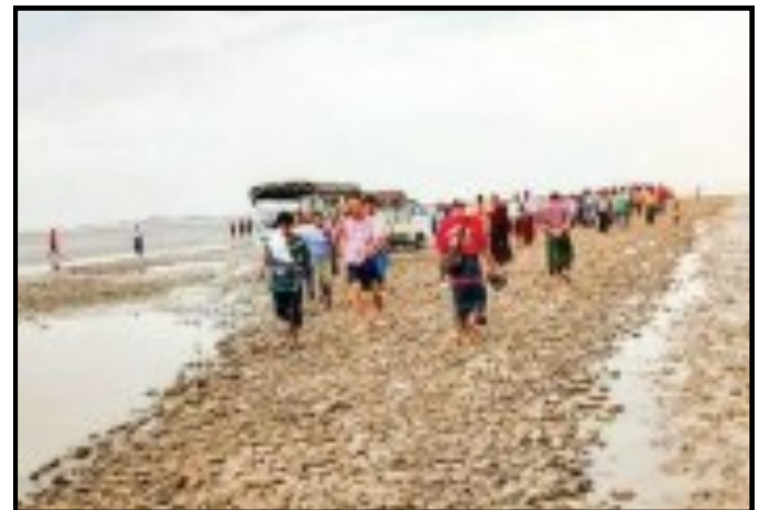
Kyeik Nae Yae Lal Pagoda at Thanphyu Zayat township crowded with pilgrims