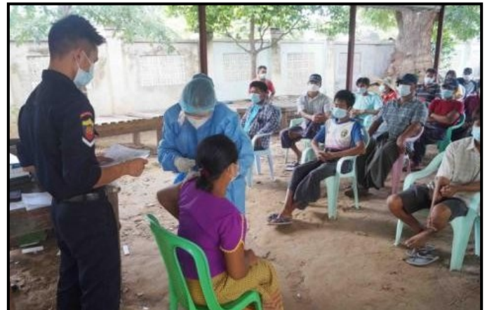
Vaccinating people against COVID-19 in respective regions and states