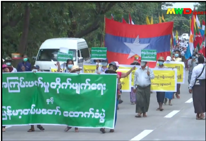
Mayangone township, Yangon region