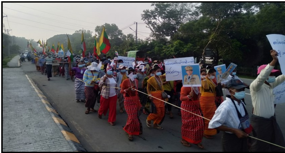
Local ethnic people in Sittwe township supporting the activities of the State Administration Council

Mass rallies (a total of about 13,450 people) gathered in five townships on 1 November to show support to the activities of the State Administration Council which assumed the State's responsibilities in accordance with the 2008 Constitution. The townships are Mayangone township of Yangon region, and Yegyí township of Ayeyarwady region, Thabeikkyin township of Mandalay region and Thegon township of Bago region.