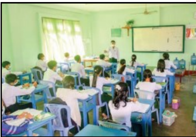
Nay Pyi Taw Council Territory