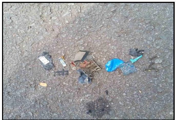
The explosion of homemade bomb beside the road in front of the fence of No (1) Basic Education School located on Bargaya road in Bawgaw ward of Kyimyindine township