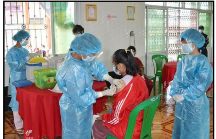
Students aged 12 years and above vaccinated against COVID-19 in respective regions and states