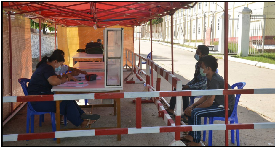
Receiving closed contacts at Nay Pyi Taw Interrogation and Accommodation Centre

In every state and region of Myanmar, Tatmadaw and departmental officials are accelerating the COVID-19 prevention, control and treatment activities such as opening quarantine centres, vaccinating people against COVID-19 and conducting measures to reopen cinemas as per COVID-19 guidelines.