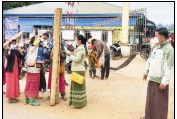
Public awareness activities to wear masks in Mongye township