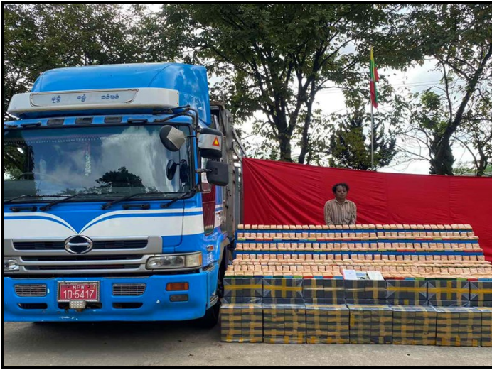
The offender arrested along with heroin worth K0.594 billion in Naungcho township