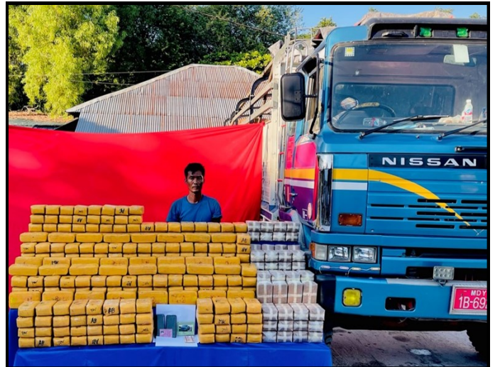
The offender arrested along with stimulant tablets worth K4.14 billion in Kyaukse township