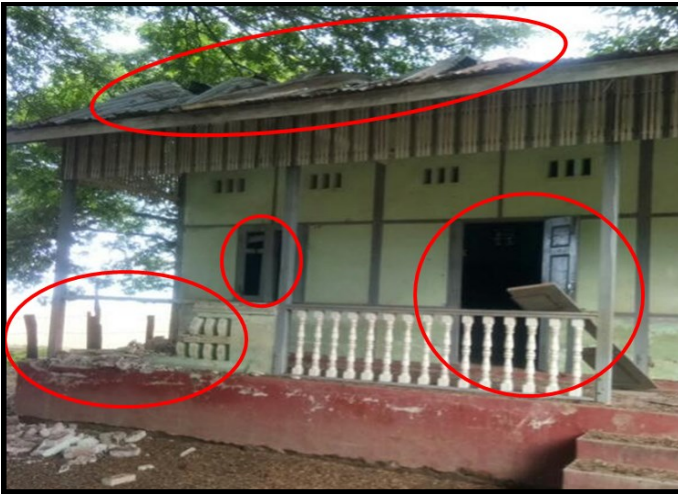
The terrorist armed organizations exploded homemade mine to school in Singu township