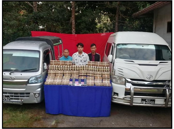
The offenders arrested along with stimulant tablets worth K0.495 billion in Ywarngan township