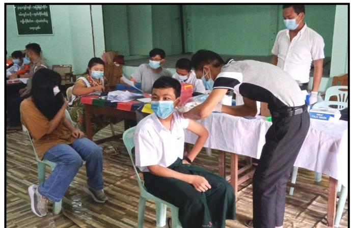
Students aged 12 years and above vaccinated against COVID-19 in Tamwe township