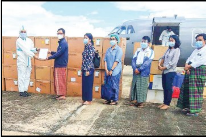
The vaccines handing over to the officials in Keng Tung Airport