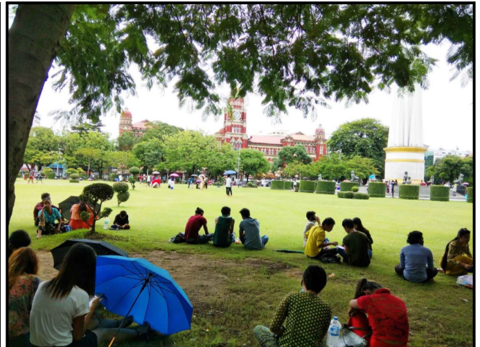
People taking relaxation in Maha Bandoola park on Deepavali day

The government temporarily shut down 62 parks and playgrounds in Yangon municipal area in order to effectively conduct COVID-19 preventive measures. Currently, the disease reaches under control to a certain extent and so the recreational areas are now reopened. Therefore, the people thronged on the parks and playgrounds including Maha Bandoola Park in Yangon on the public holiday of Deepavali Day.