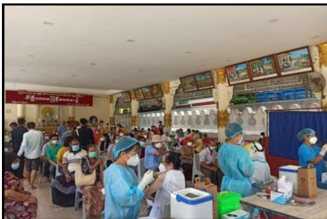
Local ethnic people vaccinated against COVID-19 in Mongset township