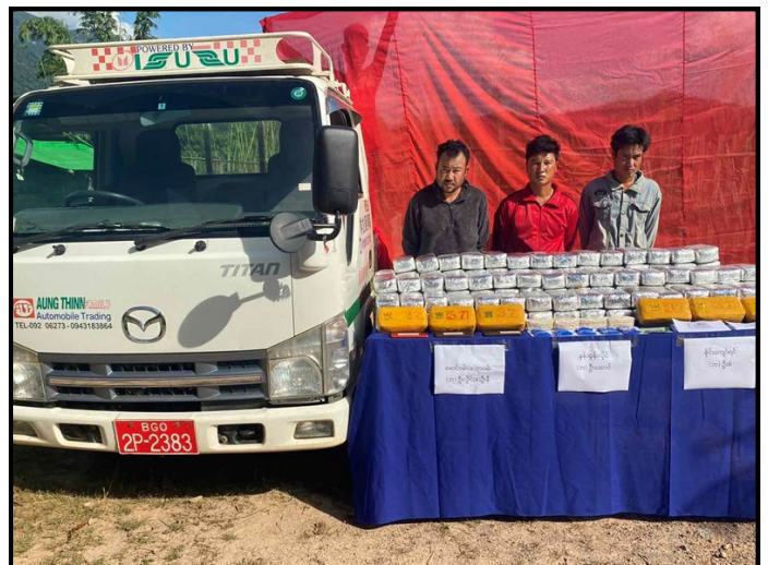
The offenders arrested along with stimulant tablets worth K0.725 billion in Pinlaung township