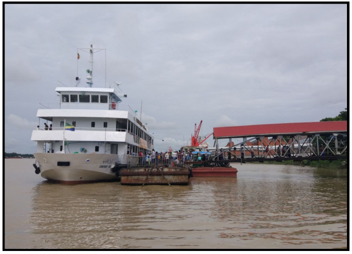
Highway buses and ferry boats operating as usual to facilitate public transportation