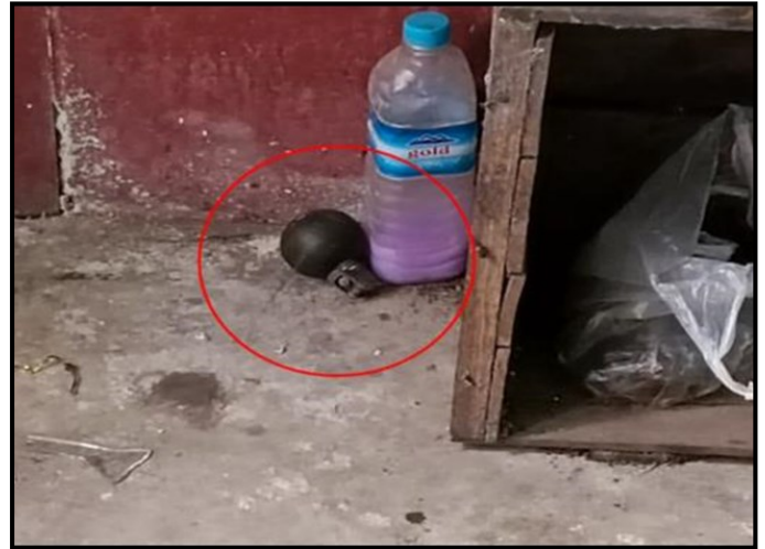
An unexploded homemade bomb in Tamu township in Sagaing region