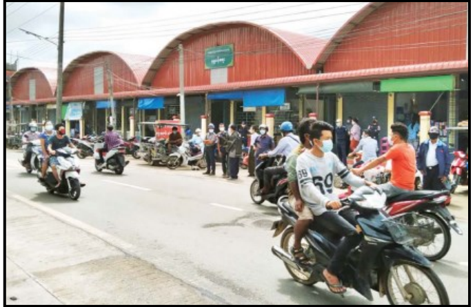
The people who do not wear masks being taken action in Kawthoung township