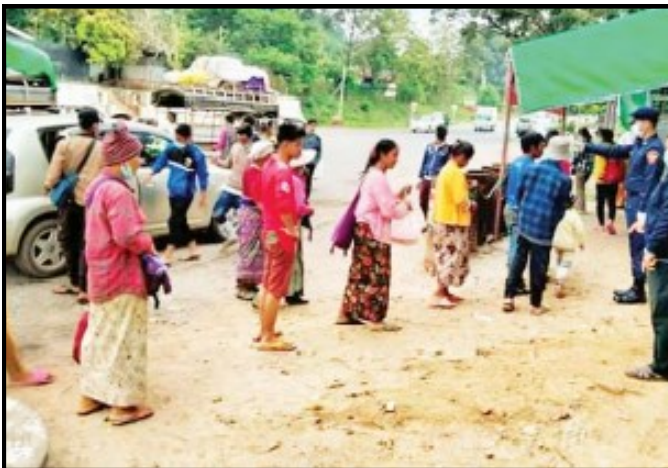
The COVID-19 checkpoint opening at the entrance of Hsipaw township