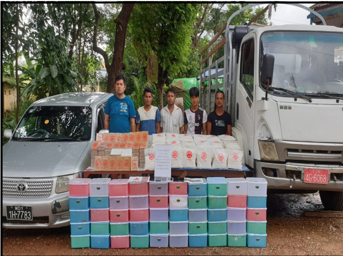
The offenders arrested along with heroin worth K5.278 billion in Kyaikhto township