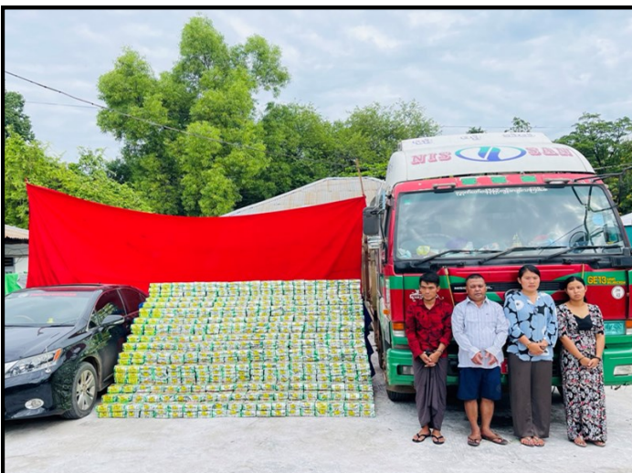
The offenders arrested along with ICE (crystal meth) worth K12.9 billion in Ywarngan township