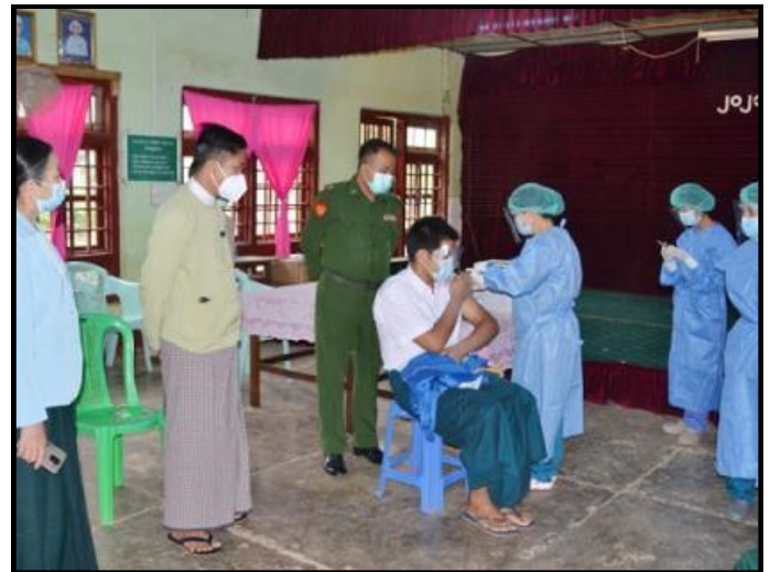
Students aged 12 years and above vaccinated against COVID-19 in Tangyang township