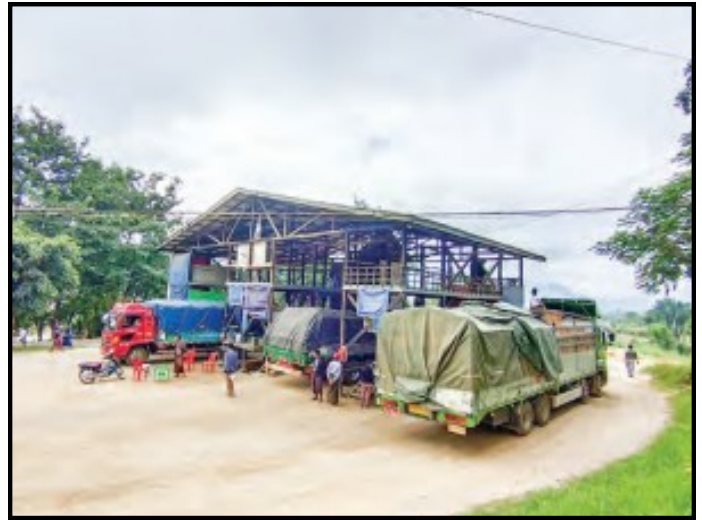
Importing oxygen and medical supplies through the border trade posts