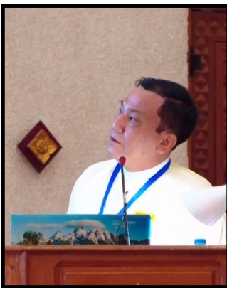
Discussions of U Htay Kyaw from People's Democratic Party