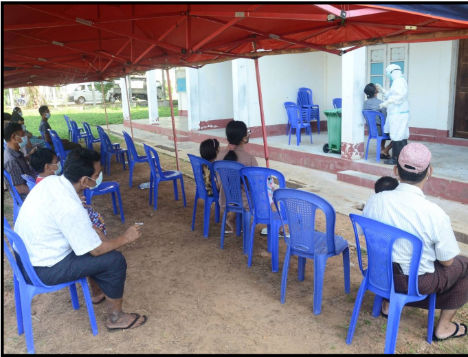
Receiving closed contacts at Nay Pyi Taw Interrogation and Accommodation Centre