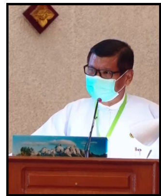
Discussions of U Hla Thein from Union Solidarity and Development Party