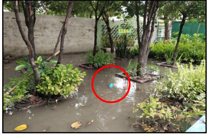
A homemade bomb found in the compound of Basic Education School in Chanmyathazi township