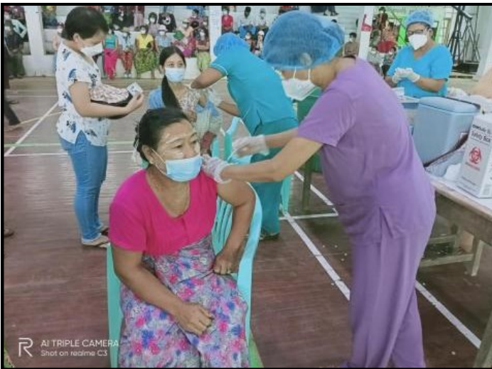
Local people in Daik-U township vaccinated against COVID-19