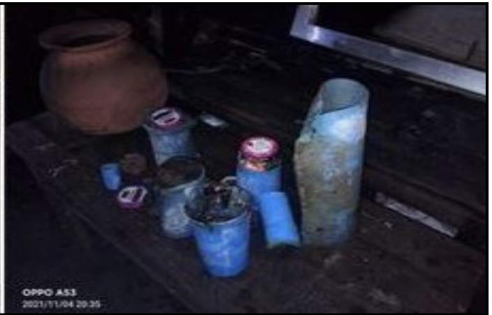
Terrorists planted mines to Basic Education High School (Yway) in Kangyidaunt township