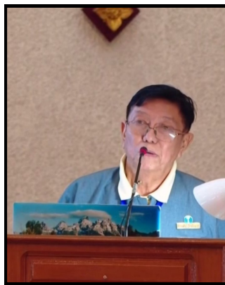
Discussions of U Myo Nyunt from Democracy and Peace Party