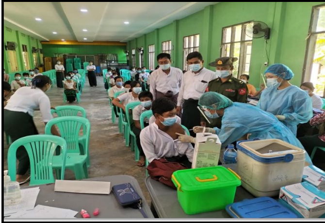
Students vaccinated against COVID-19 in Kangyidaunt township