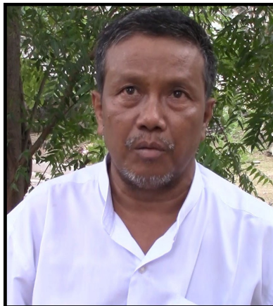
U Tin Soe