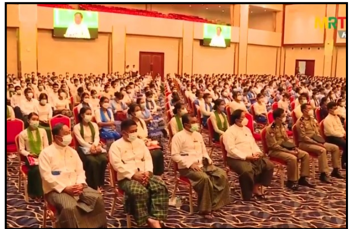
Providing cash assistance to the education staff who will begin serving at Universities, Colleges and Basic Education Schools

Events of welcoming education staff who will begin serving at universities, colleges and basic education schools were held in Nay Pyi Taw Council Territory, Mandalay region and Tanintharyi region on 6 November.