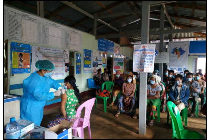
Vaccination processes in Mong Shu township