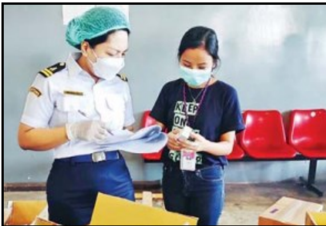
Importing liquid oxygen and medical supplies from abroad