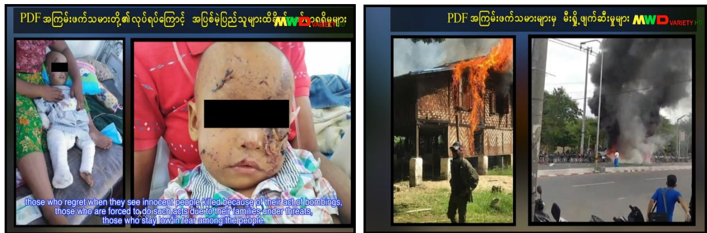
Photos showing the terror acts of PDF terrorists