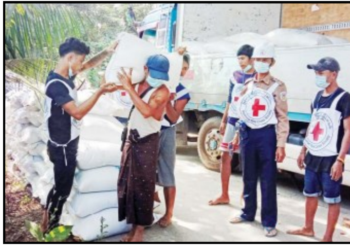
Myanmar Red Cross Society supporting rice bags donated by WFP to local people in Shwepyithar township