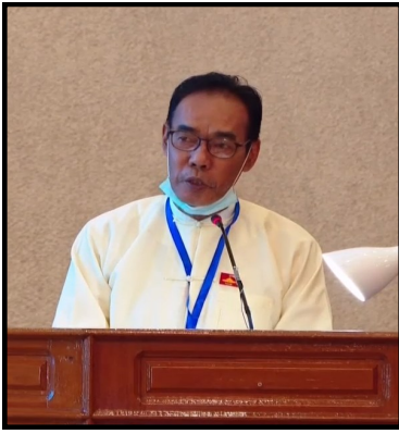
The discussion of U Aung Zin from National Democratic Force (NDF)