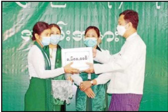
Providing cash assistance to teachers who are newly assigned in Nay Pyi Taw Council Territory