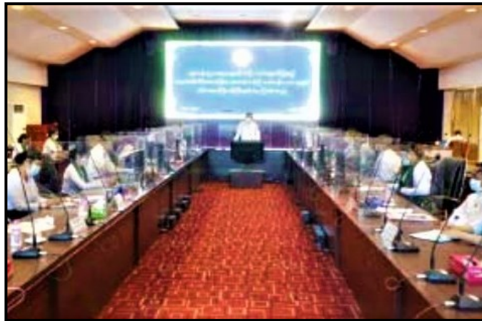
Providing cash assistance to teachers who are newly assigned in Tanintharyi region