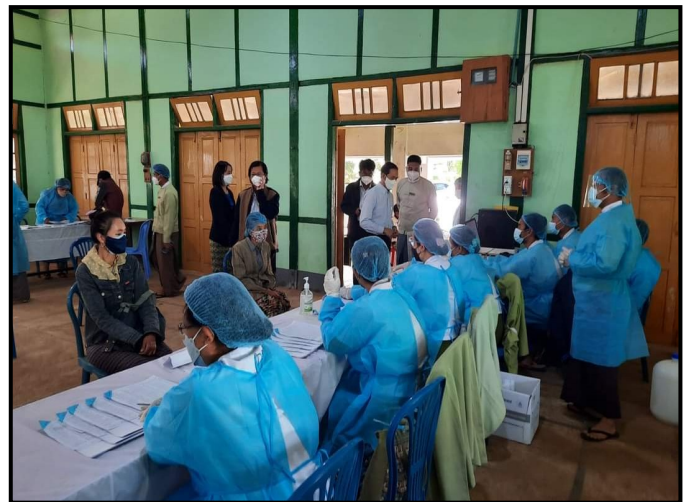
Deputy minister and party made a field trip to Shan state