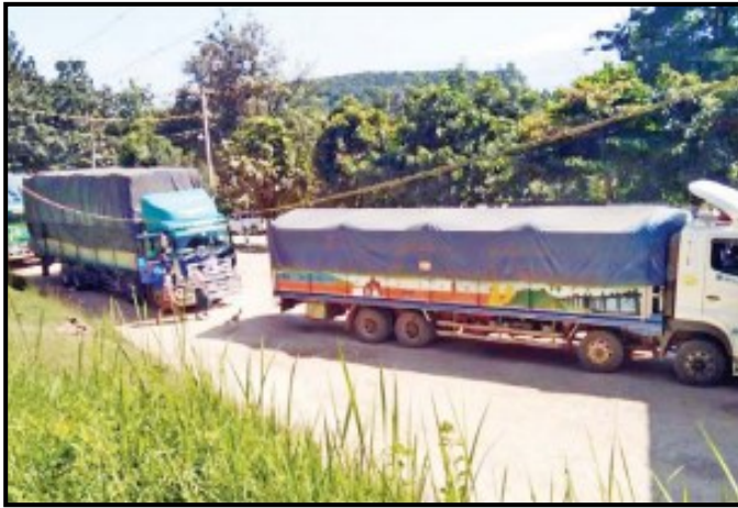
Importing liquid oxygen and medical supplies from abroad