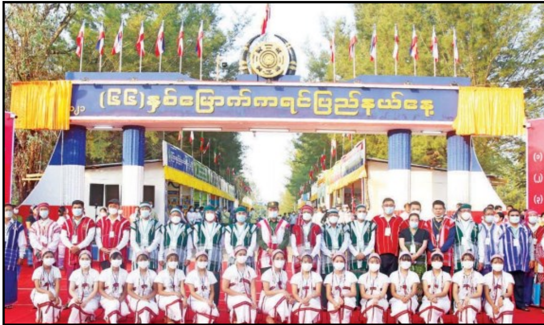
Commemorative photo of the persons who attended the 66 th Anniversary of Kayin State Day