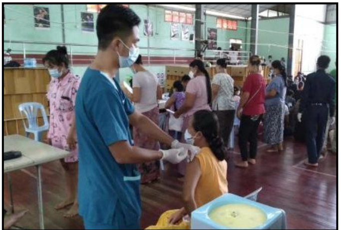
Vaccination processes in Kawthoung township