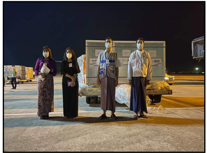
Arrival of Sinopharm COVID-19 vaccines purchased from the People's Republic of China in Yangon International Airport

Of 24 million doses of Sinopharm COVID-19 vaccines purchased from the People's Republic of China, the last 4 million doses (sixth batch) arrived at the Yangon International Airport on 7 November.