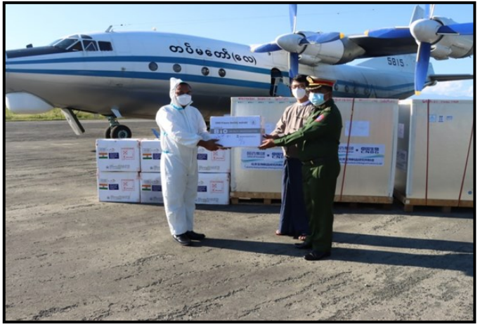
The officials receiving the COVID-19 vaccines arrived in Myitkyina by military aircraft