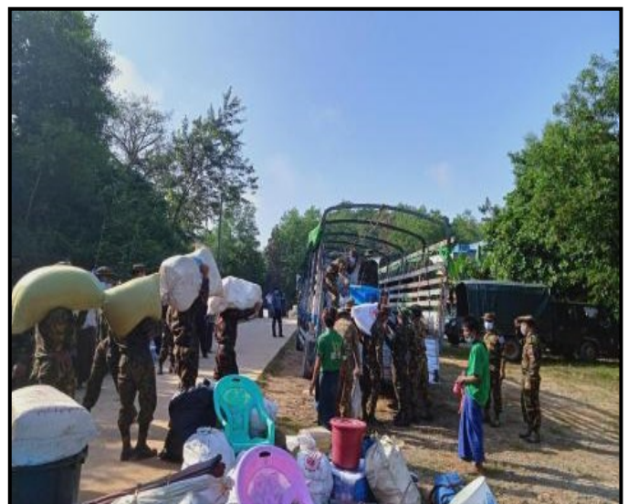
The military personnel transporting IDPs who will return home to their respective homes with vehicles