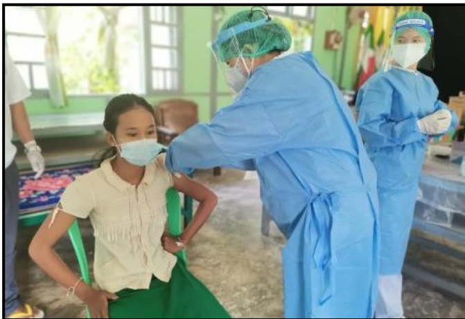
Students vaccinated against COVID-19 in Hopan township