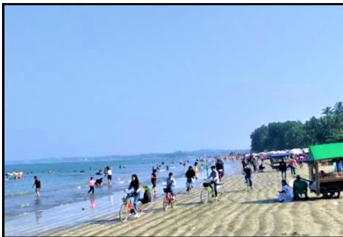
Chaung Tha beach