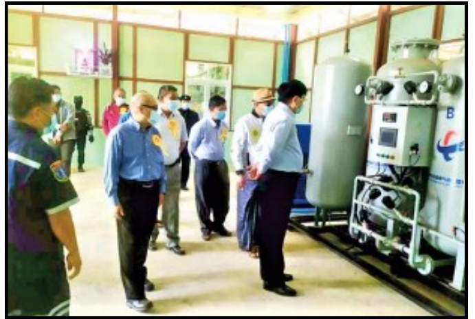
The officials inspecting the operation of new oxygen plant in Pwintphyu township