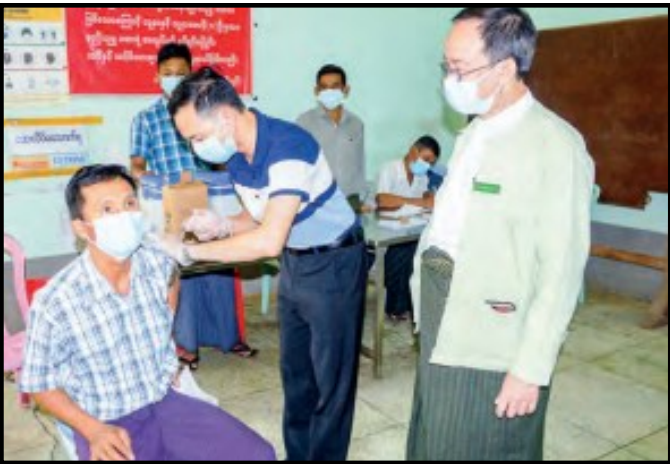
COVID-19 vaccination processes in Tamwe township