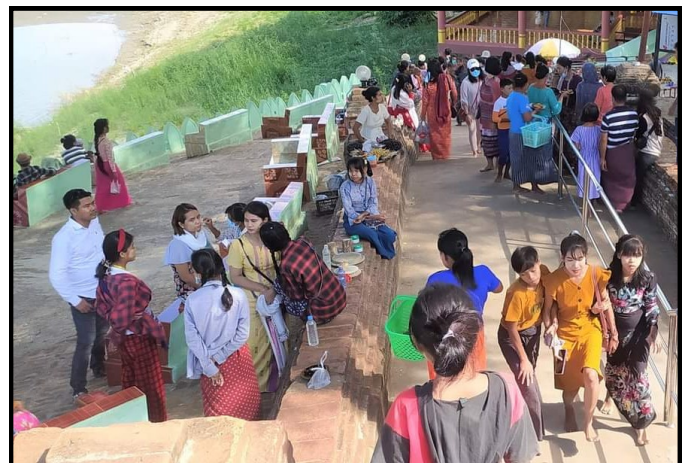
Bagan-NyaungU ancient cultural zone