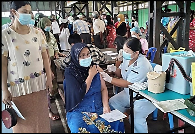
Vaccinating people against COVID-19 in Myeik township