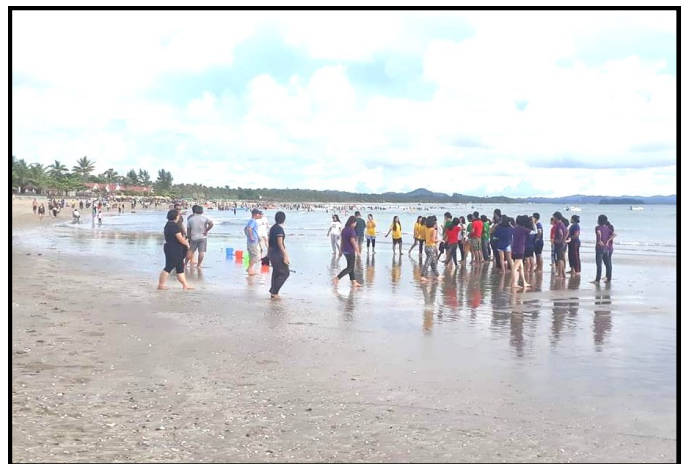
Ngwe Saung beach