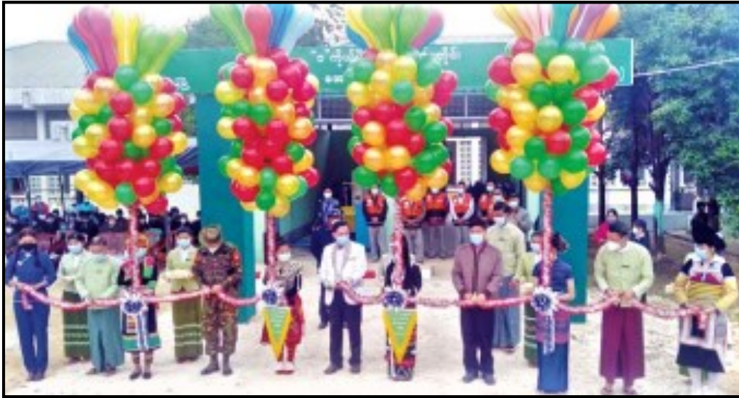
The opening ceremony of new oxygen plant in Hopang township of “Wa” Self-Administered Division

produce 40 oxygen cylinders (40 litres) per day.