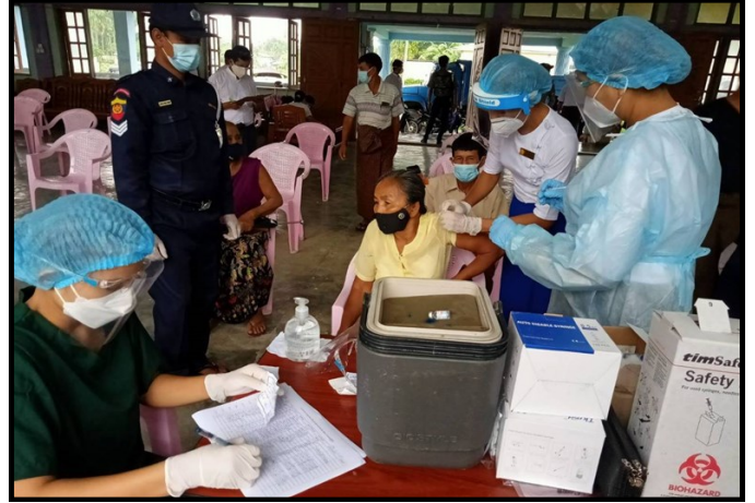
Vaccinating people against COVID-19 in respective townships of Rakhine state