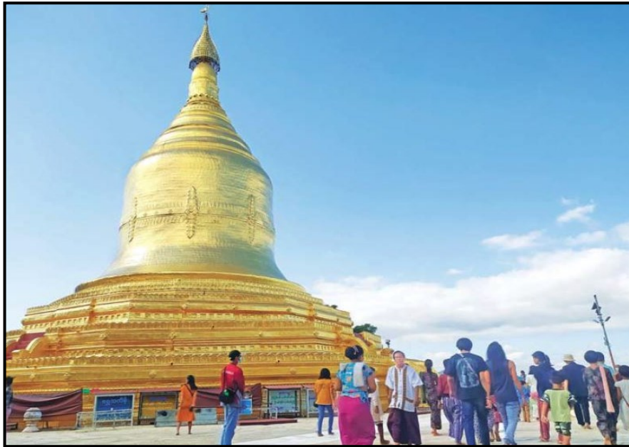
Bagan-Nyaung Oo ancient cultural zone thronging with local travelers during the Christmas holidays in December

historical pagodas, temples and religious buildings in Bagan-NyaungU ancient cultural zone during the Christmas holidays.