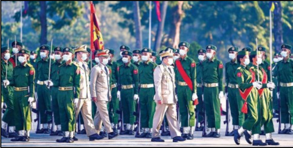
The Chairman of the State Administration Council Commander-in-Chief of Defence Services Senior General Maha Thray Sithu Min Aung Hlaing inspecting the graduate trainee companies

unity of the Tatmadaw could be put to test.