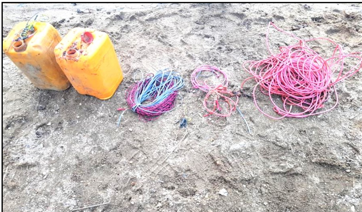
Homemade mines found under Kawnwe bridge in Kawkareik township

On 24 December, two IEDs were found under Kawnwe bridge near Kawnwe village located on the Kawkareik-Myawady Asian Highway and safely deactivated in time.