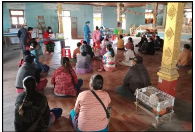
COVID-19 vaccination process in Maukmai township