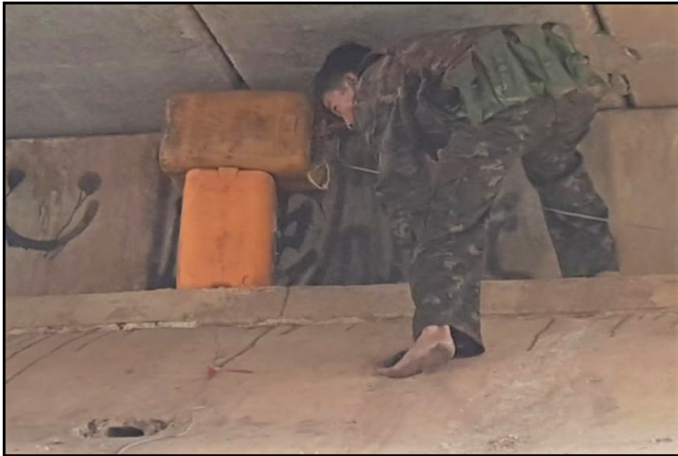
A security force member deactivating the IEDs found under the Kawnwe bridge Kawkareik township

pills filled with highly-explosive TNT were not deactivated in time, the explosions of the IED would have completely destroyed the Kawnwe bridge causing the breakdown to the primary transportation of Kawkareik-Myawady Asian Highway.