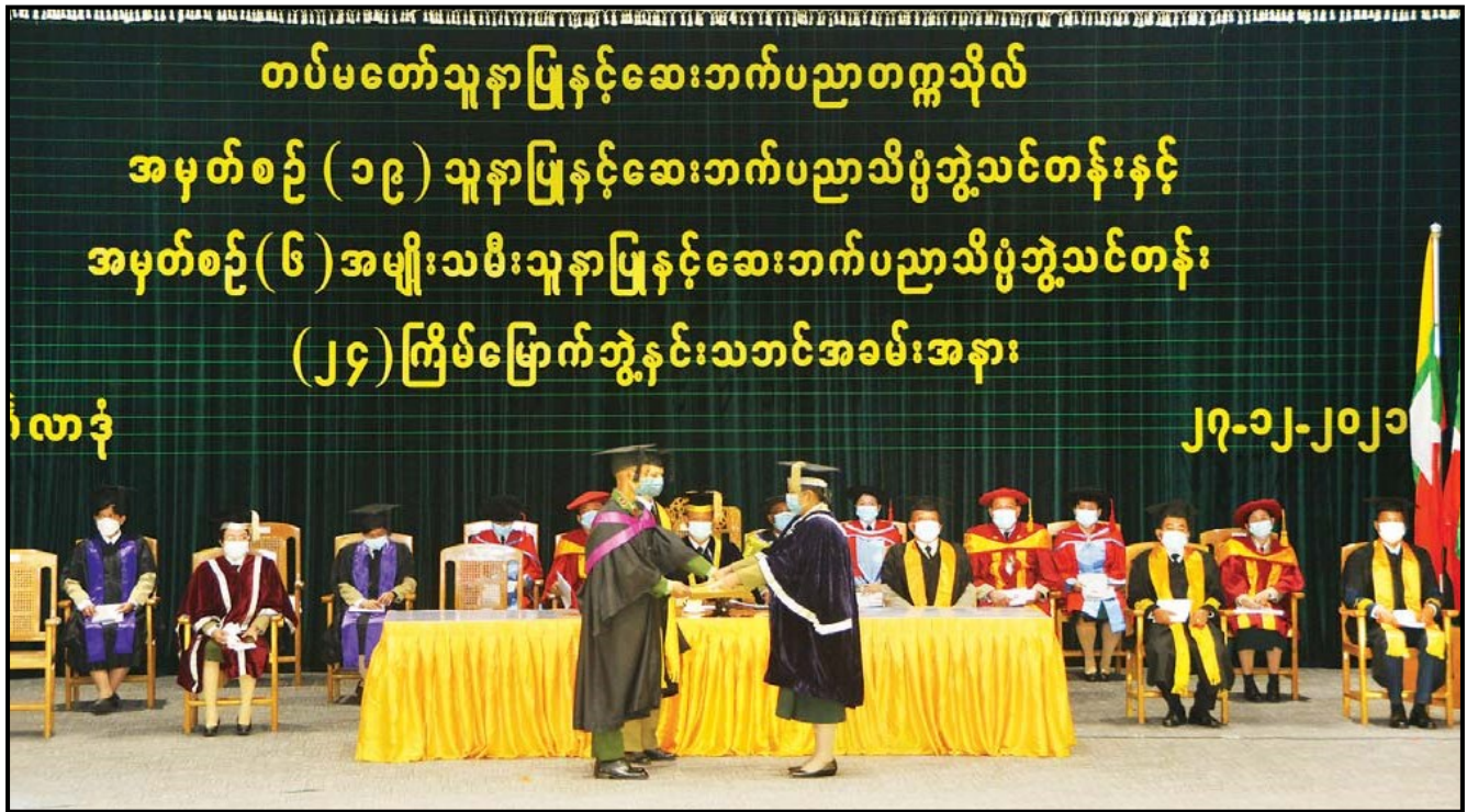
Holding 24 th convocation ceremony of Military Institute of Nursing and Paramedical Sciences

ence were sent to La Trobe University in Australia. In addition, six students were graduated from Ching Mai University and Mahidol University in Thailand, and two