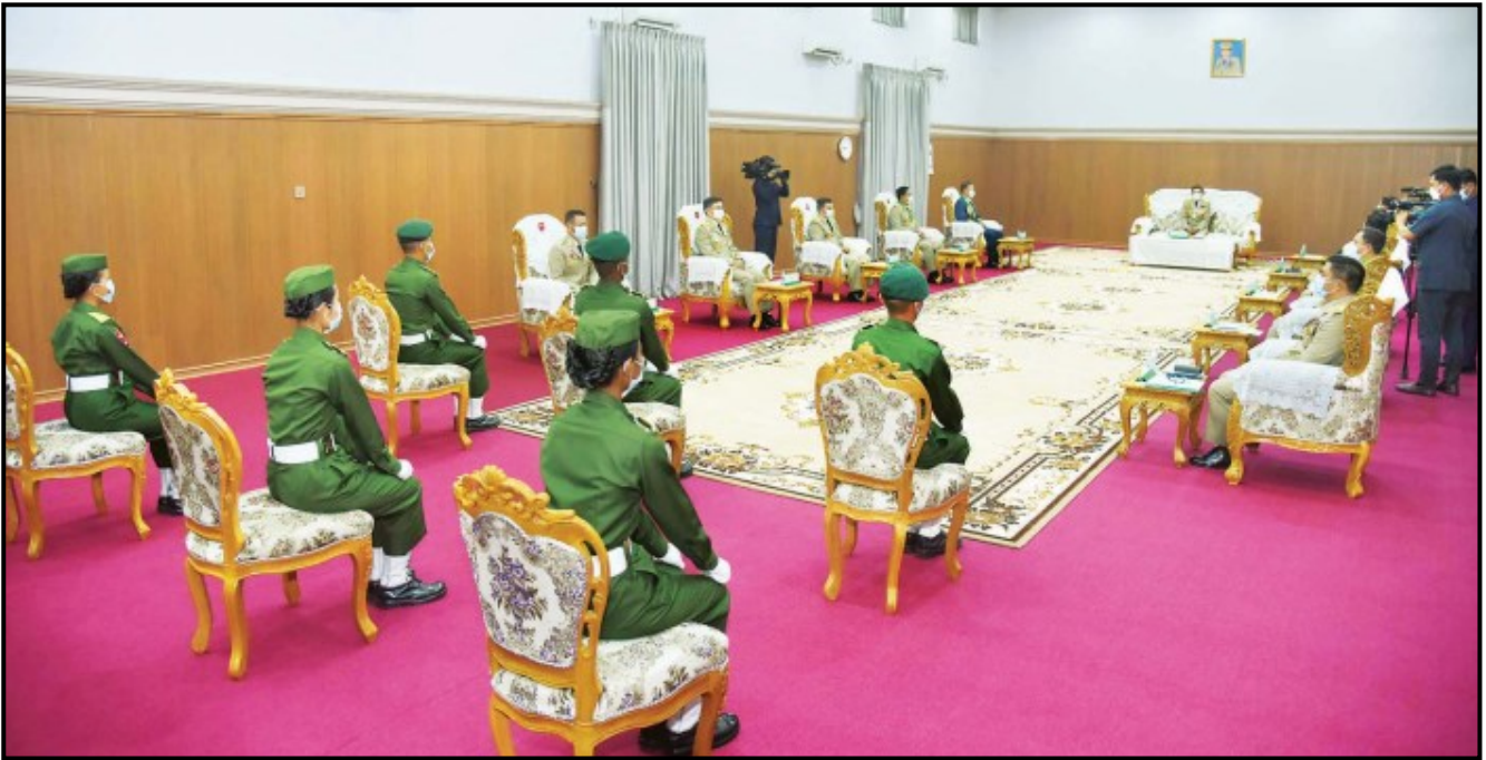
The Chairman of the State Administration Council Commander-in-Chief of Defence Services Senior General Maha Thray Sithu Min Aung Hlaing meeting with the outstanding trainees and speaking words of honour