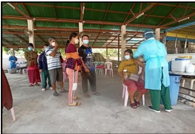
COVID-19 vaccination process in Tarlay township