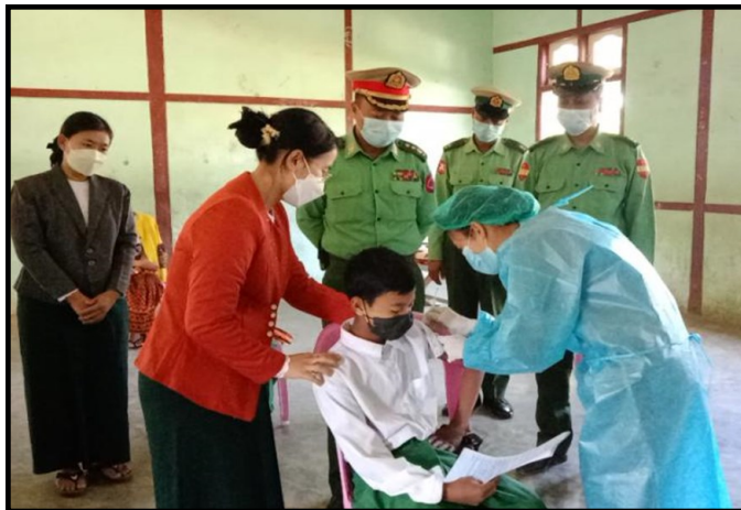
Vaccinating students against COVID-19 in Khandee township