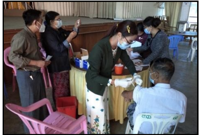
Vaccinating local people against COVID-19 in Kyaukse township