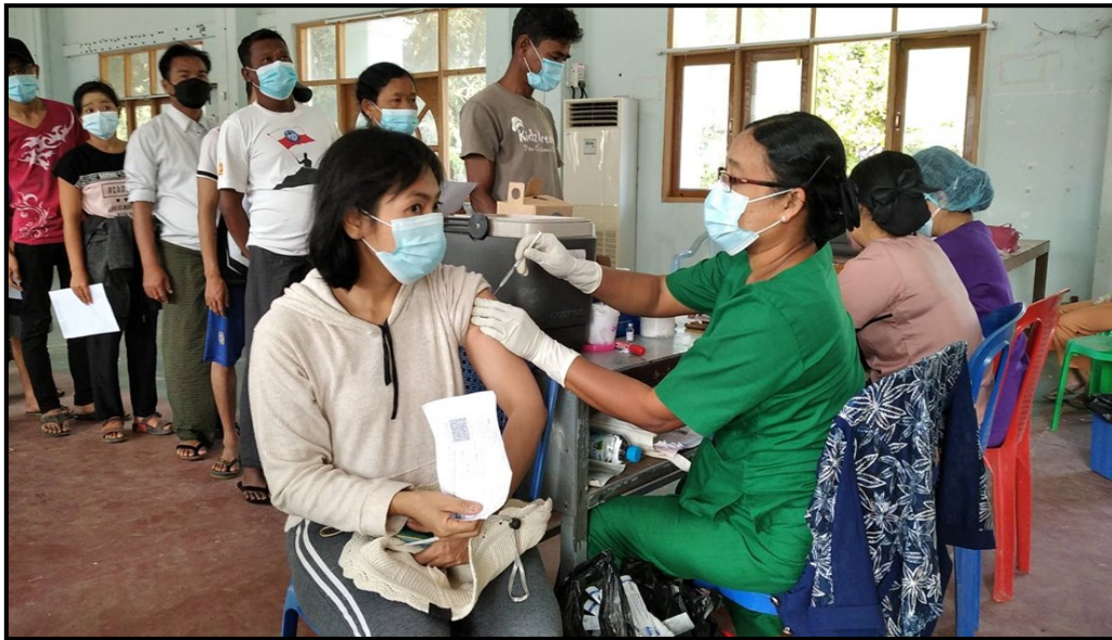
Local people vaccinated against COVID-19 in Kyaukphyu township of Rakhine state

COVID-19 prevention, control and treatment activities such as opening quarantine centres and vaccinating people against COVID-19 continue in respective regions and states.