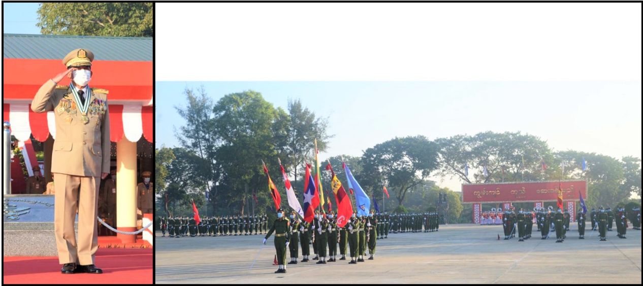
The Chairman of the State Administration Council Commander-in-Chief of Defence Services Senior General Maha Thray Sithu Min Aung Hlaing taking the salute of the trainee companies