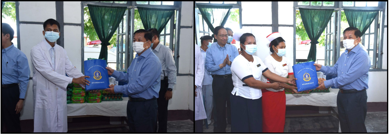
The Chairman of the State Administration Council Prime Minister presenting foodstuff to staff of township public hospital in Cocokyun township