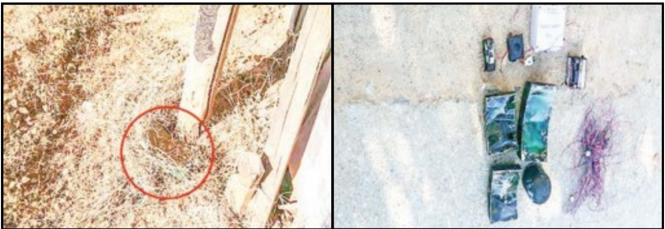
Homemade mine planted by terrorists near ward administration office in Loikaw township at the scene