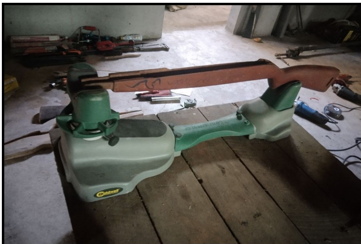
The confiscated homemade gun making machine