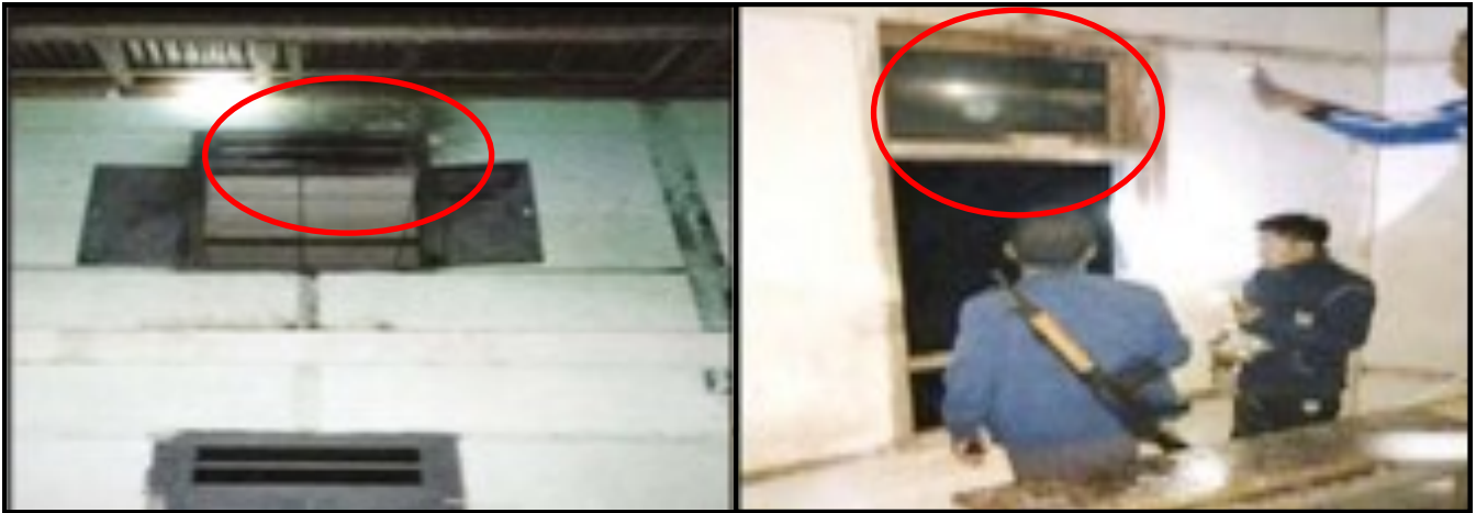
The terrorists throwing the gasoline bottle into the Basic Education High School in Banmauk township