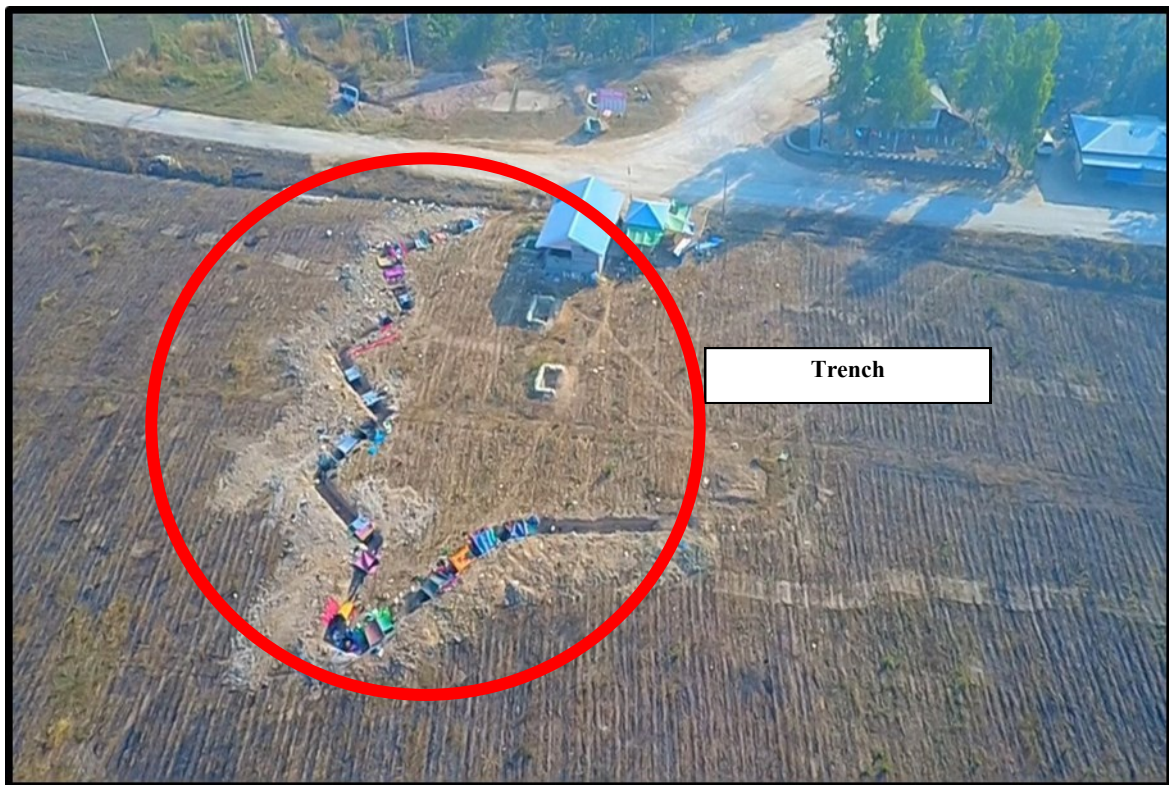
Combined PDF terrorist group's camp in the junction of Htee Mae Wah Khee