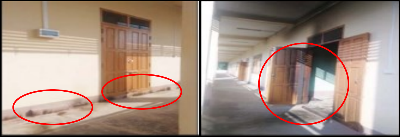
The terrorists burnt down the corridor of a school building in Taungphila ward in Kalay township

Under the directive of NUG, the so-called PDF terrorists committed arson attacks to burn down the school buildings as well as textbooks and school books in some townships of Sagaing and Ayeyawady regions on 27 December. It is reported that: