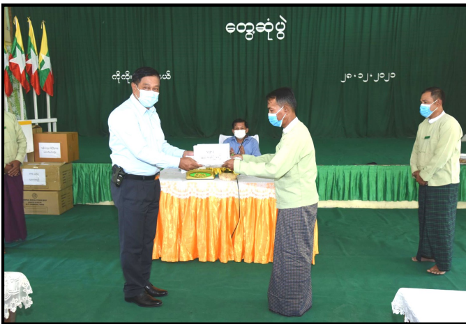
The member of the State Administration Council Admiral Tin Aung San providing SIM cards and top-ups