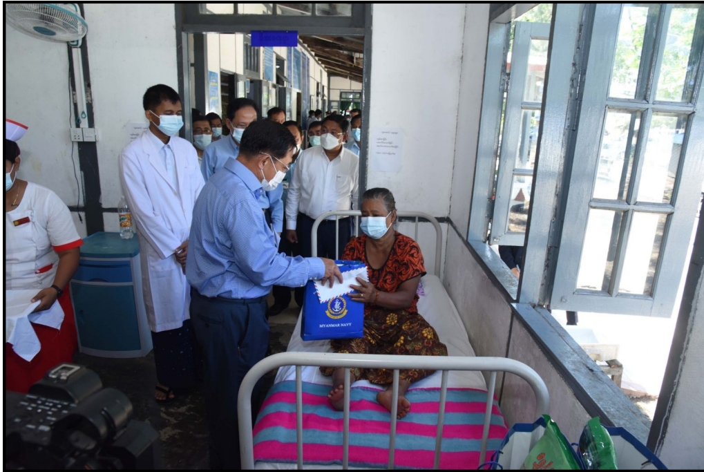
The Chairman of the State Administration Council Prime Minister cordially greeting the patients who are receiving treatments at township public hospital and presenting foodstuff to them

The Chairman of the State Administration Council (SAC) Prime Minister Senior General Min Aung Hlaing, accompanied by Council members, Union ministers, the Chief Minister of Yangon region, the Commander of Yangon Command, and officials went to Cocokyun township of Yangon region on 28 December, and inspected the Township Public Hospital and the Basic Education High School in Cocokyun township.