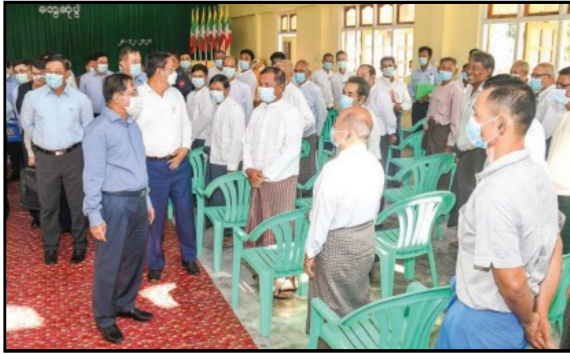
The Chairman of the State Administration Council Prime Minister cordially greeting departmental officials and town elders