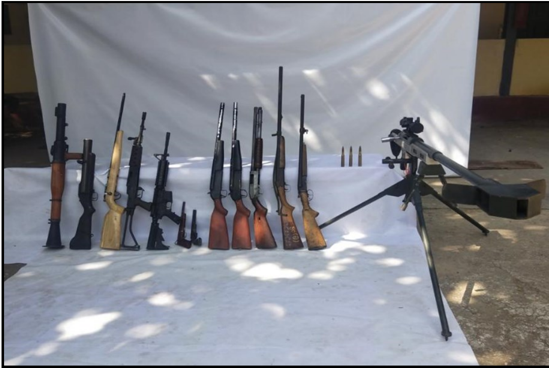
Weapons/ammunition confiscated at the junction of Htee Mae Wah Khee