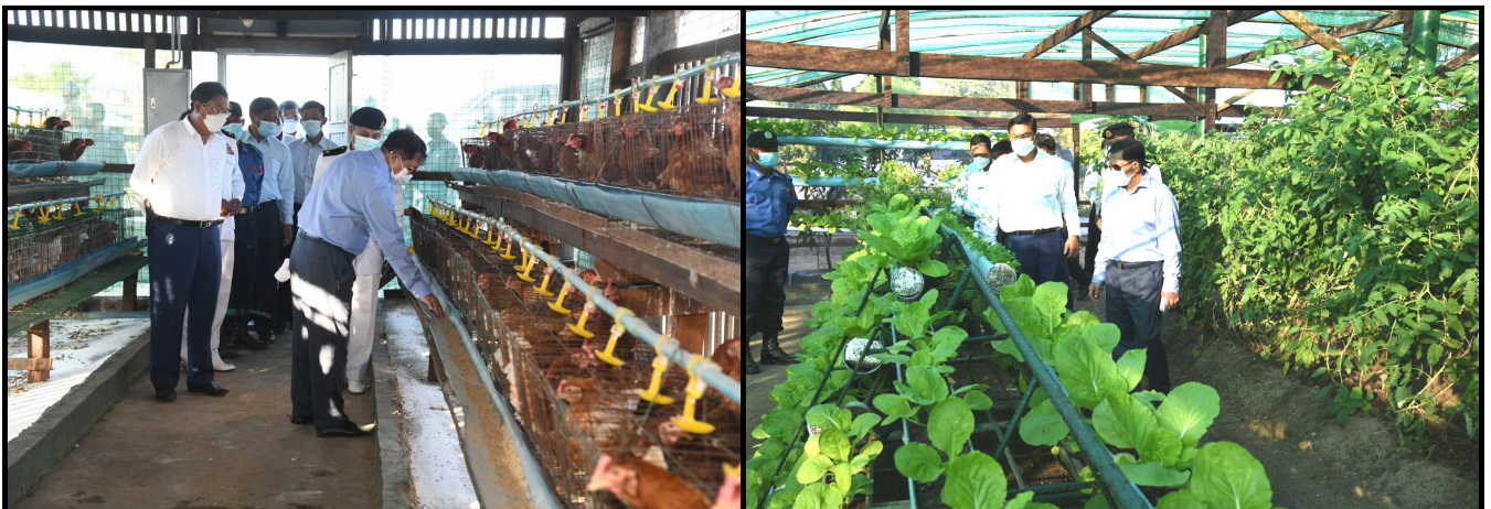
Prime Minister inspecting the raising of layers and cultivation of vegetables in the greenhouse at the local naval base