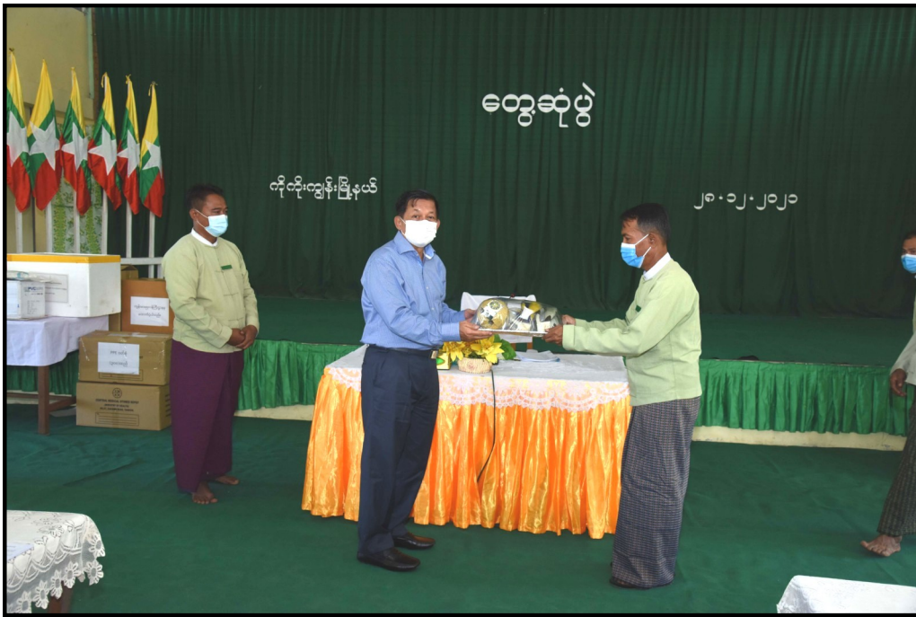
The Chairman of the State Administration Council Prime Minister presenting food aids for locals in Cocokyun region

young and it also needs to have actual skill and knowledge.