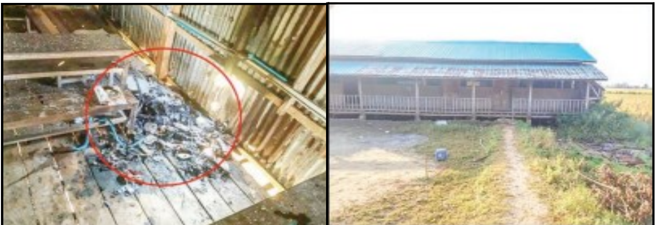
The books and documents destroyed in fire by the arson attack of terrorists at the school in Mawlamyinekyun township