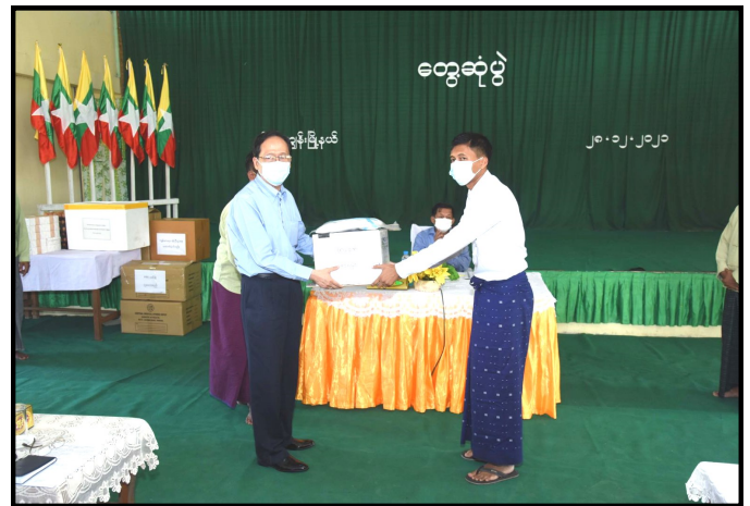
Union Minister for Health presenting ECG and COVID-19 prevention, control and treatment equipment

region, and the government and Tatmadaw will also provide assistance as much as possible.