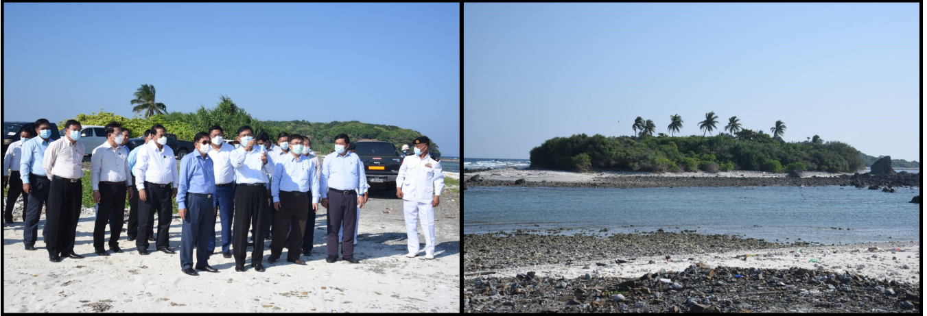
Prime Minister inspecting the conditions of constructing a road connecting Jerry Island and the main island