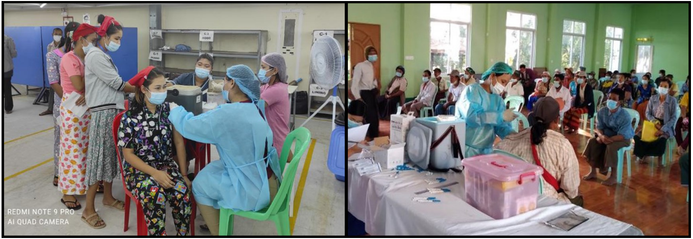
COVID-19 vaccination processes in respective regions and states