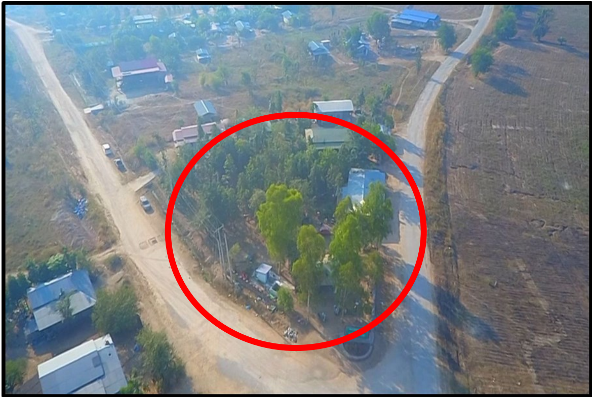
Combined PDF terrorist group's camp in the junction of Htee Mae Wah Khee