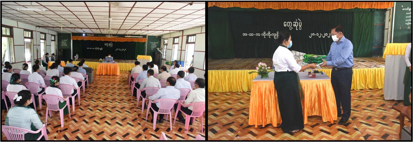
The Chairman of the State Administration Council Prime Minister presenting foodstuff to the teachers of the Basic Education High School in Cocokyun township

land circular road of Cocokyun, and local military units, and project to build a connection road in Jerry Island and the main island by motorcade.