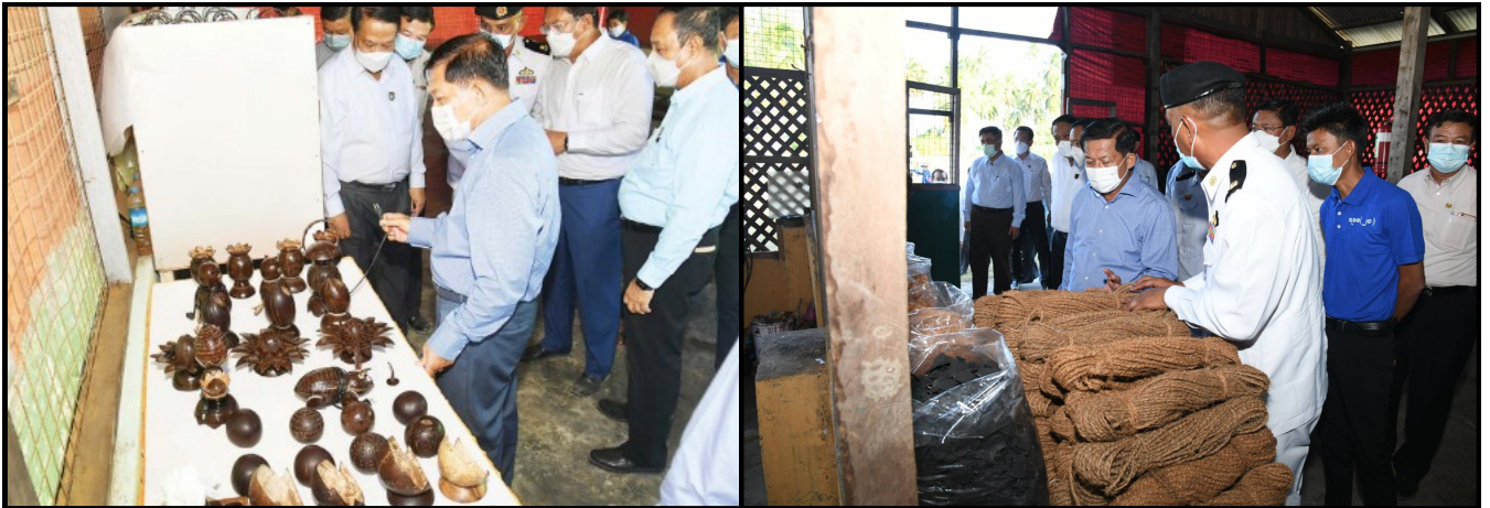
Prime Minister inspecting the coconut and coconut products factory