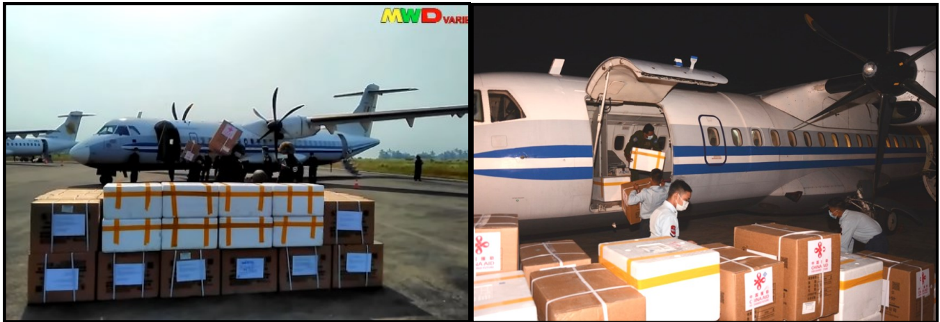
Distributions of COVID-19 vaccines to respective regions and states by military aircraft

COVID-19 prevention, control and treatment activities such as opening quarantine centres and vaccinating people against COVID-19 continue in respective regions and states.