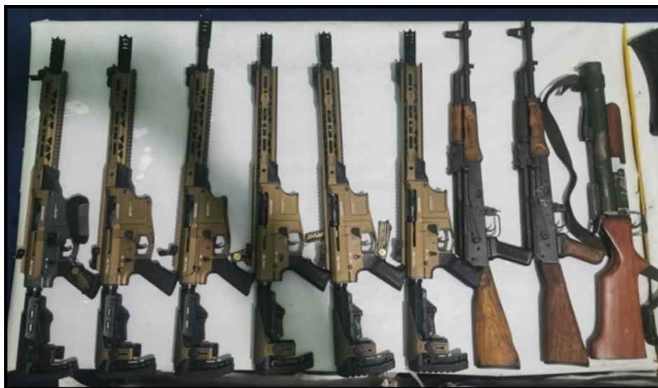
Weapons/ammunition seized from so-called CRPH, NUG and PDF terrorists

The Tatmadaw has been working for lasting peace since the signing of the Nationwide Ceasefire Agreement (NCA) on 15 October 2015 by respectfully abiding by the provisions of the NCA agreement. The Commander-in-Chief of the Defence Services has stated that “the Tatmadaw will strictly abide by the terms of the NCA agreement in order to achieve the lasting peace that the State and the people need” , at peace meetings and ceremonies. In addition, peace process is also being implemented as a priority in the Five-Point Road Map and Nine Objectives of the State Administration Council. Despite this, some ethnic armed organizations have taken advantage of the current political situation to violate the NCA agreement in a variety of ways.