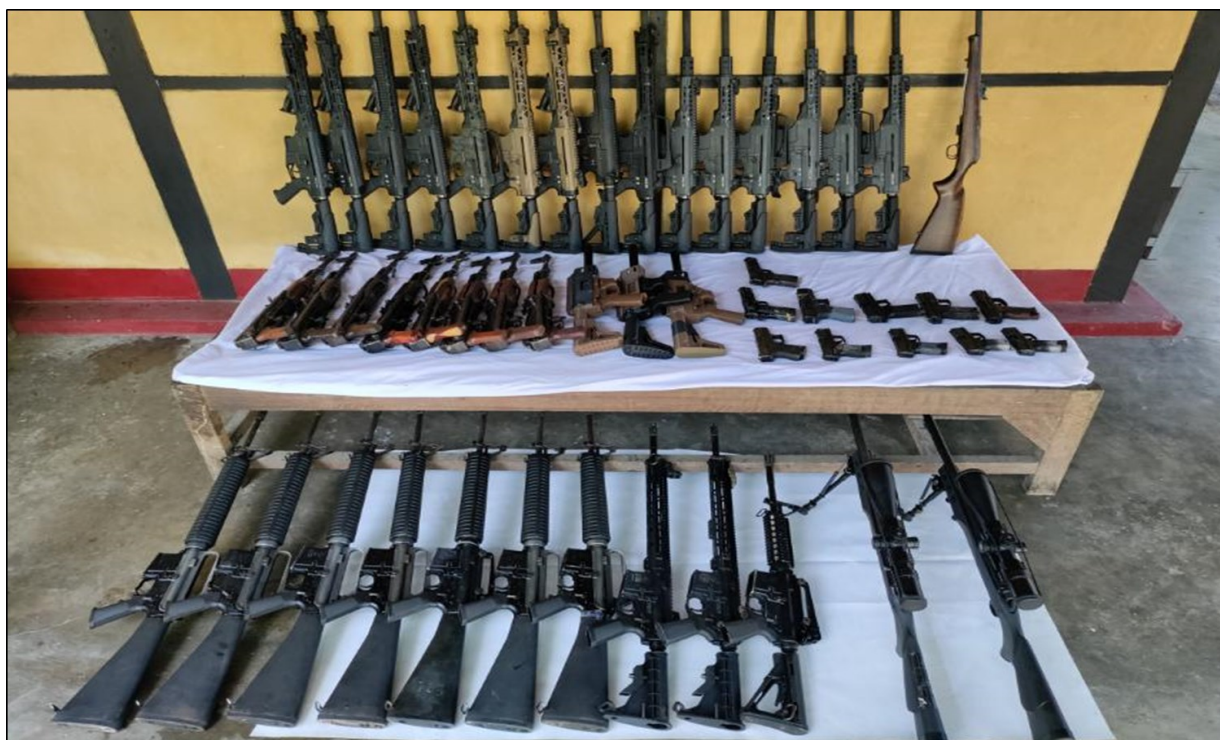
Weapons/ammunition seized from so-called CRPH, NUG and PDF terrorists