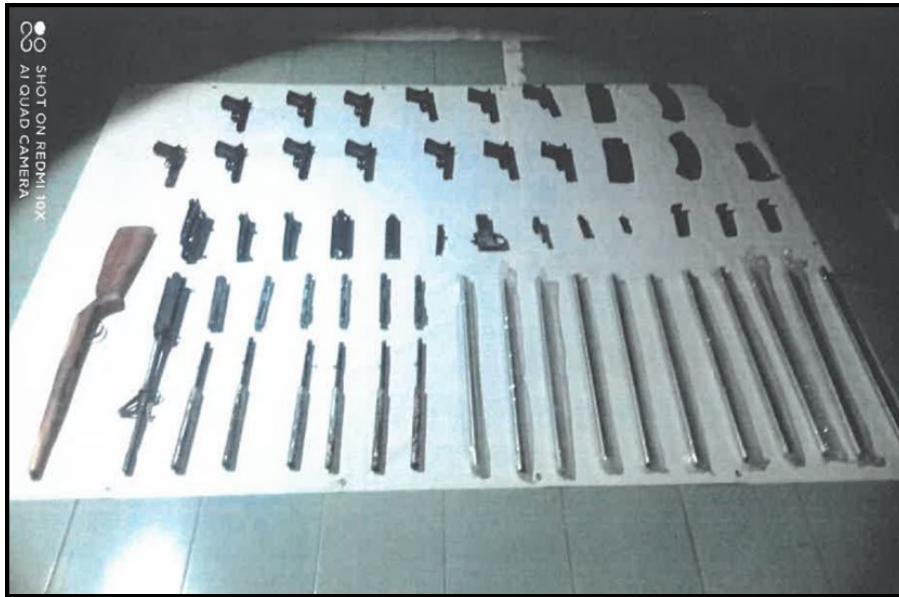
Weapons/ammunition seized from so-called CRPH, NUG and PDF terrorists

Hence, as part of self-defence activities, the Tatmadaw used the limited strength to combat the some leaders and troops of KNU, NUG and PDF terrorists as of 15 December 2021. The terrorist groups organized their strengths to commit the counter attacks to the military columns day and night.