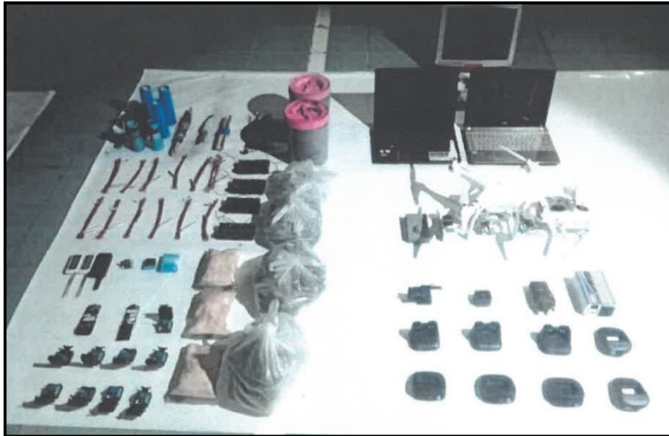
Weapons/ammunition seized from so-called CRPH, NUG and PDF terrorists

The Tatmadaw has negotiated with KNU/KNLA officials in a formal/friendly manner several times to abide by the NCA agreement and to monitor their subordinates since the Htee Muu Hta camp engagement until the Lay Kay Kaw clash. According to reports, at the KNU meetings, some leaders of KNU who want to divert from the NCA route and rekindle the conflict in peaceful Kayin state are reportedly convincing to back the NUG and PDF terrorist groups with foreign funding to destabilize the current government.