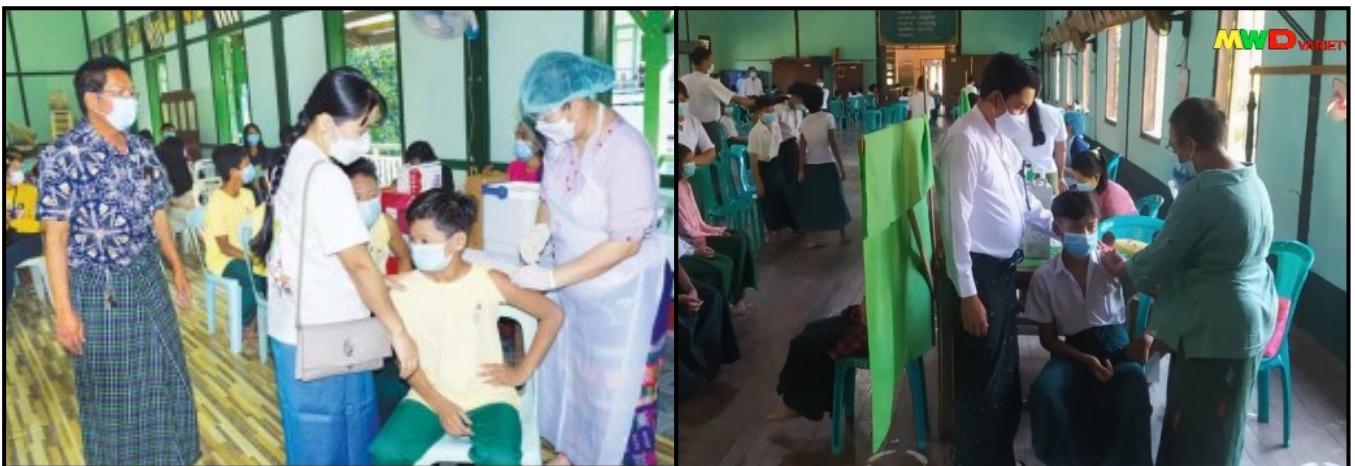
Vaccinating students aged 12 years and above against COVID-19 in respective regions and states

COVID-19 prevention, control and treatment activities such as opening quarantine centres and vaccinating people against COVID-19 continue in respective regions and states: