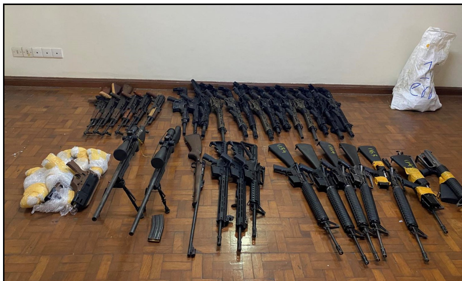
Weapons/ammunition seized from so-called CRPH, NUG and PDF terrorists