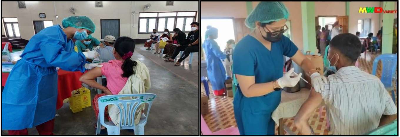
COVID-19 vaccination processes in respective regions and states