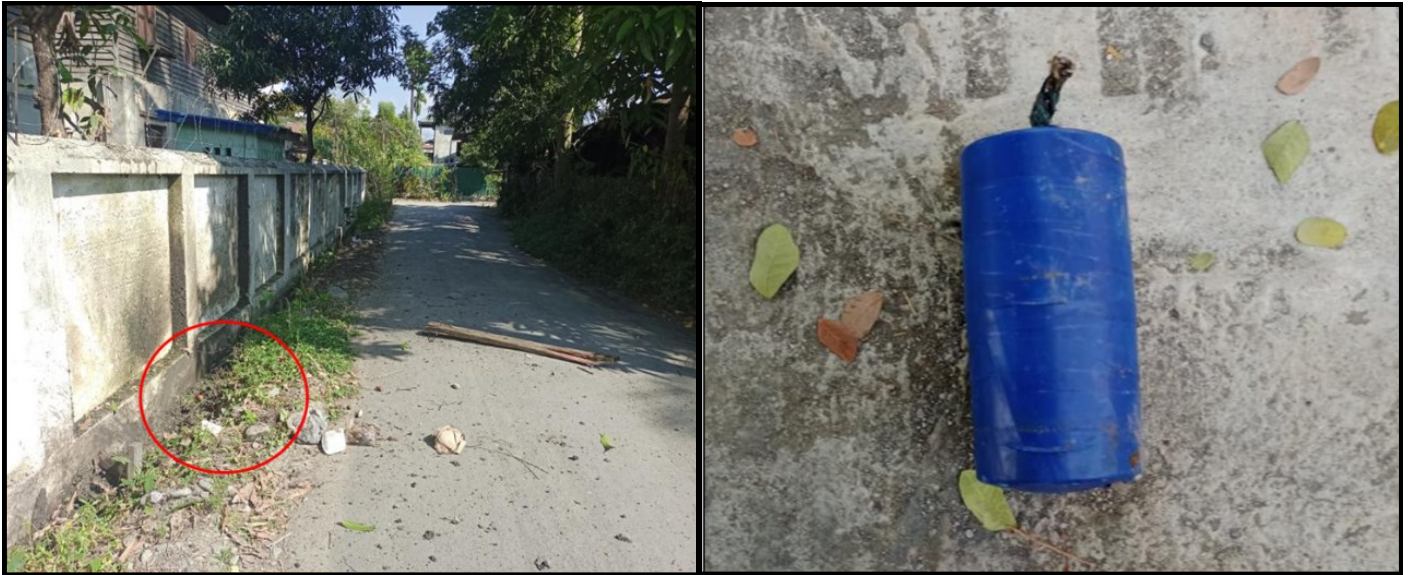
Unexploded homemade bomb at the school in Paukkar village of Sagaing township