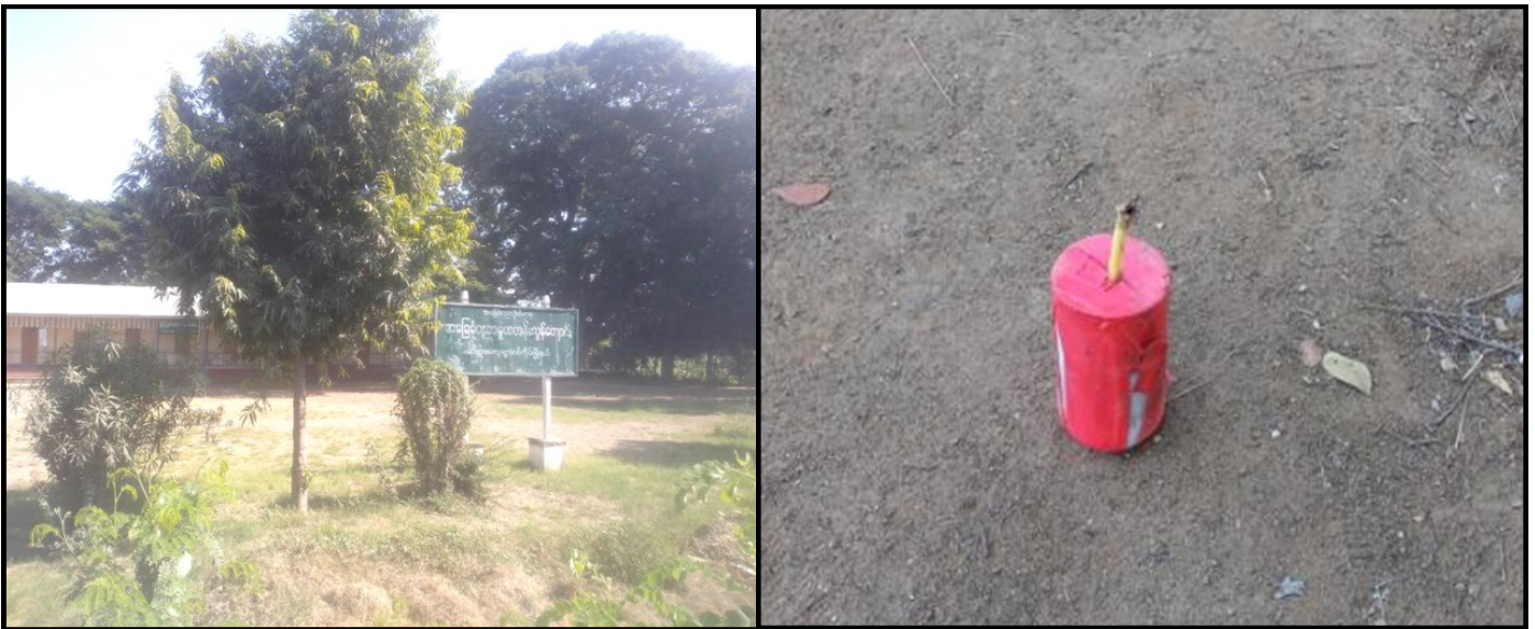
An unexploded homemade bomb at the school in Aungzeya ward of Kalay township

Under the guidance of the NUG, the so-called PDF terrorists and extremists of NLD party supporters are committing the reckless terrorist attacks targeting against the innocent students and teachers in order to disrupt the peaceful learning of the children. The entire population is willing the international communities to denounce the terrorists who are intentionally attacking the education infrastructures and school children.