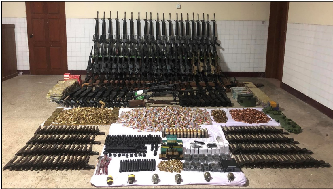
Weapons/ammunition seized from so-called CRPH, NUG and PDF terrorists

Between 1 February and 30 December 2021, there were 3,751 violent incidents in some cities and the security forces arrested 1,492 terrorists and seized 133 weapons, 1,693 rounds of ammunition, 28 grenades, 217 homemade mines and other explosives. Moreover, the police also detained 9,958 terrorists and seized 3,417 firearms, 161,500 rounds of ammunition, 647 grenades, 6,895 homemade mines and other related materials in time.