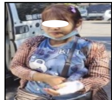
Three innocent civilians injured due to the explosions of homemade mines in Kyimyindine township