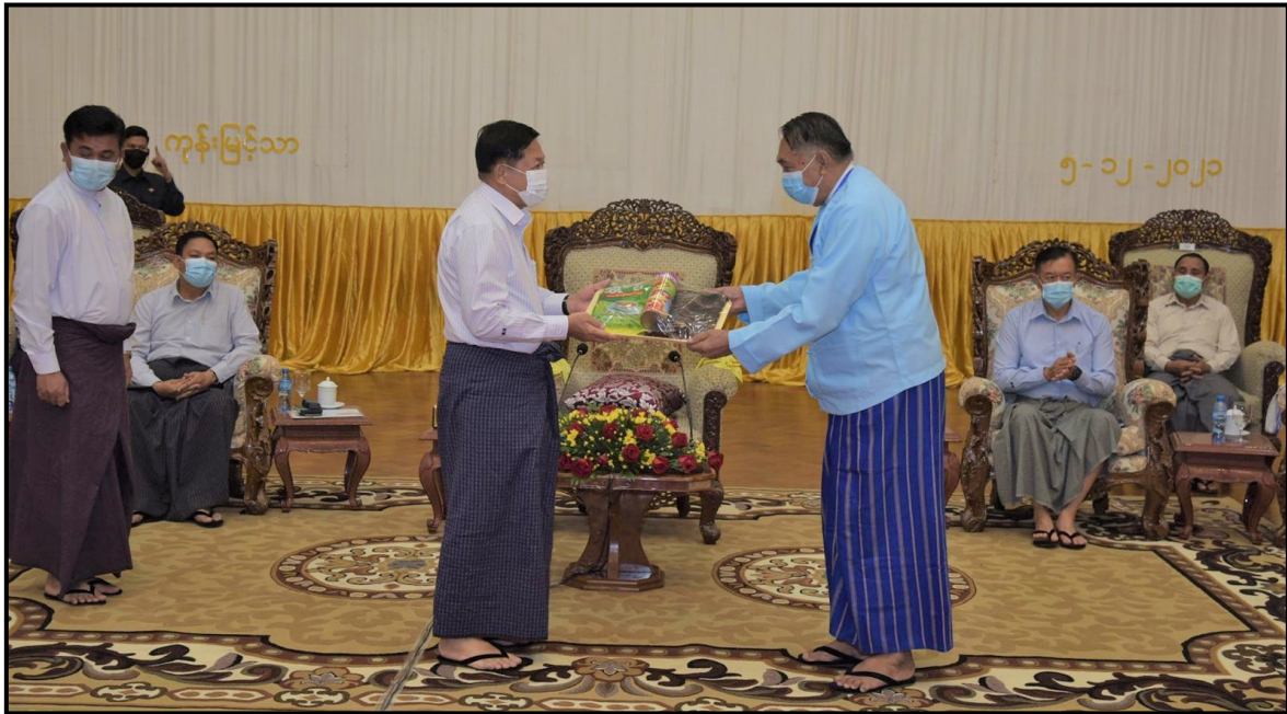
The Prime Minister of the State presenting foodstuffs to the chairman of Interfaith Friendship Organization (Central), U Sein Than