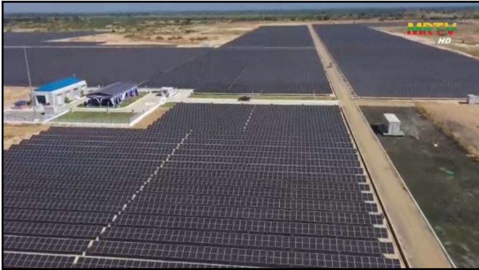
A view of 30-megawatt Thapyaywa Solar Power Plant project in Mandalay region