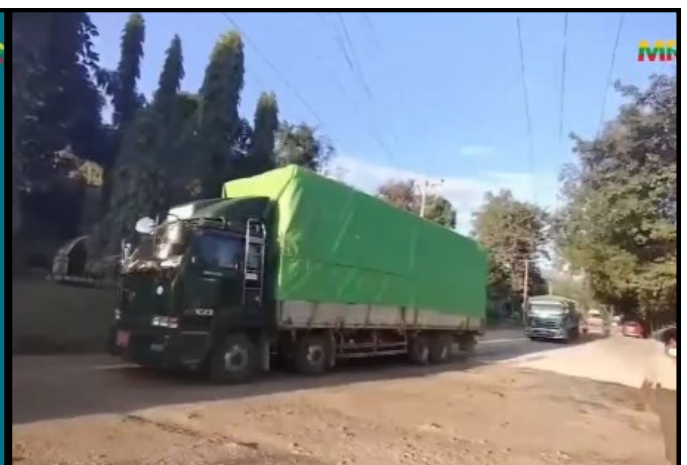
Importing medical supplies from abroad