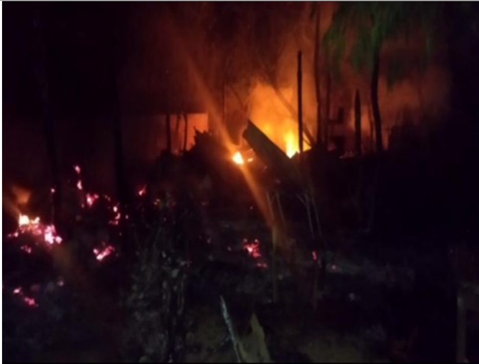
The brutal killing and arson attacks on the village administrator of Letwelmyinni village in Natogyi township and his home by PDF terrorist group

Four people (three males and one female) including village administrator were burnt to death, and two people (one male and one female) were injured due to the brutal arson attack and assassination of so-called PDF terrorists in Natogyi township of Mandalay region.