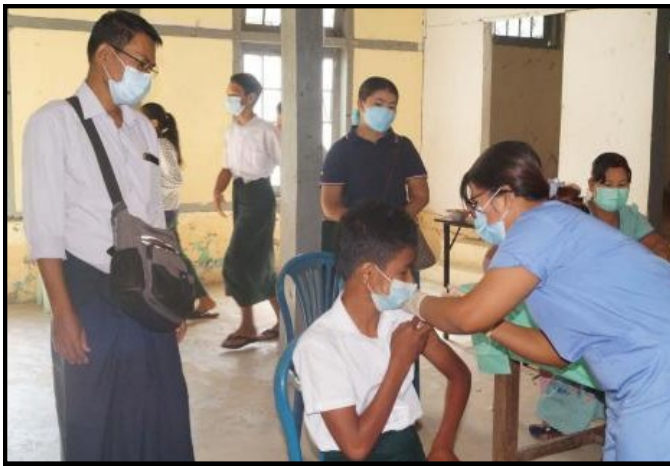
Vaccinating students aged 12 years and above against COVID-19 in Htantapin township