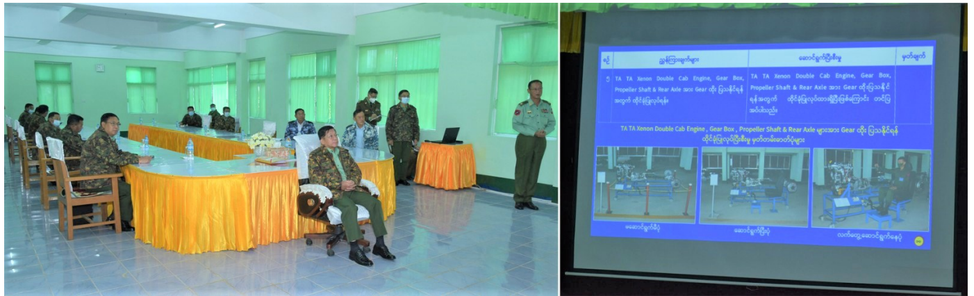
Director of Electrical and Mechanical Engineers reporting the upgrade tasks of the school