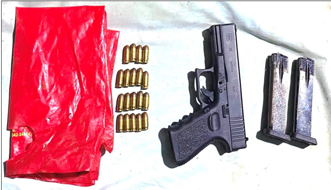
Pistol and bullets seized from the house of the offender Aye Thaung in Padauk Chaungkone village of Pathein township

of Aye Thaung who still remained to be arrested in Padaukchaunggon village and 5 bags of gunpowder, 10 clocks used in time bombs, 50 detonators and related explosives were confiscated at the house of Daw Mya Hnit who still remained to be arrested on 4 December,