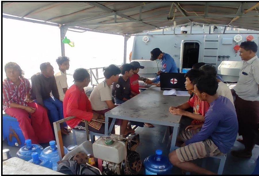
Military personnel from Myanmar Navy conducting evacuation activities on the people from a fishing boat due to engine failure

A fishing boat belongs to U Phoe Zaw, a resident of Kyauk Chaung village of Hainggyikyun township of Ayeyarwady region stranded on the pearl coral reef 18.5 nautical miles off the southeast of Hainggyikyun township due to its engine failure on 4 December. Acting on the information, military personnel from Myanmar Navy arrived there with a naval vessel and conducted evacuation activities as per its benign role of its four primary roles to provide humanitarian assistance to the people at sea.