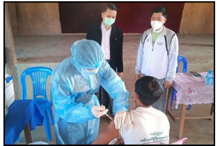
Vaccinating peoples from Innjyanyan township living at Myitkyina IDP camp