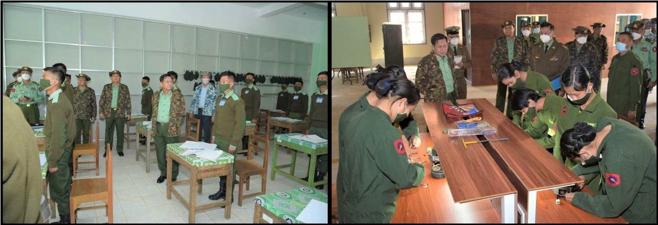
The Chairman of the State Administration Council Commander-in-Chief of Defence Services viewing the learning and practical tasks of the trainees