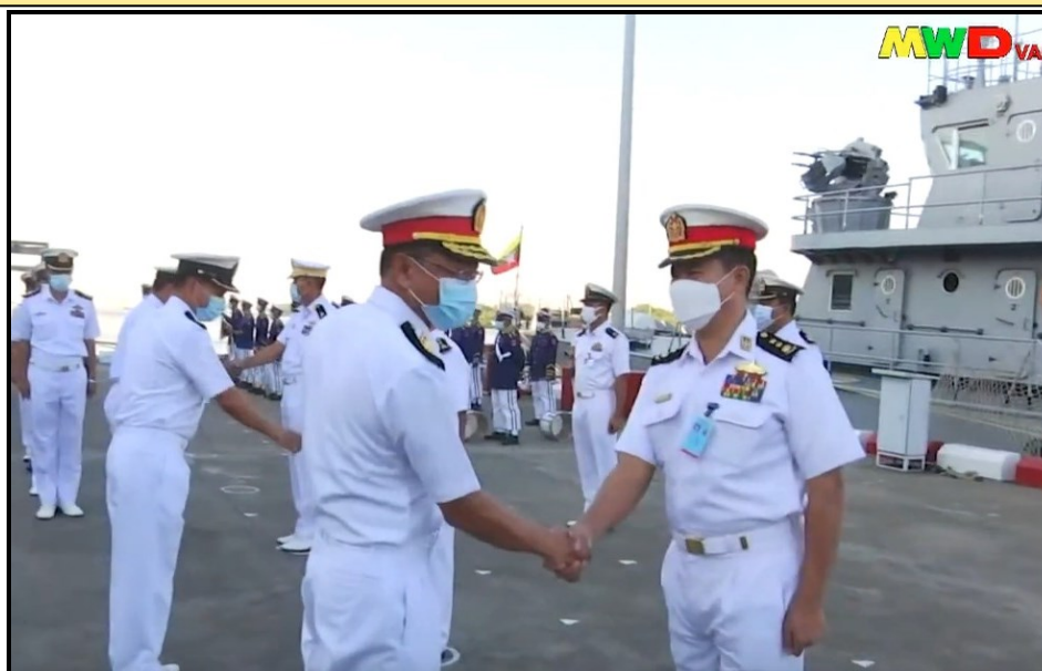
The participants of the Naval vessel (Kyansittha) of Myanmar Navy after attending the ASEAN-RUSSIA Naval Exercise (ARNEX-2021) welcomed by the officers from Myanmar (Navy)

The naval vessel (Kyansittha) of Myanmar Navy returned to Yangon on 6 December after attending the ASEAN-Russia Naval Exercise (ARNEX-2021) which was held off the coast of Sumatra, Indonesia from 1 to 3 December.