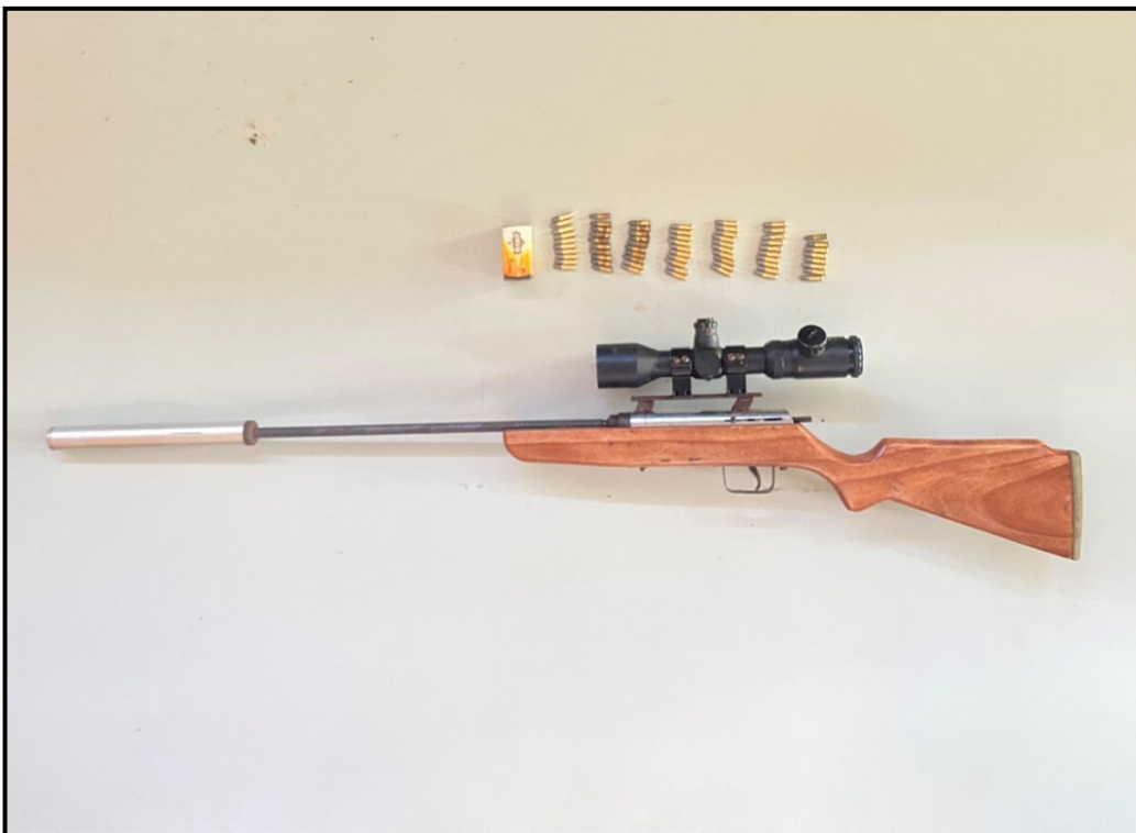
Weapons and bullets seized from the house of the offender Phoe Htwe on Satkone street in No (10) ward of Pathein township