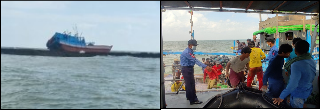
Military personnel from Myanmar Navy conducting evacuation activities on the people from a fishing boat due to engine failure