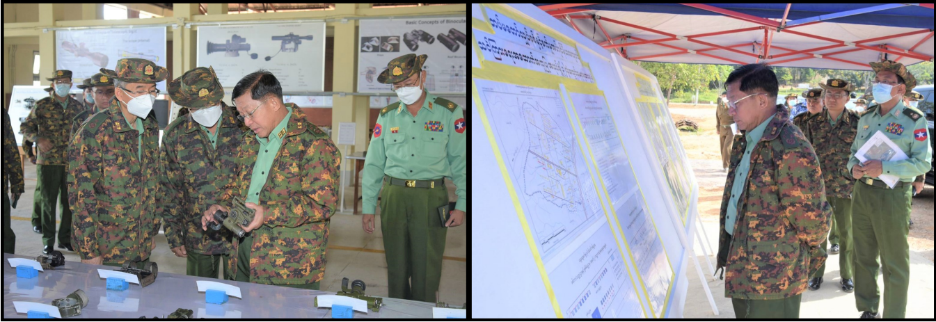
The Chairman of the State Administration Council Commander-in-Chief of Defence Services inspecting the teaching aids and the side plan of teaching aid workshop