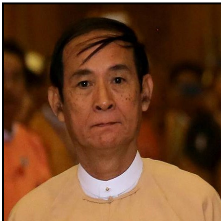
U Win Myint

current location for remaining two years of imprisonment according to Subsection (1) of the Penal Code Section 541.