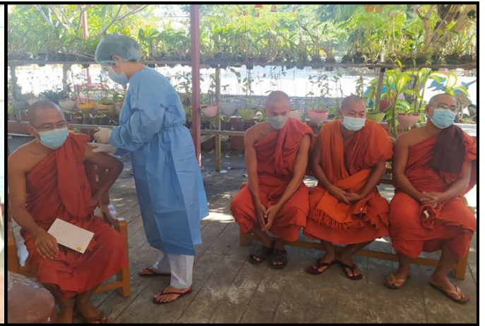
COVID-19 vaccination processes in respective regions and states