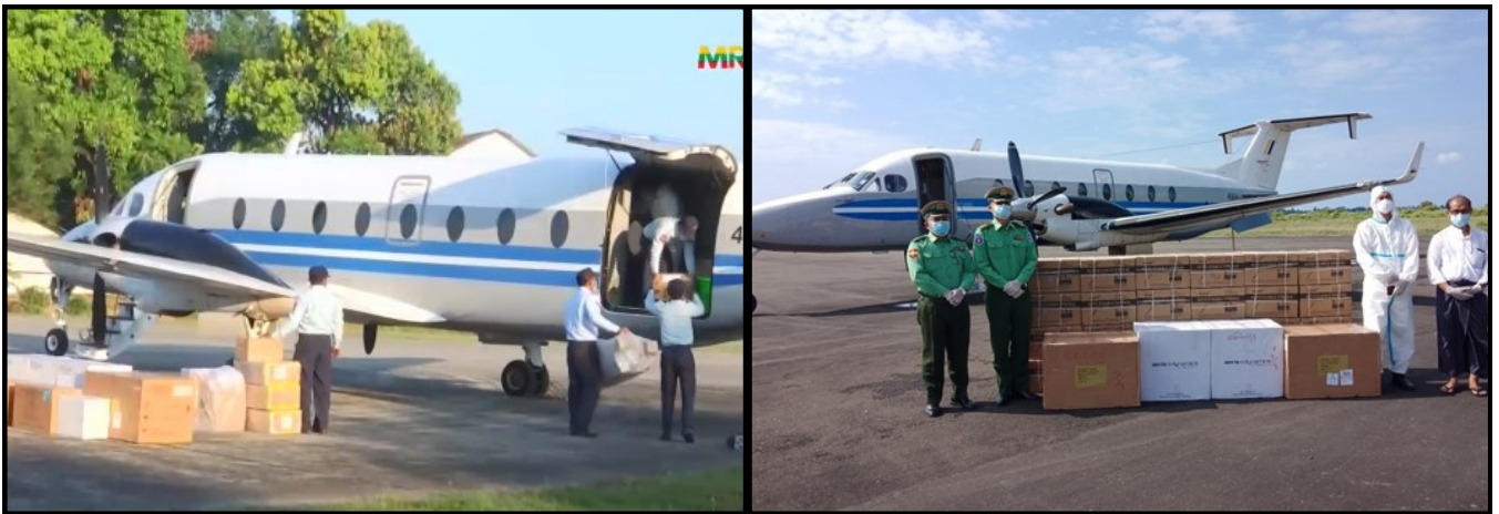
Transporting COVID-19 vaccines by Tatmadaw aircraft to respective regions and states as per the quality control standards

COVID-19 prevention, control and treatment activities such as opening quarantine centres and vaccinating people against COVID-19 continue in respective regions and states.