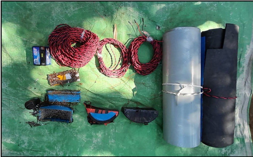
Weapons/ammunition confiscated at Lelong village in Ngaputaw township