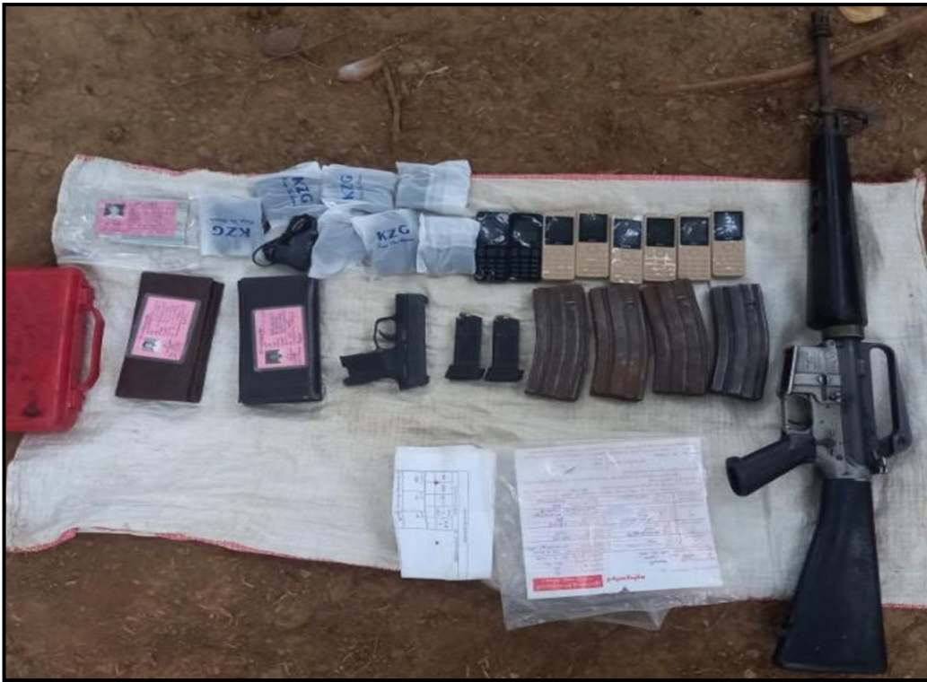
Weapons/ammunition confiscated near Lelong village in Ngaputaw township