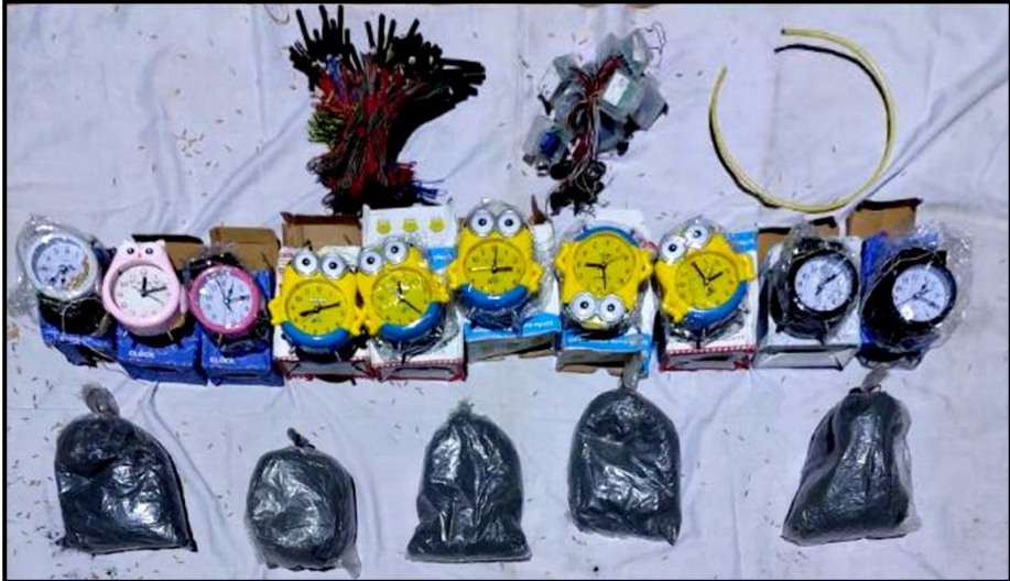
Explosive devices confiscated at No (10) ward of Pathein township