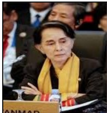
Daw Aung San Su Kyi