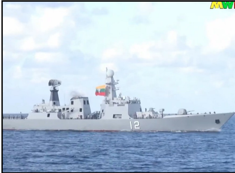
Naval Vessel (Kyansittha) of Myanmar Navy

the beginning of a new chapter in history between Russia and its strategic ASEAN partners, and the first joint ASEAN-Russia Naval Exercise.