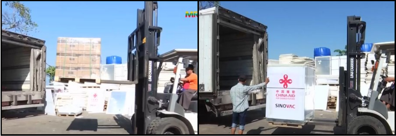
Transporting COVID-19 vaccines by Cold Chain Logistic vehicles to respective regions and states as per the quality control standards

control and emergency response committee and officials also distributed about 2000 masks to people in southern district (Seikkyi Kanaungto township) of Yangon region.