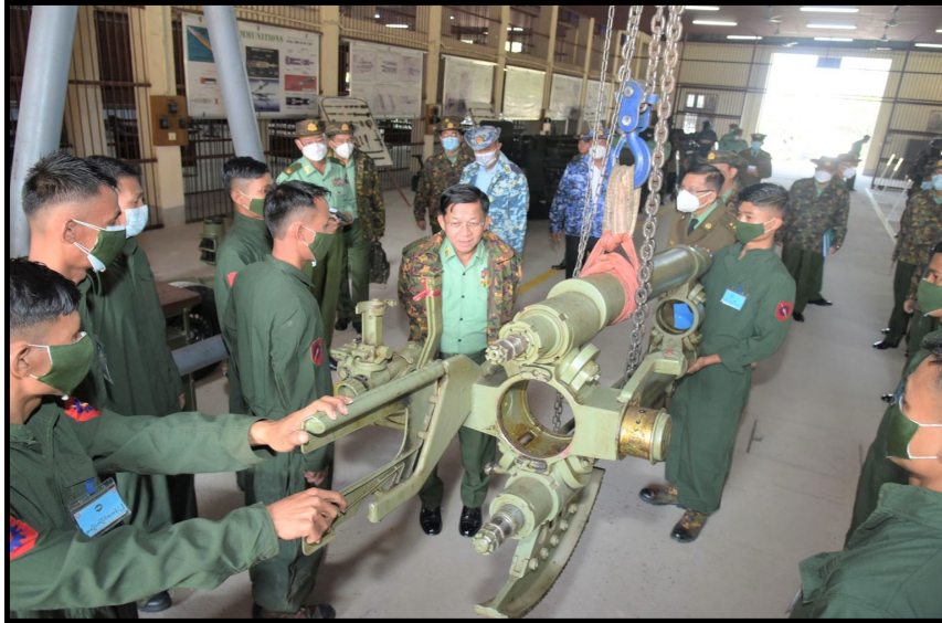
The Chairman of the State Administration Council Commander-in-Chief of Defence Services inspecting the practical tasks of the trainees