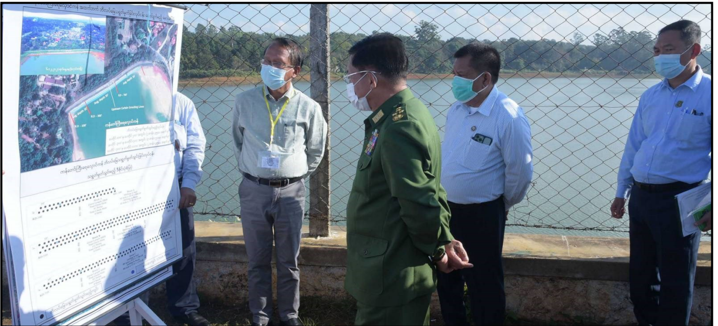
Prime Minister of the State Senior General Min Aung Hlaing inspecting the maintenance works of Kandawgyi Lake