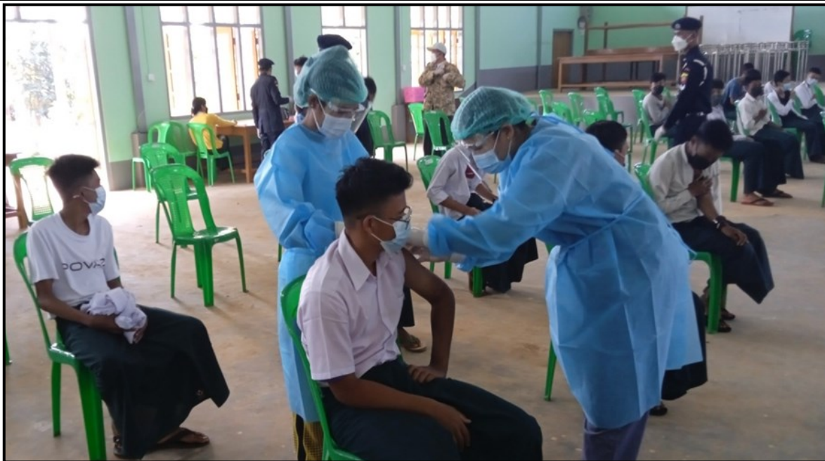
Vaccinating students against COVID-19 at Basic Education High School in Kholan township

COVID-19 prevention, control and treatment activities such as opening quarantine centres and vaccinating people against COVID-19 continue in respective regions and states.