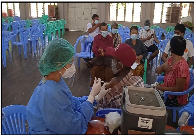
Local people vaccinated against COVID-19 in Mon state