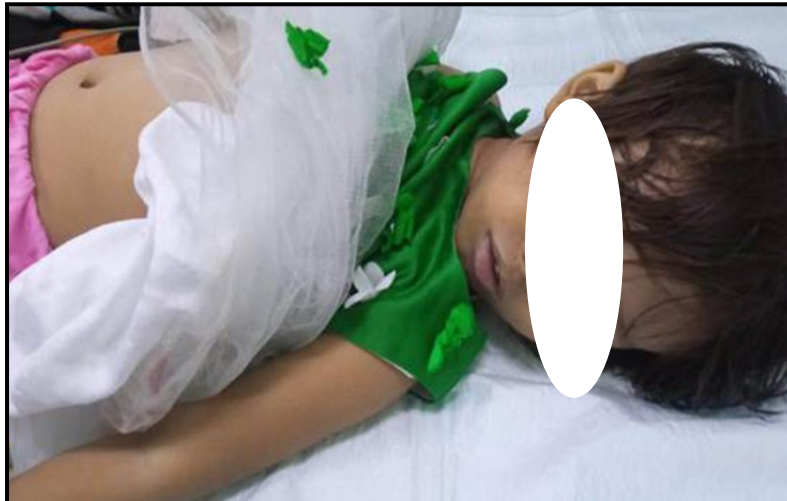
An innocent little girl is dead due to a bomb blast by terrorists.