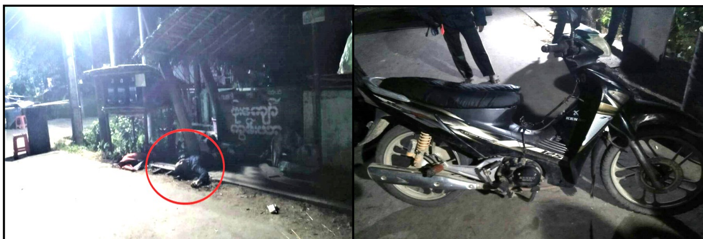
A death male and confiscated morotcycle during the incident in which the terrorists attacked the police outpost of Warbalaukthauk village in Kawmu township