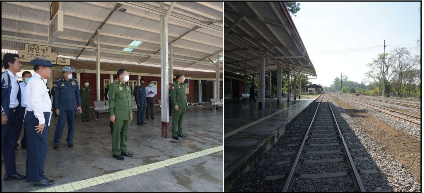
Prime Minister of the State Senior General Min Aung Hlaing taking an inspection tour around Pyin Oo Lwin railway station