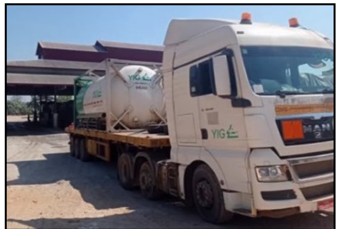
Importing oxygen by vehicles through border trade gates