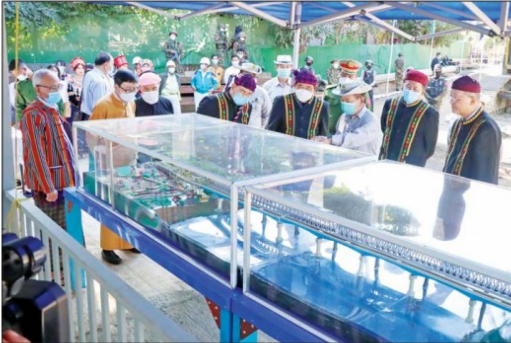
The SAC members and officials inspecting the construction project of the Ayeyawady Bridge (2) in Myitkyina