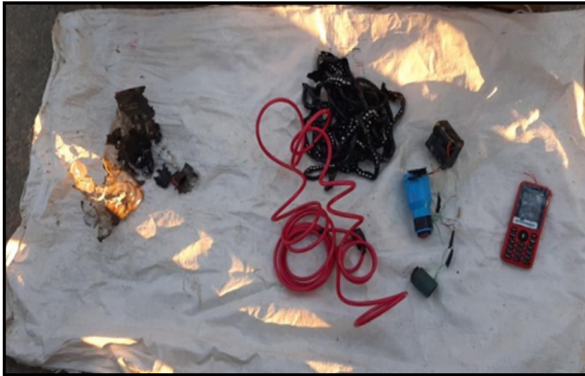
Confiscated explosive devices