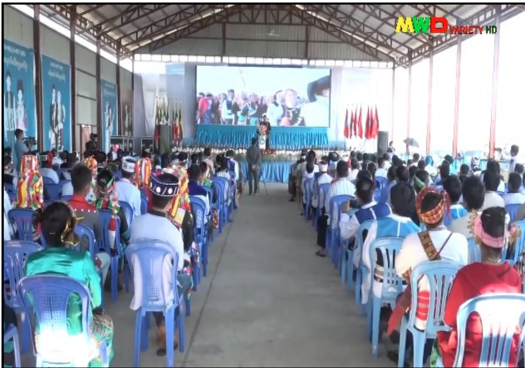
Meeting with Lisu ethnic nationalities