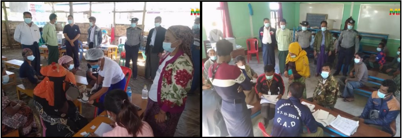
Vaccinating people from Kyauktalone IDP camps and locals in Kyauk Phyu and Pauktaw townships against COVID-19