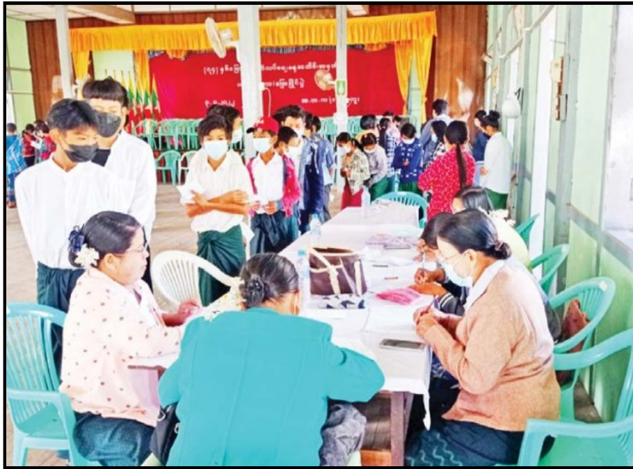
Vaccinating students aged 12 years and above against COVID-19 in Minbu-Saku township

COVID-19 prevention, control and treatment activities such as opening quarantine centres and vaccinating people against COVID-19 continue in respective regions and states.