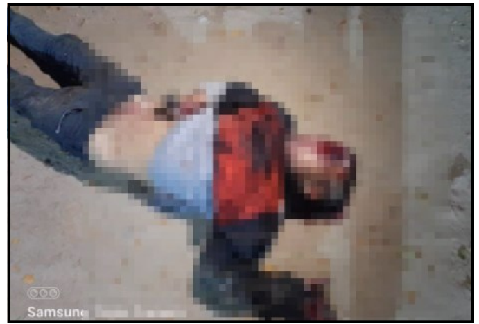
Tatkone township municipal office where the explosion occurred and a dead terrorist

online by taking an opportunity of new generation youths' curiosity. It is examined that 27 accidental explosions had occurred including the above-mentioned incident causing 28 deaths and 25 injured during the attempts of terrorists with no sufficient skills to detonate homemade mines.