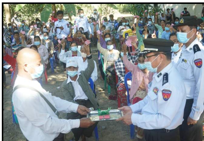
Nay Pyi Taw Council Territory