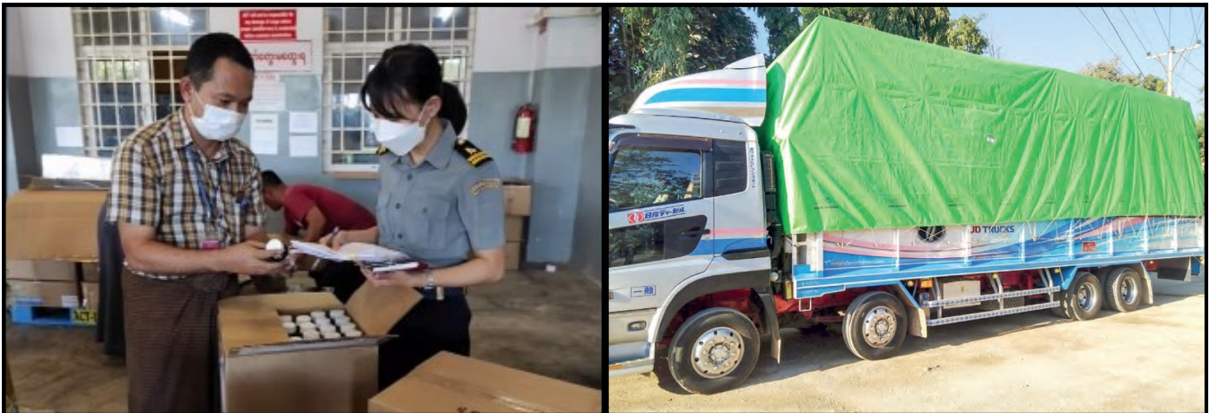
Importing medications from abroad

The Ministry of Health is conducting COVID-19 tests regularly, 137 new cases of COVID-19 were found from testing a total of 8,822 samples and the infected rates are 1.55 percent on 9 January. Until 9 January