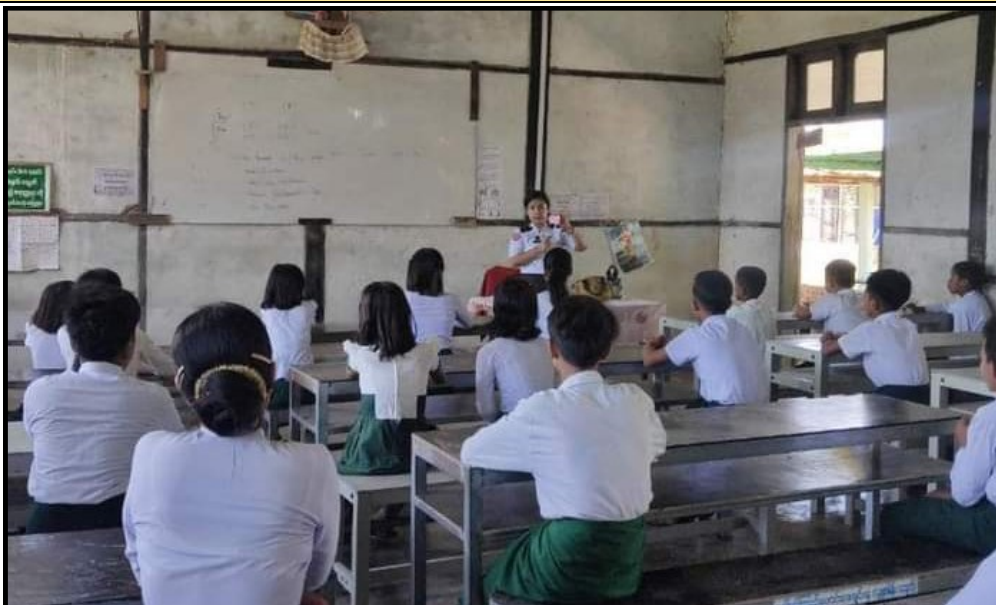
Granting Citizenship Scrutiny Cards to students in Kawkareik township under “Pankhin” project

The State Administration Council has implemented the Pankhin Project since 3 May 2021. Under the project, measures are being taken to grant citizenship identification cards for over 3.8 million people.