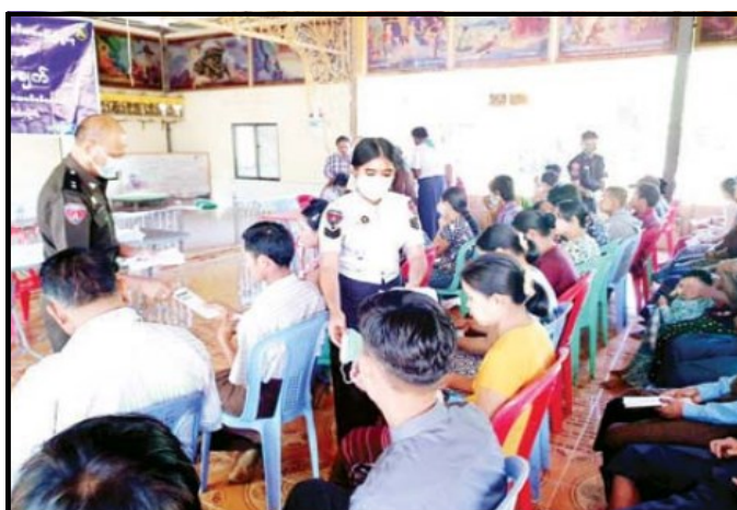
Thone Gwa township

In line with the guidance of the chairman of the State Administration Council, for ensuring the successful implementation of the Pankhin Project, the Ministry of Labour, Immigration and Population is reportedly cooperating with relevant adminis-