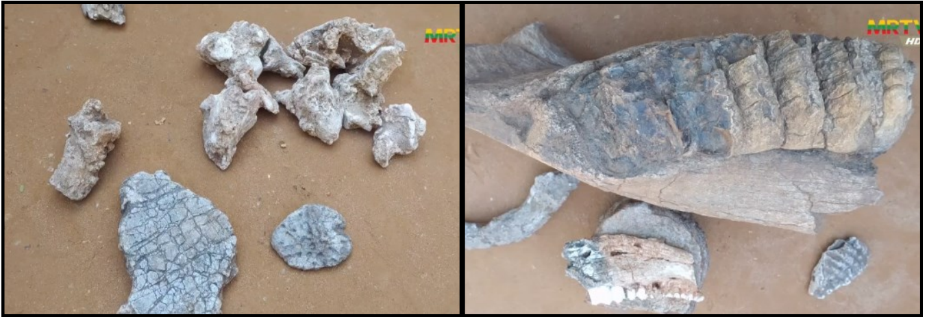
Photos of fossil enthusiasts which have been excavated