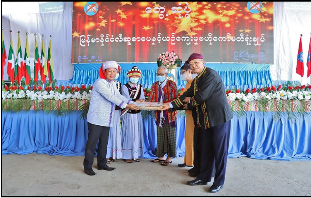
The Chairman of the Lisu Literature and Culture Central Committee of Myanmar presenting Lisu traditional “Zar Zaws” to the Union Ministers

Lisu traditional culture ground. The relevant officials reported on the requirements of Lisu Literature and Culture group of Myanmar and presented Lisu traditional “Zar Zaws” to the SAC members and officials. During the meeting, the SAC members and officials enjoyed Lisu traditional performances (Kwarchal) and awarded cash assistance for Lisu Literature and Culture group.