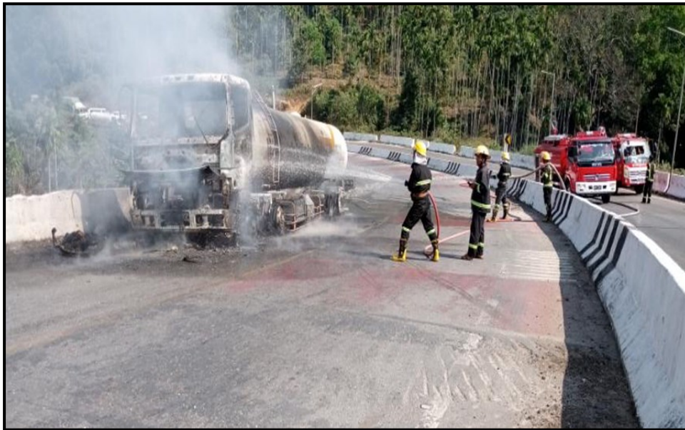
The fire fighters extinguishing the vehicles in fire that carrying LP Gas which was destroyed and burnt down by PDF terrorists using small firearms for no reasons