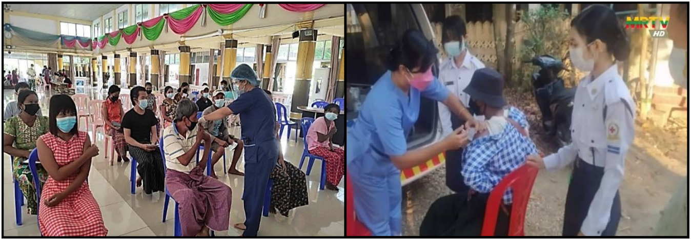
Photos of COVID-19 vaccination processes in respective regions and states