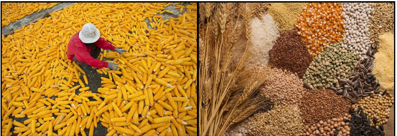
Agricultural products exporting from Myanmar

Myanmar has yearly exported agricultural products, particularly the variety of pulses to foreign countries. Besides the agri-