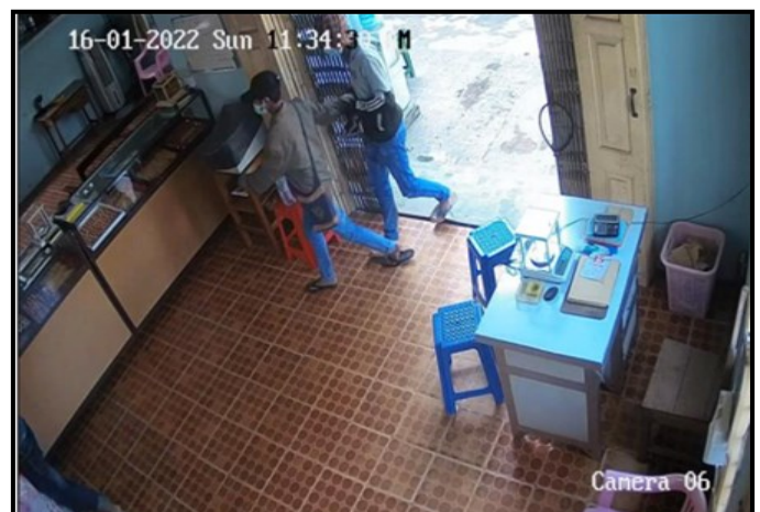
CCTV records of robbery by terrorists