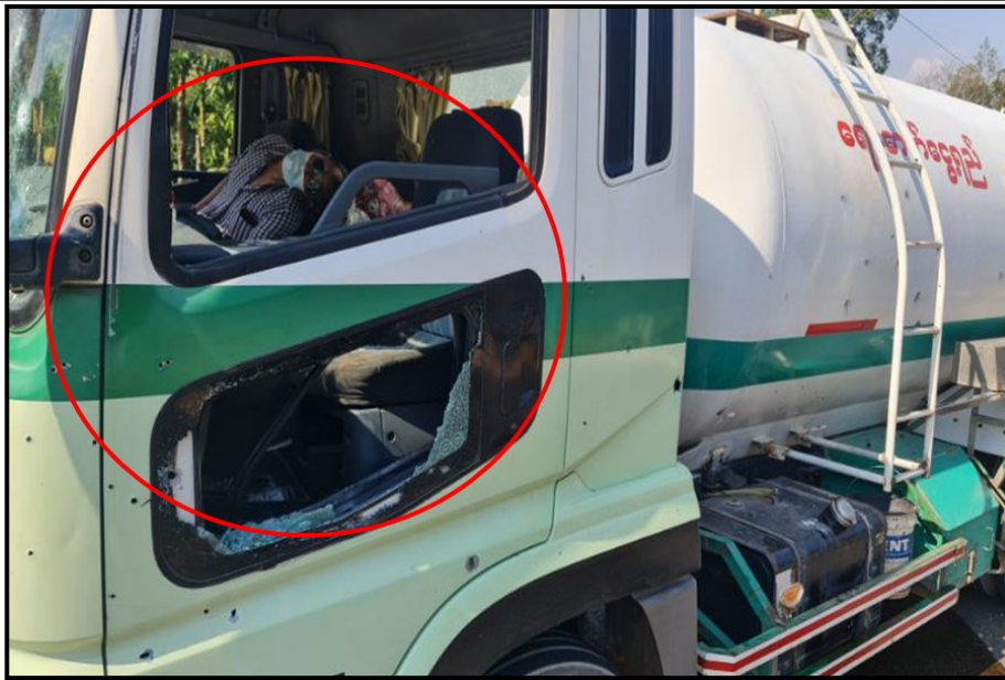
The truck carrying LP Gas destroyed in the gun attack of terrorists for no reasons

PDF terrorists opened fire with small arms on two FUSO trucks of Awra and Chit Lin Myaing companies that were leaving Myawady township for Ye township and Mawlamyine township respectively and burned down them for no reason on 16 January when these vehicles arrived at about 2500 metres to the west of the Tatangu village near Myawady-Kawpareik Asia Road. The 12-wheeler and 10-wheeler “FUSO” trucks, carrying liquid LP Gas used as a substitution for cooking to replace firewood, were driven by U Min Min, and U Khin Mg Than respectively. In the attack, both drivers were killed with wounds and both trucks were damaged by fire and bullets.