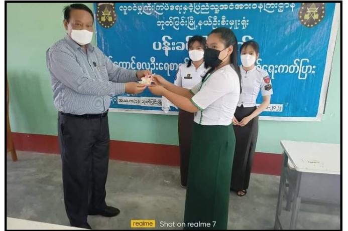
Boke Pyin township