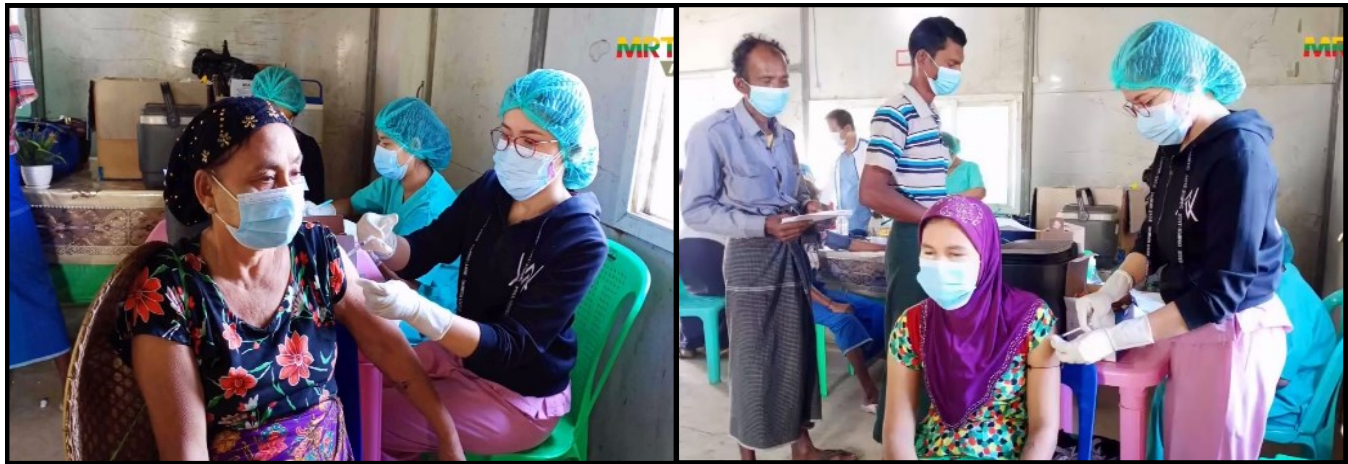
People from Kyauktalone IDP camp in Kyauk Phyu township of Rakhine state vaccinated against COVID-19