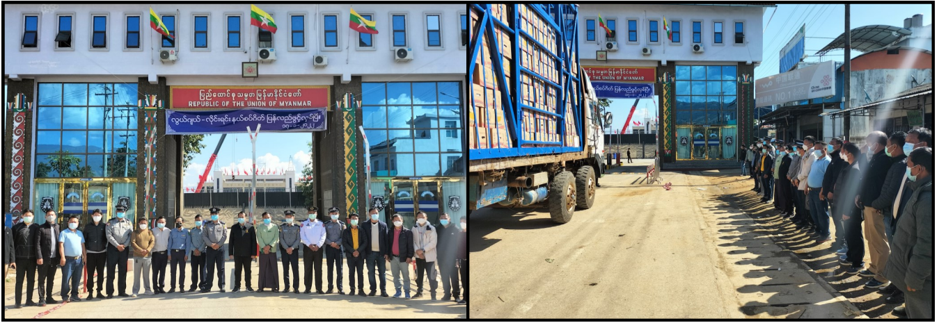
The resumption of bilateral trade after opening Lwegel-Lainyim border trade post