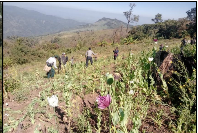
Photos of conducting anti-narcotic operation in Ngape township

The State Administration Council has highly emphasized the anti-narcotic drug measures to eradicate the grave perils of narcotic drugs which is endangering the entire human race. In this regard: