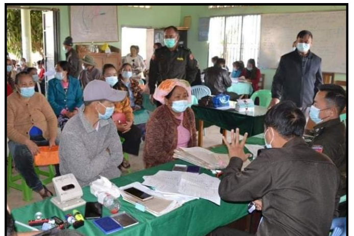
Mong Ye township