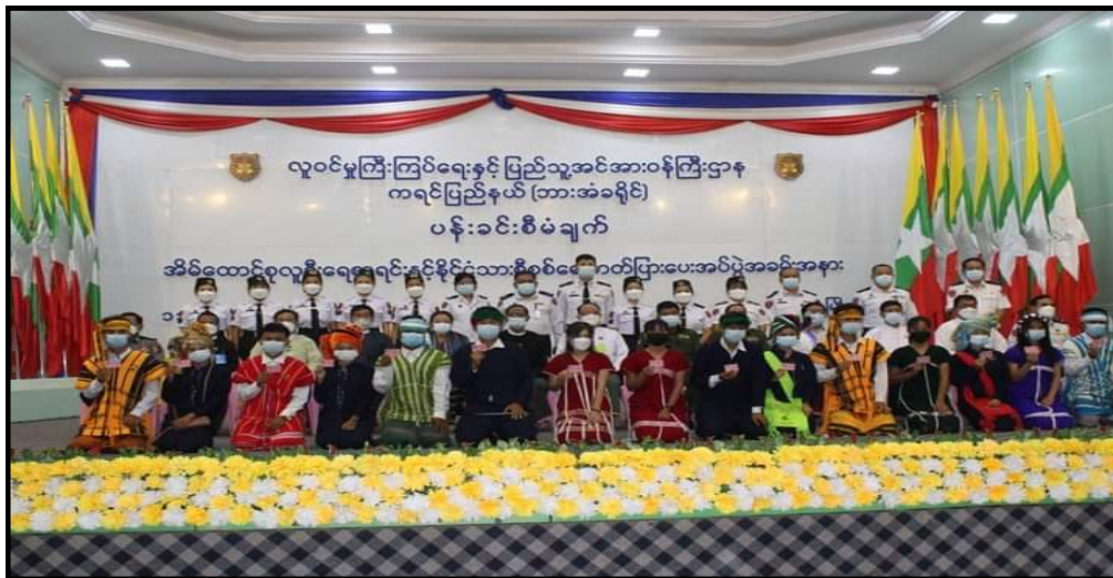
Granting CSCs under “Pankhin” project in Pha-An township