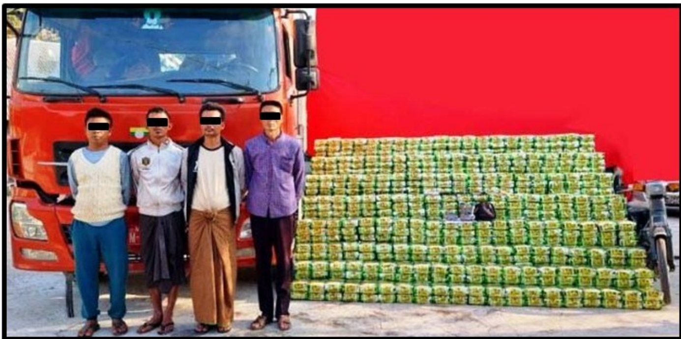
Seizures of ICE (crystal meth) worth of K19.8 billion in Kyaukse township of Mandalay region