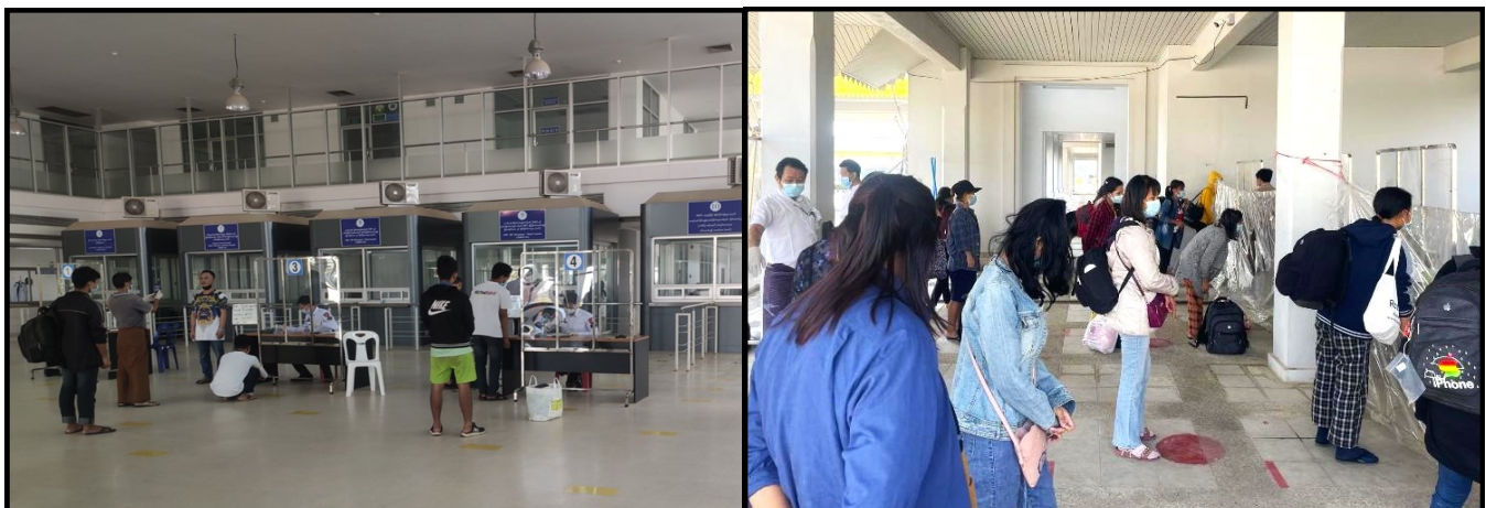
Systematically welcoming the returnees from abroad