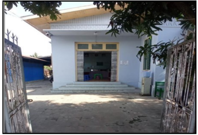
The jewellery shop where the terrorists robbed