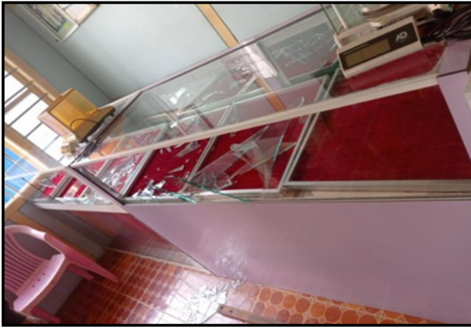
The counter in jewellery shop damaged in the gun attack of terrorist