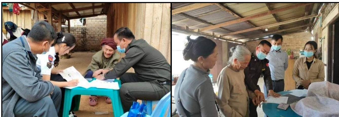
Granting CSCs under “Pankhin” project in Tangyan township