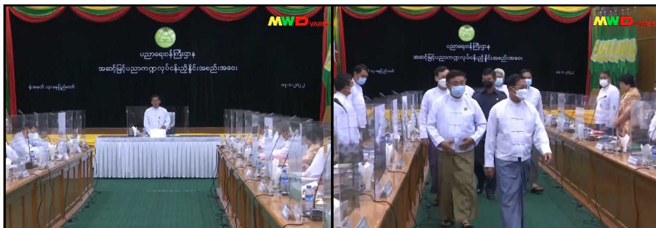
The Chairman of State Administration Council Prime Minister delivering an address at the coordination meeting on higher education sector