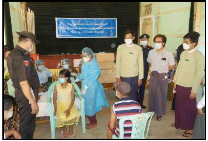
Students vaccinated against COVID-19 in Katha township