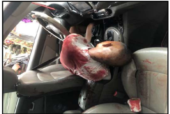
Terrorists attacked on an innocent civilian at the corner of Insein road and Station road in No (9) ward of Hline township using small firearm