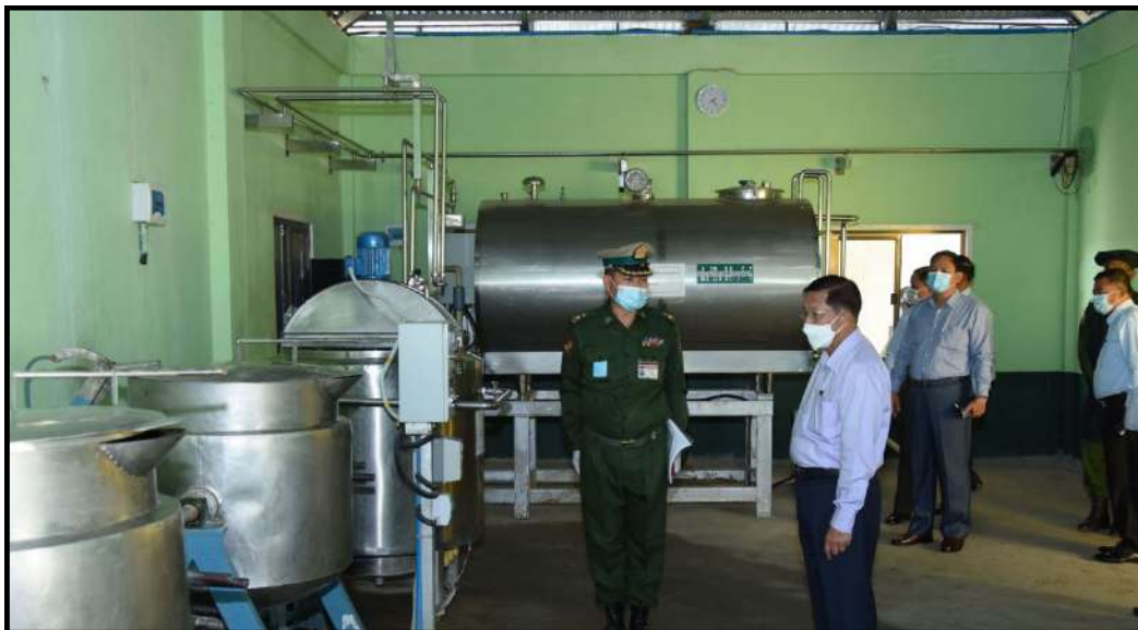
The Chairman of the SAC Commander-in-Chief of Defence Services Senior General Min Aung Hlaing inspecting the activities in the Dairy Cow Breeding Project (Htonbo)