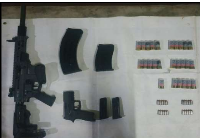
Weapons and ammunition seized at Dagon Myothit (South) township