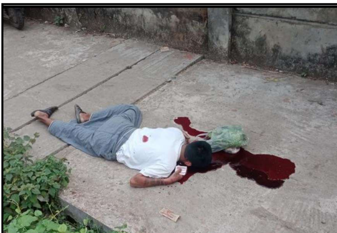
Terrorist attacked on a police force member in No (5) ward of Hline township using gun