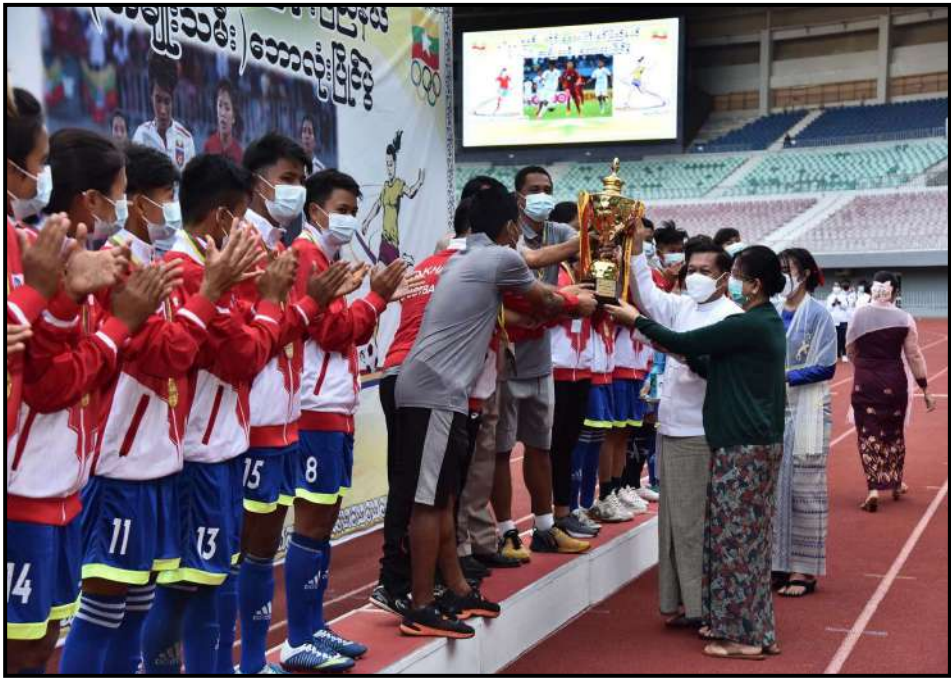
Photos of the Officials Presenting Cash Award at the Prize Presentation Ceremony for the Inter-State/Region U-25 Women’s Football Tournament in 2022