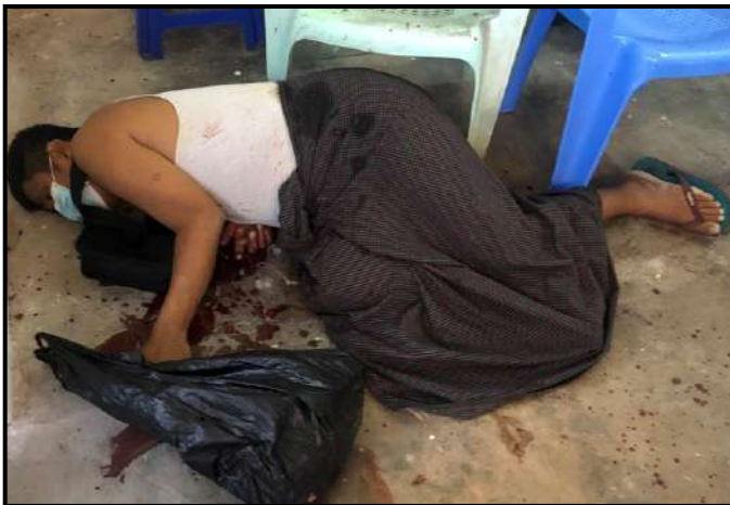
Terrorists attacked on a security force member from OTS (Hmawbi) using small firearm