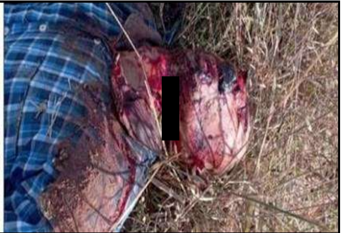
U Kyaw San Win (dead)