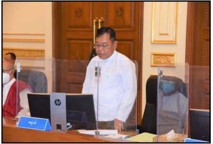
SAC members Lt-Gen Moe Myint Tun and Lt-Gen Soe Htut presenting at the scene

ment has opened schools. As for job opportunities, there are many sectors that can create job opportunities such as agriculture and livestock breeding sectors. We have been repeatedly urging, encouraging and educating people to carry out agriculture and livestock breeding tasks systematically. Government departments are also offering leadership. However, people who are required to exert efforts are themselves.