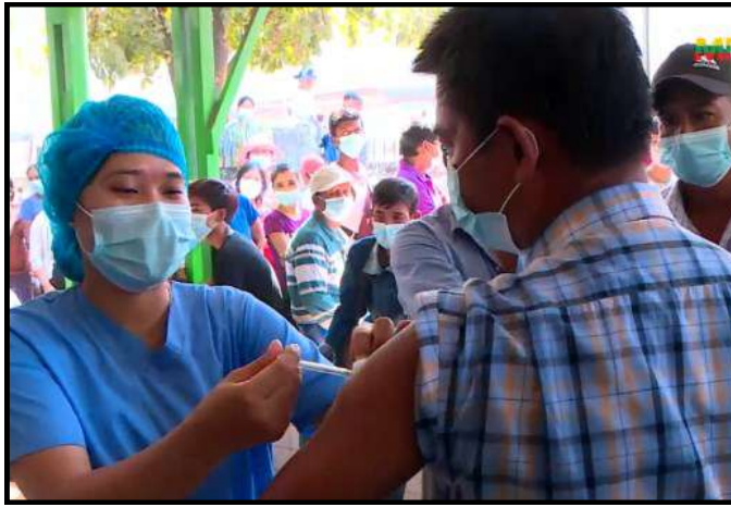
Vaccinating against COVID-19 using Sputnik Light vaccines received from Russia as a gesture of bilateral friendship