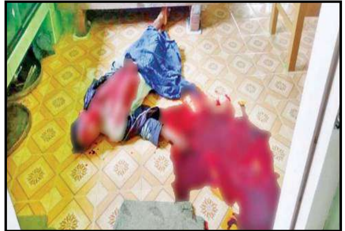
Headmistress and her husband died due to the gun attack of terrorists in Taze township

Political extremists and terrorists who do not want the opening of schools and peaceful learning of the children are committing brutal killings and threats against teachers, in addition to bombing and attacking education infrastructure across the country using grenades, homemade mines and small arms.