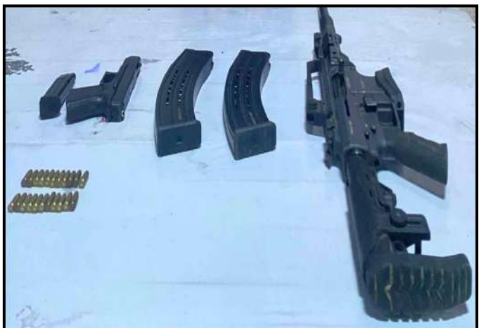
Weapons and ammunition seized in No (6) ward at Zabuuthiri (8) road in Thakayta township