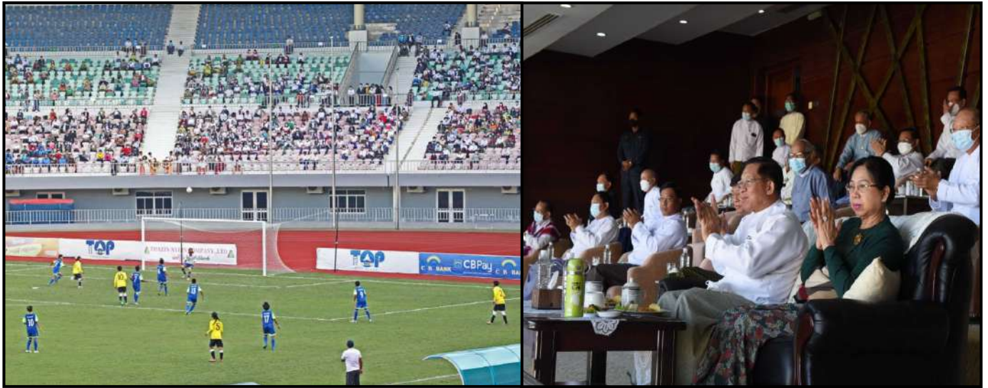
The Chairman of the SAC Prime Minister Senior General Min Aung Hlaing and wife Daw Kyu Kyu Hla watching the final match of the Inter-State/Region U-25 Women's Football Tournament

The final football and prize-giving ceremony of Region and State U-25 women's football match organized by the Sports and Physical Education Department of the Ministry of Sports and Youth Affairs was held at Wunnatheikdi Stadium in Nay Pyi Taw on 21 January and attended by Chairman of State Administration Council Prime Minister Senior General Min Aung Hlaing and wife Daw Kyu Kyu Hla.