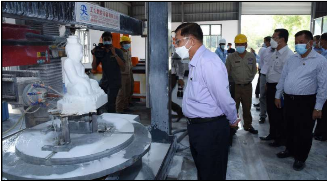
The Chairman of the SAC Commander-in-Chief of Defence Services Senior General Min Aung Hlaing inspecting the production of Buddha Images and statues with the use of CNC machines at Marble Tile Factory (Mandalay)