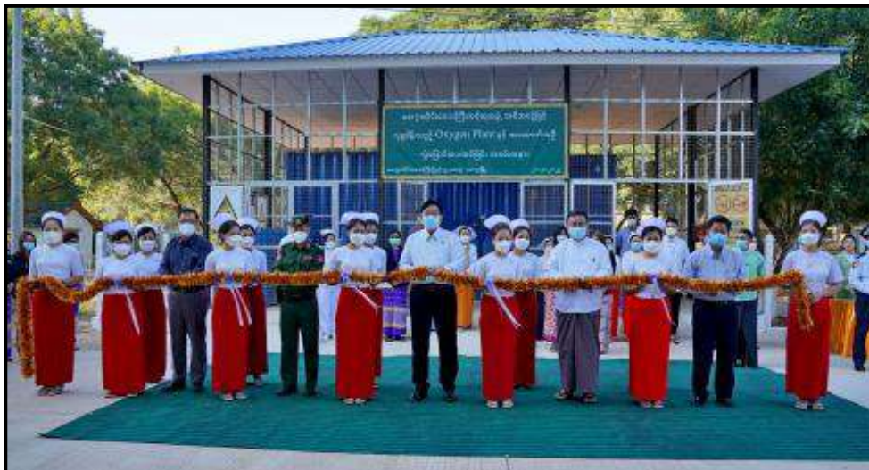
Holding the handing over ceremony of oxygen plant and building donated under the arrangement of Magway Region Government at the public hospital of Magway region

COVID-19 prevention, control and treatment activities such as opening quarantine centres and vaccinating people against COVID-19 continue in respective regions and states.