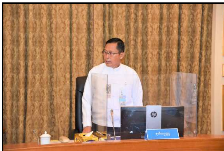
Vice-Chairman of the State Administration Council Deputy Prime Minister Vice-Senior General Soe Win presenting at the scene

ed efforts must be made for 100 percent development of the education sector. The government has reopened universities and is trying to increase the attendance rate.