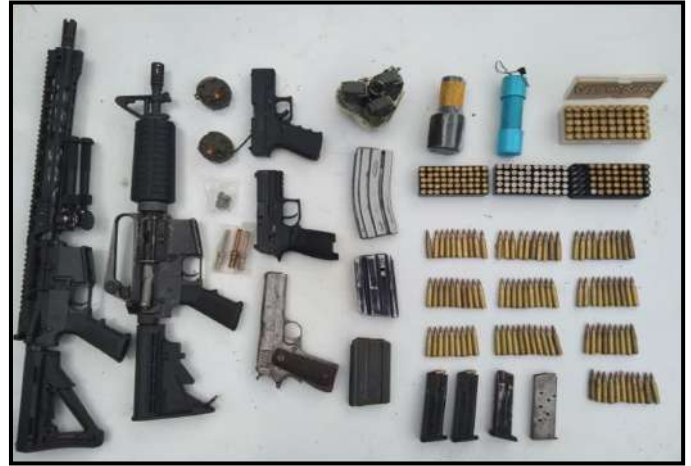
Weapons and ammunition seized in the compound of bus station of road transportation in Waibagi Myothit of North Okkalapa township