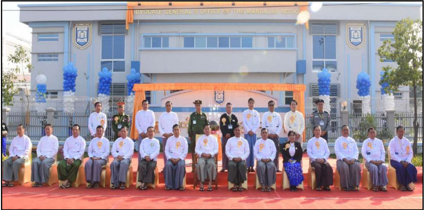
The Chairman of the SAC Prime Minister Senior General Min Aung Hlaing taking documentary photo at the inauguration event of the Advocate-General Office of the Mandalay region