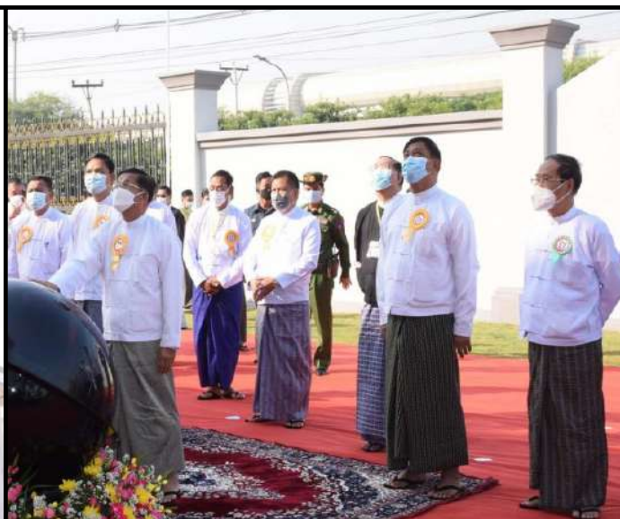
The Chairman of the SAC Prime Minister Senior General Min Aung Hlaing pressing the button to open the new High Court Building