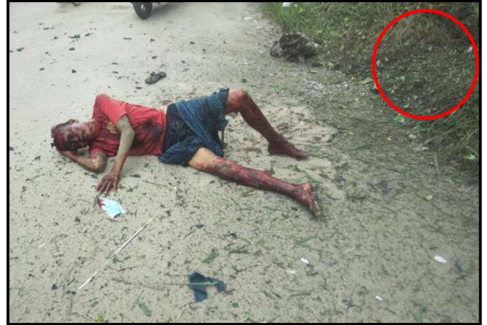
An innocent civilian dead due to the homemade bomb explosion near “Kabarthis” fuel station between Yoe Gyi and Yoe Lay villages in Htantabin township