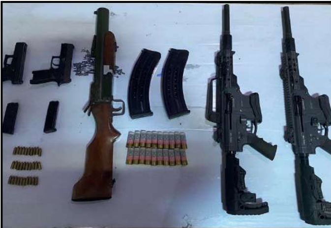
Weapons and ammunition seized at Panhlaing housing in Kyimyindaing township