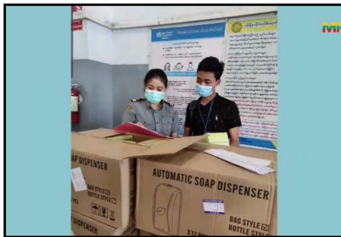
Custom department inspecting and issuing COVID-19 prevention equipment