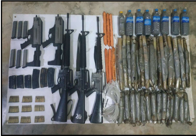
Weapons and ammunition seized in No (10) South ward of Thakayta township