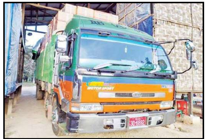
Importation of COVID-19 prevention equipment by vehicles through border gates