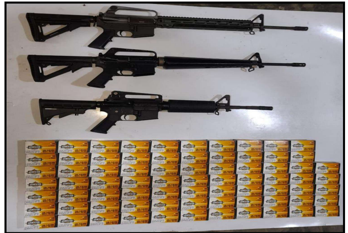
Weapons and ammunition seized in No (6) ward of South Okkalapa township