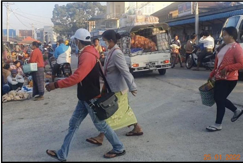
People working regularly in front of Baho market in Loikaw township of Kayah state

Local people, fleeing to safer places from the clashes in Loikaw Township and surrounding villages, are returning to their respective places as peace and stability of the area become better. The number of local residents returning to their respective places in Kayah state is as follows: