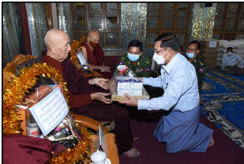
The Chairman of the State Administration Council Prime Minister Senior General Min Aung Hlaing presenting offertories to Sanghas in Maha Wizitayon Monastery