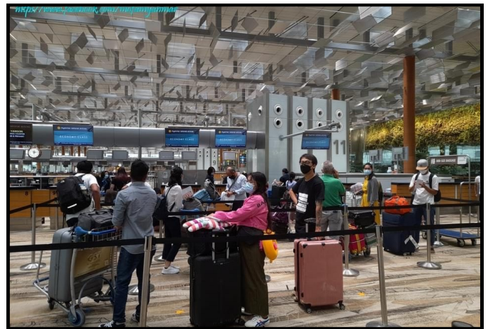
Myanmar nationals at Singapore returning home with 88 th relief flight.