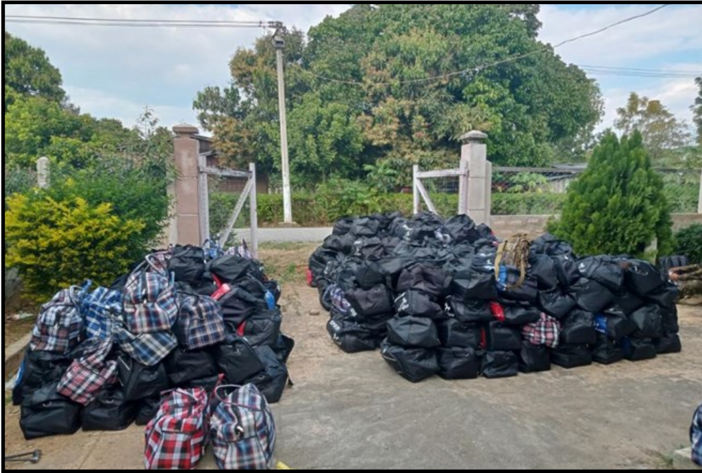
Handbags which will be supported to so-called PDF terrorists seized inside a building of Brdoe village

NUG, CRPH and PDF terrorists are committing terrorist attacks on the airport and prison in Loikaw township of Kayah state and also against security forces, using people as human shields. Therefore, security forces are undertaking necessary tasks for security and stability in Kayah state.