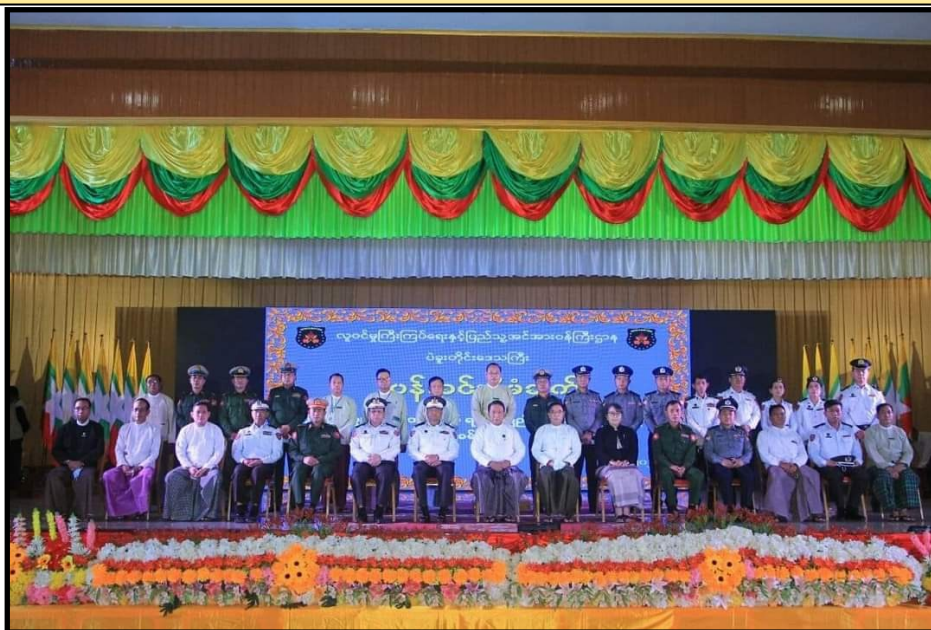
Holding the successful ceremony of “Pankhin” project in Bago township

The State Administration Council has implemented the Pankhin Project since 3 May 2021. Under the project, measures are being taken to grant citizenship identification cards for over 3.8 million people.