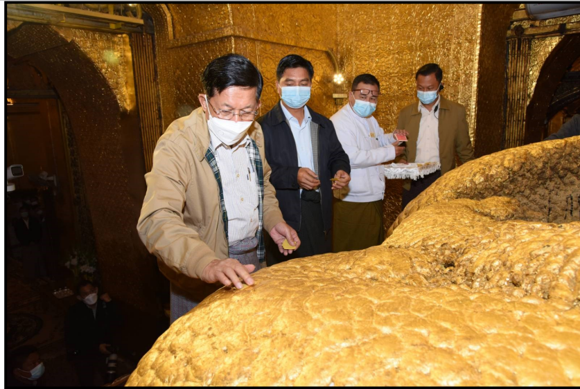
The Chairman of the State Administration Council Prime Minister Senior General Min Aung Hlaing offering gold foils to Maha Muni Buddha Image

The Chairman of the State Administration Council (SAC) Prime Minister Senior General Min Aung Hlaing and party visited Maha Wizitayon monastery in Chanayethazan township in Mandalay region, and paid homage to the Hsutaungpyaw Pagoda on Mandalay Hill, and Maha Muni Buddha Image in Chanmyathazi township of Mandalay region on 23 and 24 January as follows: