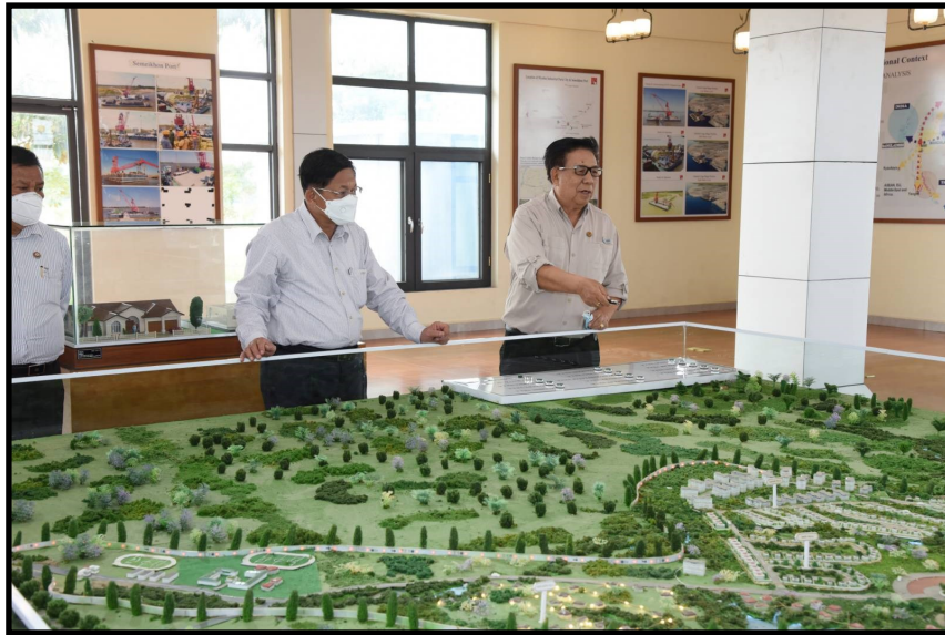
The Chairman of the State Administration Council Prime Minister Senior General Min Aung Hlaing hearing the reports on the implementation of Mandalay-Myotha Industrial Park City Construction made by the project chairperson

The Chairman of the SAC Prime Minister inspected the matters relating to the creation of job opportunities by inviting investment in the industrial zone, and man-