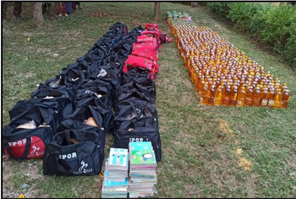
Foodstuff and consumer goods which will be supported to so-called PDF terrorists seized inside a building of Brdoo village