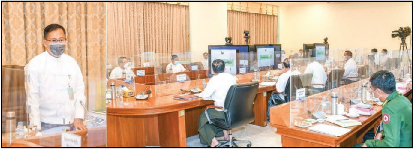
Chairman of the Central Committee on Organizing the Diamond Union Day Vice-Chairman of the State Administration Council Deputy Prime Minister Vice-Senior General Soe Win delivering an address at the second coordination meeting of the Central Committee on Organizing the 75 th anniversary of Diamond Jubilee Union Day

the conveyance of the Union Flag, which has been staying at the Yangon City Hall since 2016, from Yangon to Nay Pyi Taw.