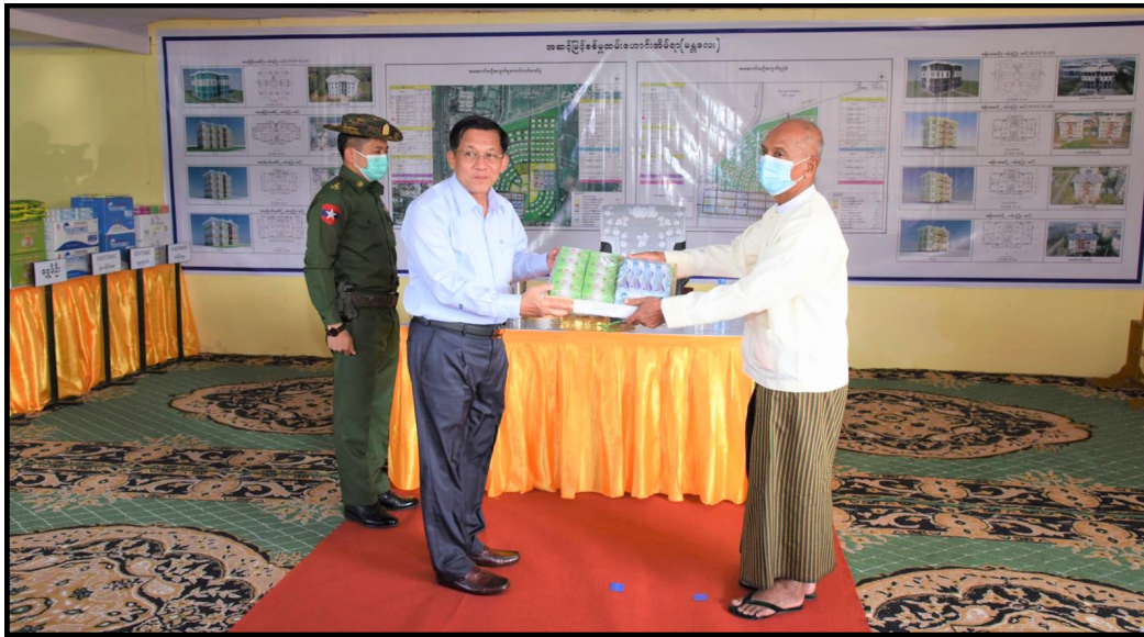
The Chairman of the State Administration Council Commander-in-Chief of Defence Services Senior General Min Aung Hlaing presenting rice, cooking oil and foodstuff produced by Tatmadaw factory for war veterans and families