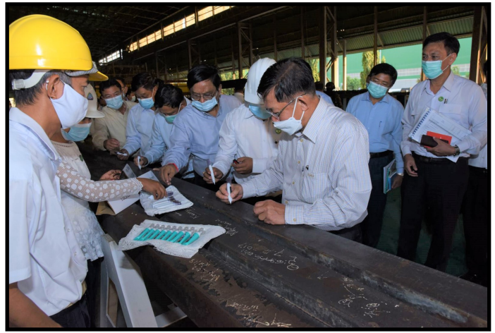
The Chairman of the State Administration Council Prime Minister Senior General Min Aung Hlaing inspecting the working activities in the No (1) Steel Mill (Myingyan)