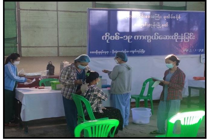
Vaccinating local people against COVID-19 in Kyaung Kone township