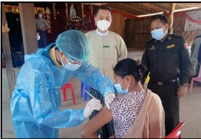
People taking shelter at IDP camp in N Jang Yang vaccinated against COVID-19