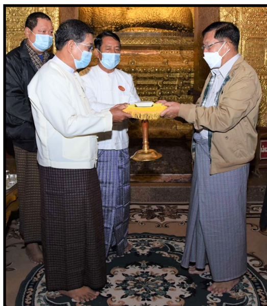
State Administration Chairman Prime Minister Senior General Min Aung Hlaing offering donation cash to the Maha Muni Buddha Image