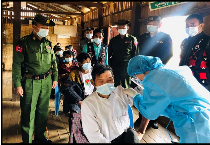
Vaccinating elders and locals against COVID-19 in Hkamti township