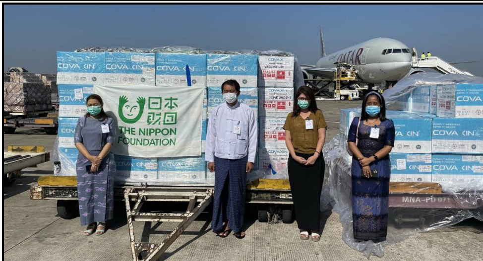
Arrival of COVID-19 vaccines donated by Nippon Foundation of Japan

As the vaccination process is a major task in undertaking COVID-19 prevention and control activities, the Ministry of Health is emphasizing the measures of COVID-19 vaccination in regions and states during the tenure of State Administration Council. COVID-19 vaccines are being given daily