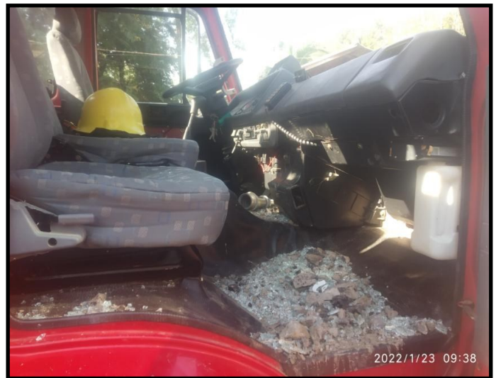
Fire fighting vehicle destroyed due to the mine blasts of so-called PDF terrorists

of the vehicle and shrapnel wounds in a fire-fighter's nose and right arm, who is now being received medical treatment in the Budalin Public Hospital.