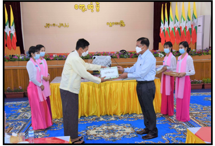
The Chairman of the State Administration Council Prime Minister Senior General Min Aung Hlaing providing gifts and funds for the religious organizations in Mandalay

ernments which cannot manage development of the countries face various problems. Those who could develop the countries can take support of the people. Hence, efforts are being made for development of the nation.