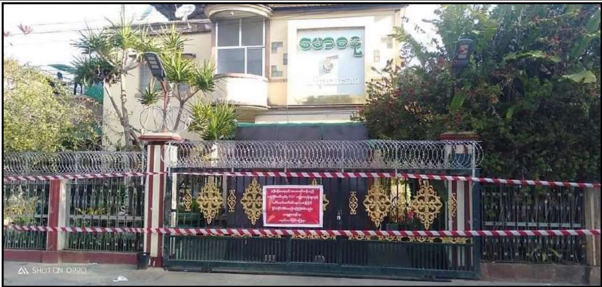
The restaurant which followed and made incitements and propaganda of CRPH and NUG terrorist groups, their subordinates and colluded groups taken action under the law

CRPH and NUG, which were declared terrorist groups, their subordinates and colluded groups and persons are intentionally making incitements, propaganda and threats to destroy the stability of the State and administrative machinery with the public fear using various ways.