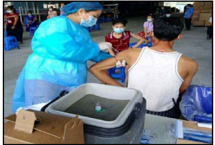
COVID-19 vaccination processes using Sputnik Light received from Russian Federation and Covaxin donated by Indian government as a gesture of bilateral friendship