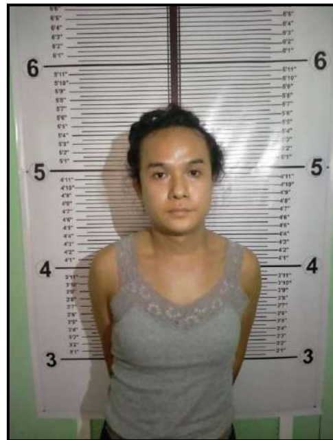
The arrest of a person who followed and made incitements and propaganda of CRPH and NUG terrorist groups, their subordinates and colluded groups