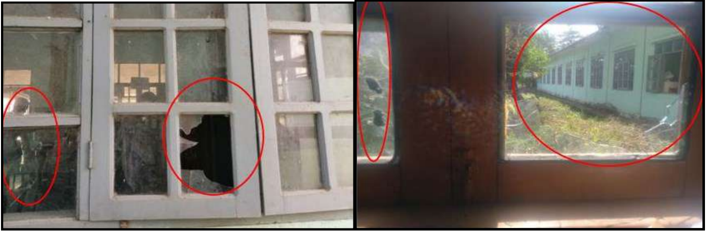
Photos of the terrorists broke down the windows of the office of the principal of No (4) BEHS in Dagon Myothit (East)