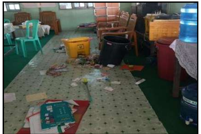
Photo of the terrorists destroyed the principal's office of No (1) BEPS in Dagon Myothit (East) township

Security forces are reportedly taking necessary measures to ensure students can peacefully study at schools and arrest and take legal action against the terrorists as early as possible.