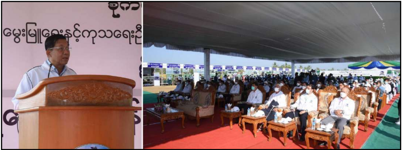
The Chairman of the State Administration Council Prime Minister delivering an address at Livestock Show and Contest to mark 75 th Diamond Jubilee Union Day

The Chairman of the SAC Prime Minister and attendees observed the display of cows, buffalos, sheep and goats in the contest, booths of companies, feedstuffs, medicines, machinery and value-added products related to the livestock breeding sector and asked for further information.