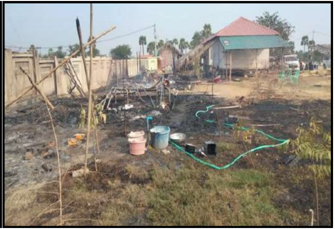
The damages of Sitagu Chindwin Thar Ma Nay Kyaw Buddhist Academy in Yinmarbin township in the aftermath of PDF terrorists for no reasons