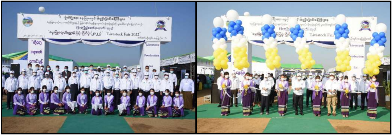
The Chairman of the State Administration Council Prime Minister attending the opening ceremony of the Livestock Show and Contest, and taking a memorable photo with the attendees

country with food sufficiency and socio-economic development in line with the policy of the government.