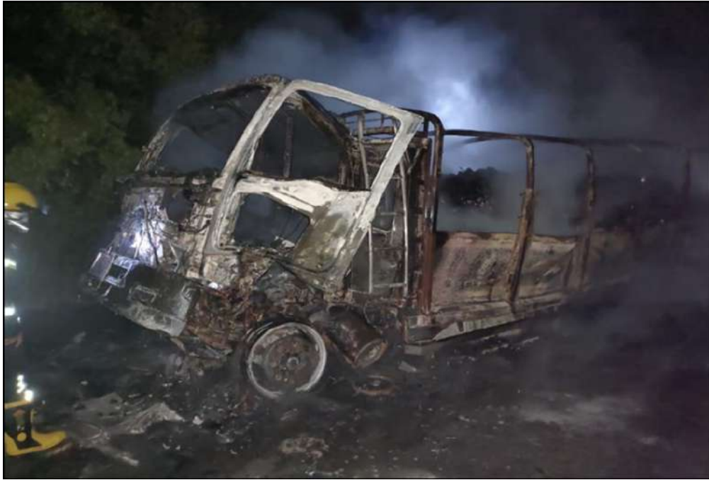
A truck damaged in the aftermath of arson attack of terrorists in Kawkareik township of Kayin state

PDF terrorists are committing the nefarious crimes of abducting and killing innocent civilians and also blowing up, shooting and setting fire on the fire-trucks and vehicles of social philanthropic associations and cargo trucks. In this regard,