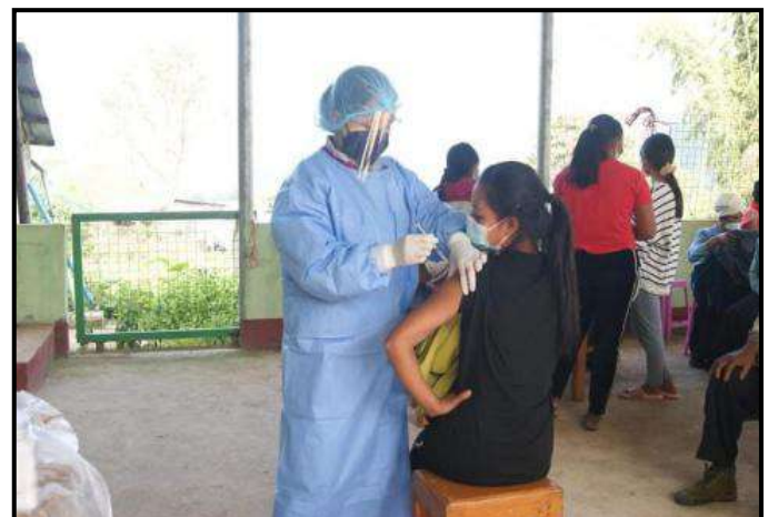
COVID-19 inoculation continue in respective regions and states