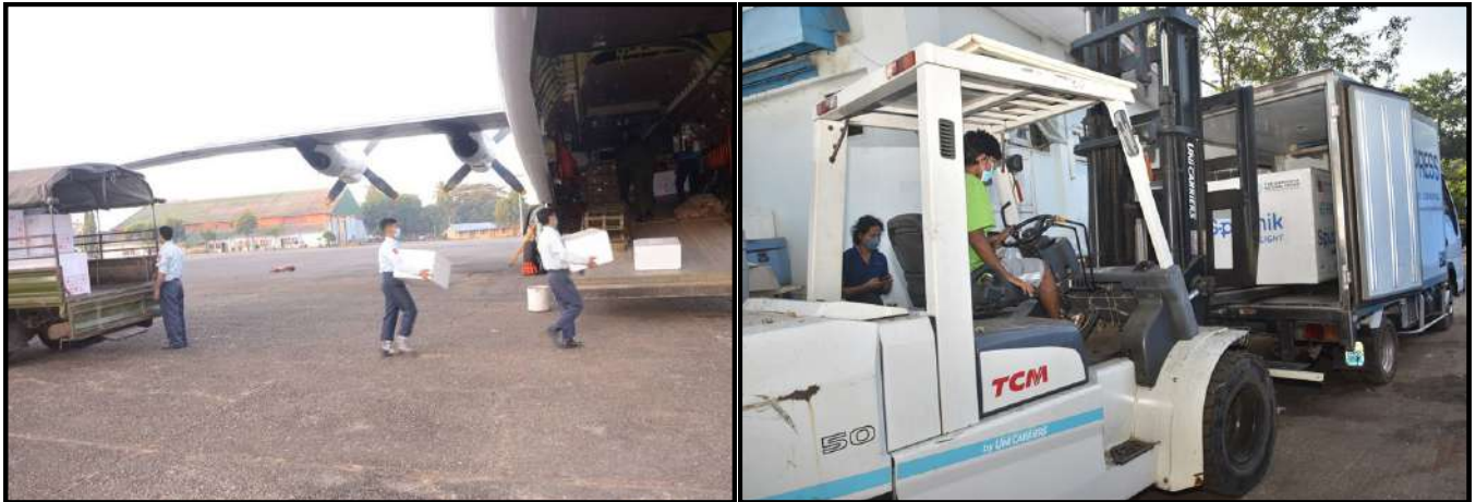
Distribution of COVID-19 vaccines by military aircraft and Cold Chain Delivery Logistics vehicles to respective regions and states

COVID-19 prevention, control and treatment activities such as opening quarantine centres and vaccinating people against COVID-19 continue in respective regions and states.