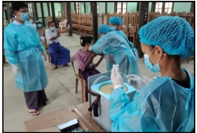
Vaccinating people against COVID-19 in Myinmu township