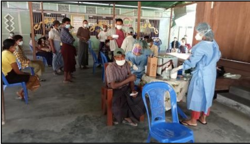
Vaccinating people aged 18 years and above against COVID-19 in Shwedaung township

COVID-19 prevention, control and treatment activities such as opening quarantine centres and vaccinating people against COVID-19 continue in respective regions and states.