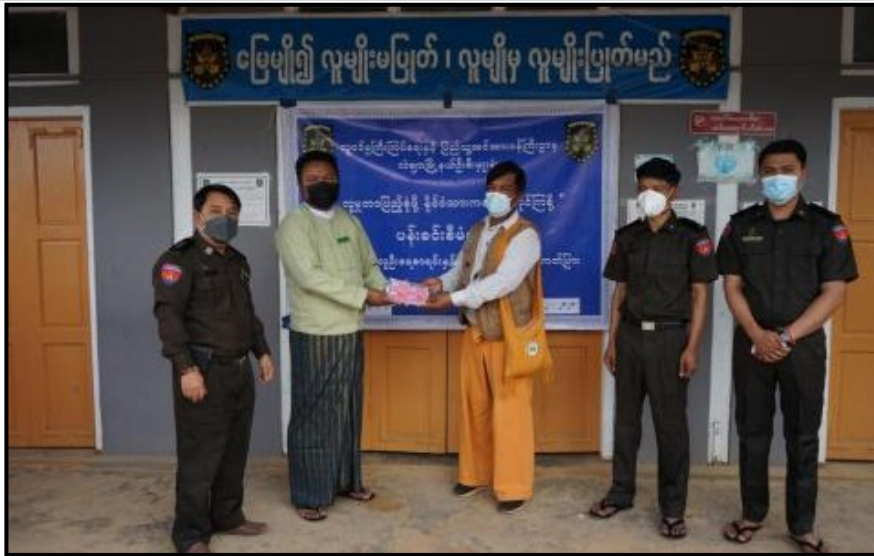
Granting Citizenship Scrutiny Cards in Lachar township

The State Administration Council has implemented the Pankhin Project since 3 May 2021. Under the project, measures are being taken to issue citizenship identification cards for over 3.8 million people.