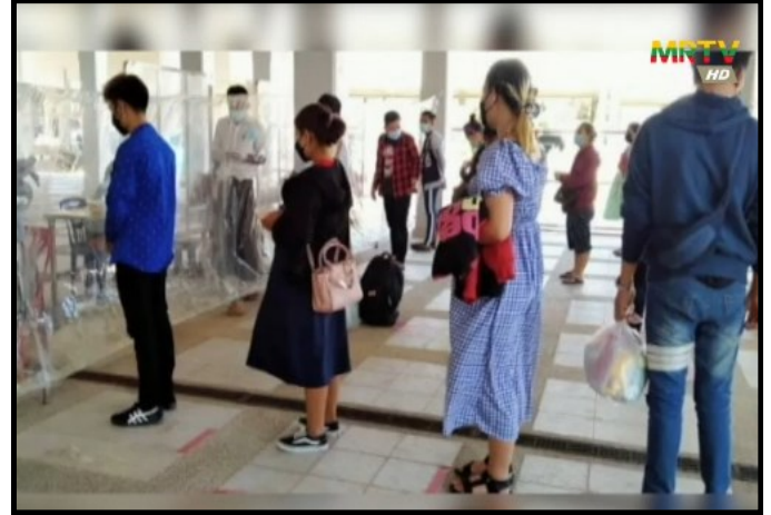
Officials systematically welcoming returnees from respective border gates

Officials continue to welcome Myanmar nationals who returned from abroad at various border crossings and the following returnees were welcomed from 26 December 2021 to 2 January 2022: