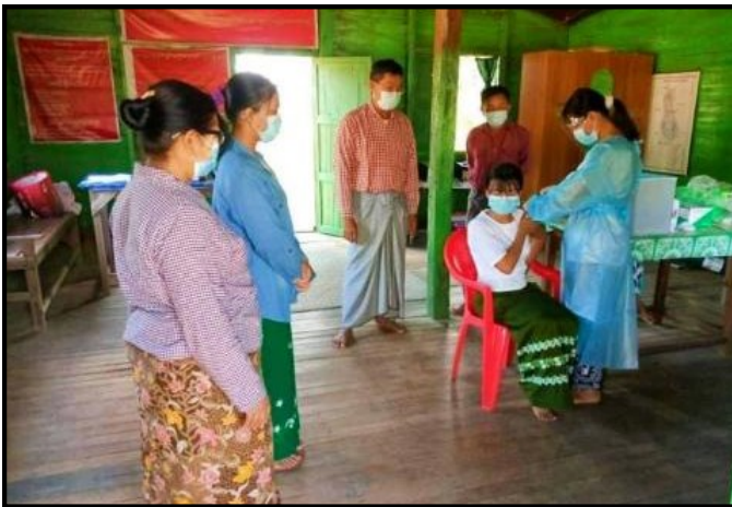
Vaccinating students against COVID-19 in Minhla township