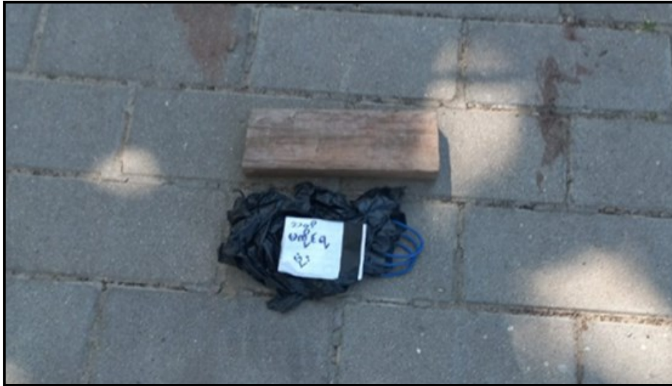
Confiscated homemade mine planted by terrorists

terrorists are conducting bombing attacks near the schools to deteriorate the peaceful learning of the students there. Therefore, the parents are worrying on the violent actions of the terrorists and willing the safe and peaceful study of their children at schools.