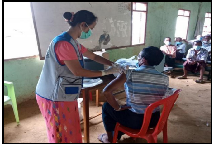
Vaccinating local people against COVID-19 in Myaebon township