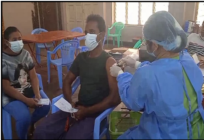
Vaccinating local people against COVID-19 in Mon state