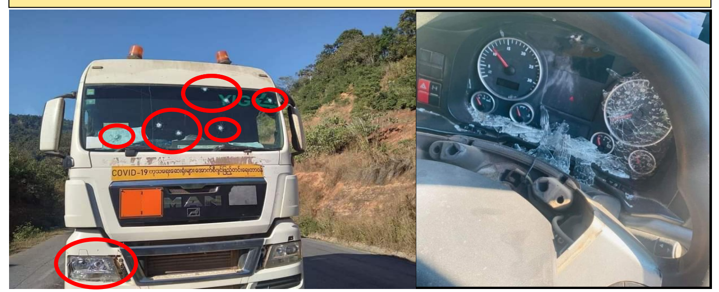
The vehicle carrying liquid oxygen damaged in the attack of terrorists without any reasons

The KNLA group and so-called PDF terrorist groups attacked for no reason on a tanker containing 20 ton of liquid-oxygen imported from Thailand, at about 2000 metres to the northwest of Apyin Kwin Kalay Village of Myawady Township while the tanker was leaving Myawady for Yangon on 3 January. U Zaya and U Aung Gyi, the driver and his conductor, got serious gunshot wounds during the attack.