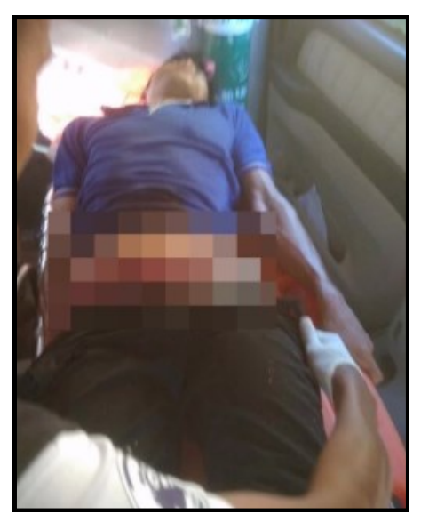
Conductor U Aung Gyi

The KNLA group and so-called PDF terrorist groups are committing such attacks disregarding the humanitarian grounds while the government is making efforts not to have oxygen requirement in public health sector during the COVID-19 outbreak. The civilians are condemning such terrorist acts of the KNLA and PDF terrorist groups who