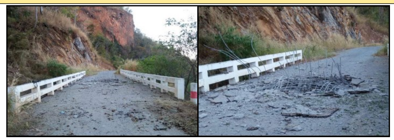
Photo of RC bridge in Shadaw township of Kayah state inflicted in the mine blast of terrorists

A combined group comprising KNPP members and so-called PDF terrorists blew up a 60-foot-long reinforced concrete bridge near the milepost of 39 kilometer on Shadaw-Loikaw road in Shadaw township on 2 January. The explosion left an eight-foot-wide collapse in the middle part of the bridge floor deck.