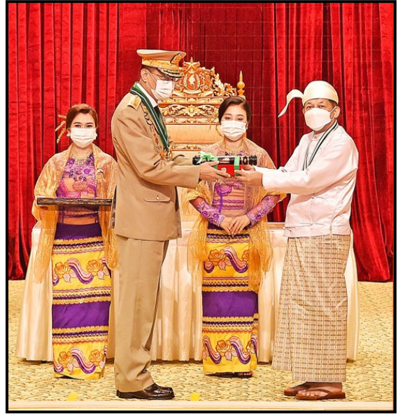
Chairman of the State Administration Council Prime Minister Senior General Maha Thray Sithu Min Aung Hlaing conferring honorary titles on winners