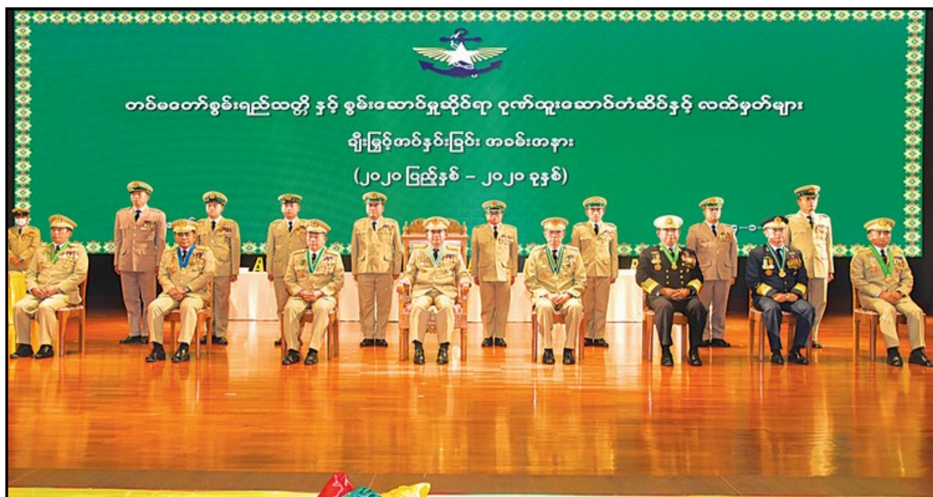
The Chairman of the State Administration Council Commander-in-Chief of Defence Services Senior General Maha Thray Sithu Min Aung Hlaing and members taking documentary photo together with the officers, other ranks and inheritors who accepted military gallantry and excellent performance medals and certificates

and should try hard to become the good patriotic Tatmadaw members and heroes on whom the State and the people rely in line with the Gambhisara Poem of Shin Maharatthasara.