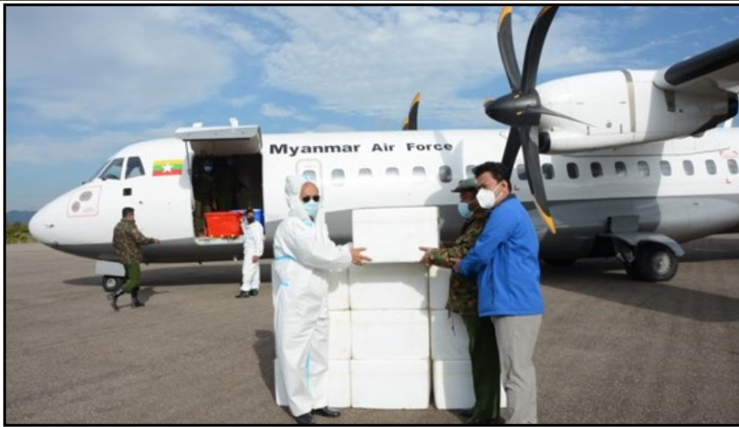
Distributions of COVID-19 vaccines carried by military aircraft to Lashio township

COVID-19 prevention, control and treatment activities such as opening quarantine centres and vaccinating people against COVID-19 continue in respective regions and states.