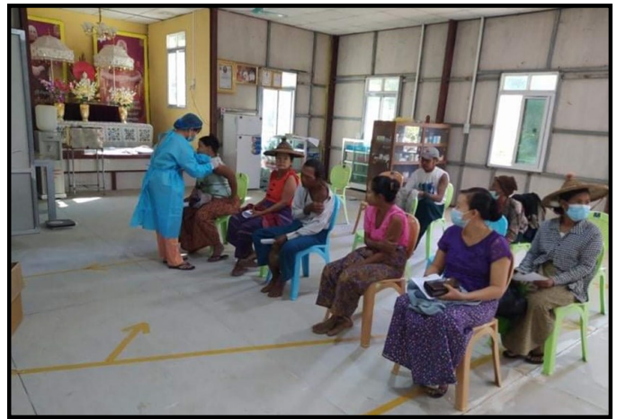
Vaccinating local people against COVID-19 in Laymyatnar township