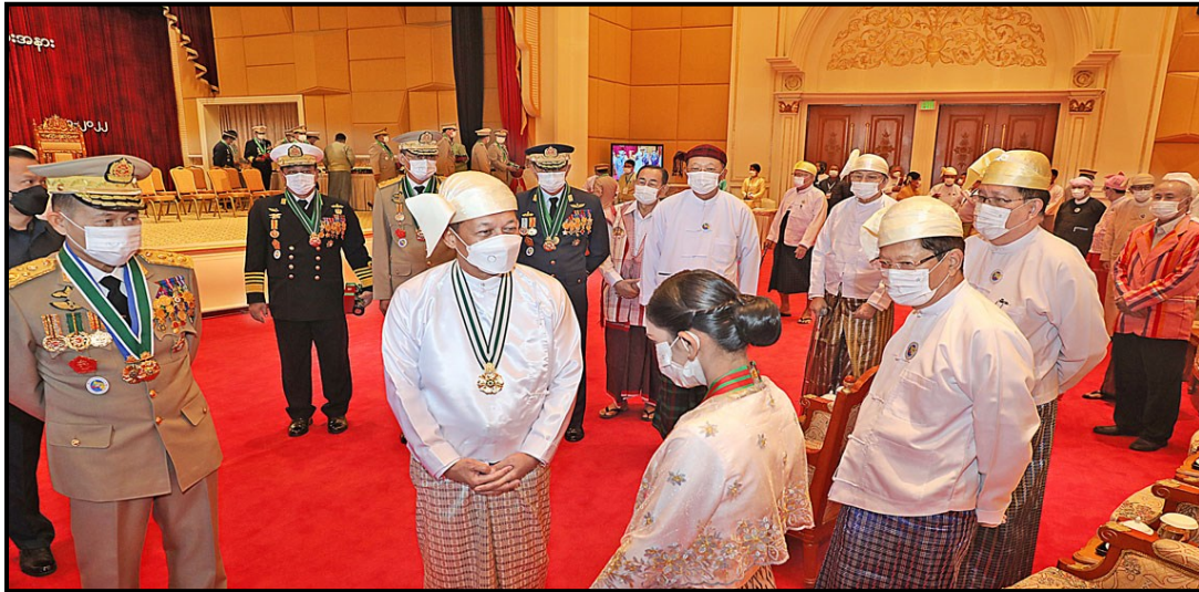
The Chairman of the State Administration Council Prime Minister Senior General Maha Thray Sithu Min Aung Hlaing cordially greeting attendees, title recipients and their families