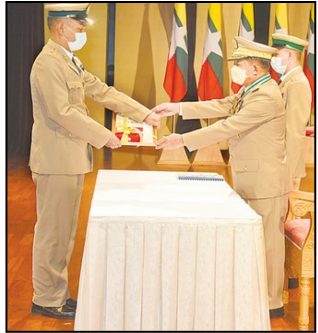
The Chairman of the State Administration Council Commander-in-Chief of Defence Services Senior General Maha Thray Sithu Min Aung Hlaing presenting gallantry medal and certificate to one Major and one Captain

examples that new generation youths and new generation Tatmadaw members would emulate.