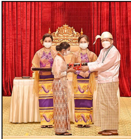
Chairman of the State Administration Council Prime Minister Senior General Maha Thray Sithu Min Aung Hlaing conferring honorary titles on winners