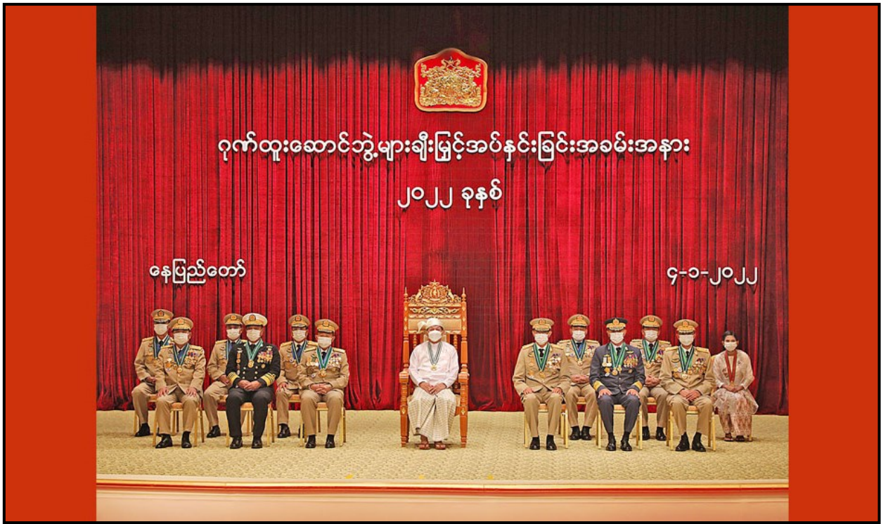
The Chairman of the State Administration Council Prime Minister Senior General Maha Thray Sithu Min Aung Hlaing taking documentary photo together with title recipients and their families