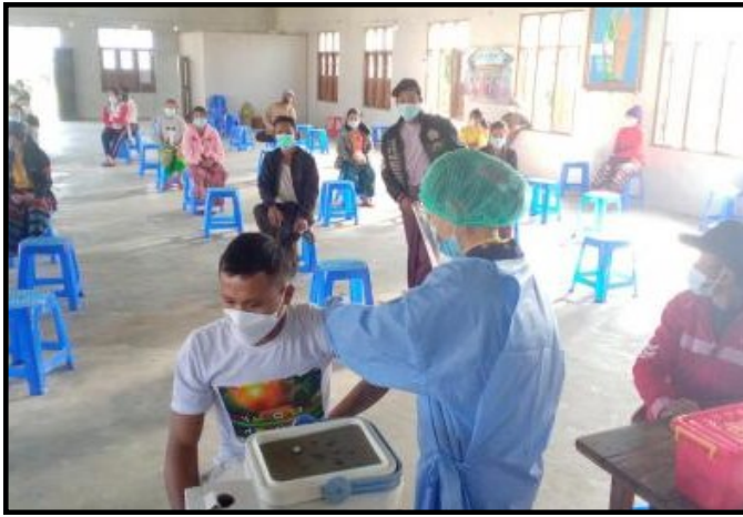
Vaccinating local people against COVID-19 in Mailong township