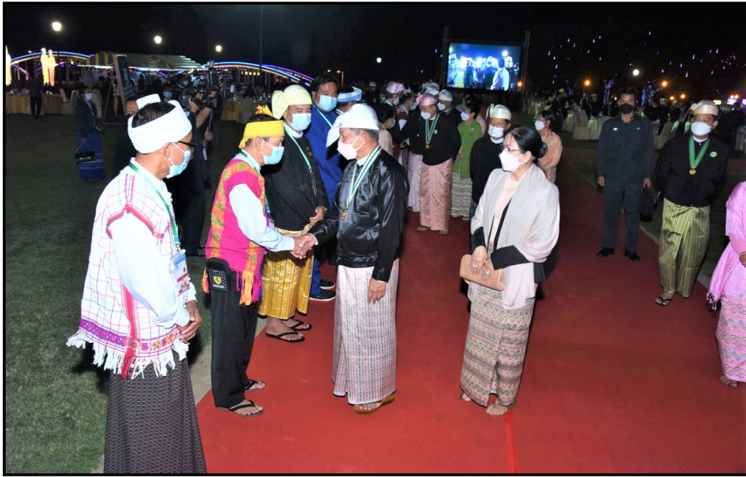
The Chairman of the State Administration Council Prime Minister Senior General Maha Thray Sithu Min Aung Hlaing and spouse Daw Kyu Kyu Hla cordially greeting the persons who attended the ceremony

The dinner in commemoration of the 74 th Anniversary Independence Day hosted by Chairman of the State Administration Council Prime Minister of the Republic of the Union of Myanmar Senior General Min Aung Hlaing and wife Daw Kyu Kyu Hla was held on the lawns of the SAC Chairman's Office in Nay Pyi Taw on 4 January.