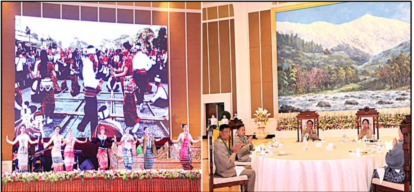
The Chairman of the State Administration Council Commander-in-Chief of Defence Services Senior General Maha Thray Sithu Min Aung Hlaing and spouse Daw Kyu Kyu Hla enjoying the performances of Myawady Entertainment Troupe