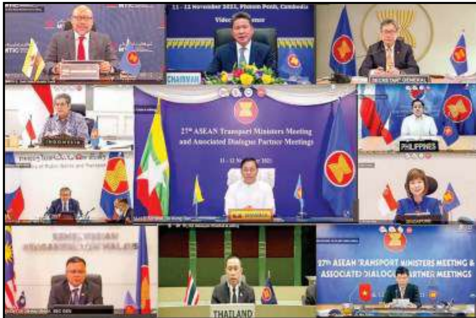
Union Minister Admiral Tin Aung San attending the 27 th ASEAN Transport Ministers Meeting, and Ministerial Meetings among Dialogue Partners

Ministry of Health to support the systematic management of vaccination against COVID-19 in Myanmar was recognized with a Digital Government Award in the 2021 Awards presented by the Asian-Oceanian Computing Industry Organization (ASOCIO) to the Ministry of Health.