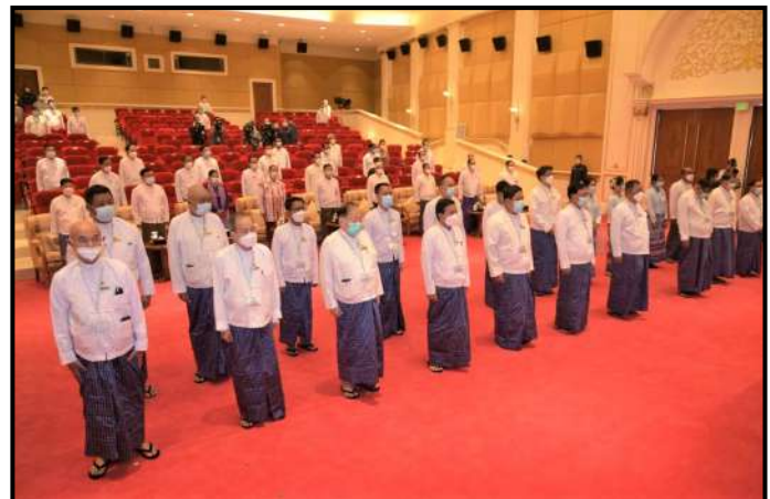
The affirmation ceremony of the members Myanmar Press Council

make provision for the journalists to cover the news freely as well as to enable them to disseminate correct and accurate information to the people.