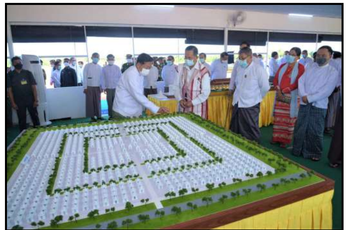
Prime Minister of the State explaining about the carving and establishment of the marble image of the "Mara Vijaya"