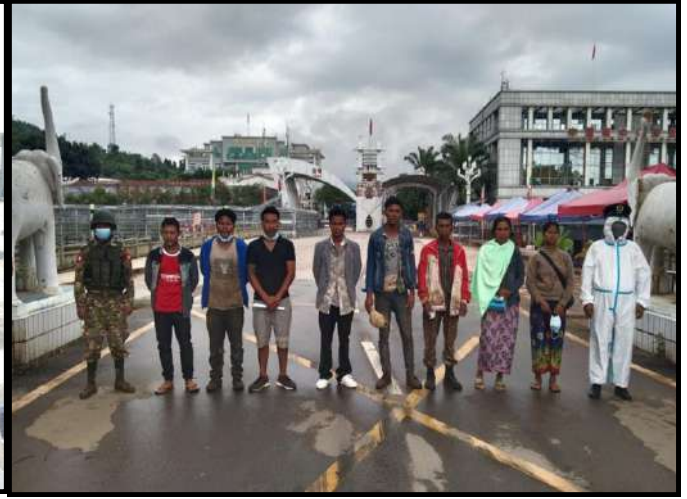
Systematically welcoming Myanmar nationals returned from abroad at respective border gates

such as human rights violations and disproportionate use of force that were based on allegations emanating from groups who themselves are committing terrorist acts in the joint statement.