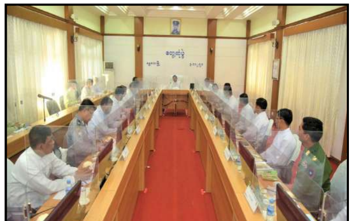
Discussion on development matters in Mandalay region