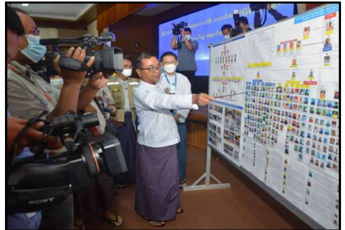
The leader of the Information Team of the State Administration Council explaining acts of terrorism