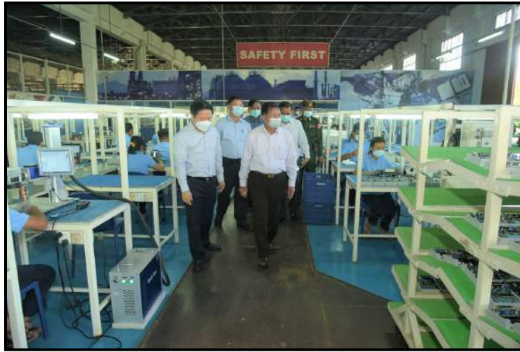
Chairman of the State Administration Council Prime Minister Senior General Min Aung Hlaing inspecting Indagaw Industrial Zone