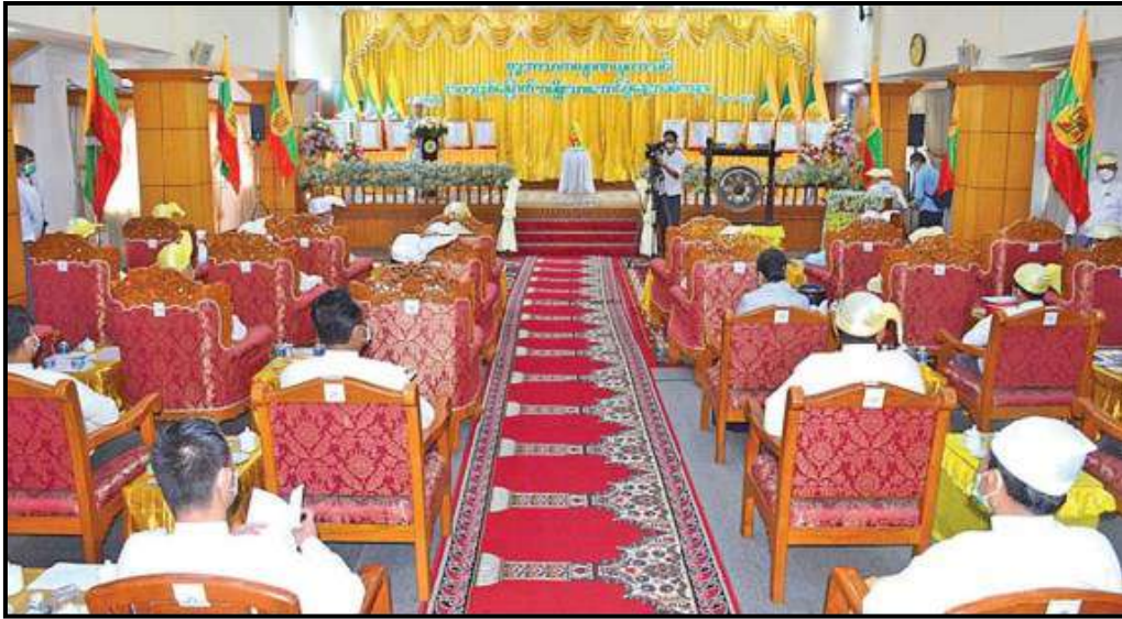
Holding the National Victory Day ceremony organized by the Young Men's Buddhist Association (YMBA)