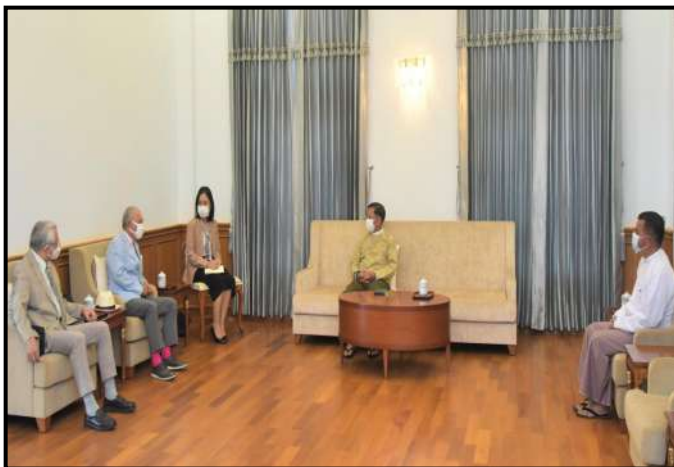
Chairman of the State Administration Council Prime Minister receiving Special Envoy of the Government of Japan for National Reconciliation in Myanmar and Chairman of the Nippon Foundation