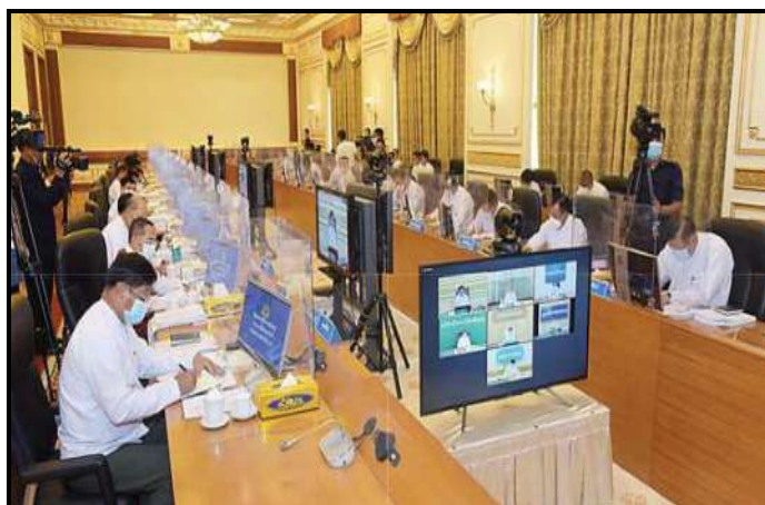
Holding the 6/2021 meeting of the Security, Peace and Stability and Rule of Law Committee of the Republic of the Union of Myanmar