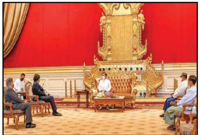
Chairman of the State Administration Council Prime Minister receiving Former Governor of New Mexico of the United States of America