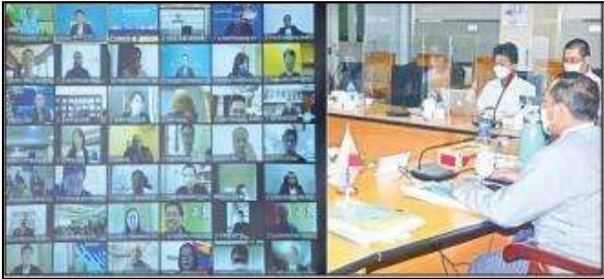
Myanmar delegation members participating in the Fourth World Media Summit