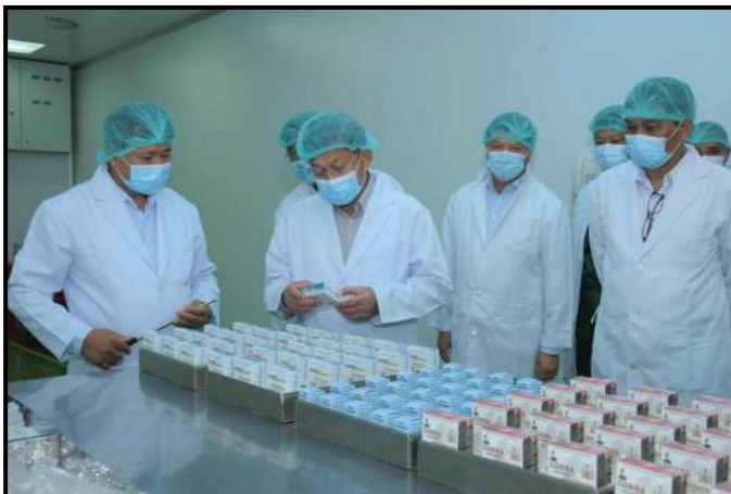
Prime Minister of the State inspecting Myanmar Pharmaceuticals Factory

ty and to sell quality products at fair prices.