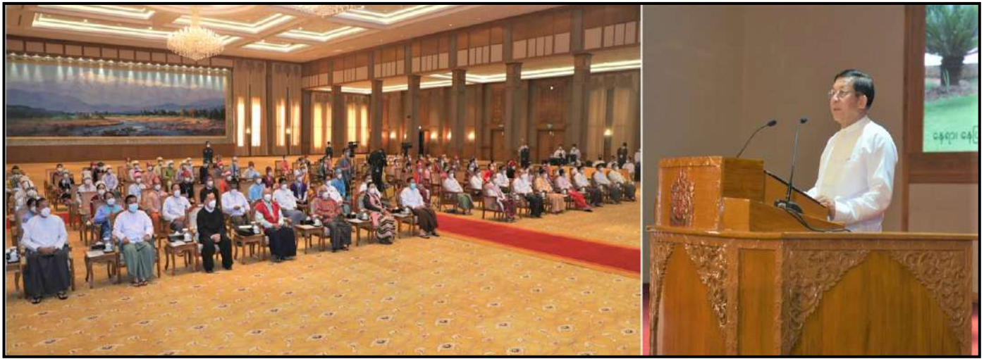
Chairman of the State Administration Council Prime Minister Senior General Min Aung Hlaing meeting with students who had completed the five-year Bachelor of Education Degree Course no. (4) of the University for Development of National Races

ment of National Races and urged them to nurture the ethnic youths to become the human resources which can be relied by the country.