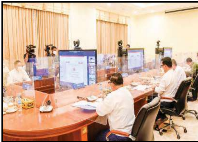
Holding the second coordination meeting of the Central Committee for the organization of the 74 th Anniversary of Independence Day