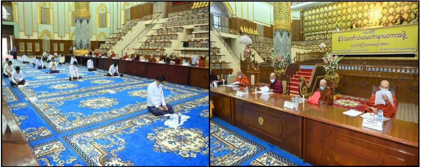
Holding 47 members eighth State Sangha Maha Nayaka Group