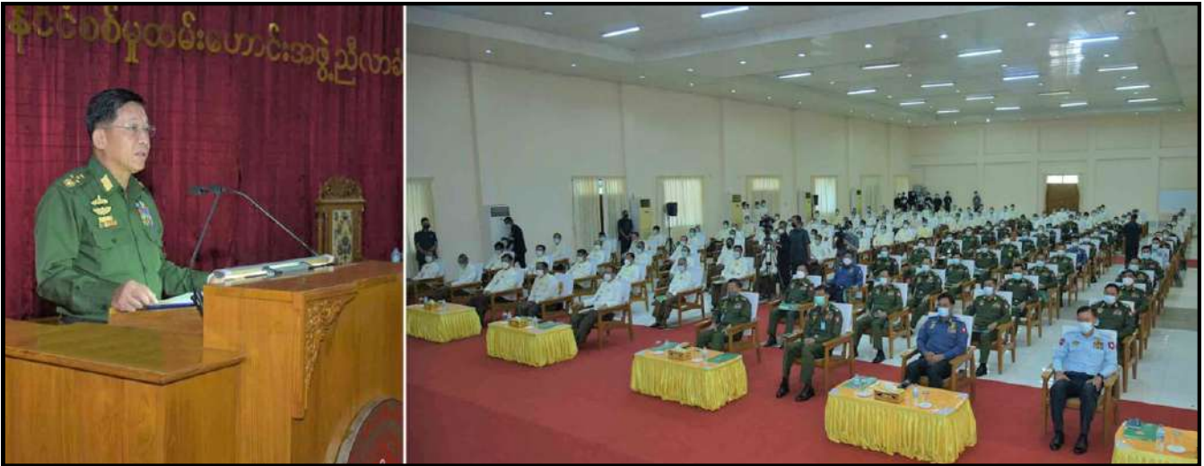
Chairman of the State Administration Council Prime Minister delivering an address at Myanmar War Veterans Organization (MWVO) Conference (2020)