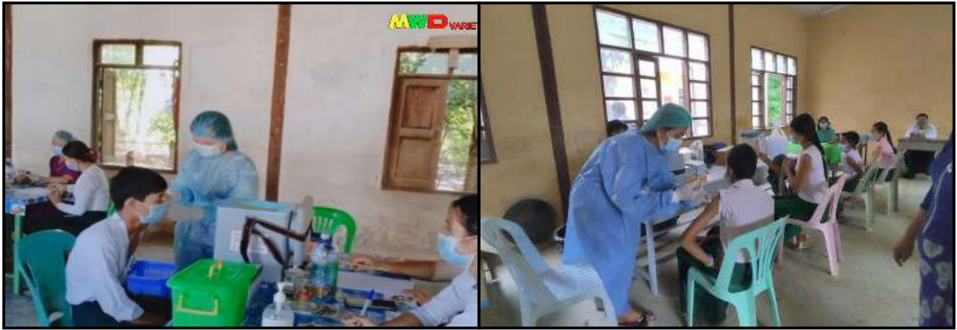
Students aged 12 years and above vaccinated against COVID-19 as per the targeted group in respective regions and states

ment through air, sea and border trade points.