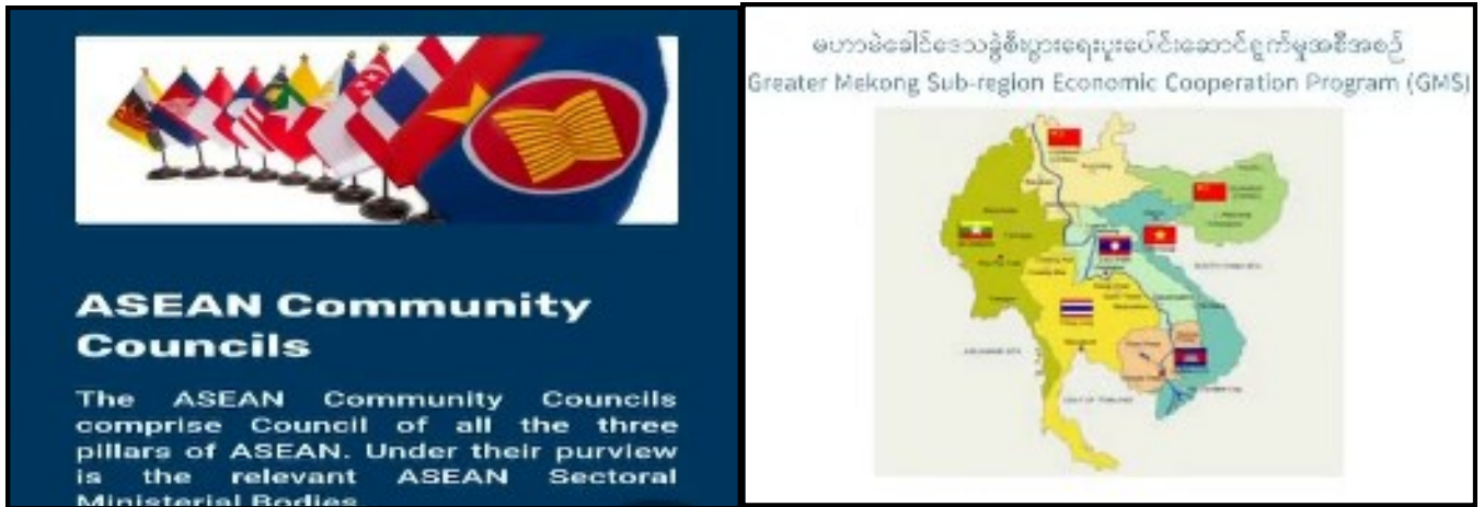
Myanmar participating in Greater Mekong Sub-region Economic Cooperation Program (GMS)