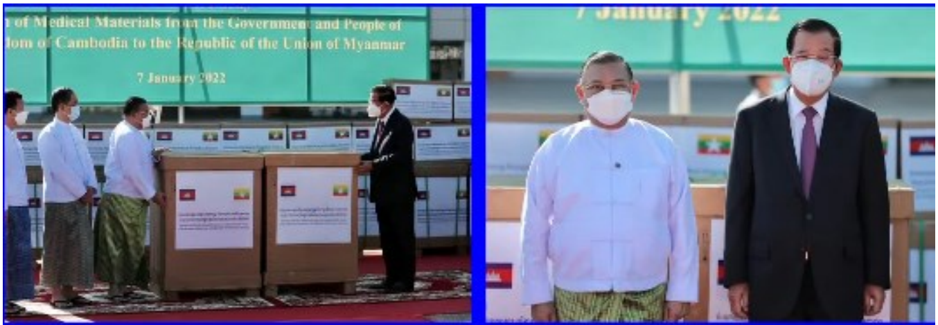
Receiving COVID-19 prevention, control and treatment equipment donated by Kingdom of Cambodia