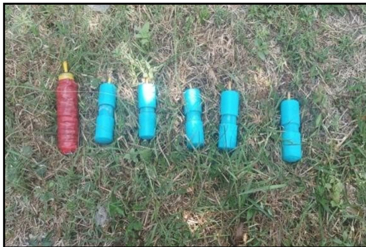
Photo of the confiscated homemade bombs