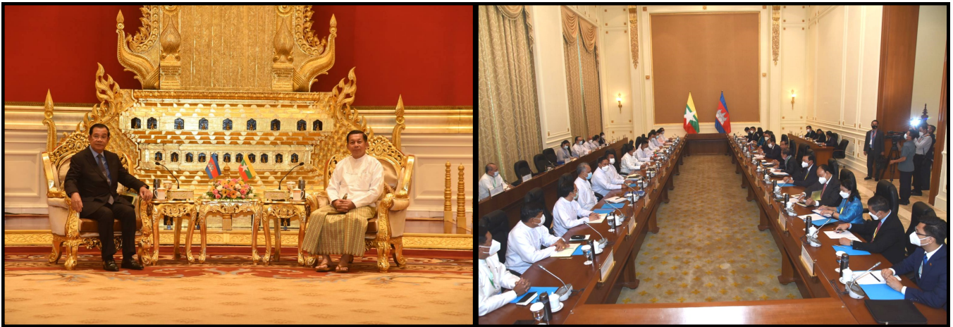
Holding meeting during the working visit of Prime Minister of Cambodia, Chairman of ASEAN to Myanmar