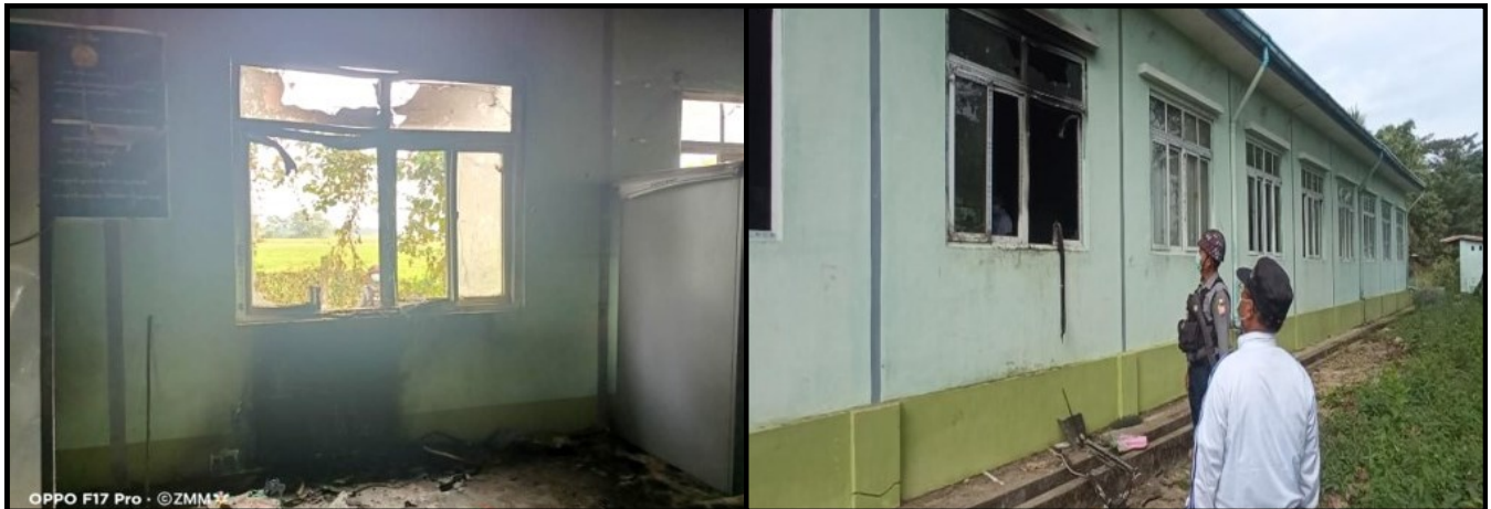
The school in Daitayar village of Phyu township damaged in the arson attack of terrorists