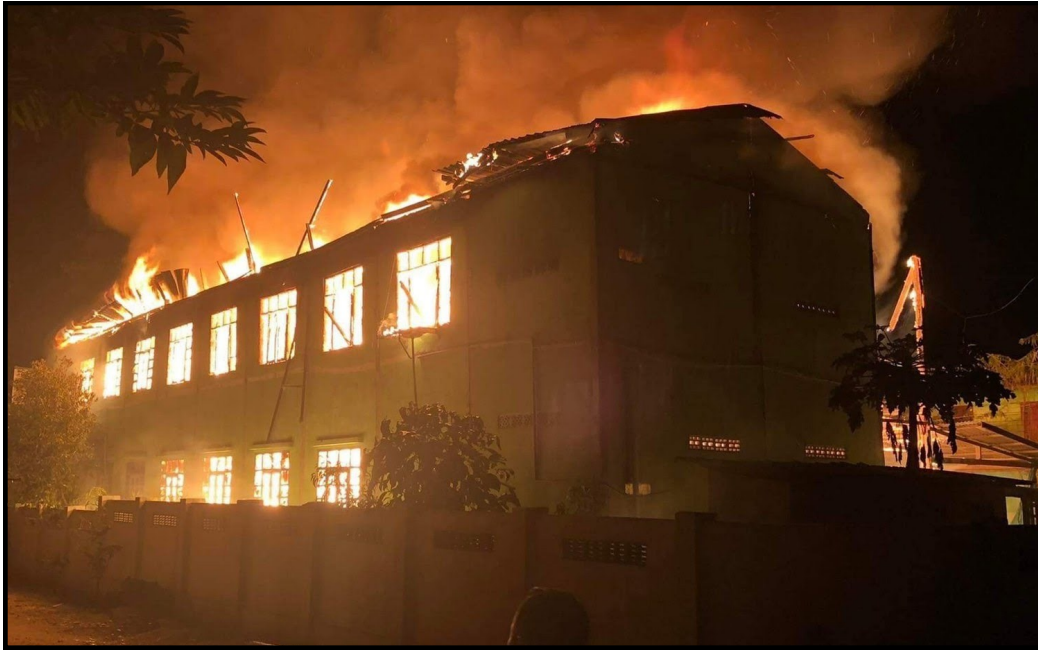
Terrorists burnt down district education office in Kalay township