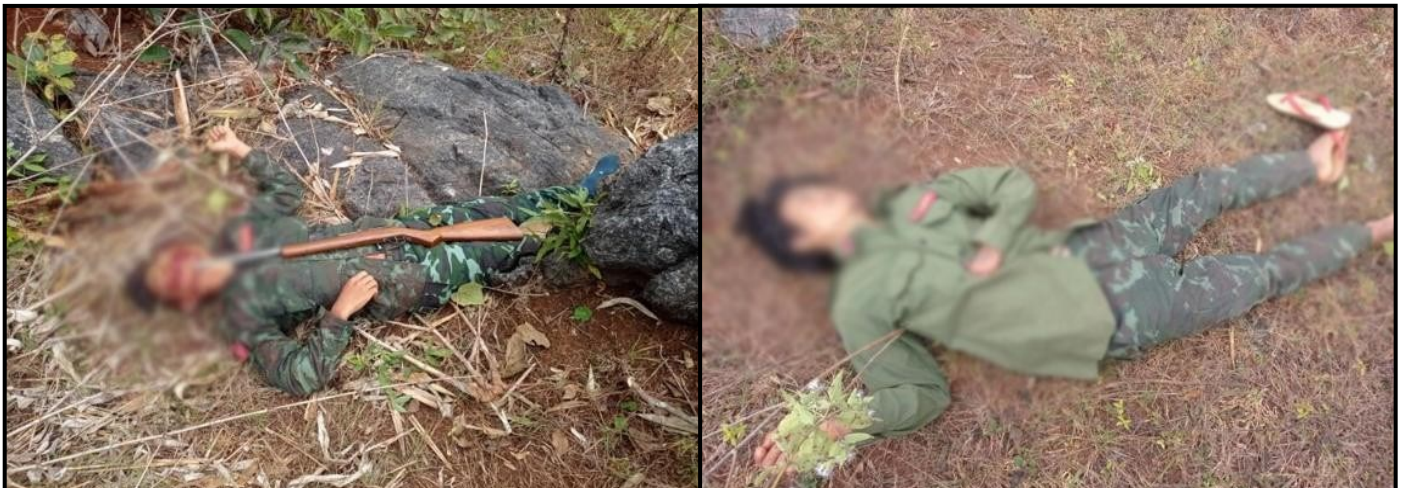
Photos of the confiscated one homemade .22 gun and arrested two dead bodies of terrorists