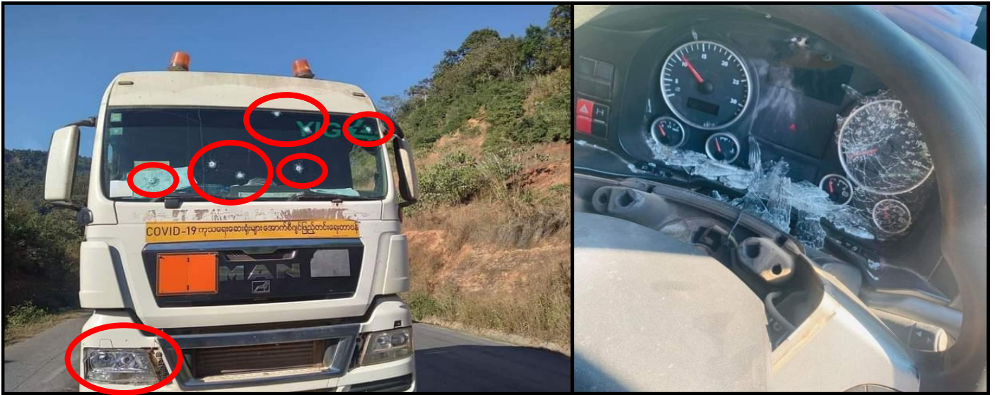
The vehicle carrying liquid oxygen destroyed in the attack of terrorists for no reason