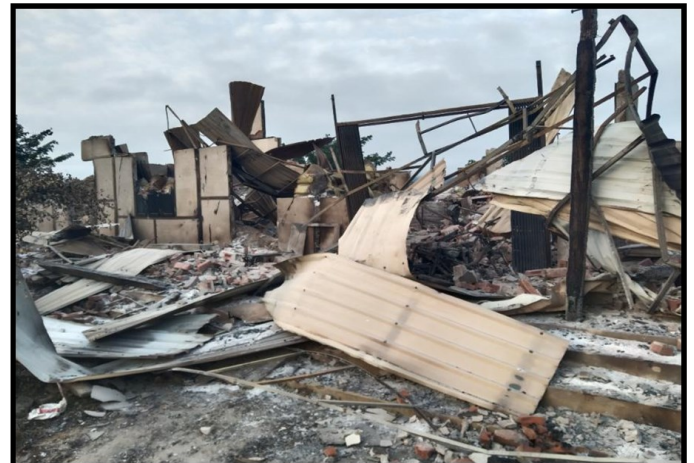
Terrorists burnt down the school in Marathein village of Htigyaing township