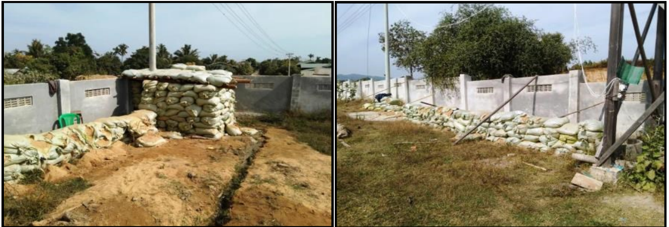
The sand bunkers seized in the school of Htigyaing township in Sagaing region where the terrorists hid