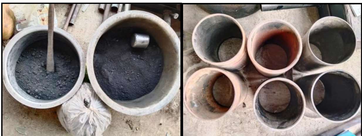
The items used in creating homemade mine/bomb confiscated at the school of Htigyaing township in Sagaing region where the terrorists hid