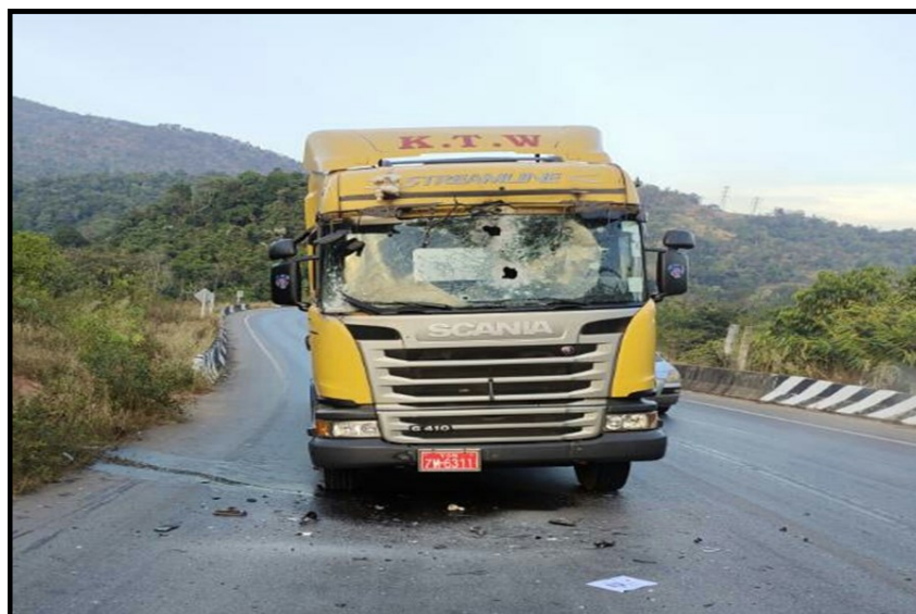
The truck carrying Argon Gas damaged in the small weapons attack of terrorists for no reason