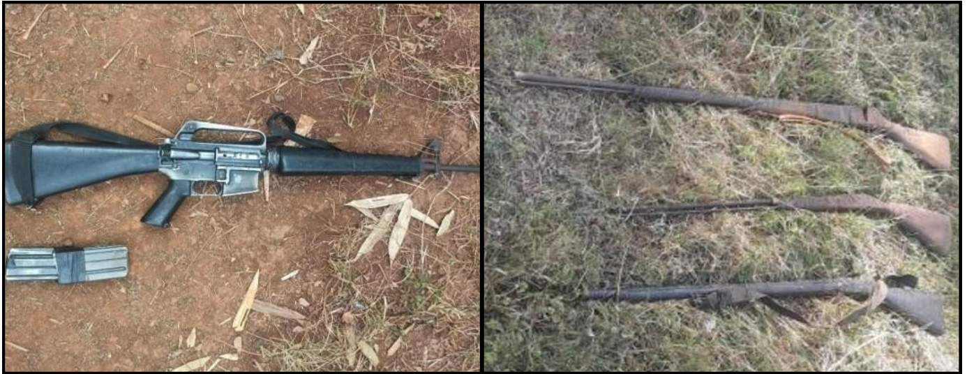
The confiscated firearms in the gun attack on security force members by the terrorists from vehicles in Hpruso township of Kayah state