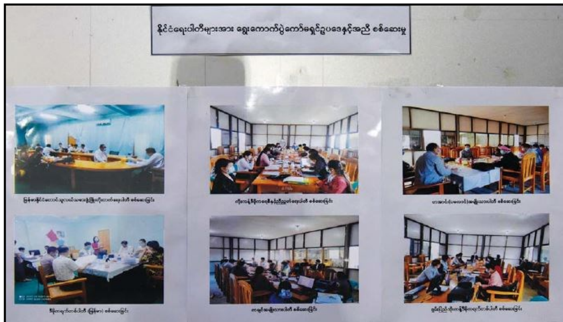
Inspecting the political parties in line with Election Commission Law