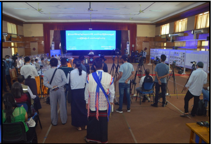
Holding the 11 th Press Conference held by Information Team of State Administration Council