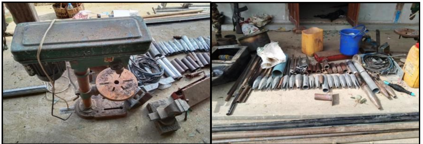
The machine and related materials used in creating homemade bomb confiscated at the school of Htigyaing township in Sagaing region where the terrorists hid