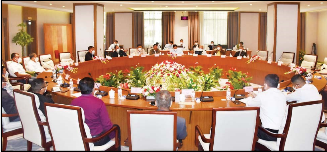
The National Unity and Peace Coordination Committee holding a meeting with representatives from six NCA non-signatories