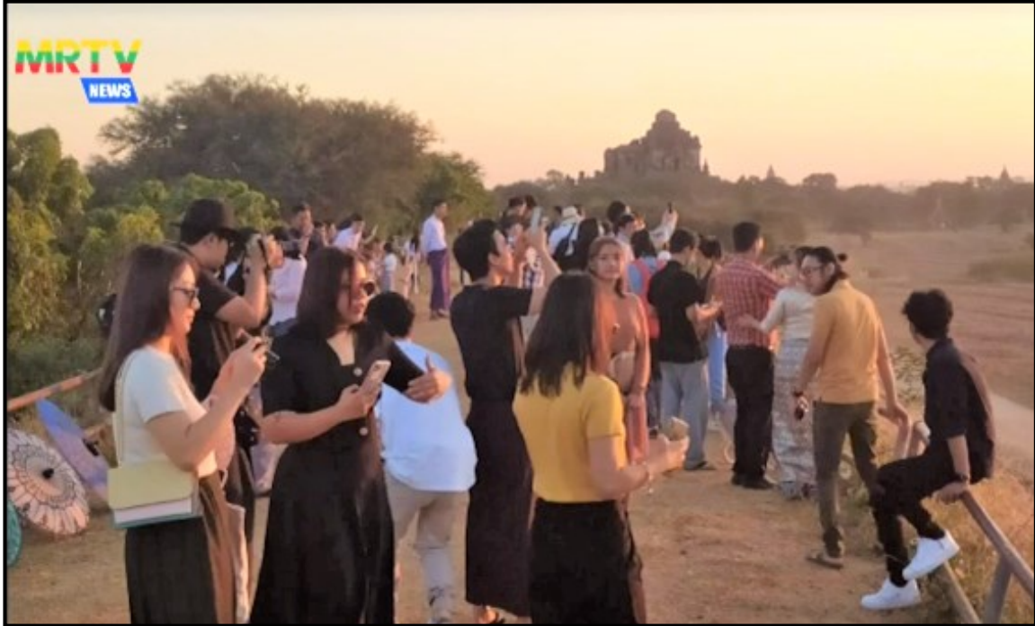
Photos of the visitors across the country to enjoy the sunset view of Bagan-NyaungU cultural zone

On 31 December during the new year holidays, the people across the country are enjoying the holidays by celebrating the new year, going out vocations and pilgrimages.