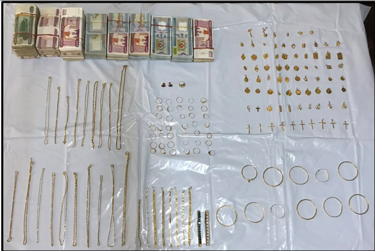
Confiscated cash and goldwares along with offender Tin Tin Moe at Aung Pin Lal ward in Motetama town on 30 December 2021

Regarding the robbery case that occurred on 19 December 2021 in which two handbags containing four visses and 50 ticals of gold worth of (K720 million) belonged to the U Hnin Ngwe, owner of Kyon Sin Jewellery shop opened in the Insein market of Zaygon Ward in Insein Township, a total of 10 suspects including seven males and three females were arrested along with their robbed goldwares as well as 5,450 WY tablets and two taxi cars. This news report was already described in the Information Sheet released on 25 December.