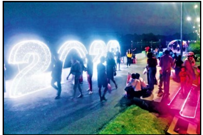
Installation of decorative lights and people welcoming international new year at the Bank of Inya Lake on Pyay road in Yangon