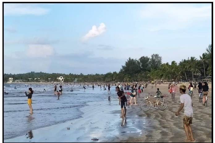
Chaung Tha beach thronging with visitors who are celebrating new year