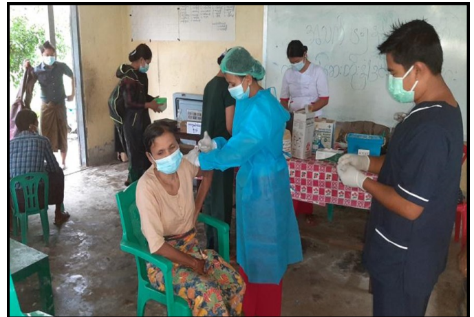
Vaccinating local people against COVID-19 in MraukU township