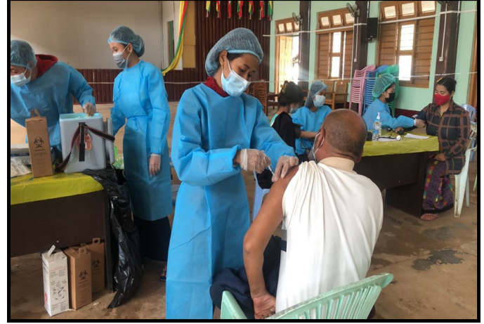
Vaccinating local people against COVID-19 in Shan state (north)