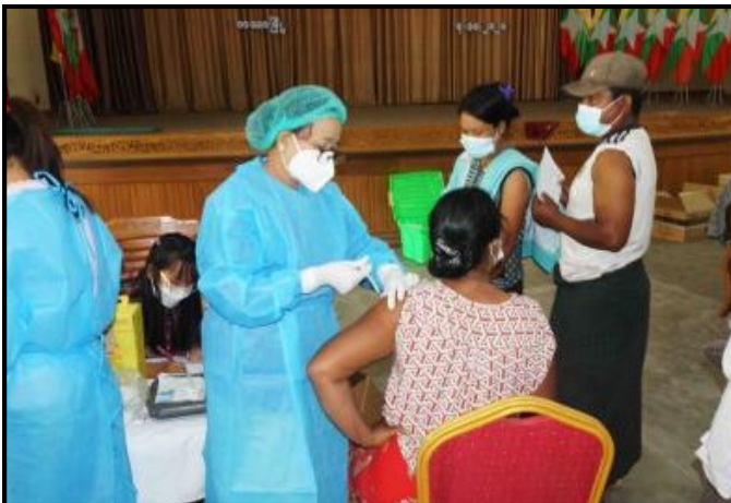
Vaccinating local people against COVID-19 in Katha township