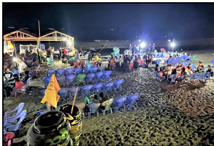
Ngwe Saung beach thronging with visitors who are celebrating new year