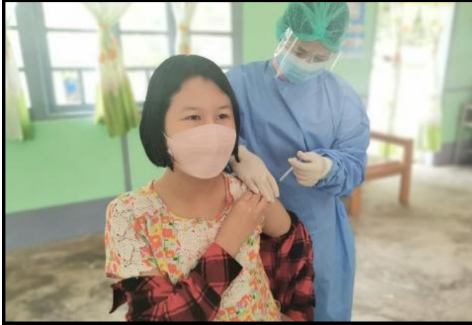
Vaccinating students against COVID-19 in Hopang township

Source: Myawady Daily Newspaper (1-1-2022)