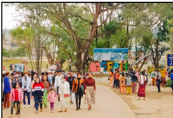
Pwe Kauk waterfalls thronging with visitor across the country during the new year holidays