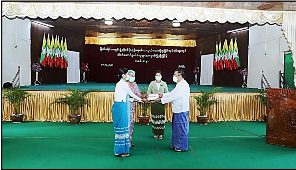
Chief Minister of Tanintharyi region and officials rewarding cash awards to medical staff participating in COVID-19 vaccination processes in Tanintharyi region

COVID-19 prevention, control and treatment activities such as opening quarantine centres and vaccinating people against COVID-19 continue in respective regions and states: