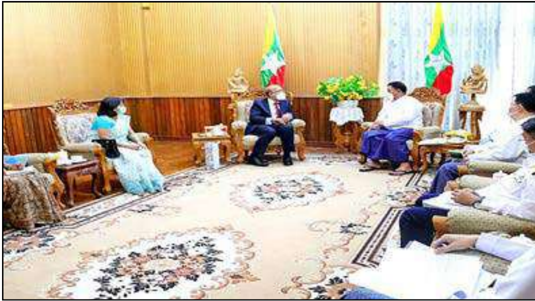
Union Minister Admiral Tin Aung San holding discussions in meeting with Indian Ambassador to Myanmar