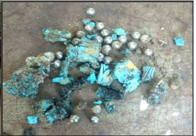
IED explosion at township electricity office in Bominyaung ward of Tatkon township on 1 November 2021