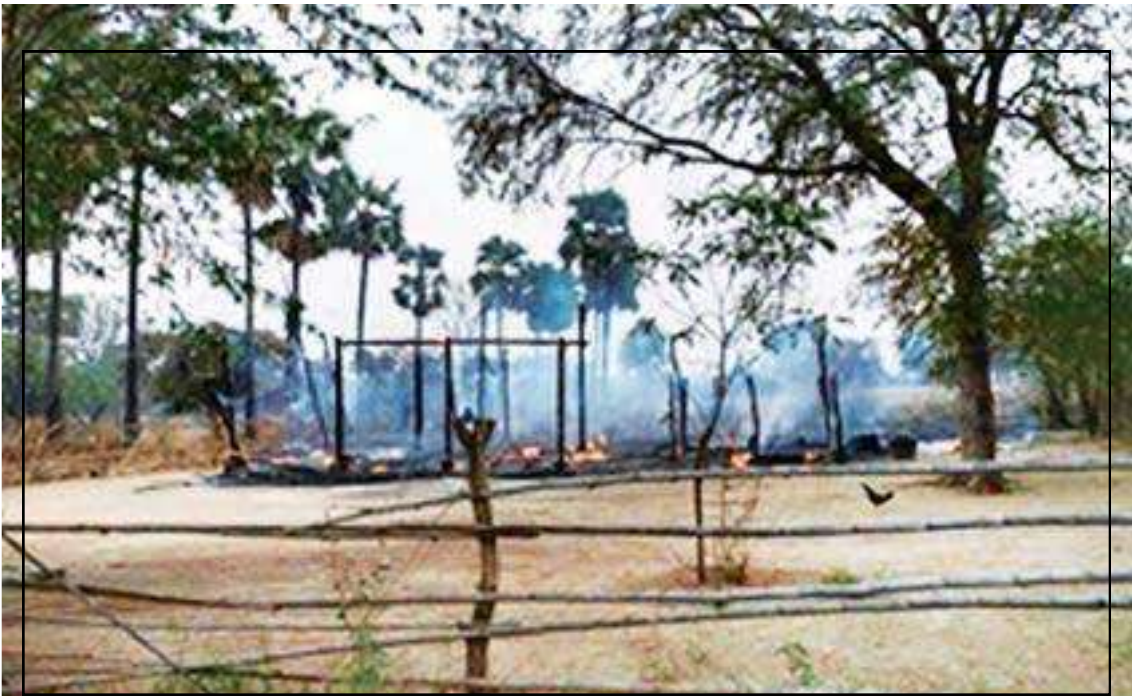
Damages of residential houses in the village in the aftermath of arson attack of so-called PDF terrorists

and right knee. Furthermore, 17 teachers, 64 children, and a pregnant woman were found hiding in the monastery together with monks there and some of the villagers fled to safety from the danger of the terrorists.