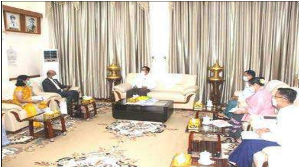
Union Minister U Win Shein holding discussions in meeting with Indian Ambassador to Myanmar