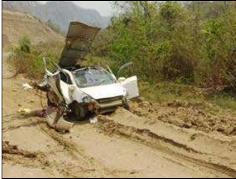
A vehicle damaged in the IED explosion planted by PDF terrorists at Kalaywa township of Sagaing region