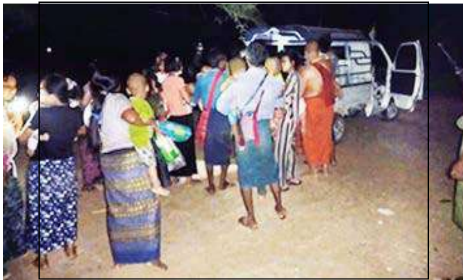
Some villagers moving to the safe place due to the threats of PDF terrorists