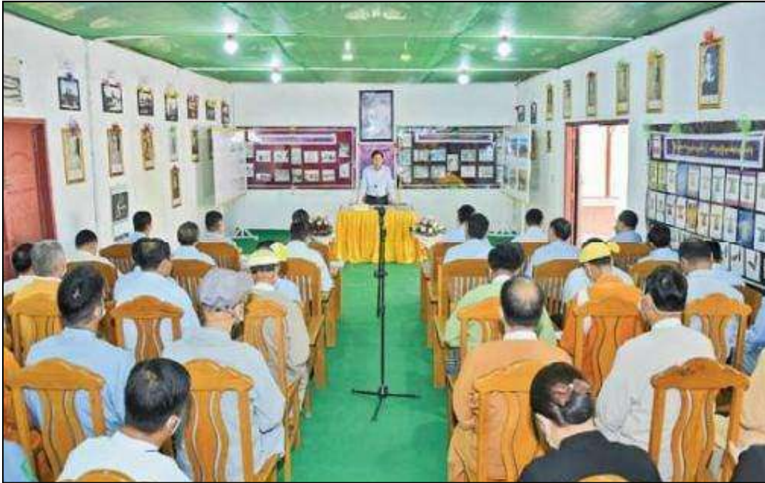
The Chairman of the State Administration Council Prime Minister Senior General Min Aung Hlaing delivering a speech at the meeting with departmental staff and town elders of Hsenwi township