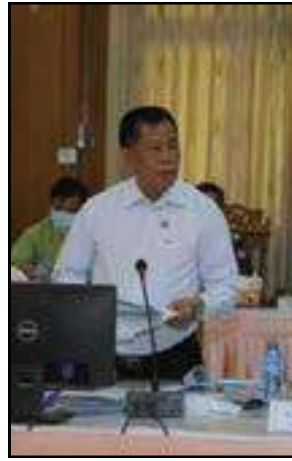
Discussion of Mandalay Region Chief Minister U Maung Ko at the meeting