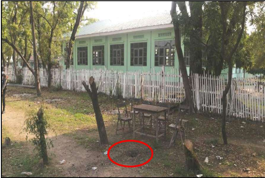
Damages of materials in the aftermath of IED explosion outside the fence of Basic Education High School (Nyaung Loont) in Nyaung Loont village of Tatkon township on 4 April 2022