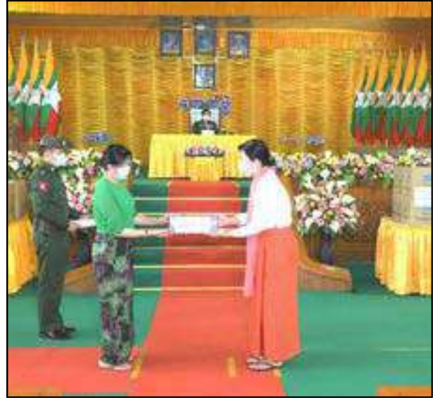
The Chairman of the State Administration Council Commander-in-Chief of Defence Services Senior General Min Aung Hlaing and his wife presenting foodstuff for officers, other ranks and family members, and cash assistance for maternal and child welfare association of Lashio military station

urged them to compare the international event and internal events.