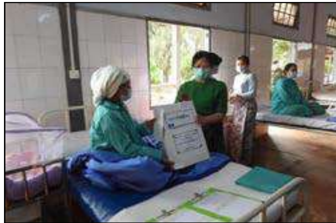
The Chairman of the State Administration Council Commander-in-Chief of Defence Services Senior General Min Aung Hlaing and his wife presenting gifts for the military personnel and locals receiving treatments at local military hospital in Lashio township

Such practice is applied in successive eras.