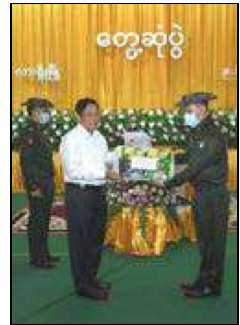
The Chairman of the State Administration Council Prime Minister Senior General Min Aung Hlaing presenting foodstuff for state, district and township-levels departmental officials and town elders

The meeting was attended by the Chairman of the SAC Prime Minister Senior General Min Aung Hlaing, accompanied by entourage, Shan State Chief Minister, Commander of North-East Command, state, district, and township-levels departmental