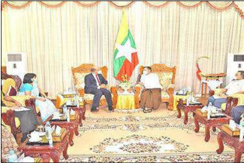
Union Minister Lt-Gen Soe Htut holding discussions in meeting with Indian Ambassador to Myanmar

velopment of the border areas in Myanmar, the development of human resources and availabilities of job opportunities, and the successful implementation of the infrastructures for roads and bridges, education, and medical issues in Chin state and Naga Self-Administered Zone with the assistance of India.