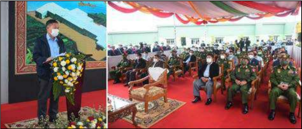
Vice-Chairman of the State Administration Council Deputy Commander-in-Chief of Defence Services Commander-in-Chief (Army) Vice-Senior General Soe Win delivering a speech at the opening ceremony of dried tea leaves and dried fruit factory (Naungtaya)

with the guidance of the Prime Minister of the State, all are urged to make collective efforts to maintain the factory helpful to local development for its long-term existence.