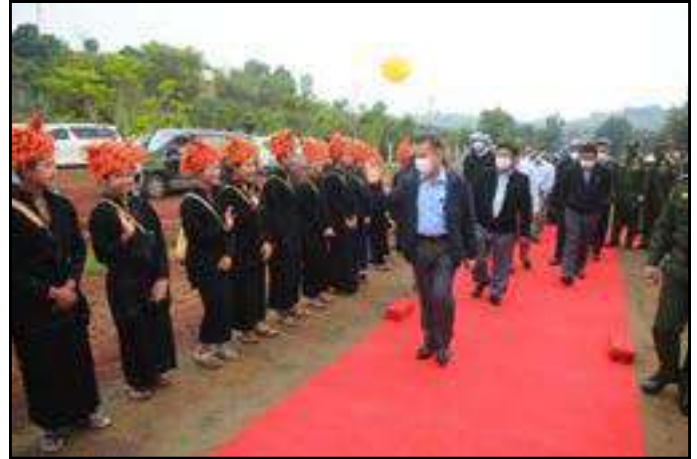
Vice-Chairman of the State Administration Council Deputy Commander-in-Chief of Defence Services Commander-in-Chief (Army) Vice-Senior General Soe Win cordially greeting by local ethnic nationals