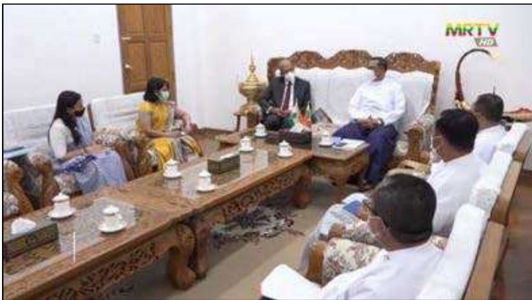
Union Minister U Shwe Lay holding discussions in meeting with Indian Ambassador to Myanmar