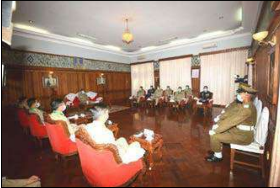
The Vice-Chairman of the State Administration Council (SAC) Deputy Commander-in-Chief of Defence Services Commander-in-Chief (Army) Vice-Senior General Thray Sithu Soe Win speaking words of honour in meeting with outstanding cadets