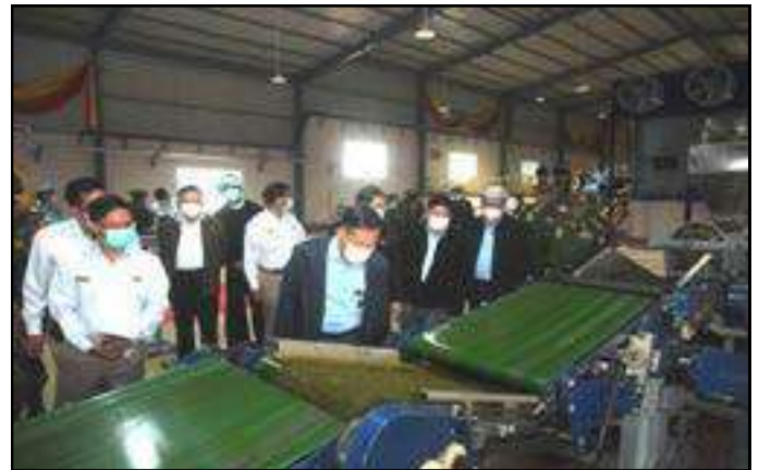
Vice-Chairman of the State Administration Council Deputy Commander-in-Chief of Defence Services Commander-in-Chief (Army) Vice-Senior General Soe Win inspecting the production steps of dried tea leaves