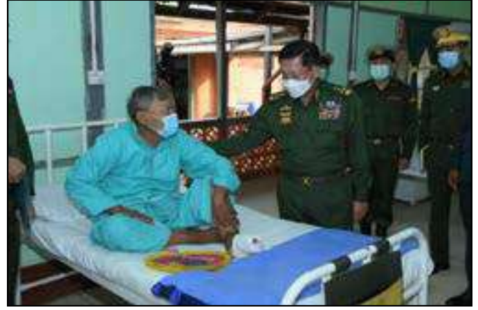
The Chairman of the State Administration Council Commander-in-Chief of Defence Services Senior General Min Aung Hlaing inspecting the military personnel and locals receiving treatments at local military hospital in Lashio township