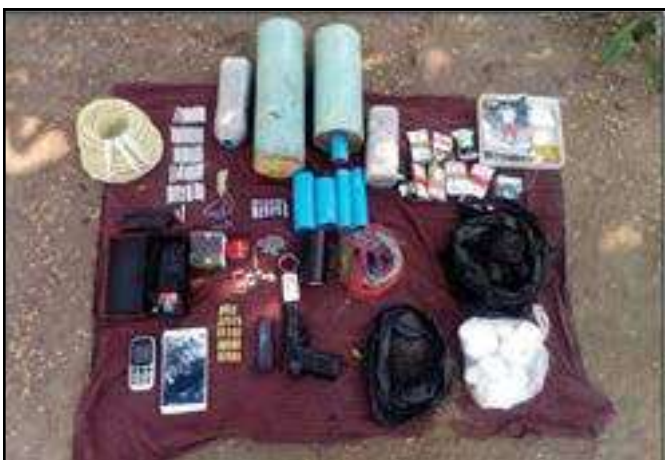
Weapons and ammunition seized at the house of offender Tun Tun Win Pinsu village of Tatkon township