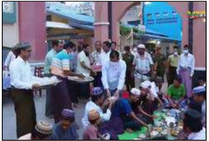
Chief Minister of Mandalay region, Commander of Central Command and officials provided food items and donation cashes to Muslims fasting during Ramadan at Joon Mosque of Chanayethazan township