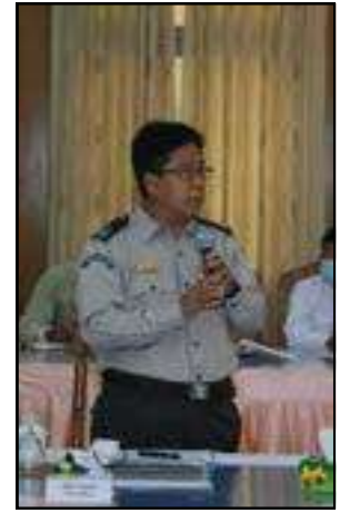
Discussion of Director-General of Department of Forestry U Htay Aung at the meeting