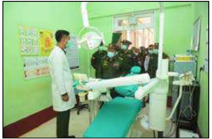
Vice-Chairman of the State Administration Council Deputy Commander-in-Chief of Defence Services Commander-in-Chief (Army) Vice-Senior General Soe Win inspecting around the hospital