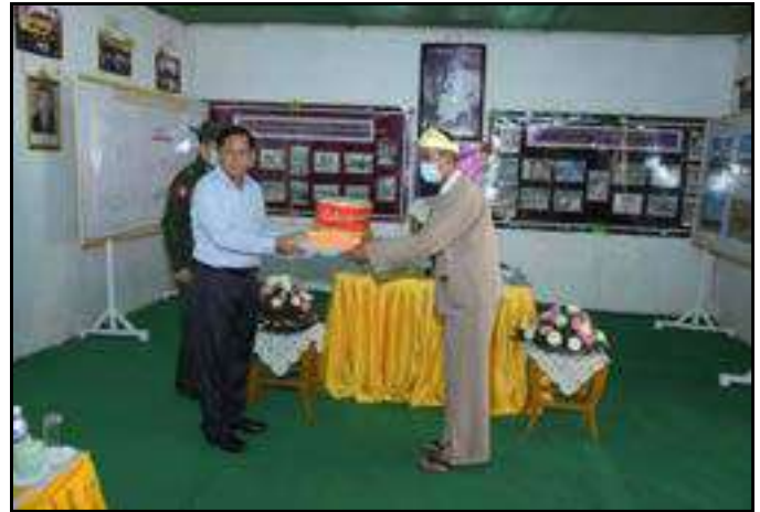
The Chairman of the State Administration Council Prime Minister Senior General Min Aung Hlaing presenting foodstuff for departmental officials and town elders in Hsenwi township