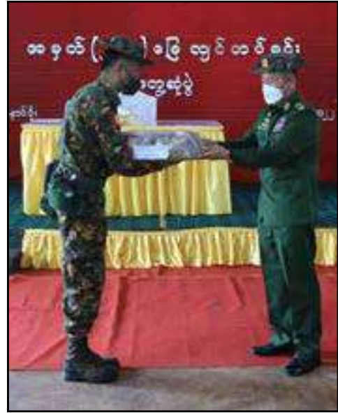
Vice-Chairman of the State Administration Council Deputy Commander-in-Chief of Defence Services Commander-in-Chief (Army) Vice-Senior General Soe Win presenting foodstuff and cash assistance for officers, other ranks and family members of Taunggyi and Nawngwoe stations