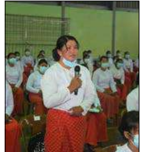
Vice-Chairman of the State Administration Council Deputy Commander-in-Chief of Defence Services Commander-in-Chief (Army) Vice-Senior General Soe Win hearing the reports of other ranks and family members of Taunggyi station