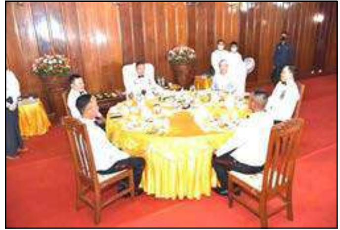
The Vice-Chairman of the State Administration Council (SAC) Deputy Commander-in-Chief of Defence Services Commander-in-Chief (Army) Vice-Senior General Thray Sithu Soe Win cordially greeting commissioned officers and having dinner together with them

always make collective efforts for the Tatmadaw to become the strong, efficient, modernized patriotic armed forces.