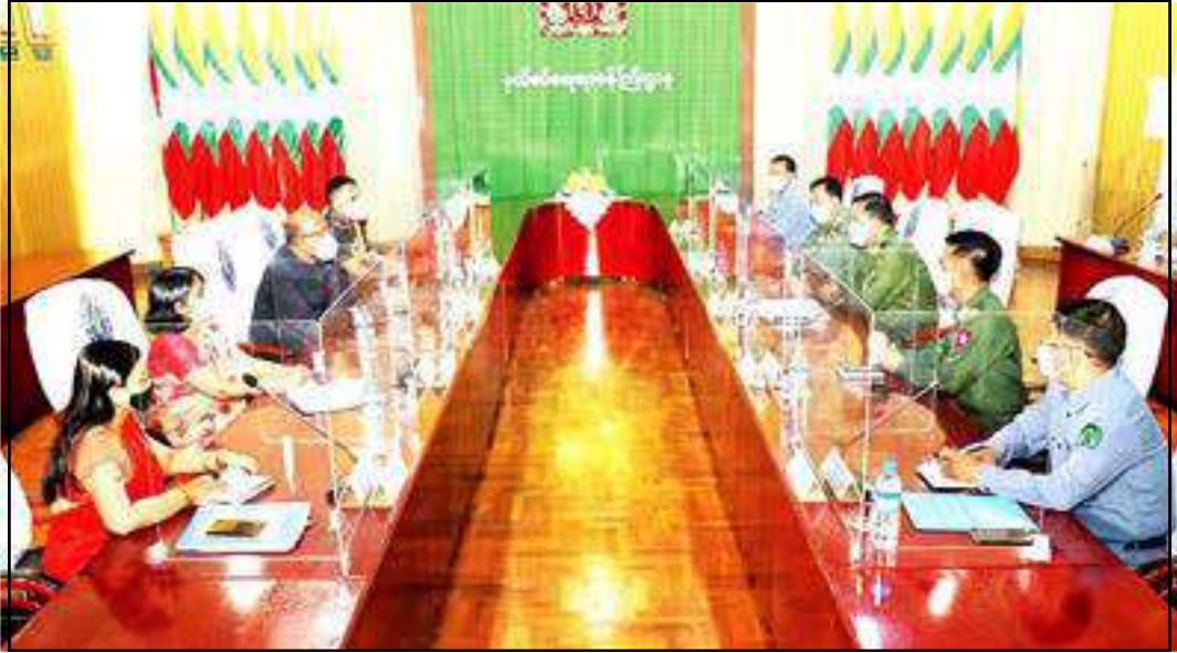
Union Minister Lt-Gen Tun Tun Naung holding discussions in meeting with Indian Ambassador to Myanmar