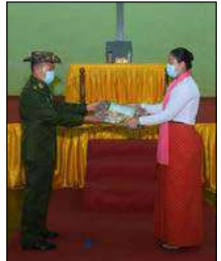
Vice-Chairman of the State Administration Council Deputy Commander-in-Chief of Defence Services Commander-in-Chief (Army) Vice-Senior General Soe Win presenting foodstuff and cash assistance for officers, other ranks and family members of Kengkham, Mongpying and Taunggyi stations

groups in the country applied various means to stop the government machinery. But their acts do not go well as expected. In this regard, they are trying to break up the Tatmadaw that is the strongest institution of the nation throughout the successive periods. As there may be attempts to sow seeds of mistrust, soldiers and their families must live in unity through weal and woe, while raising their family spirit of mutual trust, respect and reliance.