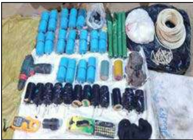
IEDs and explosive materials seized at the house of offender Tun Tun Naung in Butar village of Tatkon township