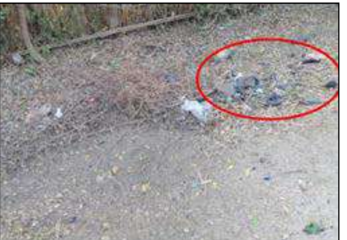
IED explosion near office of Union Solidarity and Development Party in Tatkon township on 21 December 2021