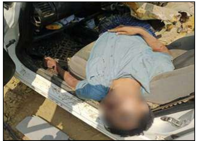
Two dead persons in the IED explosion planted by PDF terrorists at Kalaywa township of Sagaing region