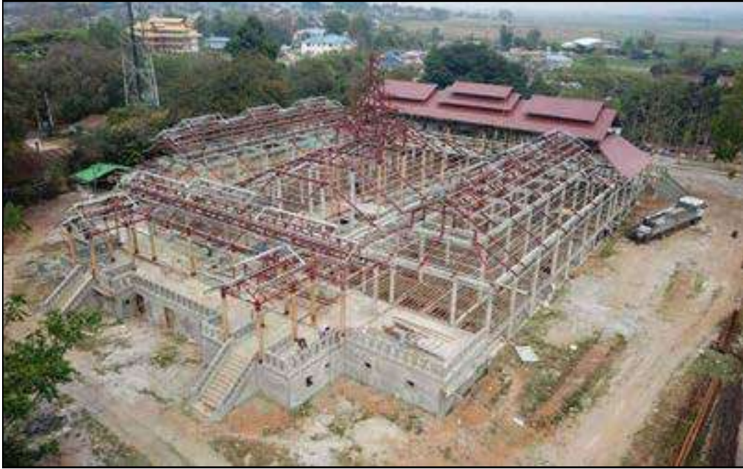
Reconstruction of reconstruction of the glorious Haw Palace (Haw Hkum Tsamvi) of Hsenwi Sawbwa Hkun Hsang Ton Hong in progress