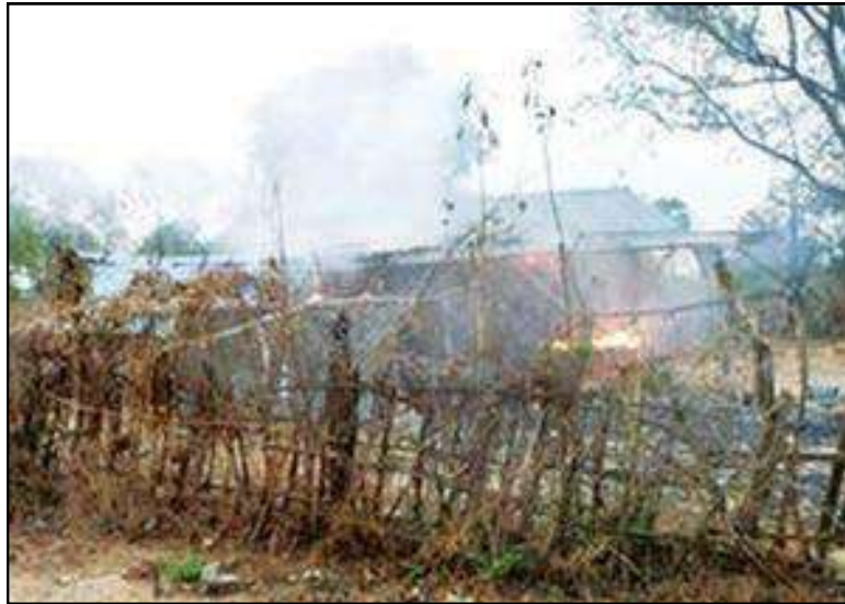
Damages of residential houses in the village in the aftermath of arson attack of so-called PDF terrorists