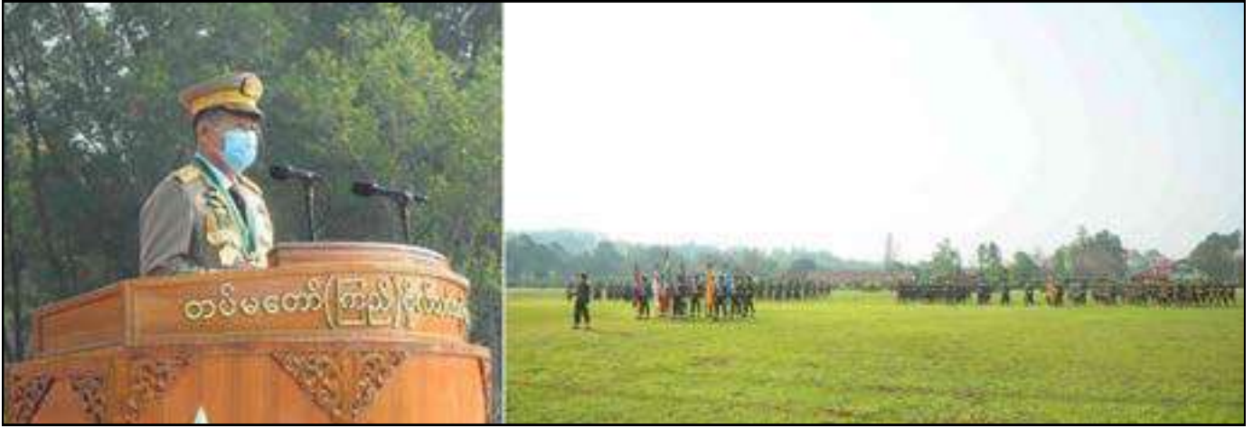
The Vice-Chairman of the State Administration Council (SAC) Deputy Commander-in-Chief of Defence Services Commander-in-Chief (Army) Vice-Senior General Thray Sithu Soe Win, on behalf of Chairman of the State Administration Council Commander-in-Chief of Defence Services Senior General Maha Thray Sithu Min Aung Hlaing, delivering an address at the passing out parade of the 125 th Intake of the Defence Services (Army) Officers Training School (Bahtoo), Thiha Company