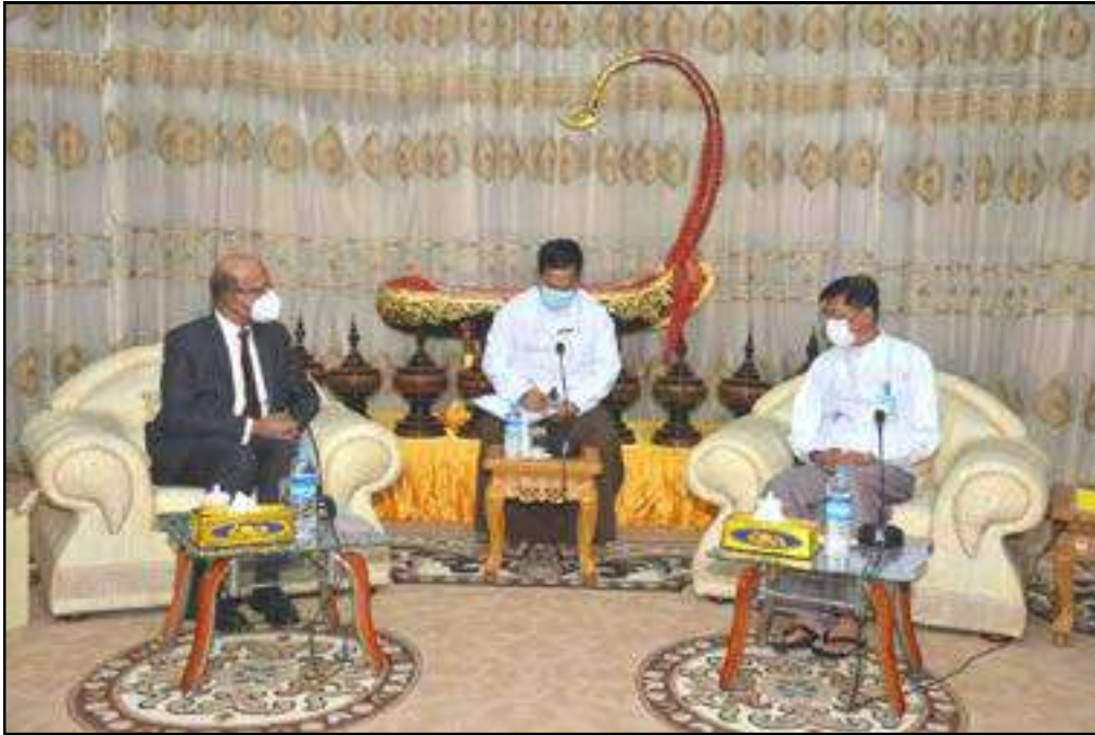
Union Minister for Defence General Mya Tun Oo holding discussions in meeting with Indian Ambassador to Myanmar

Union Minister for Defence, Union Minister for Home Affairs, Union Minister for Foreign Affairs, Union Minister for Border Affairs, Union Minister for Planning and Finance, Union Minister for International Cooperation, Union Minister for Transport and Communications, Union Minister for Electricity and Energy, Union Minister for Education, Union Minister for Health, and Union Minister for Construction received H.E. Mr. Vinay Kumar, Indian Ambassador to Myanmar separately. During the meeting, they discussed the following matters: