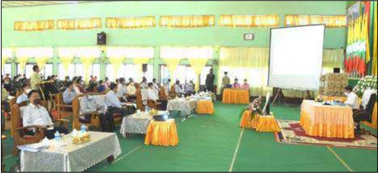
The Chairman of the State Administration Council Prime Minister Senior General Min Aung Hlaing hearing the reports on regional development matters presented by chairman of the administrative branch of the Shan State (North) government and chairman of Lashio district administration committee