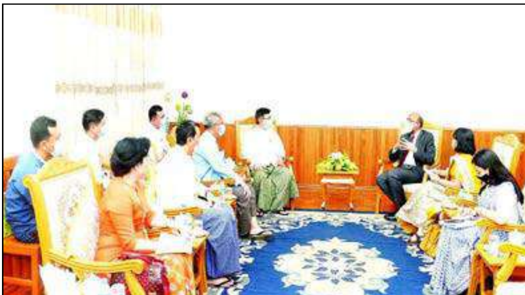
Union Minister Dr Nyunt Pe holding discussions in meeting with Indian Ambassador to Myanmar