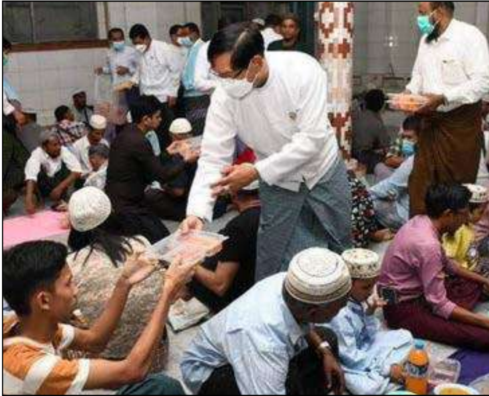
Chief Minister of Yangon Region and officials provided food items and donation cashes to Muslims fasting during Ramadan at Ta-Chan-Pae Mosque of Mingalataungnyunt township and at Cholia Jamai Mosque of Pabedan township

Chief Ministers of Yangon region and Mandalay region, relevant Commanders of Regional Military Commands and officials visited the Muslims fasting during Ramadan and donated food items to them in respective regions as follows: