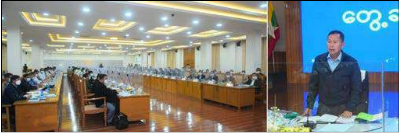
Vice-Chairman of the State Administration Council Deputy Commander-in-Chief of Defence Services Commander-in-Chief (Army) Vice-Senior General Soe Win delivering an address at the meeting with members of Shan State Government and state-level departmental officials of Taunggyi town

mocracy and federalism. National reconciliation and peace-making committees at various levels have been found and coordination committee is discussing with respective parties, NCA signatory and non-signatory ethnic armed organizations.