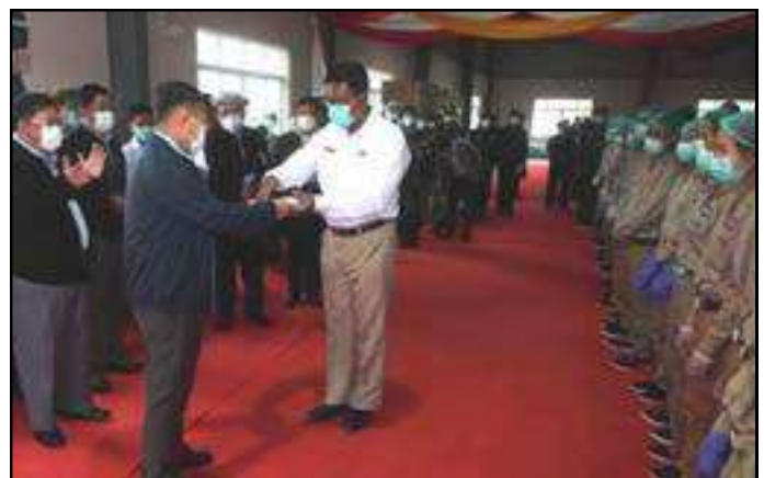
Vice-Chairman of the State Administration Council Deputy Commander-in-Chief of Defence Services Commander-in-Chief (Army) Vice-Senior General Soe Win presenting honourable cash for the staff of the factory