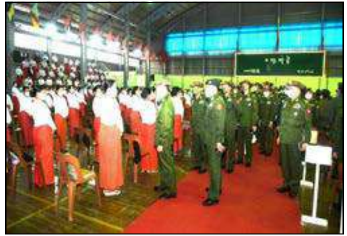
Vice-Chairman of the State Administration Council Deputy Commander-in-Chief of Defence Services Commander-in-Chief (Army) Vice-Senior General Soe Win cordially greeting officers, other ranks and family members of Taunggyi station