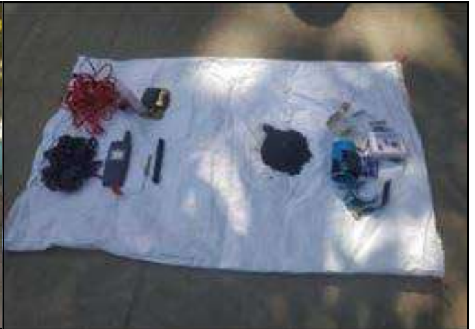
An IED found at the transformer in Aungzeya ward of Tatkon township on 27 December 2021