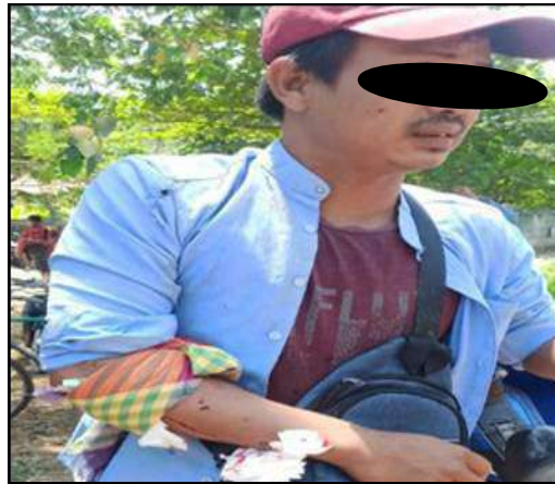
A man injured in the explosion of an IED near the Basic Education High School-BEHS (Ohnnae), in Kawa township of Bago region