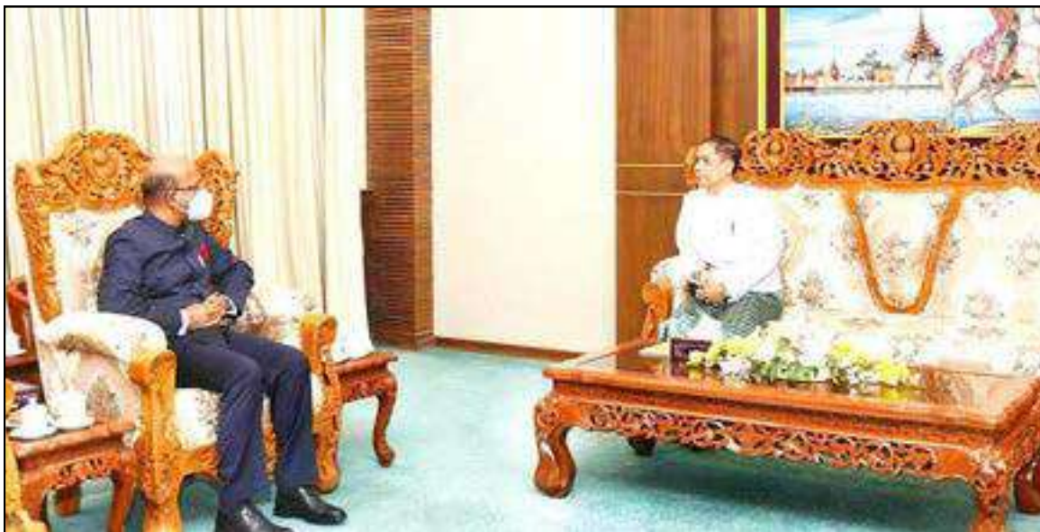
Union Minister U Ko Ko Hlaing holding discussions in meeting with Indian Ambassador to Myanmar