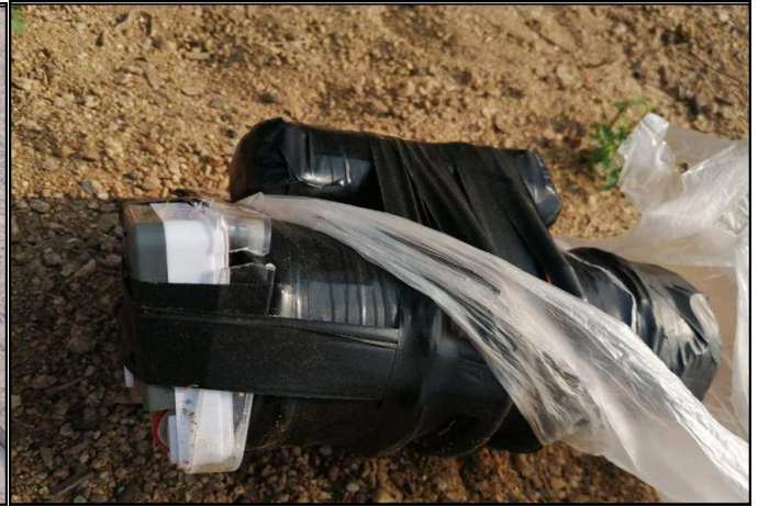
IED planted by terrorists found at the house of an innocent civilian in Thantawgyi village of Shwemyo village-tract in Tatkon township on 31 March 2022