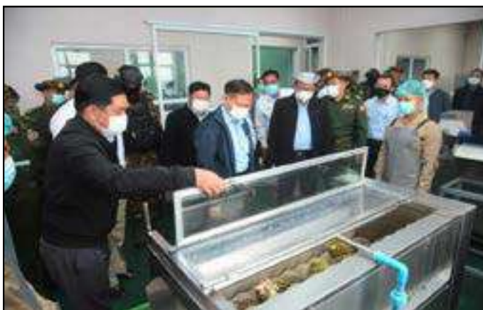
Vice-Chairman of the State Administration Council Deputy Commander-in-Chief of Defence Services Commander-in-Chief (Army) Vice-Senior General Soe Win inspecting the production steps of dried fruits