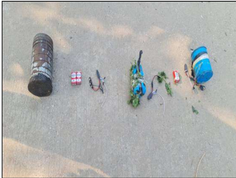
Three homemade mines found near No (3) Basic Education High School in Shwepyitha township of Yangon region

Terrorists of political extremists, with the intent to stop the Government administrative mechanism and disrupt the State's peace and stability, are committing the inhumane crimes of terrorism such as: threatening, abducting and killing education staff, ward/village administrators and civil servants and also blowing up the education facilities aiming to disrupt the education learning of the youths for their future.