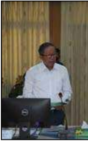
Discussion of Union Minister for Agriculture, Livestock and Irrigation U Tin Htut Oo at the meeting