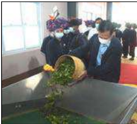
Vice-Chairman of the State Administration Council Deputy Commander-in-Chief of Defence Services Commander-in-Chief (Army) Vice-Senior General Soe Win putting fresh tea leaves in the belt conveyor