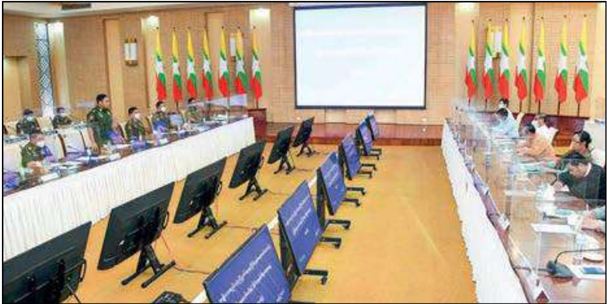
The National Solidarity and Peacemaking Negotiation Committee holding the coordination meeting with working groups of political parties