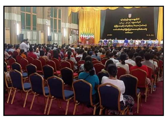
Yangon Technological University