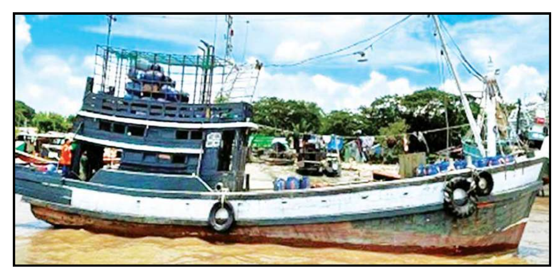
The boat carrying Methamphetamine from Yangon into Malaysia maritime area