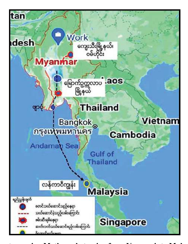
The map of the boat carrying Methamphetamine from Yangon into Malaysia maritime area