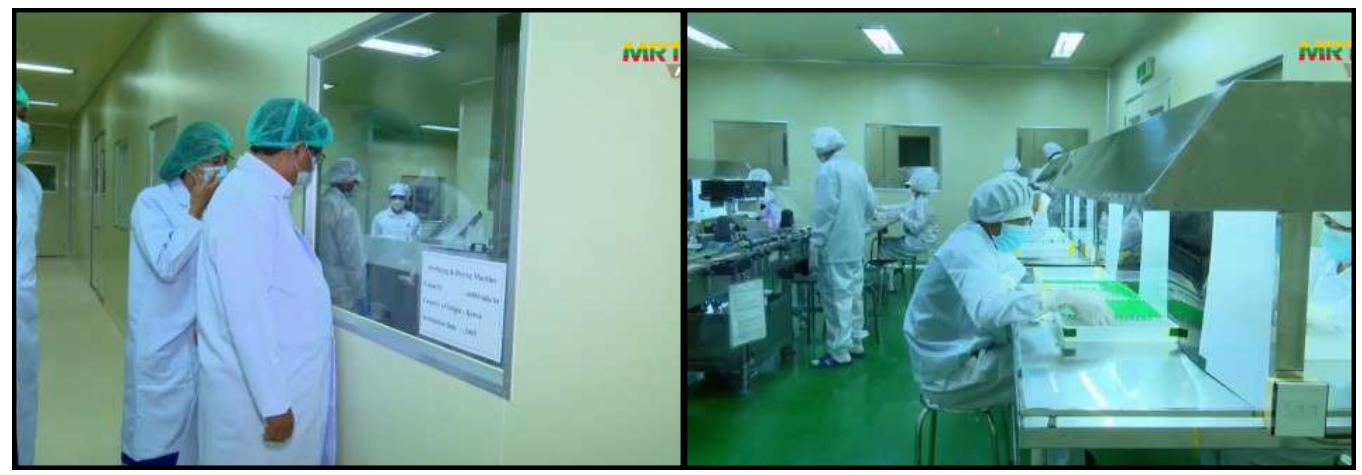
The Union Minister for Industry inspecting the production of Myancopharm COVID-19 vaccines