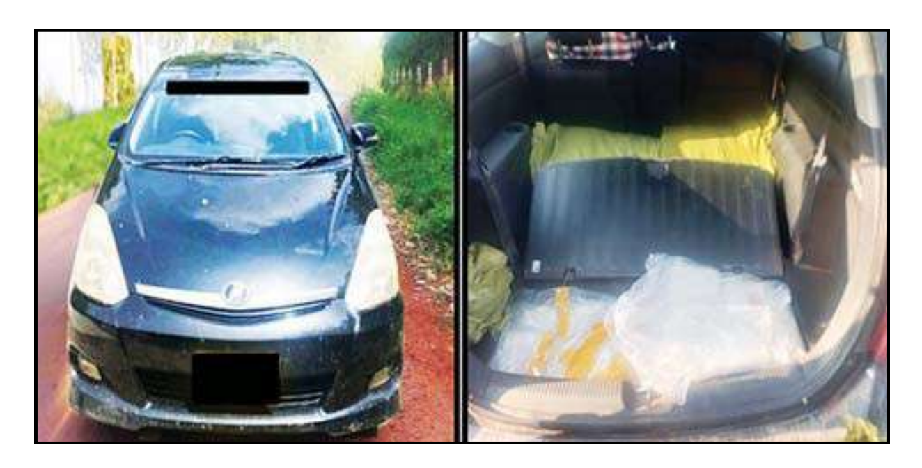
The seized vehicle carrying Methamphetamines from Wanhine, Kyethi Township in Shan State (South) to Yangon