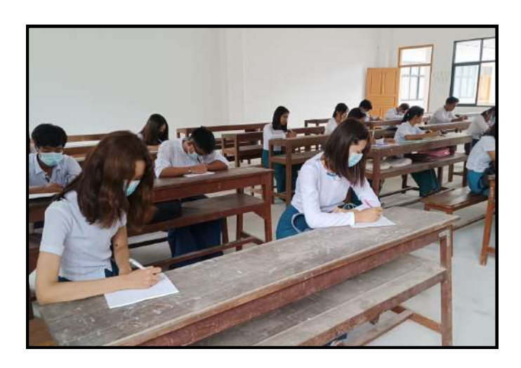
University of Computer Studies (Bago)