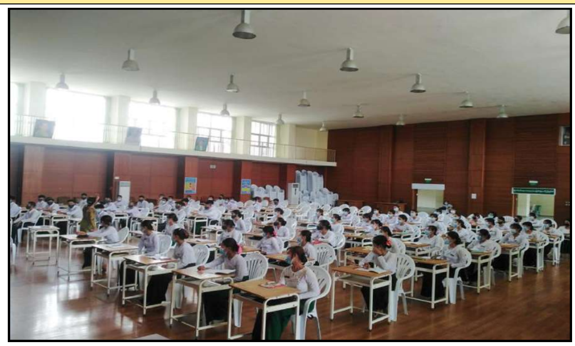
Education Degree College (Taungoo)

Universities, Degree Colleges, and Colleges in respective regions and states were reopened starting from 12 May 2022 as per the first semester period of designated academic year, and students are peacefully attending at the Universities, Degree Colleges, and Colleges.