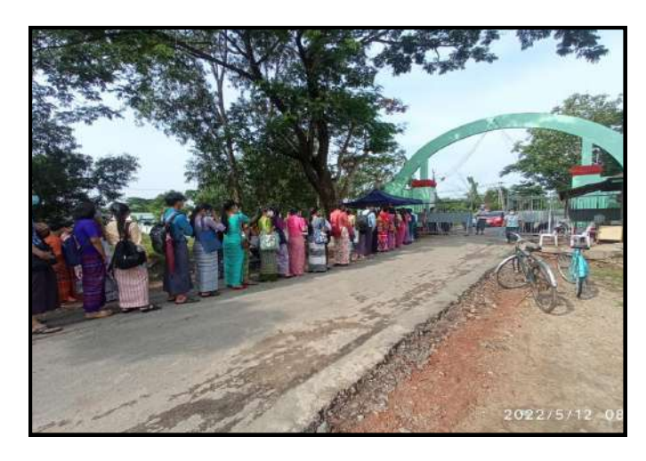
University of Co-operative and Management (Thanlyin)