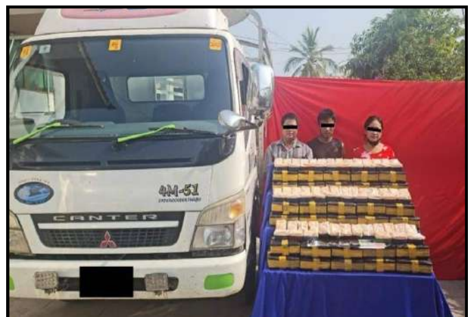
Heroin worth of over K109.25 million seized in Chanmyathazi Township of Mandalay Region