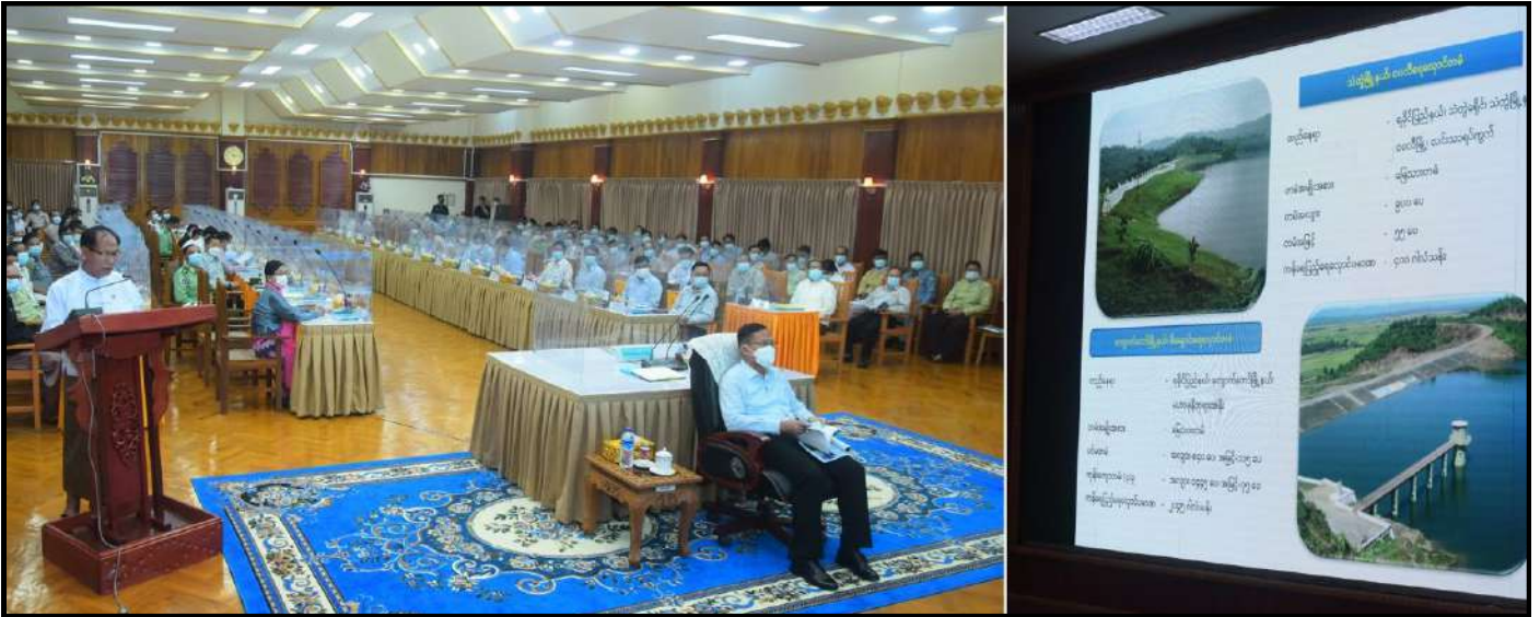
Vice-Chairman of the State Administration Council Deputy Commander-in-Chief of Defence Services Commander-in-Chief (Army) hearing reports on administrative, economic and social affairs in the state presented by the Chief Minister of Rakhine State