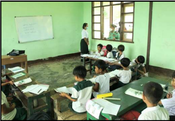
Vice-Chairman of the State Administration Council Deputy Commander-in-Chief of Defence Services viewing the learning of students at the primary school opening in the military unit from Kyauktaw station