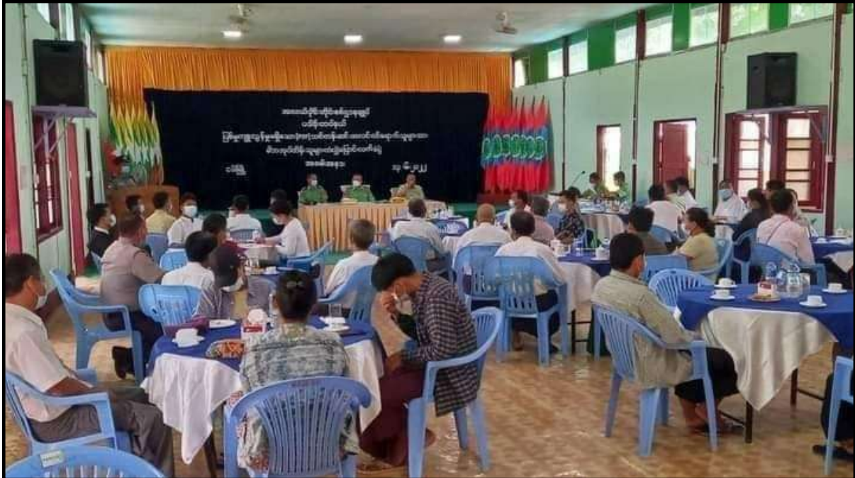
Holding the ceremony of entrusting PDF members who returned to legal fold to their respective parents in Ngape Township of Magway Region

The ceremonies of entrusting PDF members, who attended trainings in the areas of some EAOs, committed no crimes and returned to legal fold, to their respective parents were held as follows –