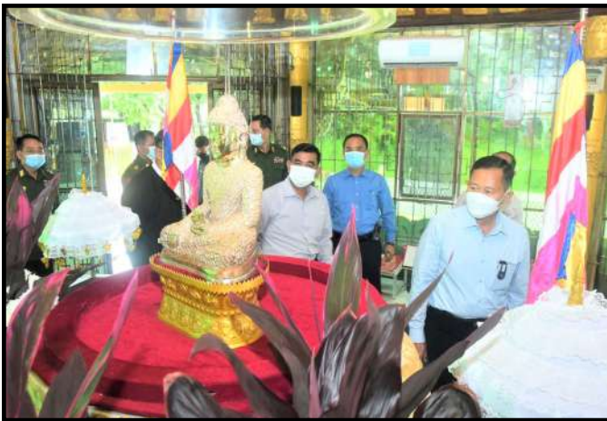
Vice-Chairman of the State Administration Council making cash donations after paying homage to Lawkananda pagoda in Sittwe