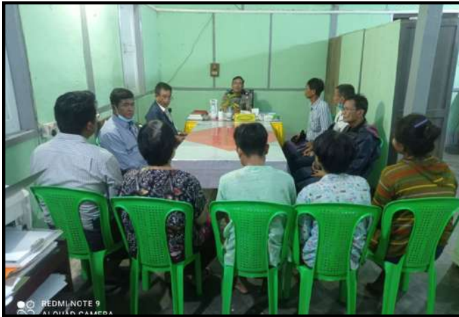
Kyun Pyaw town of Ayeyarwady region