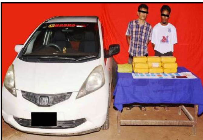
Stimulant tablets worth of over K210 million seized in Phayagyi Township of Bago City in Bago Region