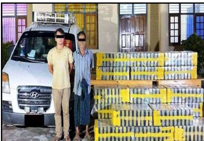
A total of 44 kg of Heroin worth of K660 million seized in Nawngkhio Township of Shan State (North)