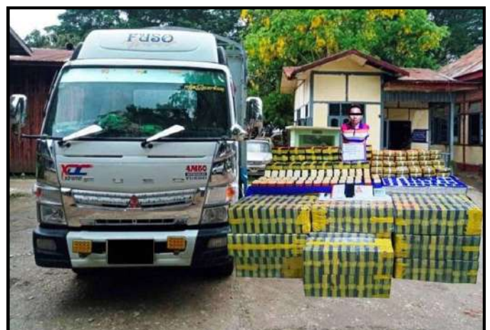
Heroin and stimulant tablets worth of over K1 billion seized in Mohnyin Township of Kachin State