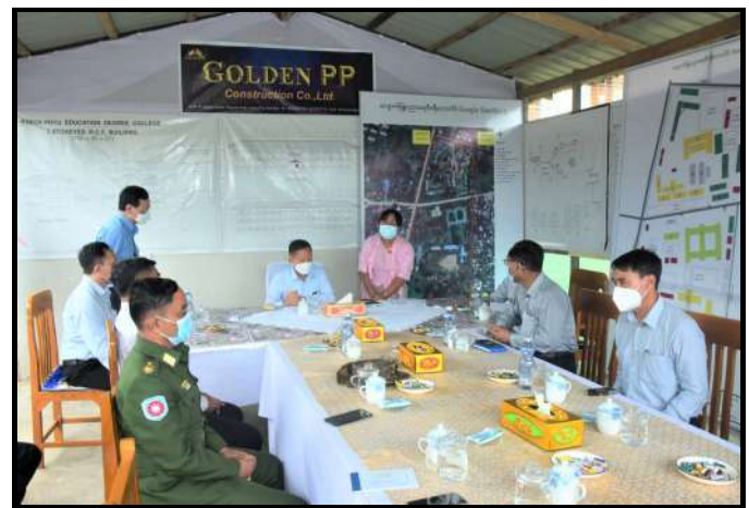
Vice-Chairman of the State Administration Council making discussions at the Kyaukpyu Education College

tion rate of 8.59 cents per 1 unit, and contribute to local.