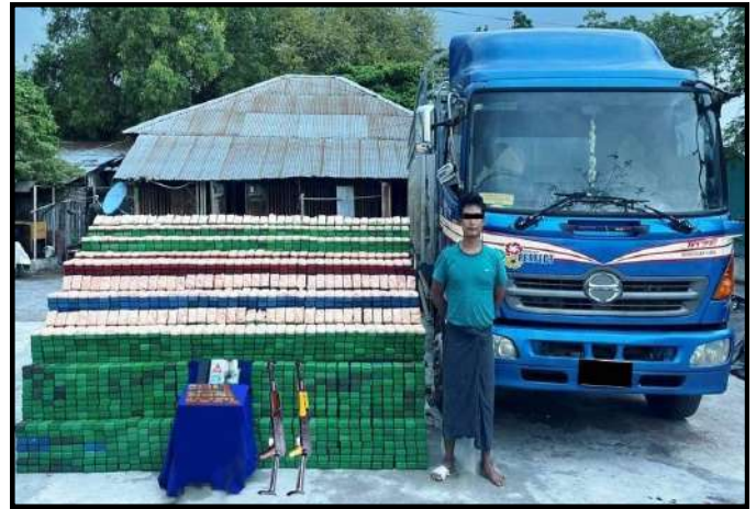
A total of 33 kg of Heroin worth of K825 million seized in Patheingyi Township of Mandalay Region