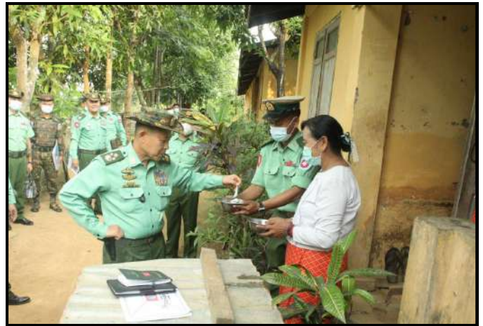
Vice-Chairman of the State Administration Council Deputy Commander-in-Chief of Defence Services inspecting the housings of families at the local battalion in Kyauktaw station