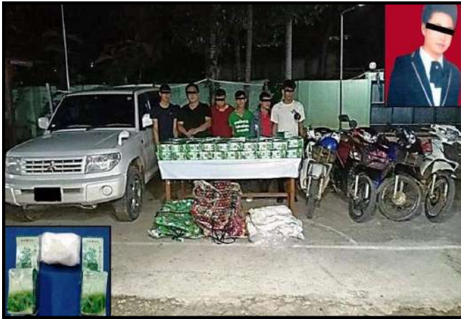
150 kg of Ketamine worth of K1.275 billion seized in Mongpyin Township of Shan State (East)