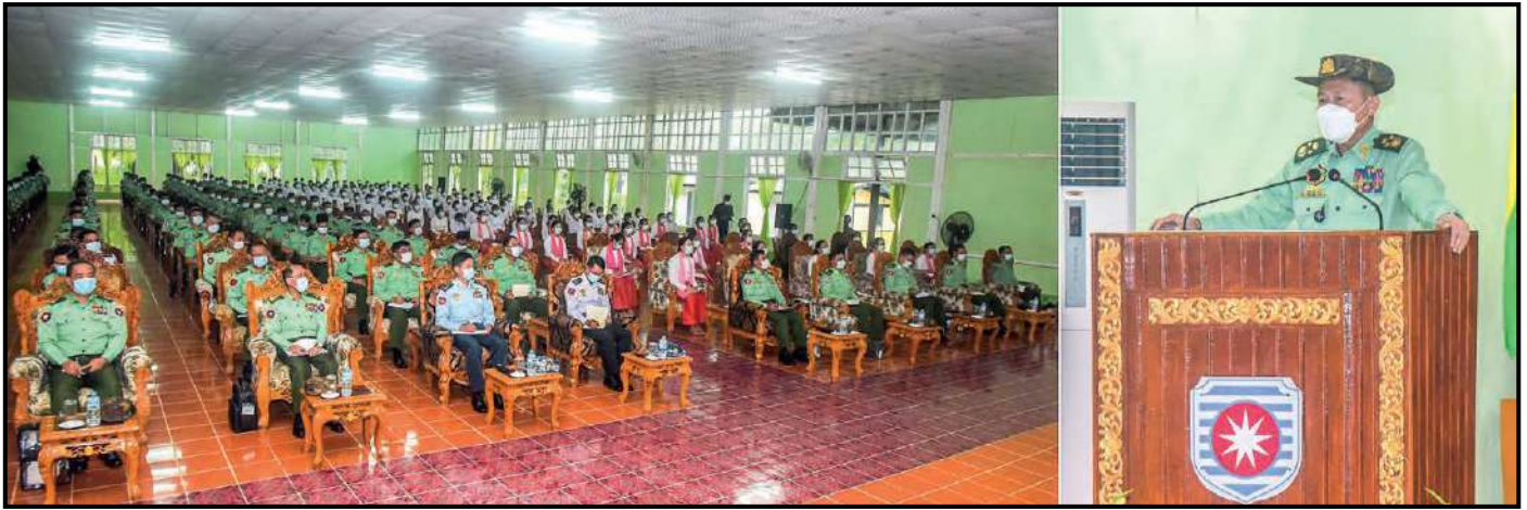
Vice-Chairman of the State Administration Council Deputy Commander-in-Chief of Defence Services delivering speech at the meeting with officers, other ranks and family members in Sittwe station