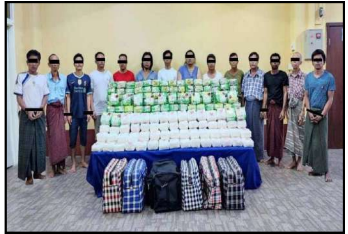
Ice (crystal meth) worth of over K6.2 billion that will be transported to Malaysia seized in North Okkalapa Township of Yangon Region