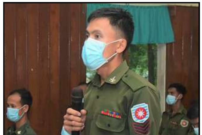
Vice-Chairman of the State Administration Council Deputy Commander-in-Chief of Defence Services hearing reports presented by Tatmadaw members and families from the respective military stations