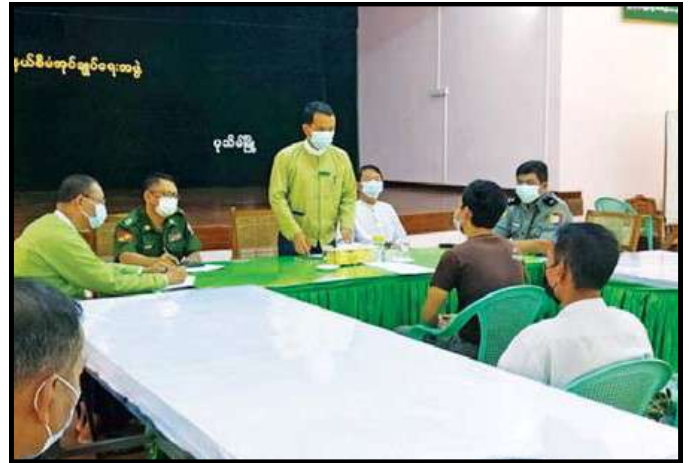
Patheingyi city of Ayeyarwady region