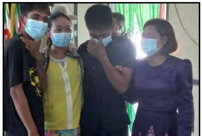
Aungmyaethazan township of Mandalay region