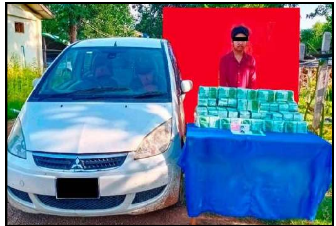
Ketamine worth of over K500 million seized in Kunhein Township of Shan State (South)