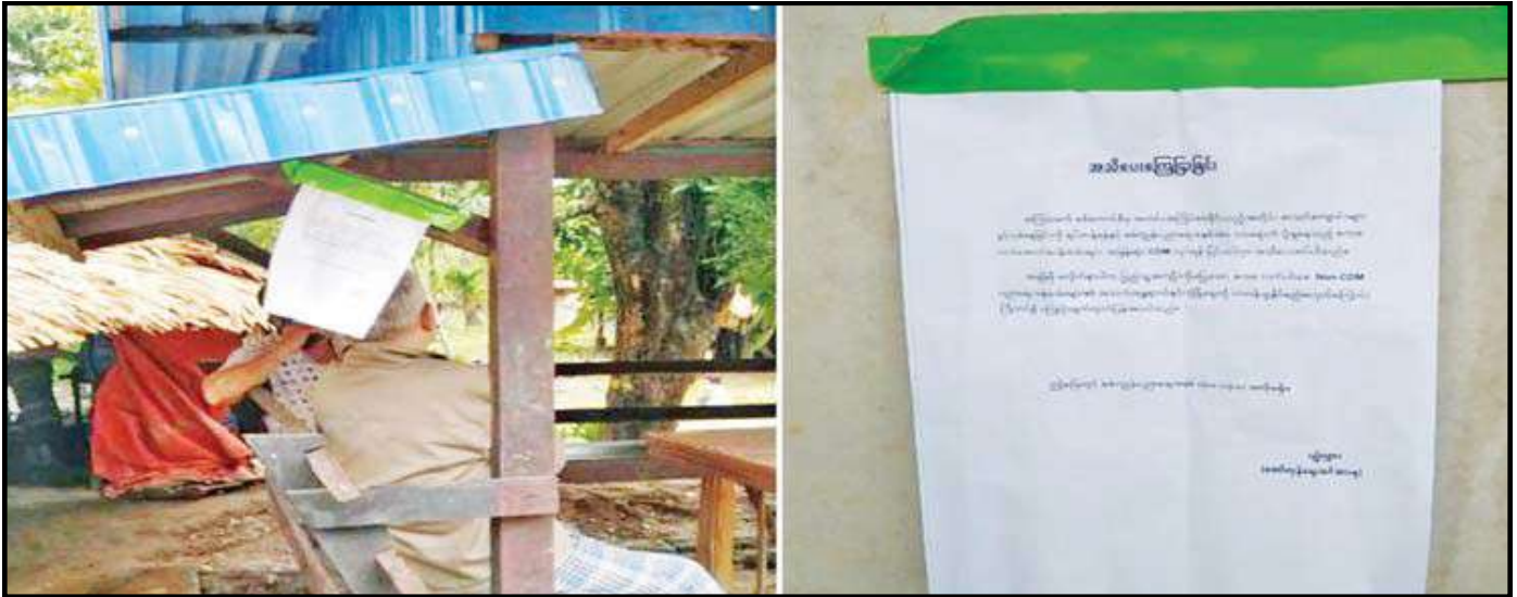
The threatening letter to the teacher pasted by terrorists at the Basic Education High School (Taung Soun) in Ye Township