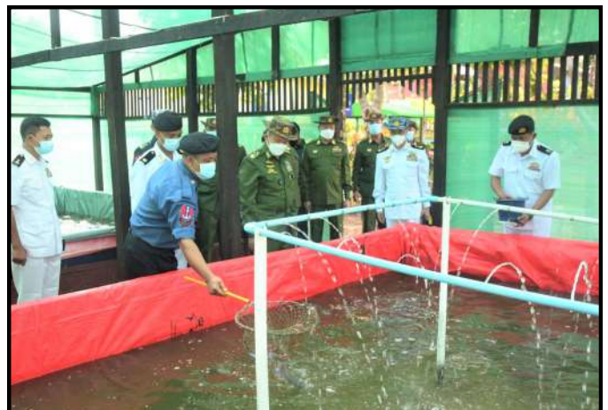
Vice-Chairman of the State Administration Council Deputy Commander-in-Chief of Defence Services inspecting the breeding tasks of the Danyawady Naval Region Command HQ