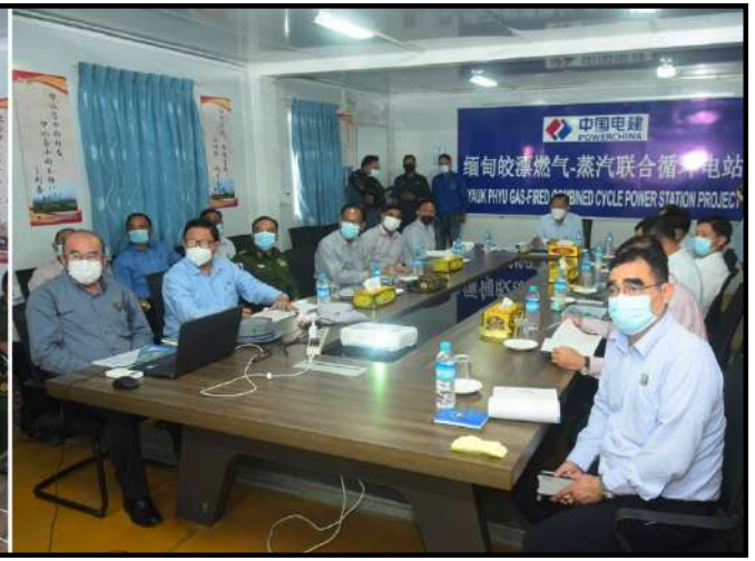
Vice-Chairman of the State Administration Council Vice-Senior General Soe Win hearing reports on the implementation progress of the project presented by in-charge and deputy manager of the project