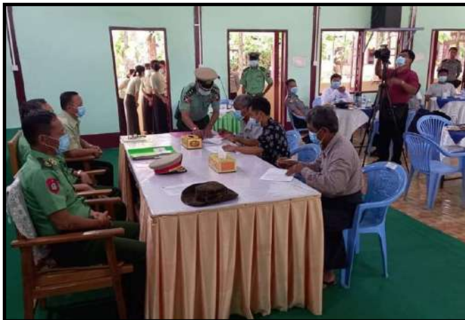
Ngazun township of Magway region