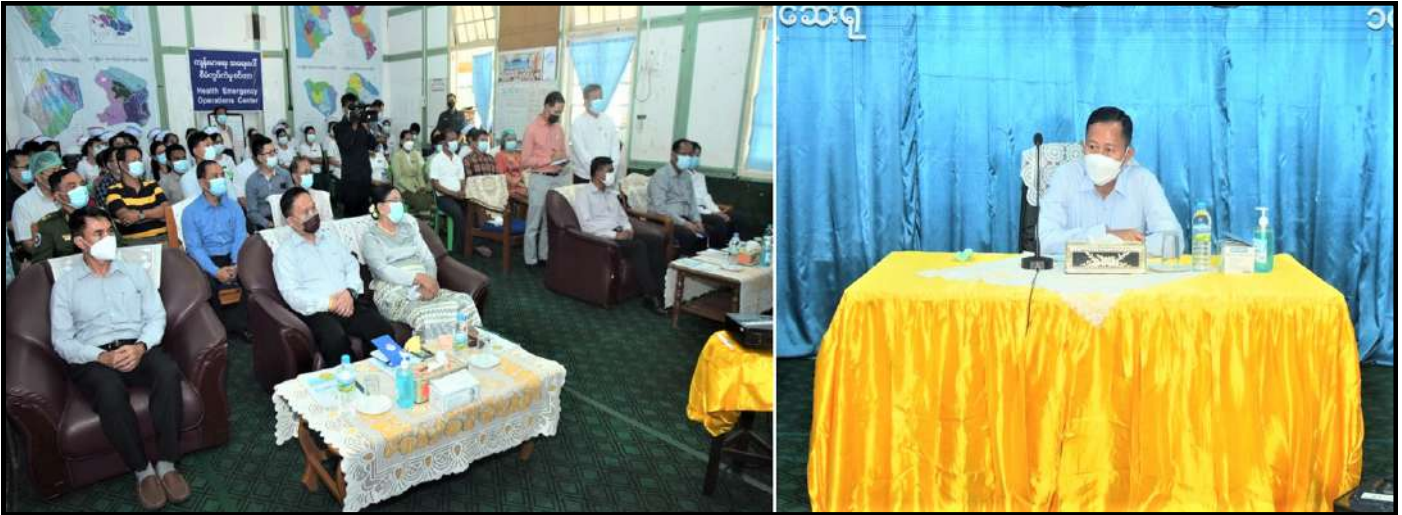
Vice-Chairman of the State Administration Council delivering speech at the meeting with the head and medical staff of the public hospital of Kyaukpyu