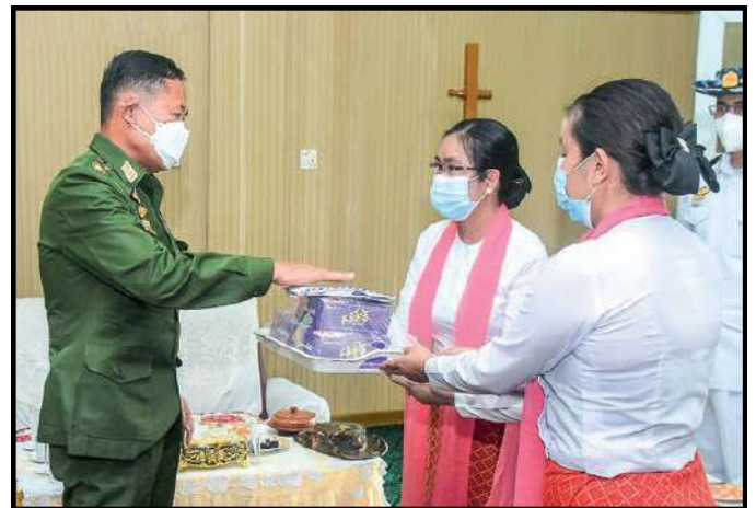
Vice-Chairman of the State Administration Council Deputy Commander-in-Chief of Defence Services presenting foodstuffs for officers, other ranks and their family members in the respective military stations