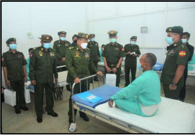
Vice-Chairman of the State Administration Council presenting foodstuffs after encouraging military personnel receiving medical treatments at the military hospital of Sittwe