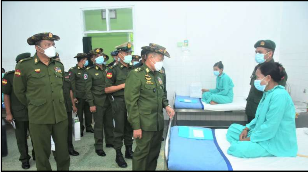
Vice-Chairman of the State Administration Council encouraging a family member of Tatmadaw receiving medical treatments at military hospital of Sittwe

Vice Chairman of the State Administration Council Deputy Commander-in-Chief of Defence Services Commander-in-Chief (Army) Vice-Senior General Soe Win accompanied with the Tatmadaw senior officials comforted officers, other ranks and their family members receiving medical treatment at the military hospital in Sittwe and also presented foodstuffs and supplies to them.