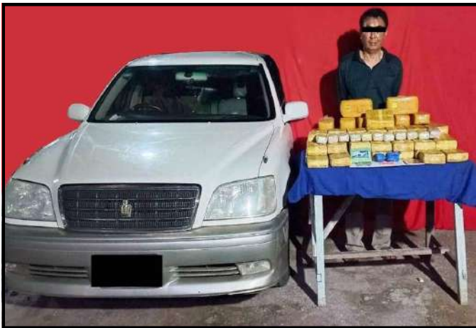
Stimulant tablets worth of K162 million seized in Loilem Township of Shan State (South)