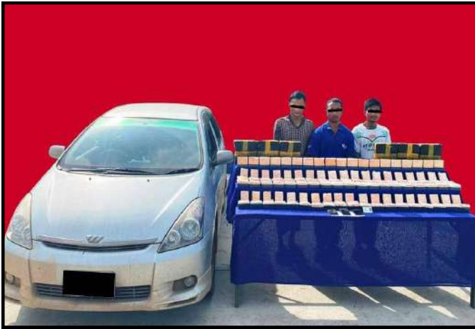
2.232 kg of Heroin worth of K22.32 million seized in Muse Township of Shan State (North)