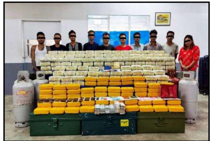
5,000,000 stimulant tablets worth of K5 billion seized in Mingaladon Township of Yangon Region