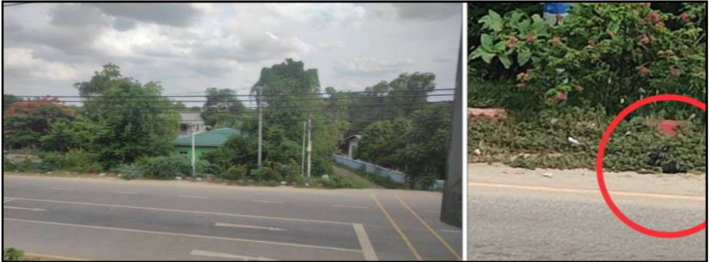
The location showing three IEDs planted by PDF terrorists in the compound of ChaungU Basic Education High School in Chaung U Township

Using various means, PDF terrorists, with destructive emotions, are making destructive acts against the government's efforts on education sector development such as intimidation and coercion of students, teachers and parents; abductions and killings of students, teachers and parents; arson and bombing attacks on educational buildings; putting textbooks and teaching/learning aids to the torch and disturbing the distribution of textbooks. Their doings are as follows: