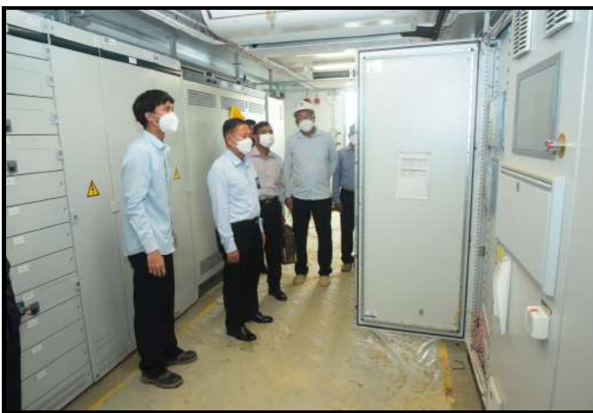
Vice-Chairman of the State Administration Council observing the electrical equipment in the plant