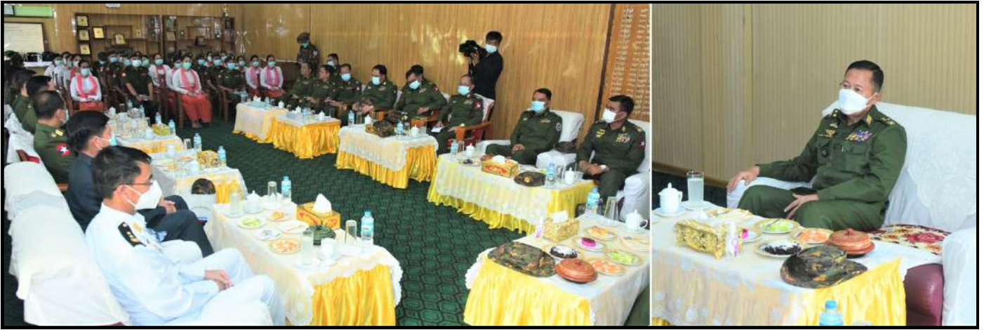
Vice-Chairman of the State Administration Council Deputy Commander-in-Chief of Defence Services delivering speech at the meeting with officers, other ranks and family members in Kyaukpyu station

yawady Naval Region Command HQ. The station and cordially greeted them. Vice-Senior General visited the housings of families at the local battalion in Kyauktaw