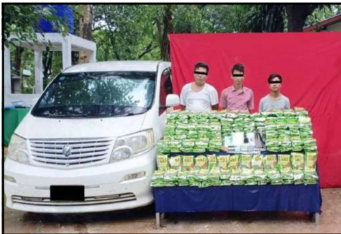
Ice (crystal meth) worth of over K5 billion seized in Hpa-An Township of Kayin State