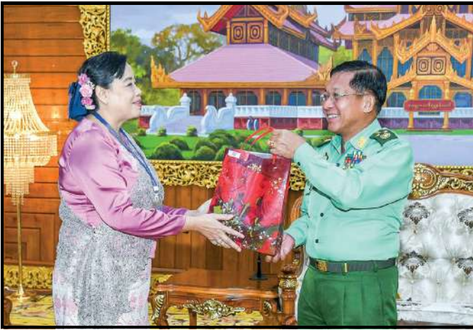
Chairman of the State Administration Council Commander-in-Chief of Defence Services and a peace delegation led by Vice-Chair of the Arakan Liberation Party exchanging commemorative gifts