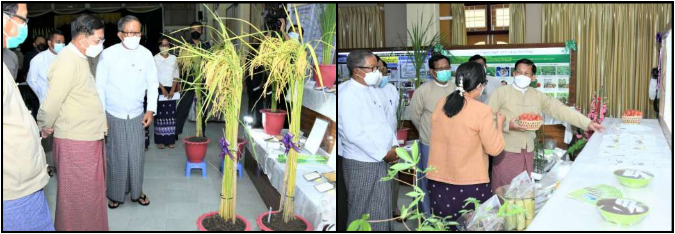
Chairman of the State Administration Council Prime Minister viewing round the exhibits of the Agricultural Research Department