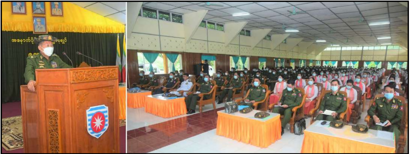
Vice-Chairman of the State Administration Council Deputy Commander-in-Chief of Defence Services delivering speech at the meeting with officers, other ranks and family members in Ann station