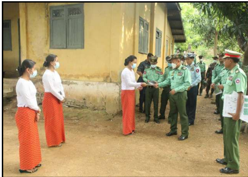
Vice-Chairman of the State Administration Council Deputy Commander-in-Chief of Defence Services cordially greeting family members staying at the housings of families of the local battalions from respective military stations