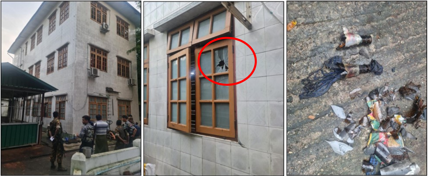
Damages of religious building of Ywama Pariyatti Monastery in Insein Township in the aftermath of petrol bombs attack of terrorists