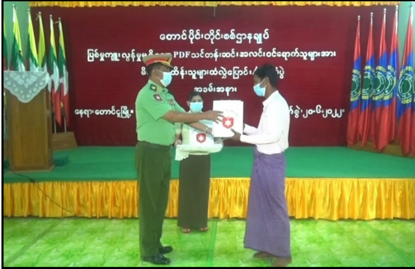
An official of Southern Command presenting aids to a PDF member from Taungoo Township with no crime records returned to legal fold

The ceremonies of entrusting PDF members, who completed trainings in the areas of some EAOs and returned to legal fold without committing any crime, to their respective parents were held on 20 June. The officials from the regional governments provided cash assistance to three male PDF members from Salin township of Magway region and six male PDF members from Taungoo township of Bago region. They were entrusted to the care of their parents and guardians.