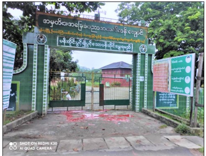
Threatening letters hanged at the entrance door of No (1) Basic Education High School of Mogaung Township at the scene

of textbooks and taking those forcibly. Their doings are as follows: