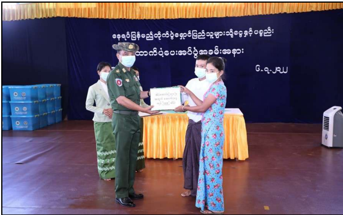
Officials providing relief supplies to the IPDs who will return to their respective homes from the camps in Ann township

On 6 July, Rakhine state Government and officials from Rakhine State Disaster Management Department and Western Command provided cash assistance, rice and relief supplies to the IPDs of 151 households returning to their homes from camps in Kazu Kaing village tract and Dalet village tract of Ann township of Rakhine state and family members of the households received the assistance.