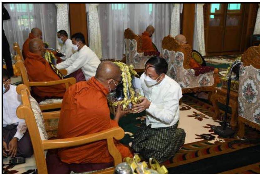
Commander-in-Chief (Navy) General Tun Aung offering Waso robe to member of the Sangha