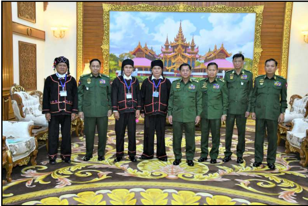
Commander-in-Chief of Defence Services and the peace representatives led by General Secretary of the Lahu Democratic Union taking a commemorative photo