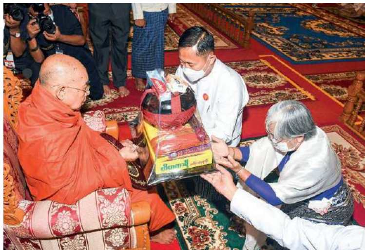
Deputy Prime Minister and wife offering Waso robe to Sayadaw of Sasana Wepulla Pali Tekkatho Monastery