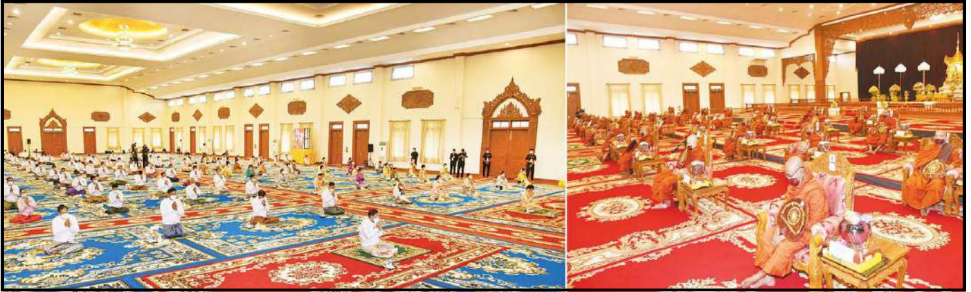
Prime Minister and congregation listening to the Five Precepts by Bhamo Sayadaw