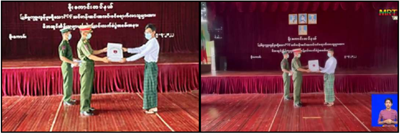
An official providing aids to a PDF member without committing crimes who take refuge in security forces in Mogaung station