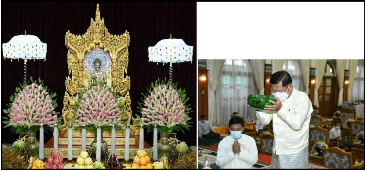
Commander-in-Chief of Defence Services offering meals in the emerald alms-bowl, flowers, water and oil lights to the Buddha image in the Anawrahta Hall