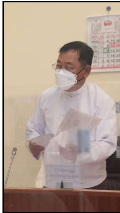
Union Minister Lt-Gen Soe Htut making discussion in the meeting