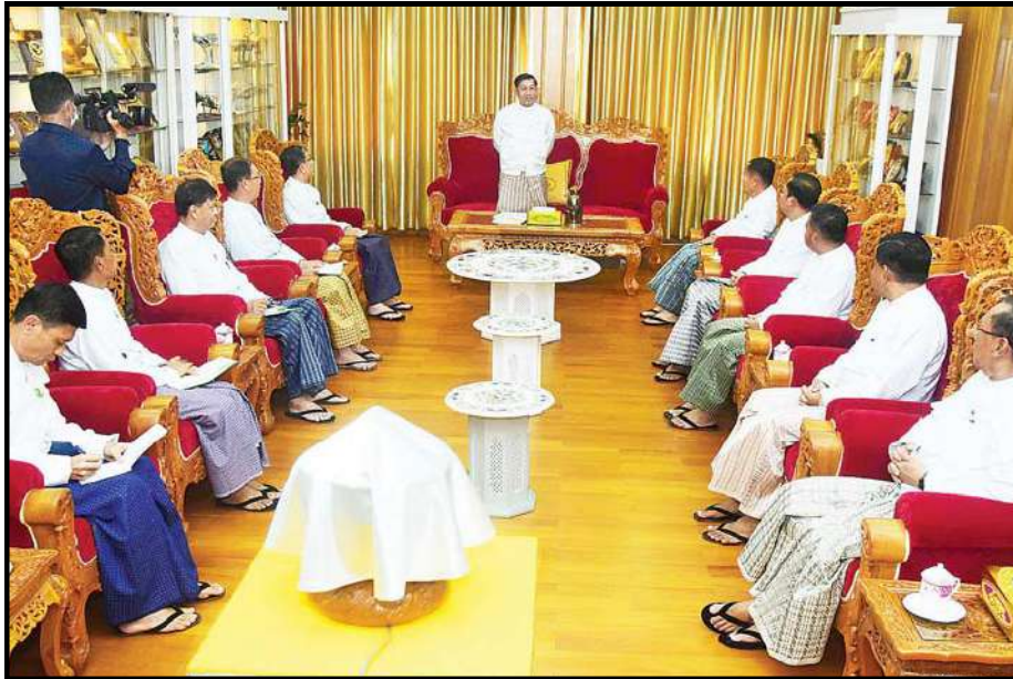
Prime Minister delivering speech at the ceremony to donate the 2,789.25-carat ruby by the Tatmadaw to the State