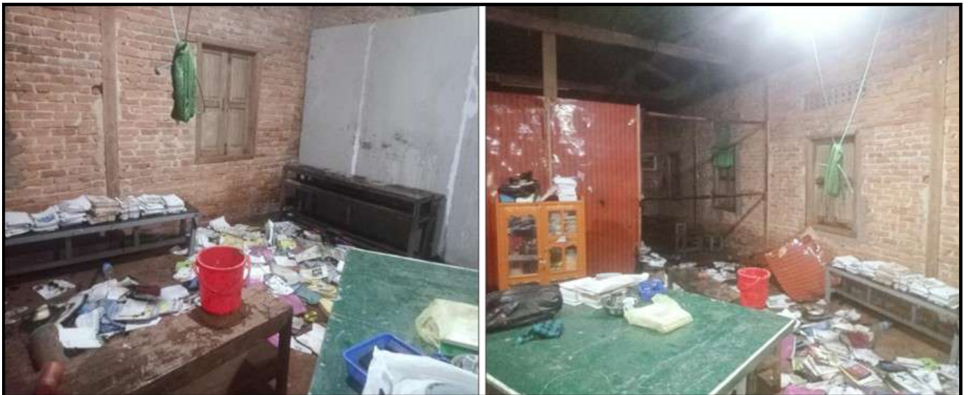
Damages of the school furniture of the Basic Education Sub-High School in Shwegyin Township in the aftermath of arson attacks of PDF terrorists

With nefarious intentions to make students, teachers and parents scared and create uneducated classes in society, the NUG's affiliate terrorists upholding extreme political dogma, are using various means such as bomb and arson attacks against schools, the country's major infrastructure for education sector.