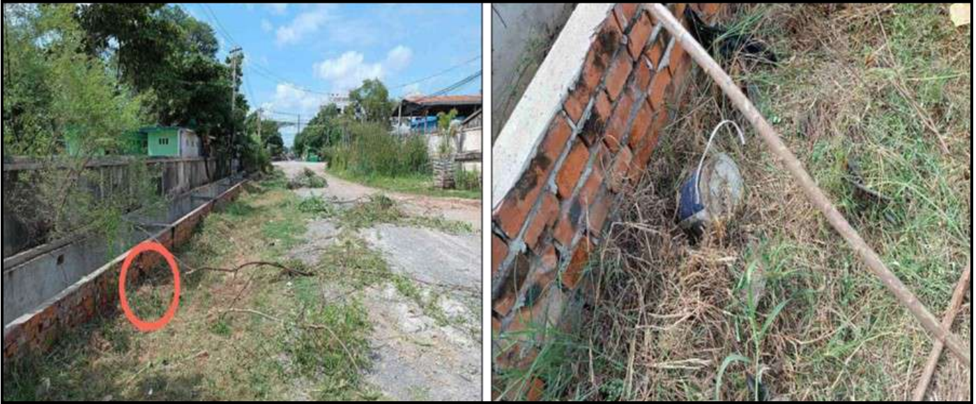
An IED planted by terrorists found near the drainage outside the brick wall at the back side of No (27) Basic Education High School in the ward (I) of Pyigyitagon township

Security forces are reportedly carrying out necessary investigations to identify and arrest those who were involved in the heinous crimes and take punitive legal action against them. The entire national people were urged to oppose terrorist groups and