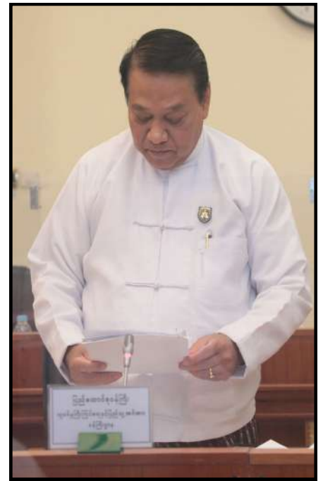
Union Minister U Khin Yi making discussion in the meeting