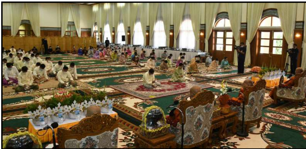
Commander-in-Chief of Defence Services and wife, and the congregation sharing the merits gained after receiving a sermon delivered by Sayadaw of Sasana Wepulla Pali Tekkatho Monastery