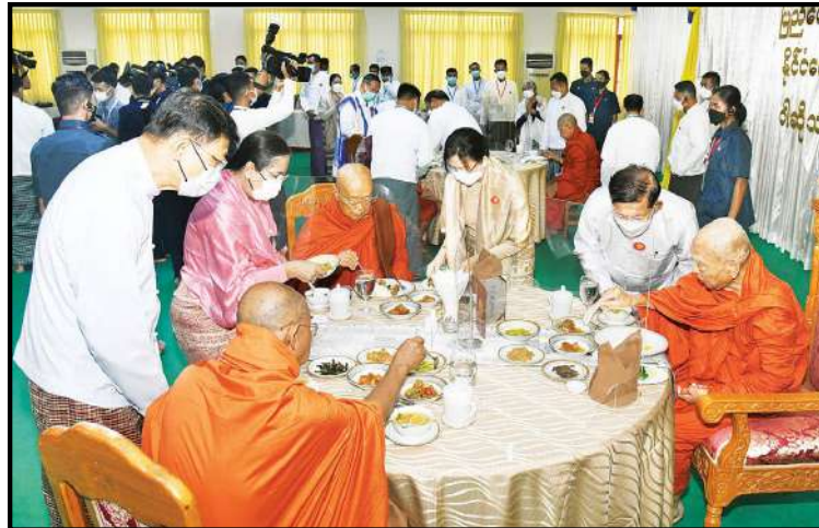
Prime Minister and wife offering day meals to members of the Sangha