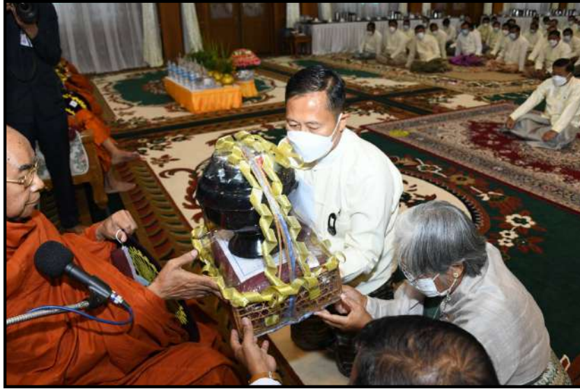
Deputy Commander-in-Chief of Defence Services and wife offering Waso robe to Sayadaw of Sasana Wepulla Pali Tekkatho Monastery