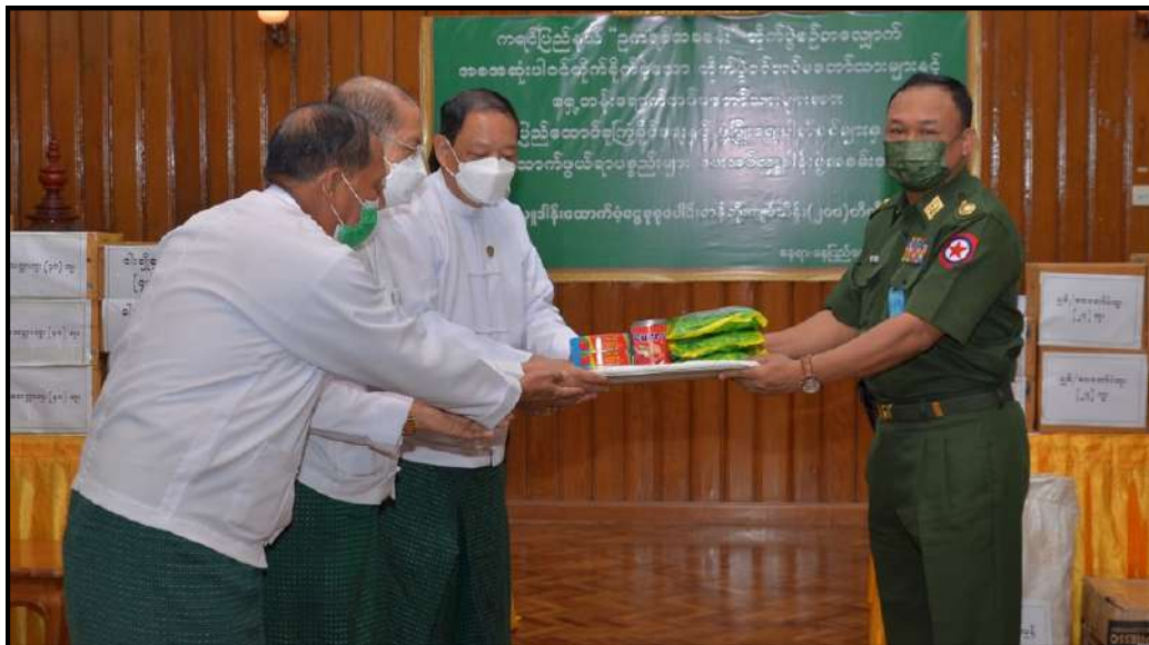
Secretary General of Union Solidarity and Development Party providing food items to Tatmadaw personnel discharging the security duty in Wawlay area through Nay Pyi Taw Command

The officials and generous donors are providing honourable cash awards and foodstuffs to Tatmadaw personnel discharging the duties of security and area dominance in Wawlay area of Myawady township in Kayin state on 4 and 6 July as follows: