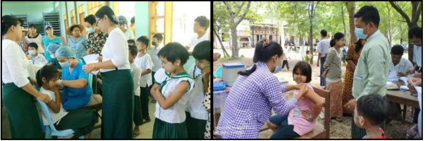
Students being vaccinated against COVID-19 in respective regions and states

COVID-19. About 29.77 million people have received two-time full doses of the vaccine, 5.9 million people have received the first doses and 3.7 million people have been vaccinated against COVID-19 booster doses. A total of 69.16 million people have been inoculated against COVID-19 in Myanmar.