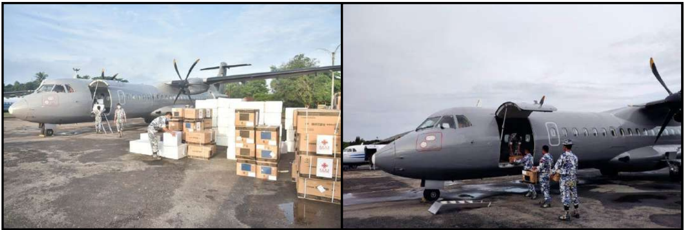
Distribution of COVID-19 vaccines to respective regions and states using Military aircraft

The Ministry of Health has carried out COVID-19 prevention and control activities in respective regions and states by designating targeted groups and accordingly, vaccination process is being accelerated-