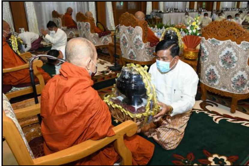
Chief of General Staff (Army, Navy and Air) General Maung Maung Aye offering Waso robe to member of the Sangha