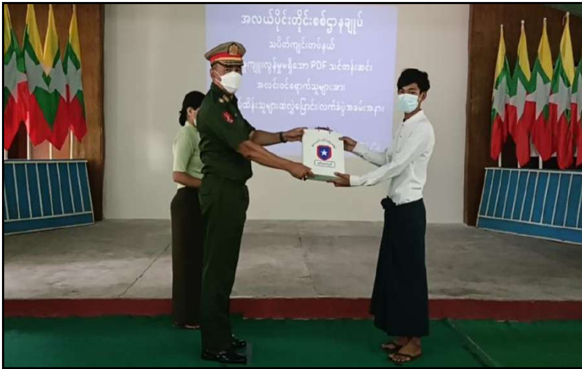
An official providing aids to a PDF member without committing crimes who take refuge in security forces in Thabeikkyin station

The ceremonies of entrusting PDF members, who attended trainings in the areas of some EAOs, committed no crimes and returned to legal fold, to their respective parents were held as follows: