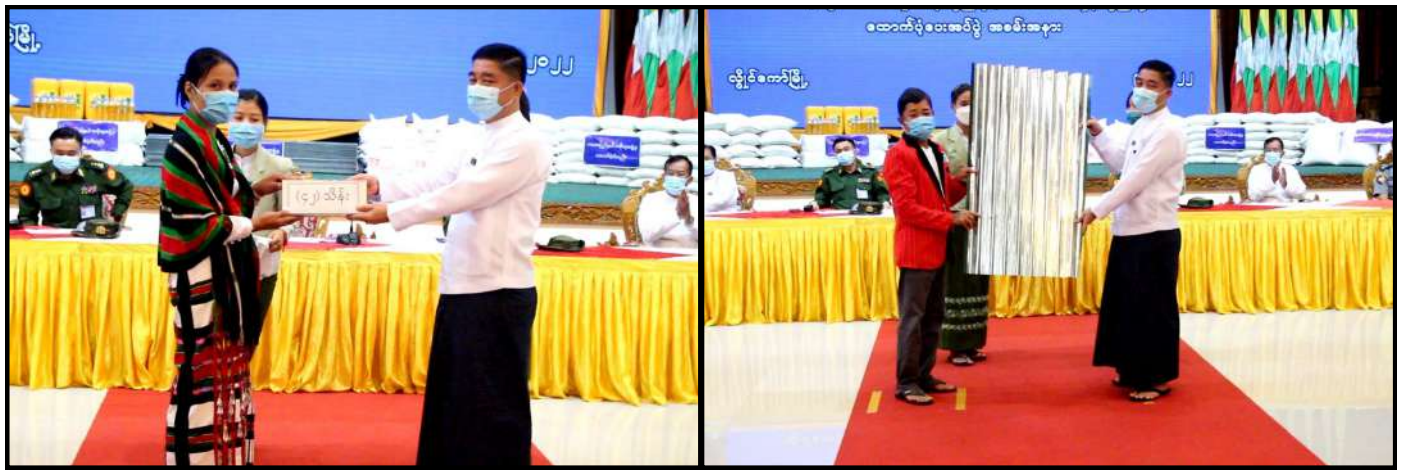
Officials providing relief supplies and cash assistances to the IPDs from the camps and for the damaged religious buildings in Loikaw township of Kayah state