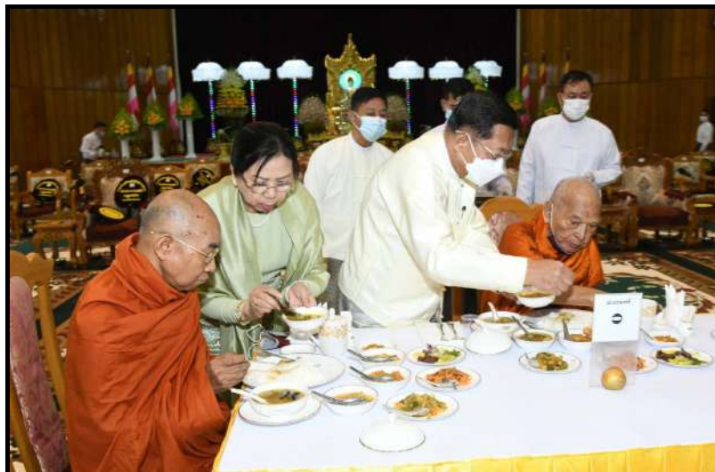
Commander-in-Chief of Defence Services and wife offering day meals to members of the Sangha