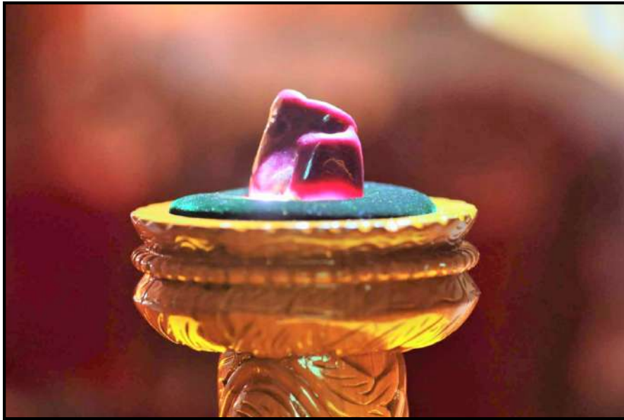
The 2,789.25-carat ruby (NaSaKa Ruby) donated by the Tatmadaw to the State