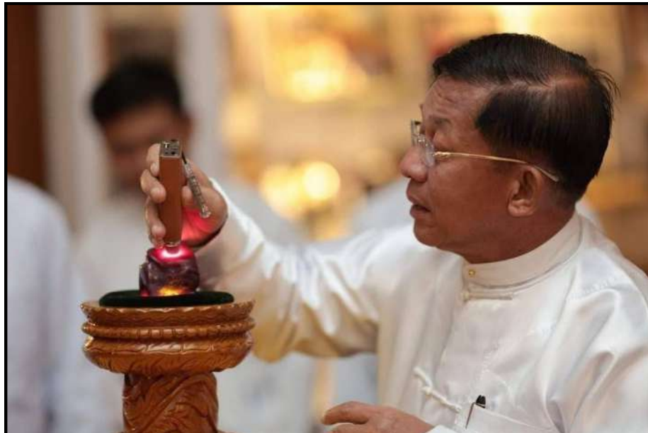
Prime Minister observing the 2,789.25-carat ruby donated by the Tatmadaw to the State