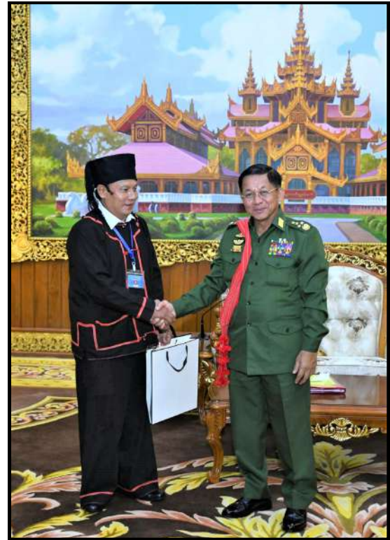
Commander-in-Chief of Defence Services and General Secretary of the Lahu Democratic Union exchanging gifts and souvenirs

It is reported that the peace delegation led by General Secretary Kyar Solomon of the Lahu Democratic Union-LDU arrived in Nay Pyi Taw on 6 July and the delegation was welcomed by members of the National Solidarity and Peacemaking Negotiation Committee and officials as well as the ethnic people of the Cultural Department and pro-peace local residents holding