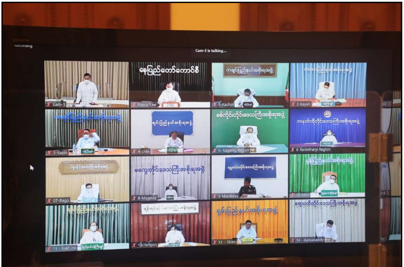
The Nay Pyi Taw Council Chairman, Chief ministers of regions and states and officials participating in the meeting through videoconferencing.