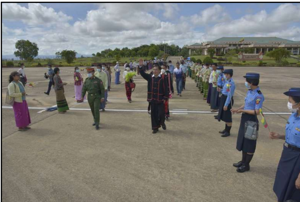
The peace delegation led by General Secretary Kyar Solomon of the Lahu Democratic Union being seen off by the officials