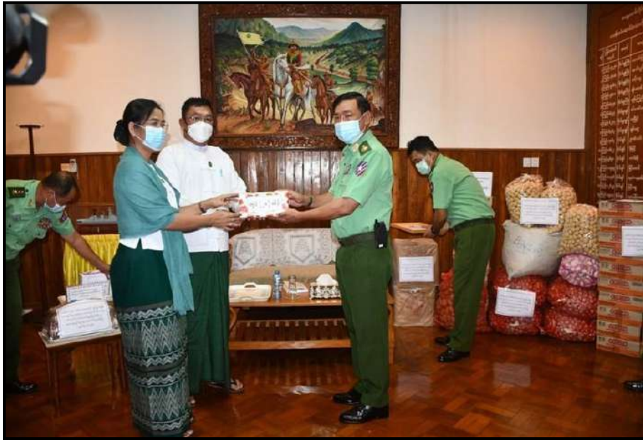
Generous donors providing honourable cash and food items to Tatmadaw personnel discharging the security duty in Wawlay area through Southeast Command