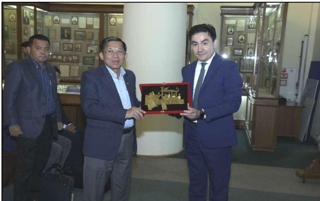
Prime Minister and deputy rector of Kazan Federal University (Kazan State University) exchanging gifts