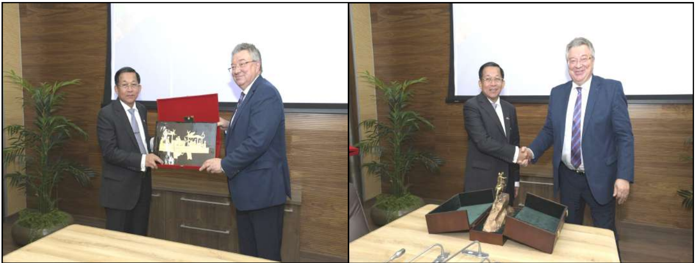
Prime Minister and the rector of the Polytechnic State University in St. Petersburg exchanging commemorative gifts