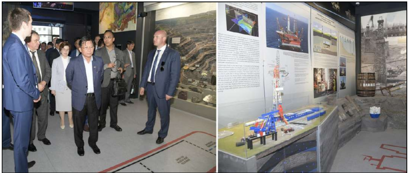
Prime Minister viewing round exhibitions of the Novosibirsk State University

Then, the Senior General and party studied shooting skills of the trainees in the simulator hall and weapons and sights developed by the Russian Armed Forces and the officials explained. The Senior General accepted a historic sight developed by the Russian Armed Forces, which served for 80 years in the Russian Armed Forces, as a gift and returned a souvenir to them.