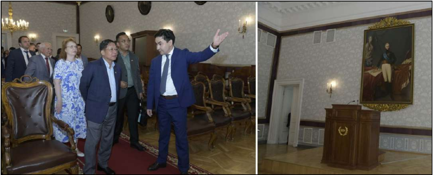
Deputy rector of Kazan Federal University (Kazan State University) conducting Prime Minister round the university