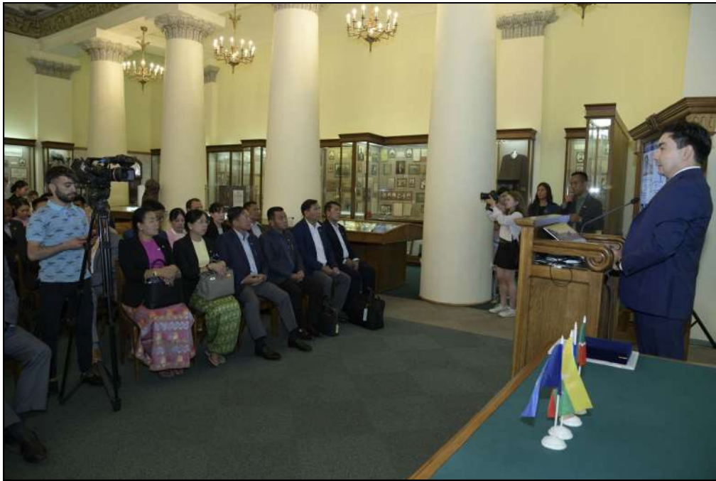
Prime Minister and delegation hearing explanation of the brief history of the university presented by the deputy rector of the Kazan Federal University (Kazan State University)

ments for food and accommodation of students and admission of foreign students presented by the officials of the University. The Chairman of the SAC Prime Minister discussed and raised questions on salient points.