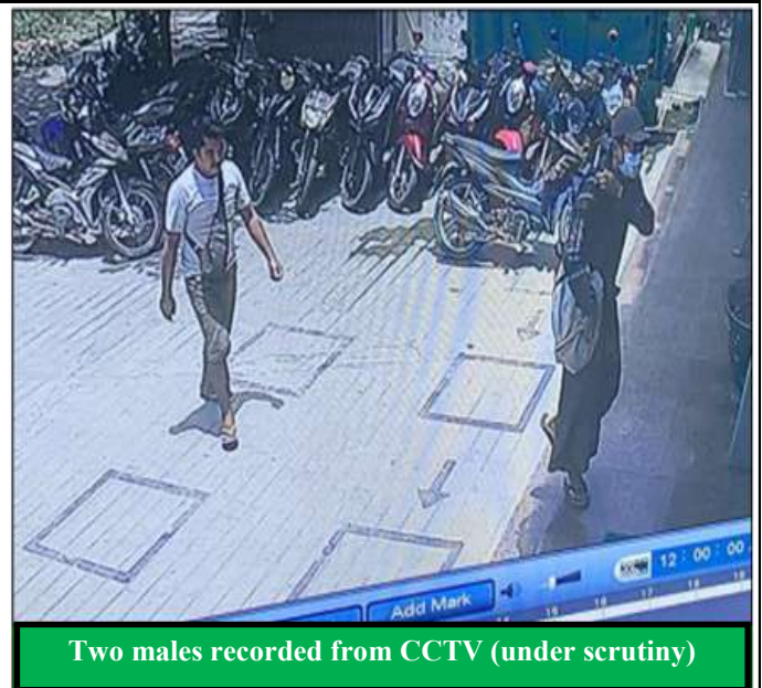
Two gunmen robbed K 135 million from KBZ Branch 42 (Industrial Park Branch) at gunpoint in Pyigyidagun township

It is reported that two gunmen robbed 135 million kyats from the KBZ Branch 42 (Industrial Park Branch) at gunpoint in Pyigyidagun township of Mandalay region.