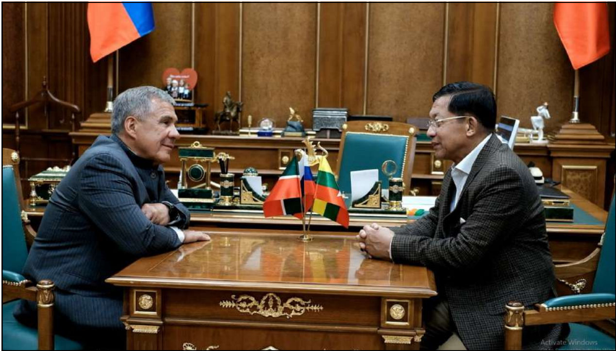
Prime Minister and President of the Republic of the Tatarstan holding a private talk