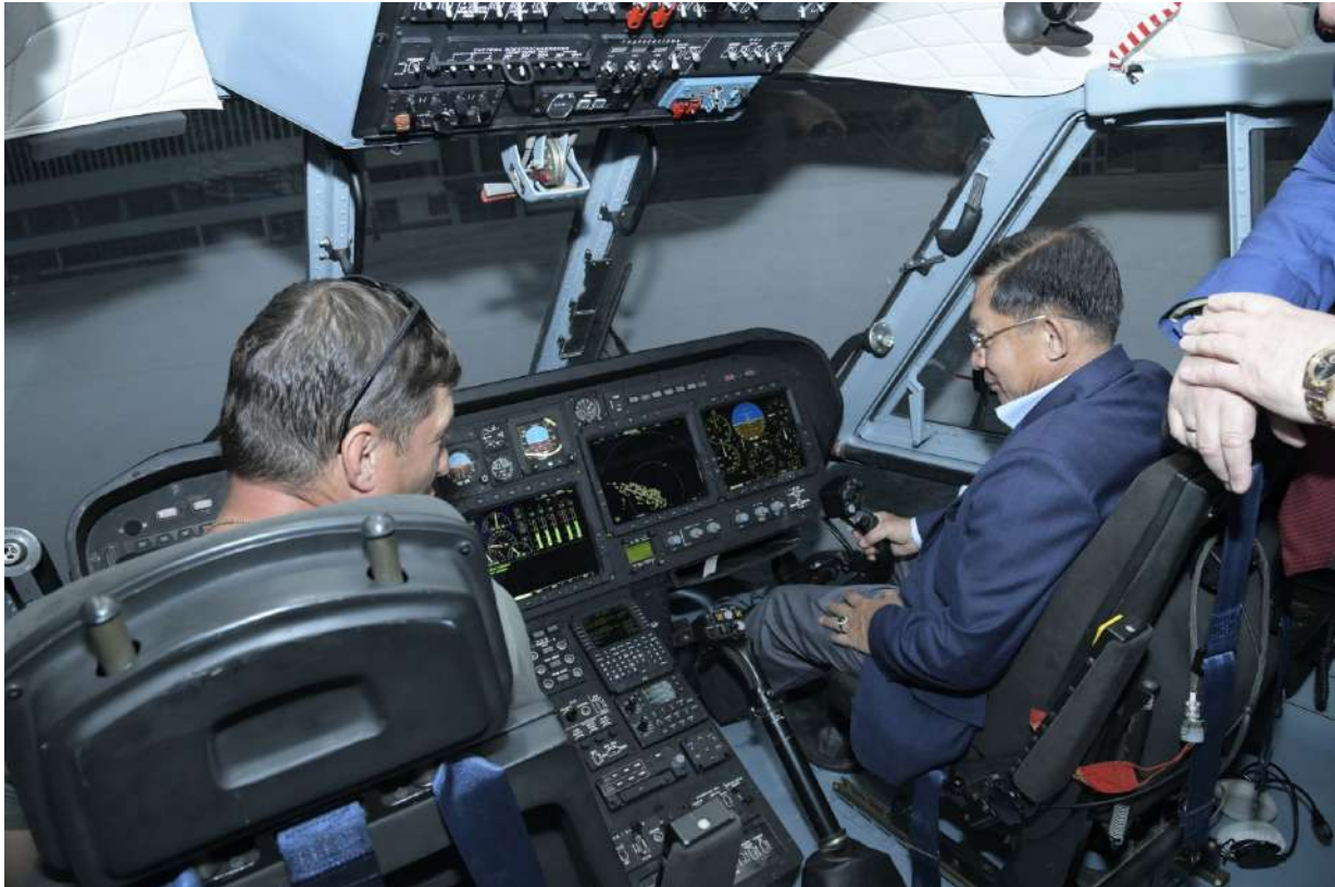
Prime Minister driving the helicopter at PJSC “Kazan Helicopters” plant with the use of a simulator

airport by officials of the Republic of the Tatarstan. At Pulkovo International Airport of St. Petersburg, the Prime Minister and