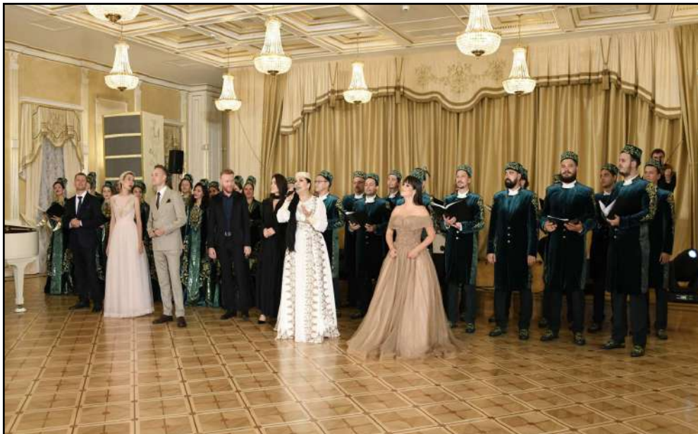
A traditional music troupe of the Republic of the Tatarstan performing folk songs and cultural dances