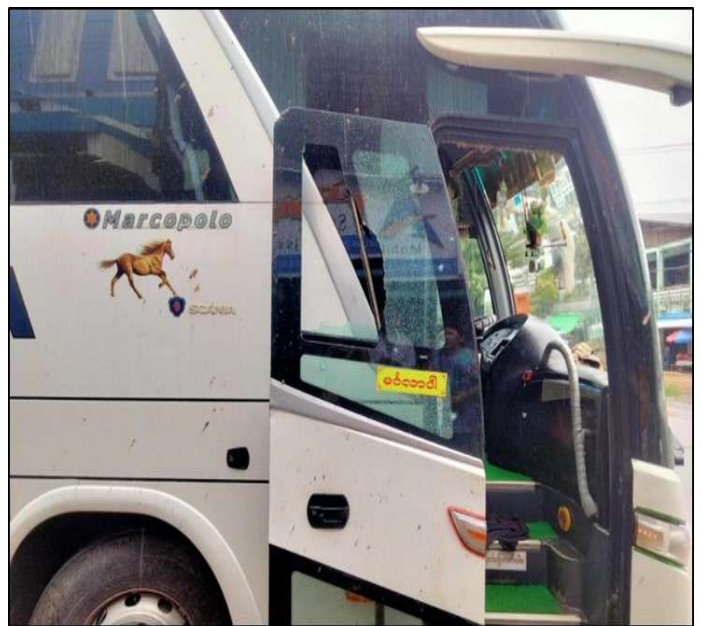
A vehicle damaged and driver U Aung Ko Oo got injuries in the aftermath of IEDs attack of the so-called PDF terrorist group