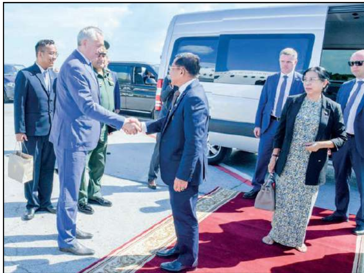
Prime Minister and wife seen off at the Tolmachevo Airport by officials of the Novosibirsk government, the commandant of the Higher Military Command School and officials