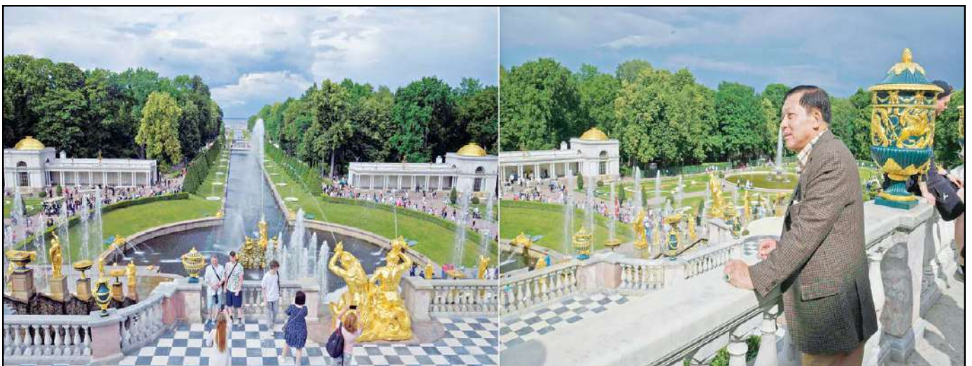
Prime Minister viewing round Peterhof (Summer Palace)