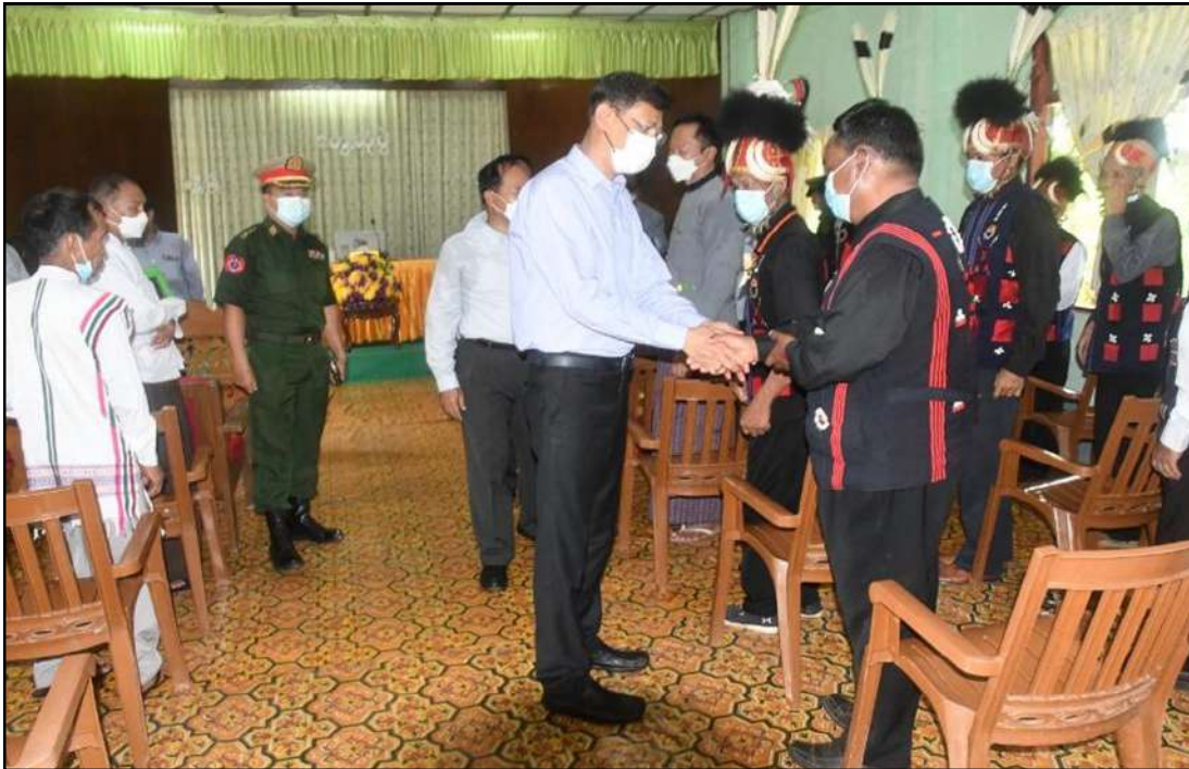
Member of the State Administration Council Union Minister for Defence General Mya Tun Oo cordially greeting attendees of the meeting in Hkamti township

The State Administration Council member Union Minister for Defence General Mya Tun Oo, accompanied by the Sagaing Region chief minister, the regional military commander and officials, met town elders, local ethnic people, district and township-level officials in Khamti town on 13 July and in Lahe town on 14 July, in Homalin town on 15 July, and in Monywa as well as Sagaing towns on 16 July respectively. On the reports regarding regional development activities by the officials, the Union minister fulfilled the needs; provided them with foodstuffs; and cordially greeted the attendees.