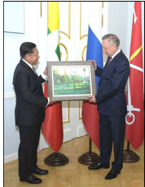
Prime Minister and Head of the St. Petersburg Government exchanging gifts