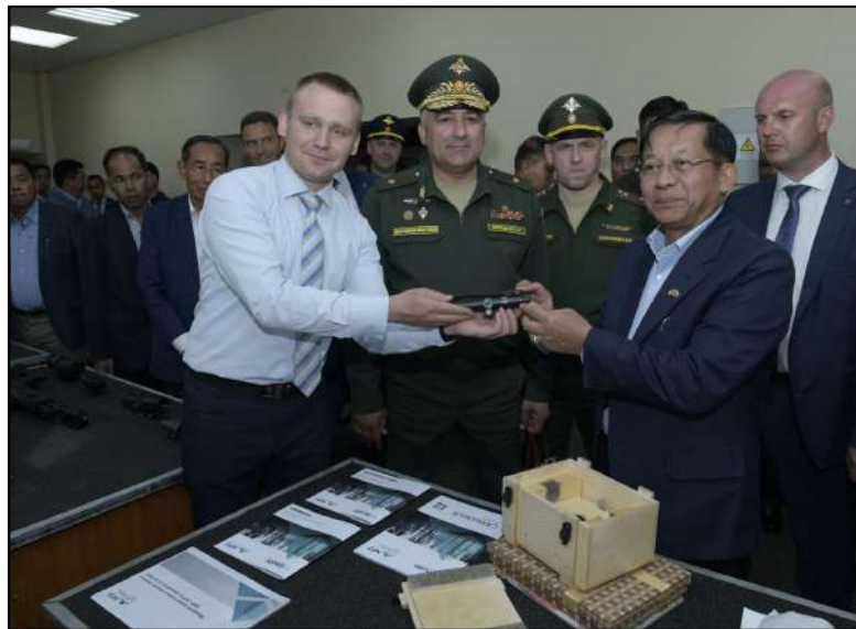
Prime Minister receiving a historic sight developed by the Russian Armed Forces which served for 80 years in the Russian Armed Forces, as a commemorative gift