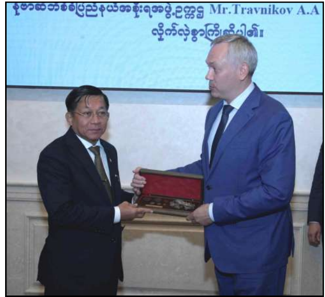
Prime Minister and Head of Novosibirsk Government exchanging gifts