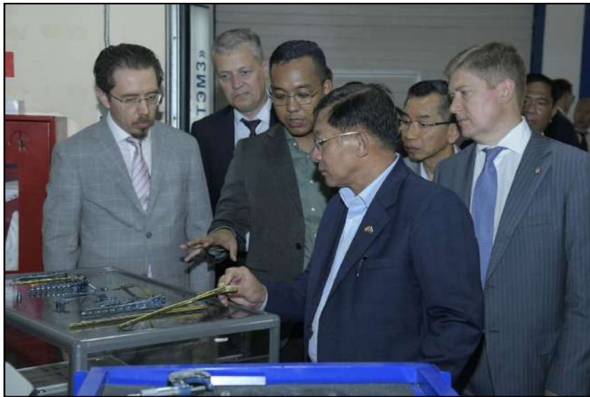
Prime Minister observing products manufactured by entrepreneurs working in HIMGRAD Industrial Complex