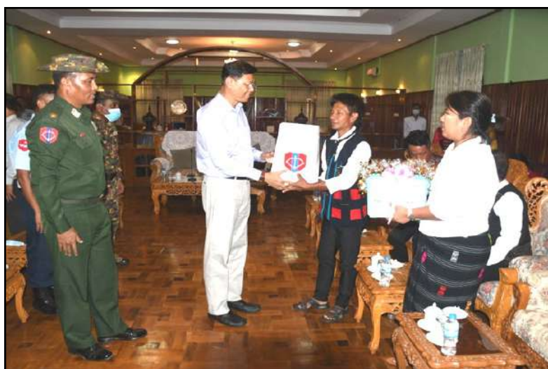
Member of the State Administration Council Union Minister for Defence General Mya Tun Oo presenting foodstuffs to traditional cultural group