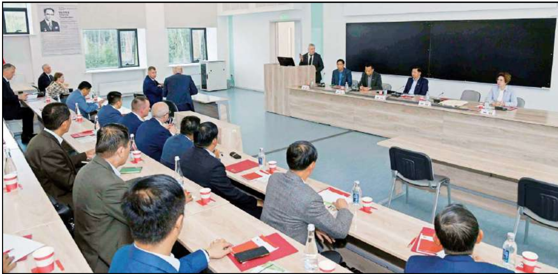
Prime Minister watching the video file of the lecture section of Novosibirsk State University played by the rector