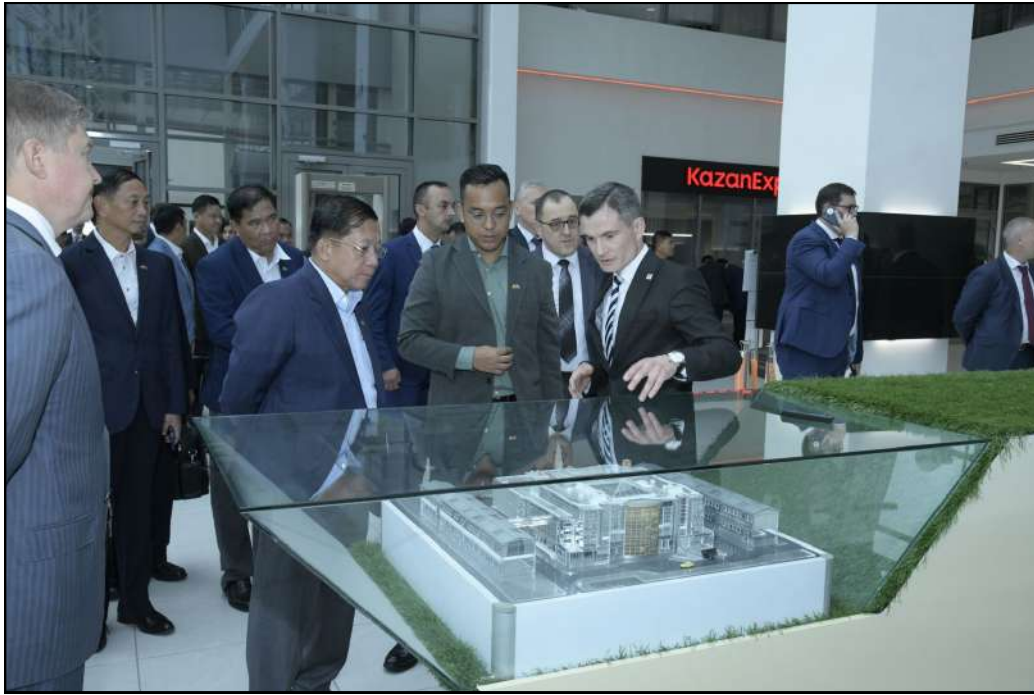
Prime Minister and delegation viewing round the Kazan Hi-Technology Park (IT Park)