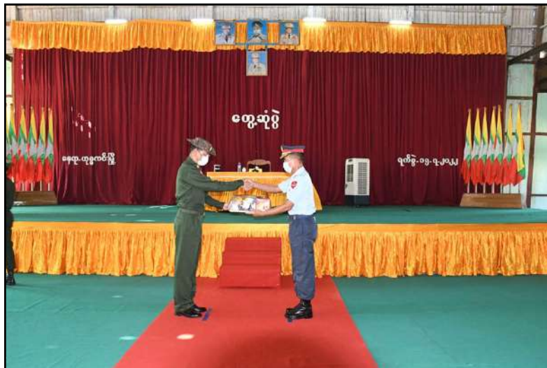
Member of the State Administration Council Union Minister for Defence General Mya Tun Oo presenting foodstuffs to officers, other ranks and their family members in Homalin station