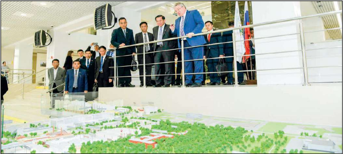
Prime Minister hearing reports on location of the buildings with the help of scale models presented by the rector of the Polytechnic State University in St. Petersburg

Peter used the palace as a summer palace. The fountains inside the palace and park were completely renovated in 1950 and are still in good condition today. Fountains are usually closed during the winter and the rest of the season, and only open in the summer, it is reported.