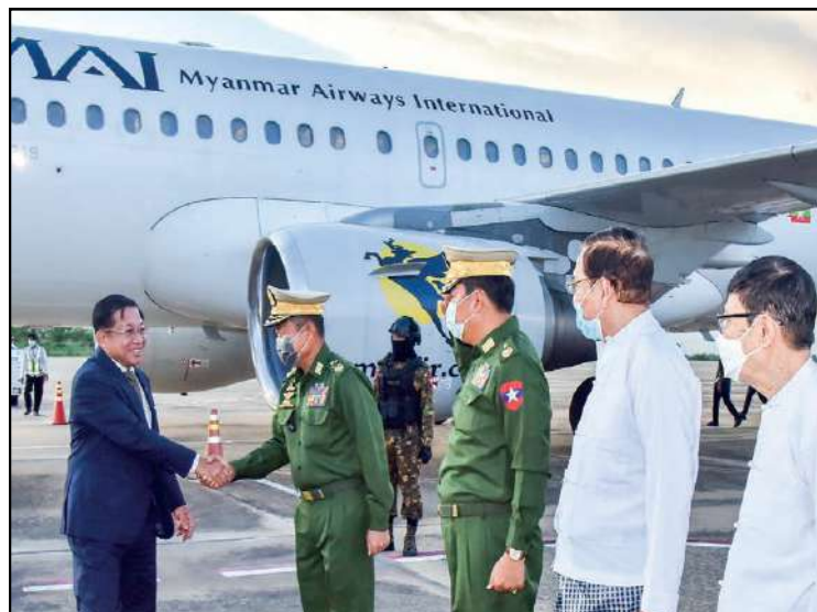
Prime Minister welcomed at the Nay Pyi Taw military airport by Deputy Commander-in-Chief of Defence Services Commander-in-Chief (Army) and officials