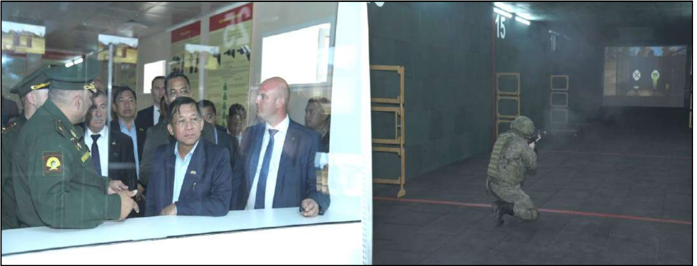
Prime Minister observing shooting skills of the trainees in the simulator hall of the Higher Military Command School