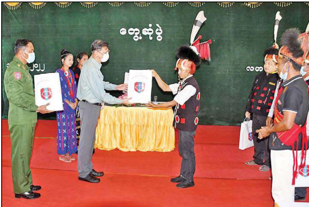
Member of the State Administration Council Union Minister for Defence General Mya Tun Oo presenting foodstuffs to an ethnic people