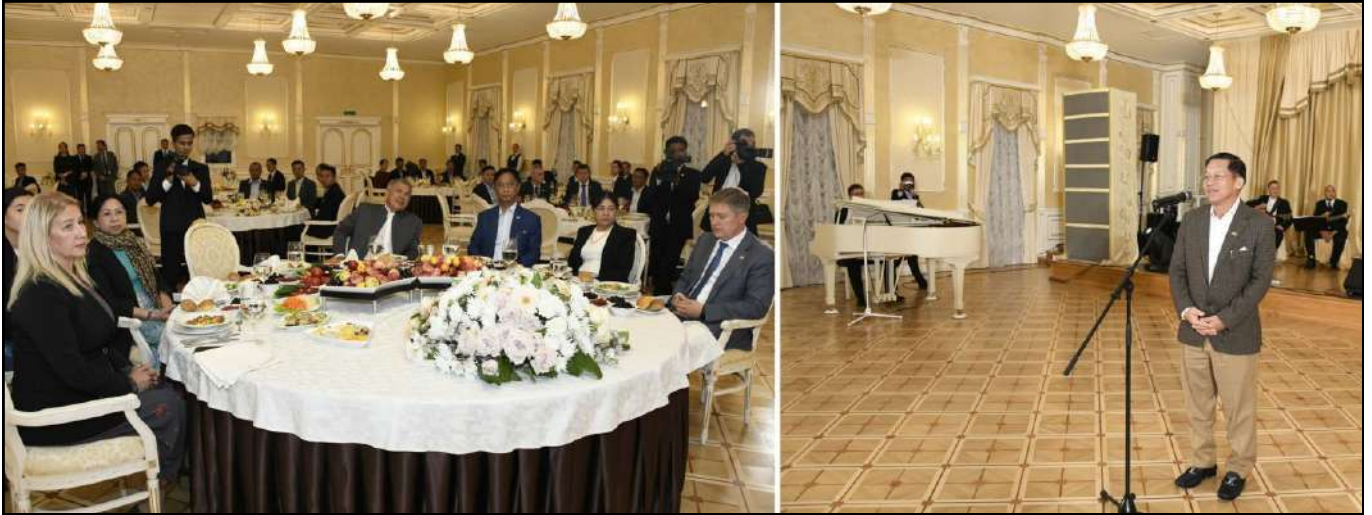
Prime Minister extending greeting in honourable dinner hosted by President of the Republic of the Tatarstan