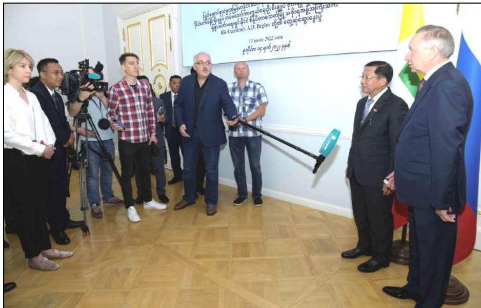
Prime Minister and Head of the St. Petersburg Government answering the questions raised by media agencies