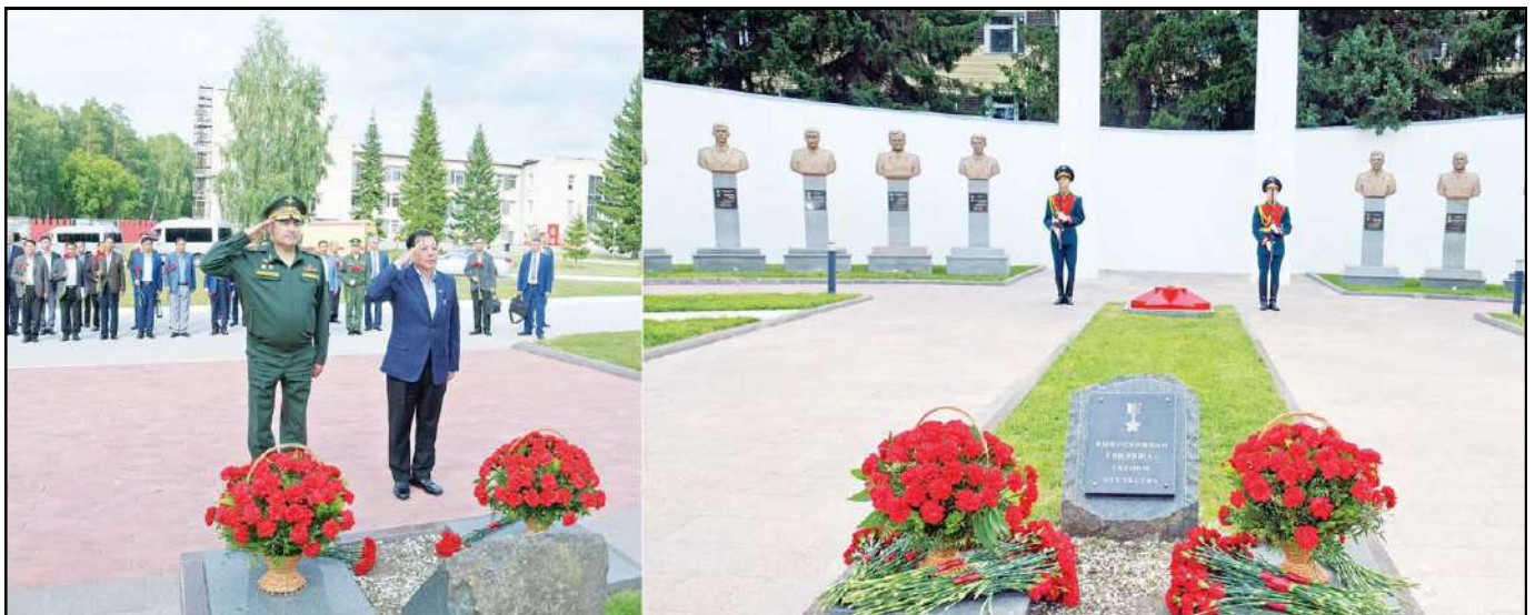
Prime Minister saluting the statues of those who were awarded gallantry medals for sacrificing their lives for the State and laying a wreath at the Higher Military Command School