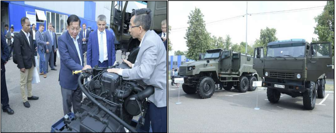
Prime Minister observing production of military transport and battlefield bullet-proof vehicles and engines