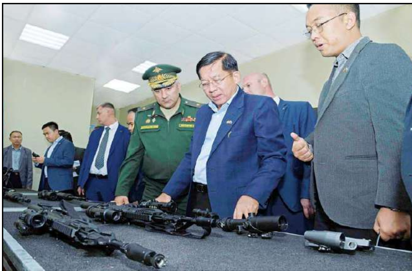
Prime Minister observing weapons and sights developed by the Russian Armed Forces