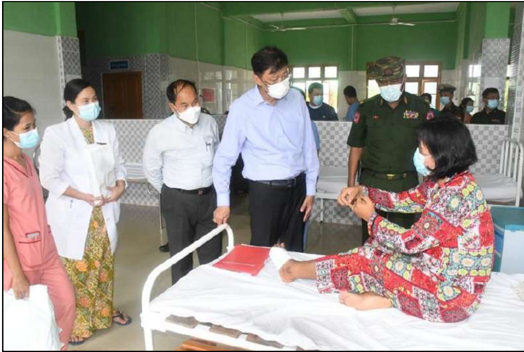
Member of the State Administration Council Union Minister for Defence General Mya Tun Oo comforting a patient receiving medical treatments at public hospital of Hkamti township after asking after her