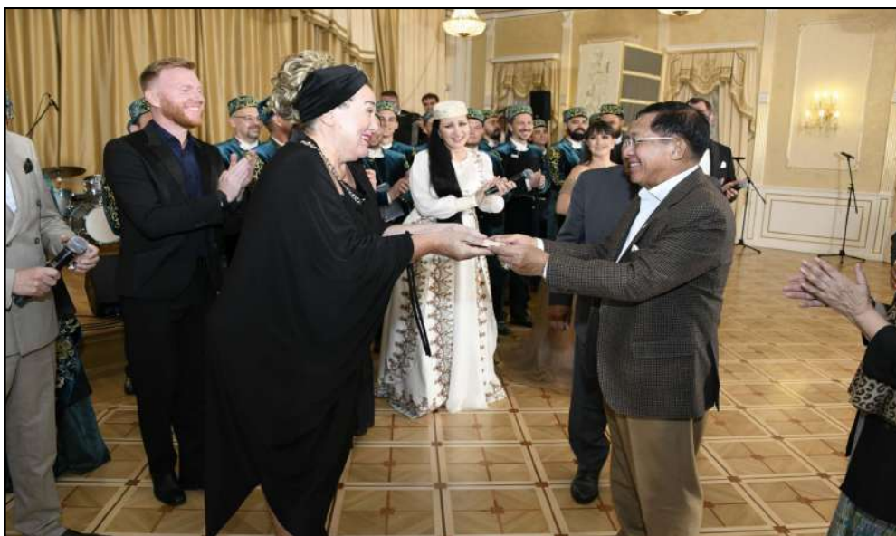
Prime Minister presenting cash awards to the traditional music troupe of the Republic of the Tatarstan