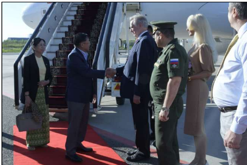
Prime Minister and wife warmly welcomed by the officials of the government office of St. Petersburg at Pulkovo International Airport of St. Petersburg