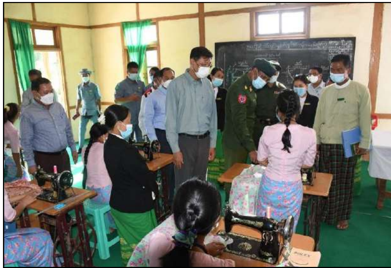
Member of the State Administration Council Union Minister for Defence General Mya Tun Oo viewing the artistic creation of the trainees at the Women's Vocational School in Lahe town