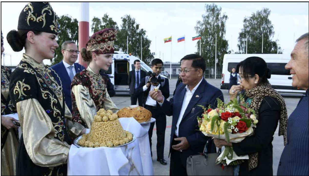
Prime Minister and wife warmly welcomed by President of the Republic of the Tatarstan in accord with the traditions and culture