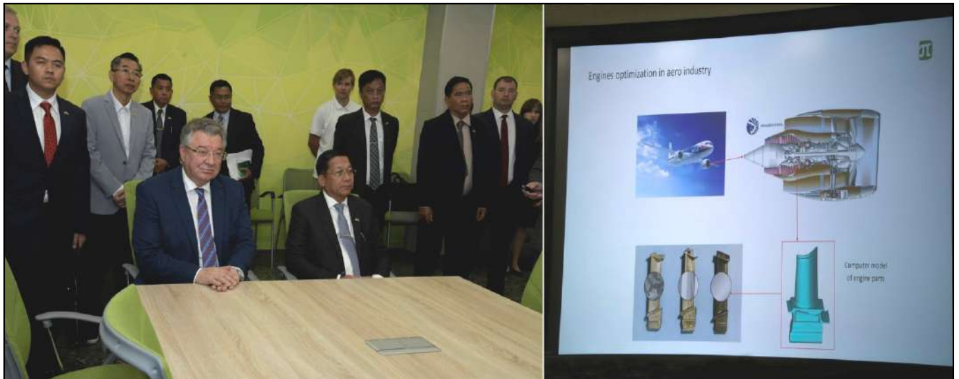
Prime Minister hearing reports on subject-wise lectures at the university presented by the rector of the Polytechnic State University in St. Petersburg