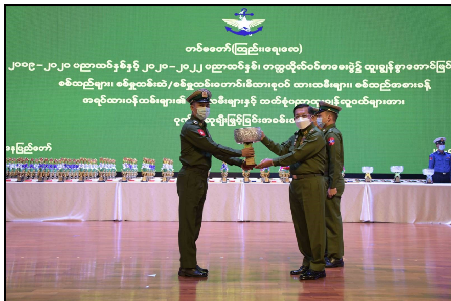
Commander-in-Chief of Defence Services presenting the first prize for the highest pass-rate in the 2019-2020 and 2021-2022 academic years to administrative officer of No. (2) Mingaladon Township Basic Education High School, also known as the Aung San Thuriya Hla Thaung School