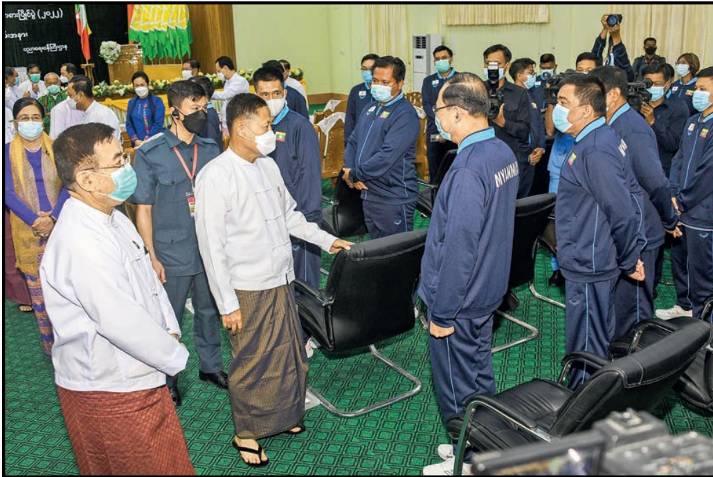
Chairman of Education, Health and Human Resources Development Committee Vice-Chairman of the State Administration Council Deputy Prime Minister cordially greeting the athletes representing Myanmar that will compete in the 20 th ASEAN University Games