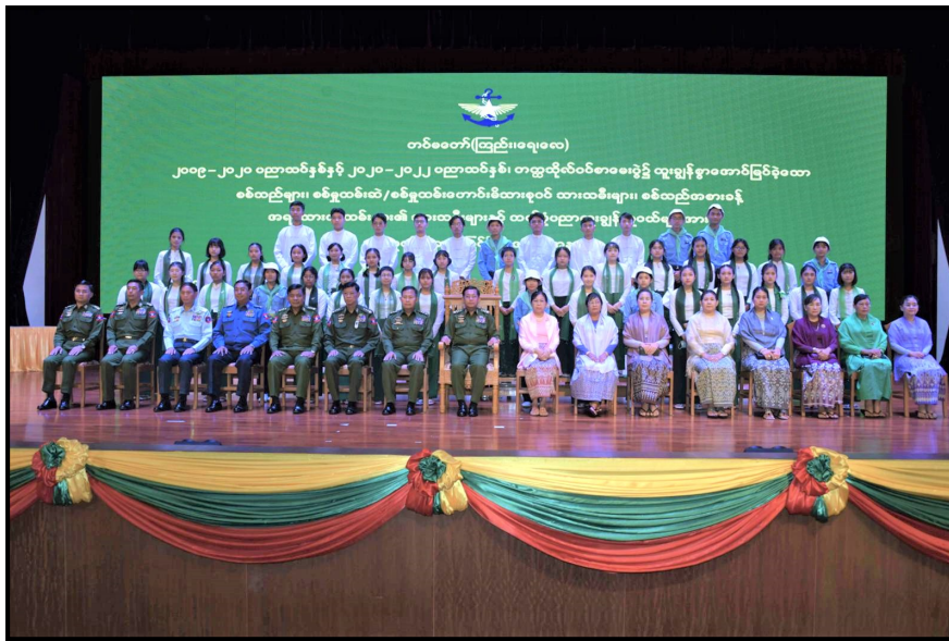
Commander-in-Chief of Defence Services and party taking a documentary photo with the outstanding students