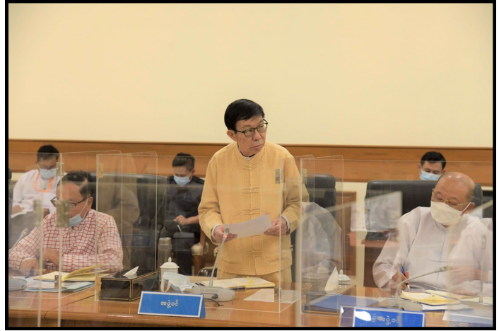
Member of the State Administration Council U Sai Lon Hsai making discussion in the meeting

been improved, it is necessary to upgrade their houses and produce enough cement needed for construction of houses at home. The government will offer necessary assistance to operate factories in the nation at full capacities.