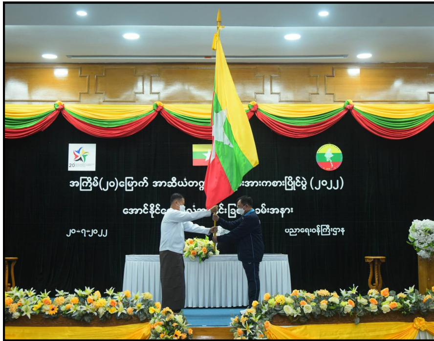
Chairman of Education, Health and Human Resources Development Committee Vice-Chairman of the State Administration Council Deputy Prime Minister handing over the flag of the Republic of the Union of Myanmar to leader of the Myanmar university sports contingent Rector of Yangon University