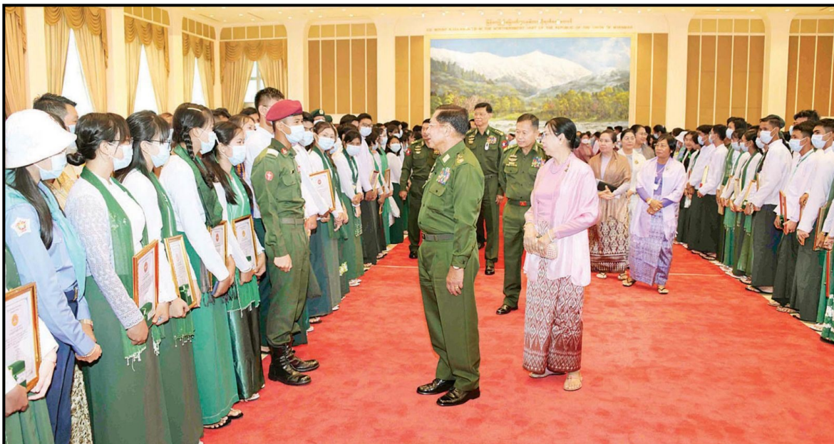
Commander-in-Chief of Defence Services and wife cordially greeting outstanding military personnel and students, their parents and teachers

parents and teachers with a feast of food. After the reception, the Senior General and wife and party cordially greeted them.