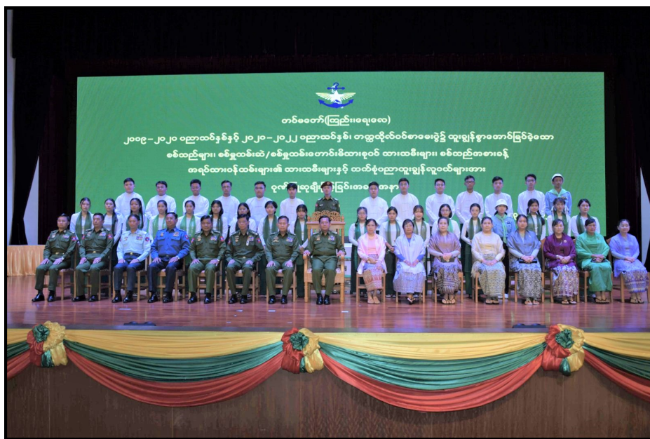
Commander-in-Chief of Defence Services and party taking a documentary photo with the outstanding students

education; (b) shall be given basic education which the Union prescribes by law as compulsory;”.