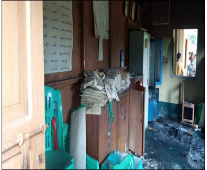
Damages of school facilities of the Basic Education Sub-High School of Saluchaung village in Shwegyin township in the aftermath of arson attacks of PDF terrorists

On 23 July, terrorists entered the area of the Basic Education Sub-High School in Saluchaung village of Shwe Kyin township of Bago region and set fire to the school buildings. Due to the fire outbreak, one wooden table in the principal's office, four plastic chairs, one wooden chair, two desks, one aluminum cabinet, one clock, science practical materials, documents and the ceilings of the school were destroyed in fire.