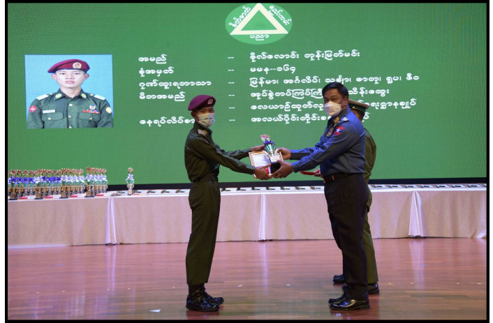
Member of the State Administration Council Admiral Tin Aung San presenting honorary award to a six-distinction winner