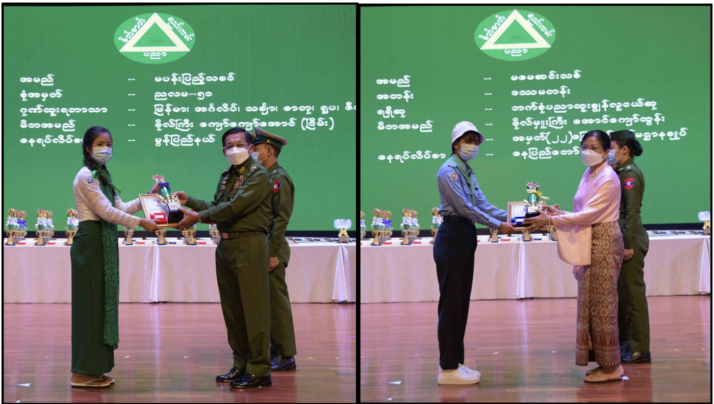
Commander-in-Chief of Defence Services and wife presenting honorary awards to the outstanding students who secured six distinctions and all-round outstanding prizes

students, the Tatmadaw Basic Education High Schools and Tatmadaw Education Schools, which won the highest pass-rates, will also be awarded deservedly.