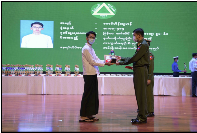
Member of the State Administration Council Union Minister for Defence General Mya Tun Oo presenting honorary award to a six-distinction winner