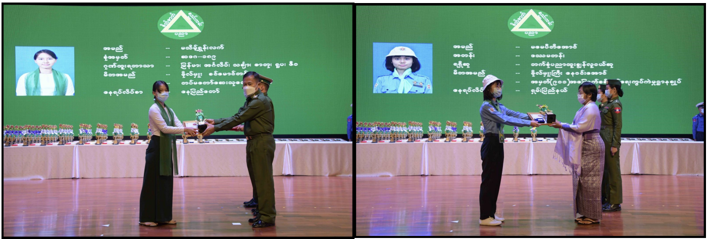
Deputy Commander-in-Chief of Defence Services and wife presenting honorary awards to the outstanding students who secured six distinctions and all-round outstanding prizes

als, prizes and certificates of honour to two male students and one female student who won all-round outstanding prize, and one male student and two female students who won six distinctions in 2021-2022 academic year respectively.