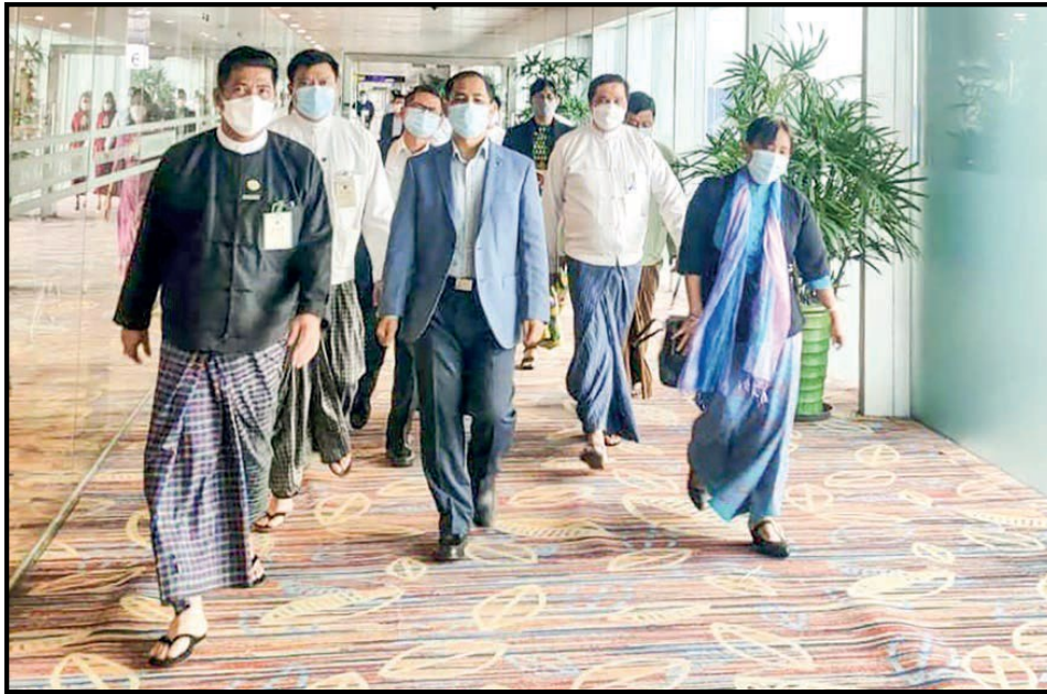
Myanmar delegation led by Union Minister for International Cooperation U Ko Ko Hlaing seen off by the officials at Yangon International Airport

non-injured Contracting Party to the Convention.