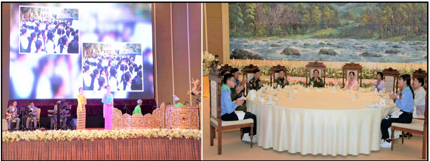
Commander-in-Chief of Defence Services and wife together with attendees enjoying the honourable songs performed by Myawady modern musical troupe