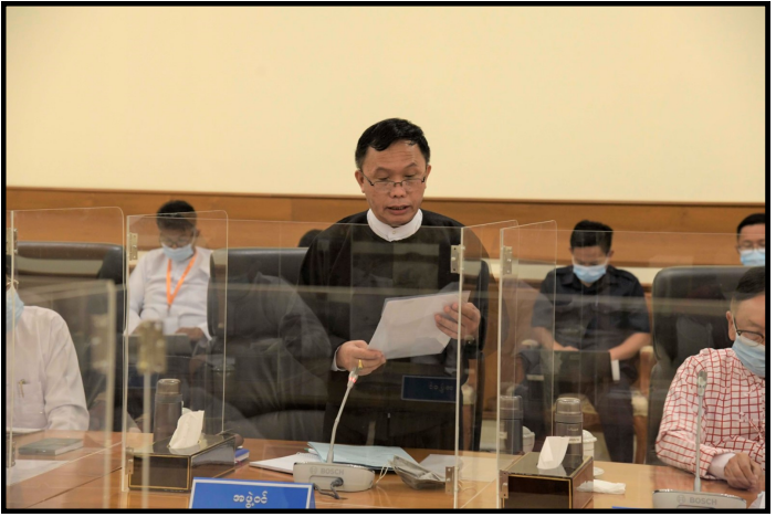
Member of the State Administration Council U Shwe Kyein making discussion in the meeting

be implemented in coastal areas. It is necessary for the government to carry out electricity generation tasks as a State level and the government is ready to offer assistance to private entrepreneurs to enable them to generate electricity as small and medium scale of production.