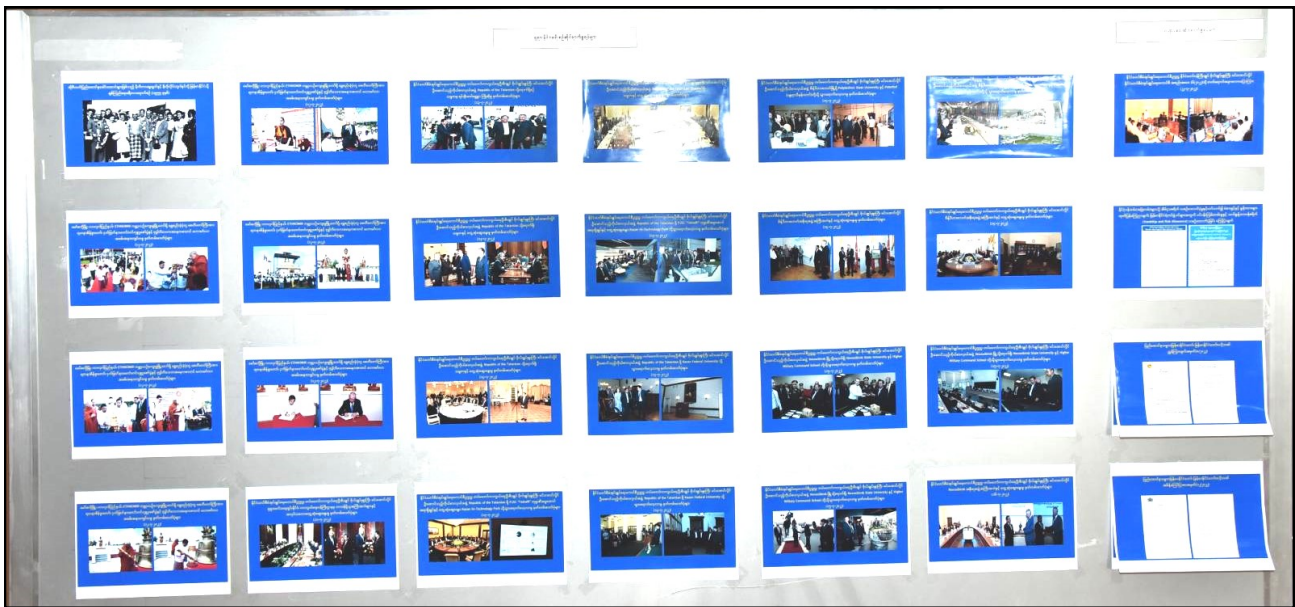
Photo records displayed at the 18 th Press Conference of the Information Team of the State Administration Council

extent, AA abducted some innocent civilians, government employees and security force members in previous months. At the same time, the unscrupulous persons who do not want peace in Rakhine State also spread misinformation and fake news to create misunderstanding between the two groups to cause war with suspicion.