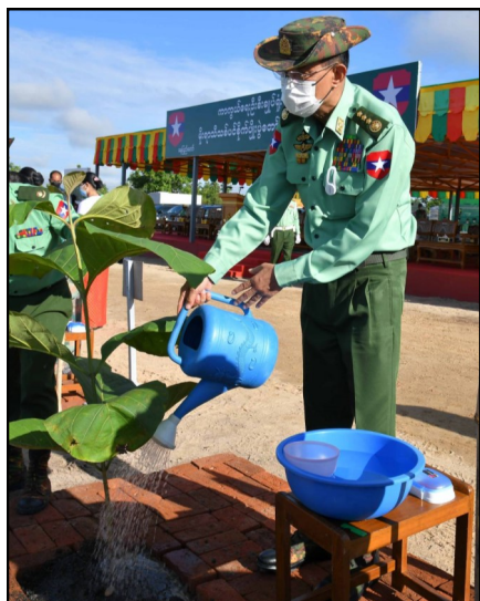
General Mya Tun Oo