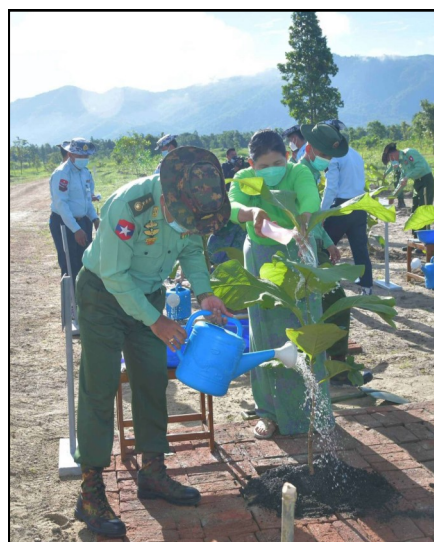
General Maung Maung Aye