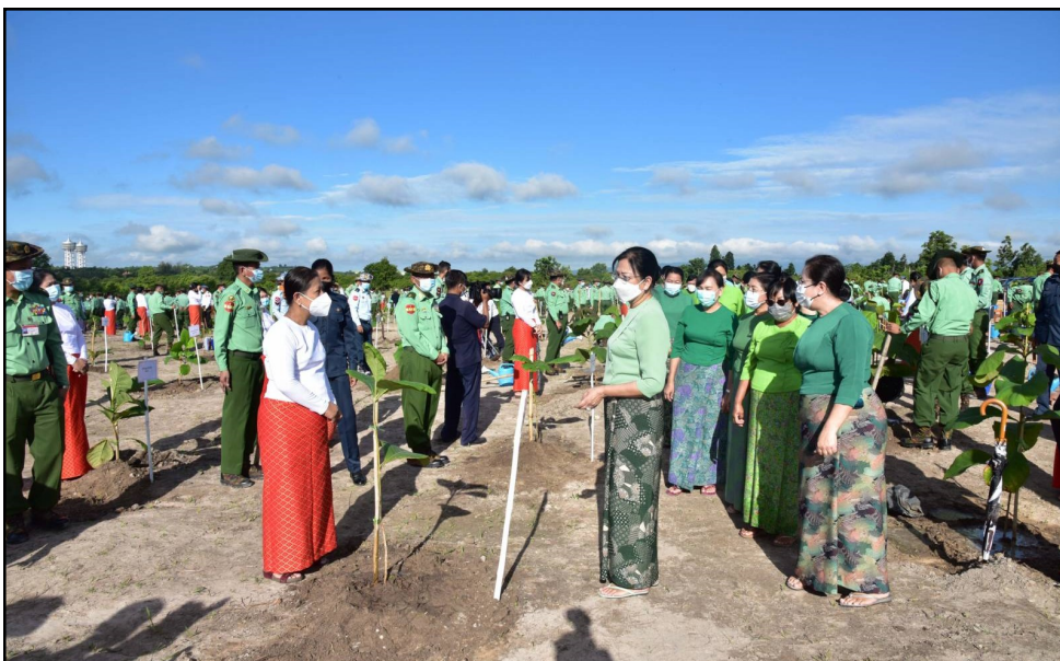
Wife of the Commander-in-Chief of Defence Services viewing round collective growing of saplings by officers, other ranks and families