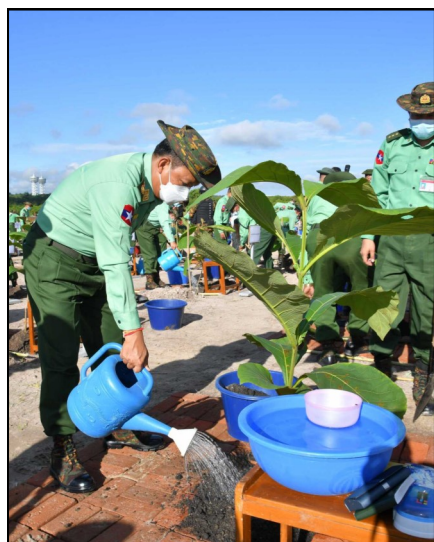
Lt-Gen Moe Myint Tun