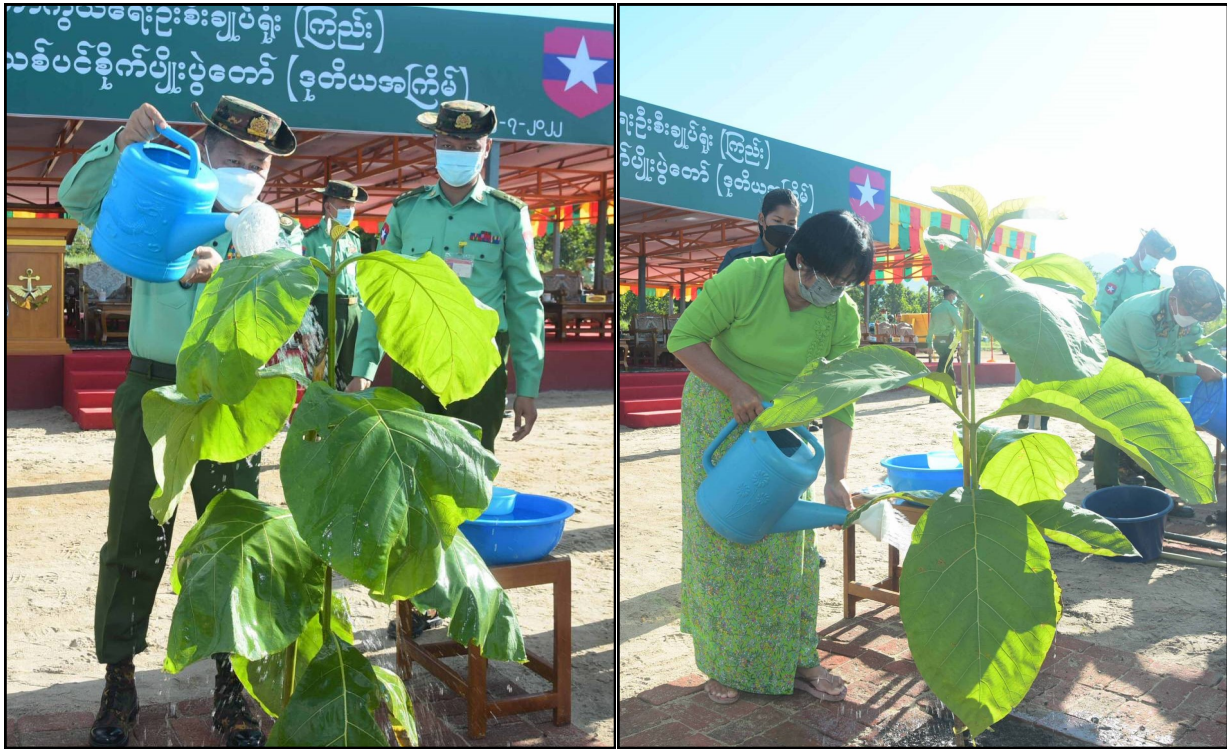
Vice-Chairman of the State Administration Council Deputy Commander-in-Chief of Defence Services Commander-in-Chief (Army) and wife planting precious teak saplings