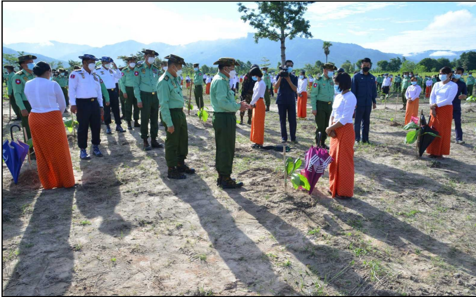
Commander-in-Chief of Defence Services viewing round collective growing of saplings by officers, other ranks and families