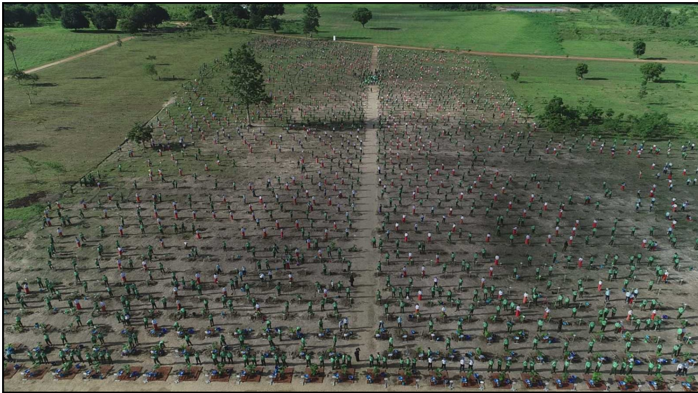
Aerial view of the second monsoon tree-planting ceremony for 2022 of the families of Office of Commander-in-Chief (Army, Navy and Air)