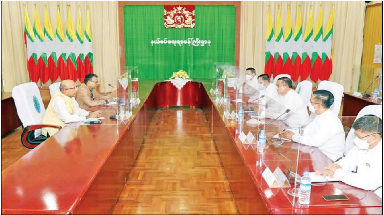
Union Minister for Border Affairs and Indian Ambassador to Myanmar holding a meeting

Thaung Han of Ministry of Electric Power and Ministry of Energy received Mr Vinay Kumar, Ambassador Extraordinary and Plenipotentiary of the Republic of India to the Republic of the Union of Myanmar at the respective ministries on 26 July. The Union Minister U Khin Yi of Ministry of Immigration and Population also received the Indian Ambassador to Myanmar at the ministry on 25 July.