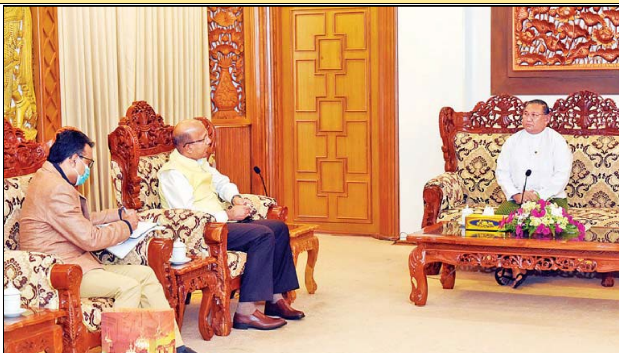
Union Minister for Foreign Affairs receiving Indian Ambassador to Myanmar

Union Minister U Wunna Maung Lwin of Ministry of Foreign Affairs, Union Min-