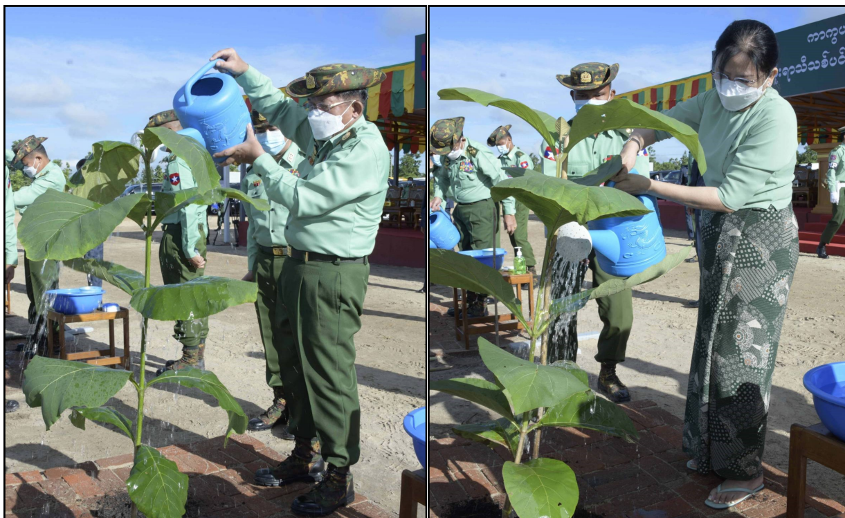
Chairman of the State Administration Council Commander-in-Chief of Defence Services and wife planting precious teak saplings