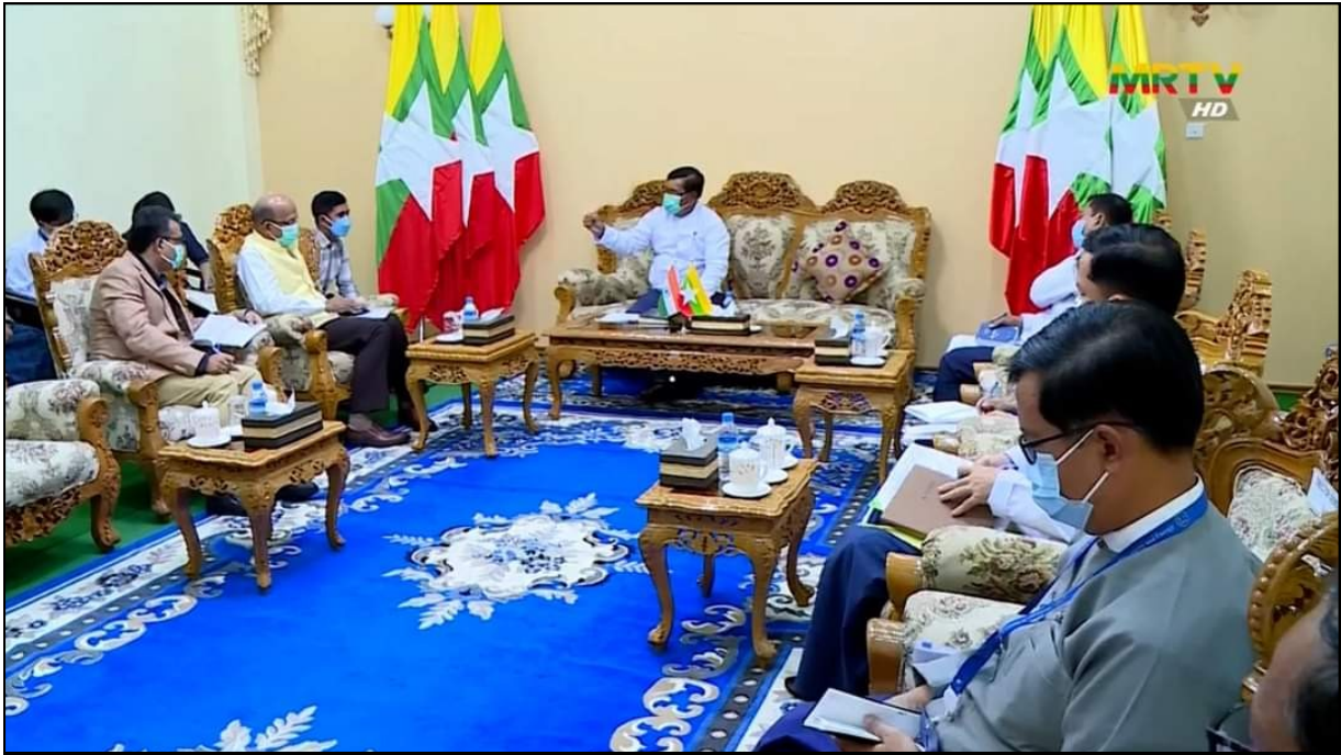
Union Minister for Electric Power and for Energy receiving Indian Ambassador to Myanmar