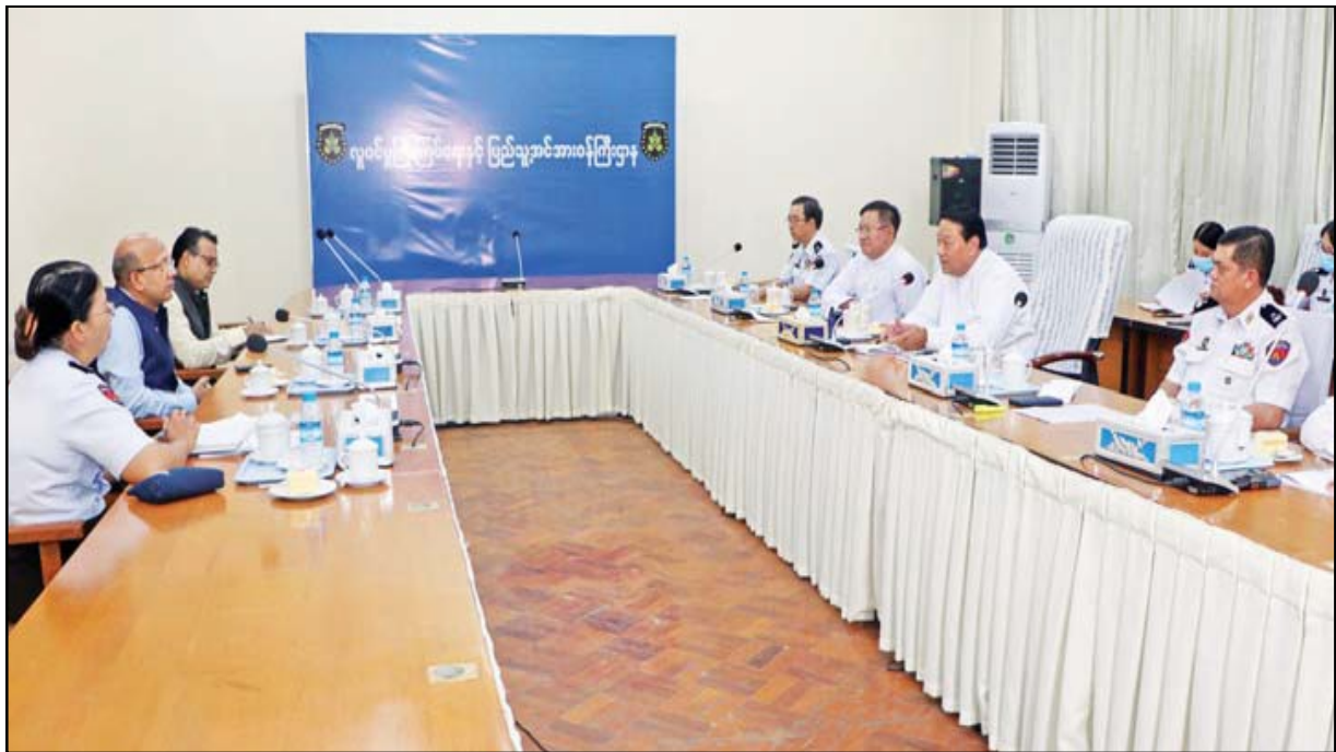
Union Minister for Immigration and Population receiving Indian Ambassador to Myanmar

holding of e-ID seminars and workshops with the assistance of Indian Ministries as well as the Embassy of India in Myanmar attended the occasions. holding of e-ID seminars and workshops with the assistance of Indian Ministries as well as the Embassy of India in Myanmar attended the occasions. holding of e-ID seminars and workshops with the assistance of Indian Ministries as well as the Embassy of India in Myanmar attended the occasions. holding of e-ID seminars and workshops with the assistance of Indian Ministries as well as the Embassy of India in Myanmar attended the occasions.