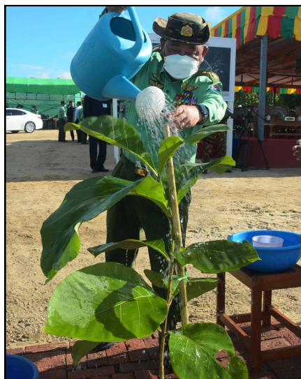
Lt-Gen Soe Htut