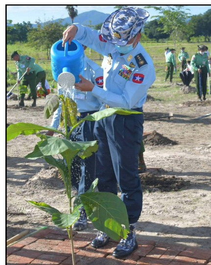
General Tun Aung