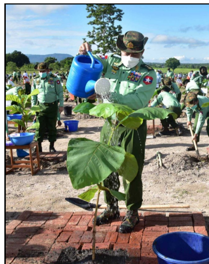
Lt-Gen Yar Pyae