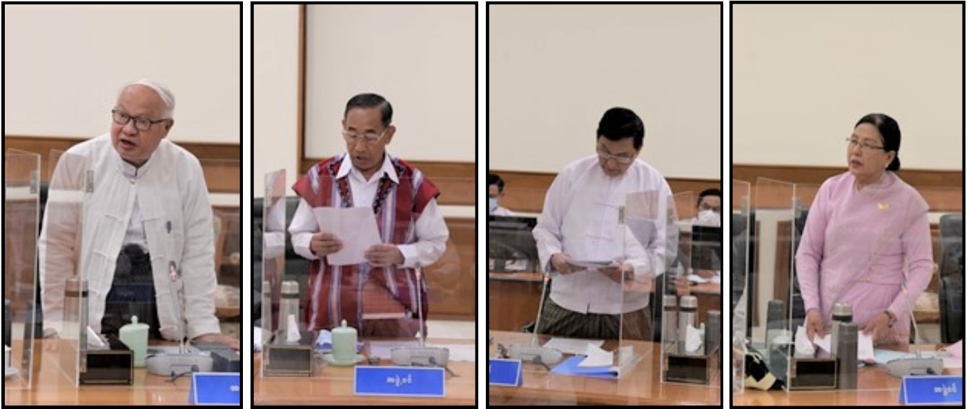
SAC members making discussions in progress

We have achieved success. When I asked them about accepting the construction of the Union authorized with democratic administration and federal power, they all agreed to it. I will meet them again as second time meeting in August.”