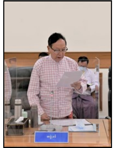
SAC members making discussions in progress

Afterwards, the council members discussed the enactment of a law to take severe action against national traitors and those who committed the high treason cases, plans to take effective legal action against those who controlled behind to be unstable prices of commodities and fuel in the country, restriction for mobilizing the act based on religions, plans to cease the terror attacks and ways to control currency value at home. Then, the Vice-Chairman of the SAC Deputy Prime Minister Vice discussed the supplementary points to be inserted into the law on archives for historic persons.