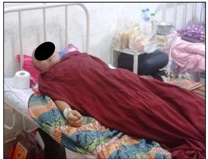
Two Buddhist monks got injuries in the remote IEDs attacks on passenger vehicle by terrorists near Gway Pin Taw village in Myinmu township