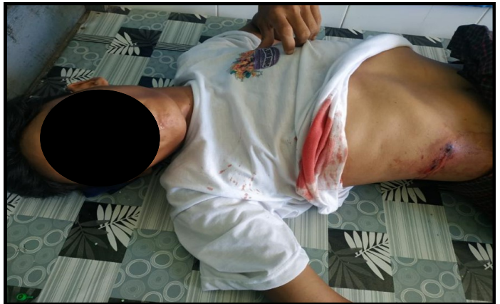
A police force member injured in the gun attack of terrorists in front of the Kanaung area police station in Myanaung township