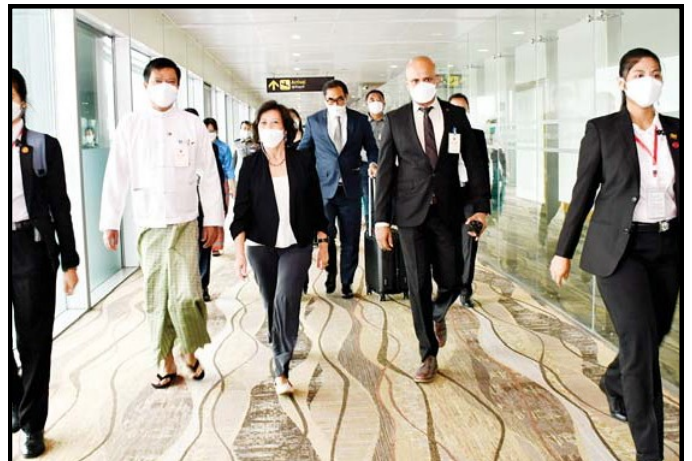
Officials welcoming special envoy of the United Nations Secretary-General on Myanmar at the airport