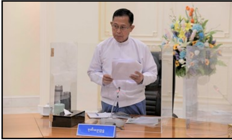
Vice-Chairman of the State Administration Council Deputy Prime Minister making discussion in progress