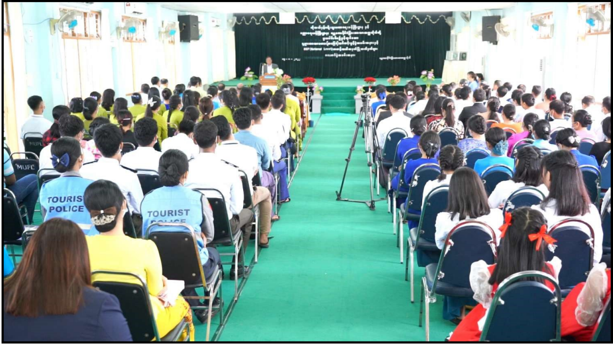
Union Minister Dr. Htay Aung delivering an address at the opening ceremonies of basic Russian language course in Mandalay and Pyin Oo Lwin townships

of Foreign Language. During the courses, regular assessments will be conducted for