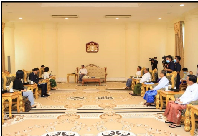
Prime Minister receiving special envoy of the United Nations Secretary-General on Myanmar