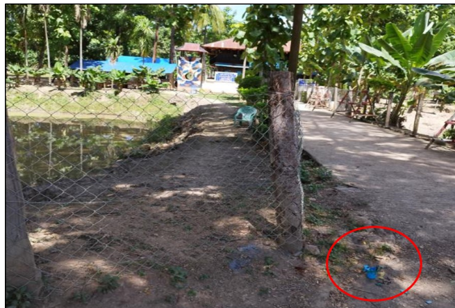
The incident seen after terrorists exploded IEDs in front of the Kanaung area police station in Myanaung township