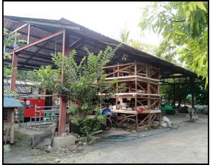
Myanmar Thura Jewellery Company’s workshop that was sealed in Chanayethazan township