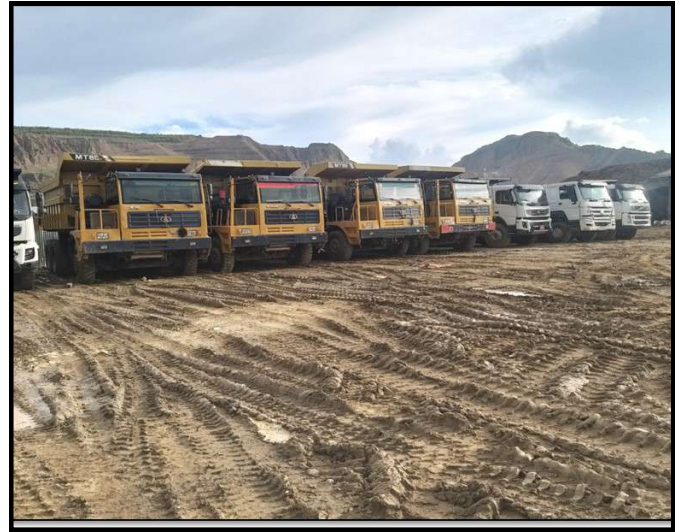
The seized machineries from the jade tract of Myanmar Thura Jewellery Company in Hpakant township