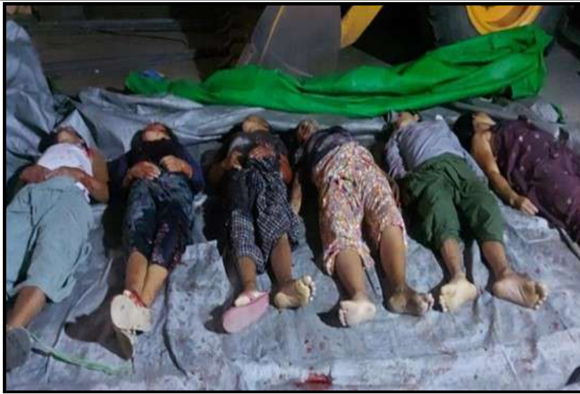
Six innocent civilians died in the gun attacks of PDF/YDF terrorists in Saw township for no reasons