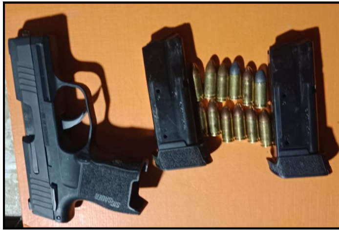
The confiscated weapons/ammunition at the bedroom of the house located in the compound of Myanmar Thura Jewellery Company owned by Kyaw Thura in Nanma village of Hpakan township