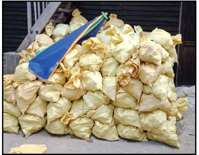
Varieties of cut-jade stones seized at Myanmar Thura Jewellery Company’s workshop in Hpakant township