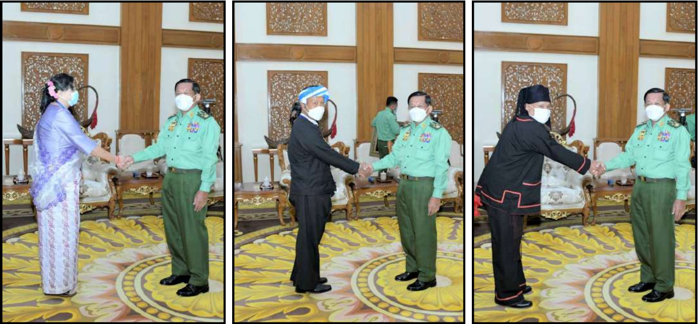
Commander-in-Chief of Defence Services Senior General Min Aung Hlaing cordially greeting the peace representatives