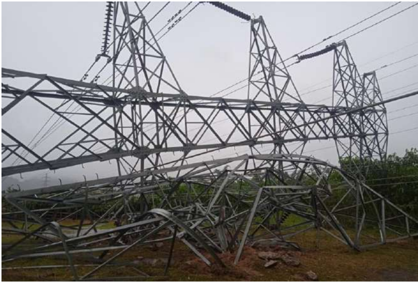
Damages of No. (173) tower in the aftermath of mine attack of KKO (Splinter Group) and PDF terrorists