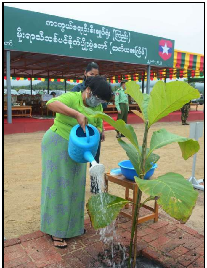
Vice-Chairman of the State Administration Council Deputy Commander-in-Chief of Defence Services and wife planting precious teak saplings