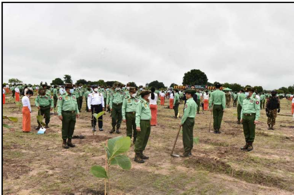
Chairman of the State Administration Council Commander-in-Chief of Defence Services and party encouraging the tree-planting activities of families in the third monsoon tree-planting ceremony