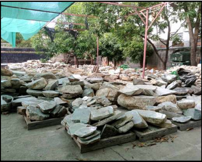
Varieties of cut-jade stones seized at Myanmar Thura Jewellery Company’s workshop in Chanayethazan township