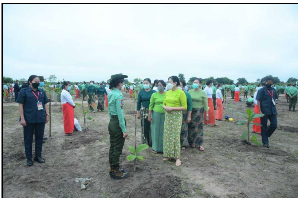
Chairman of the State Administration Council Commander-in-Chief of Defence Services and party encouraging the tree-planting activities of families in the third monsoon tree-planting ceremony