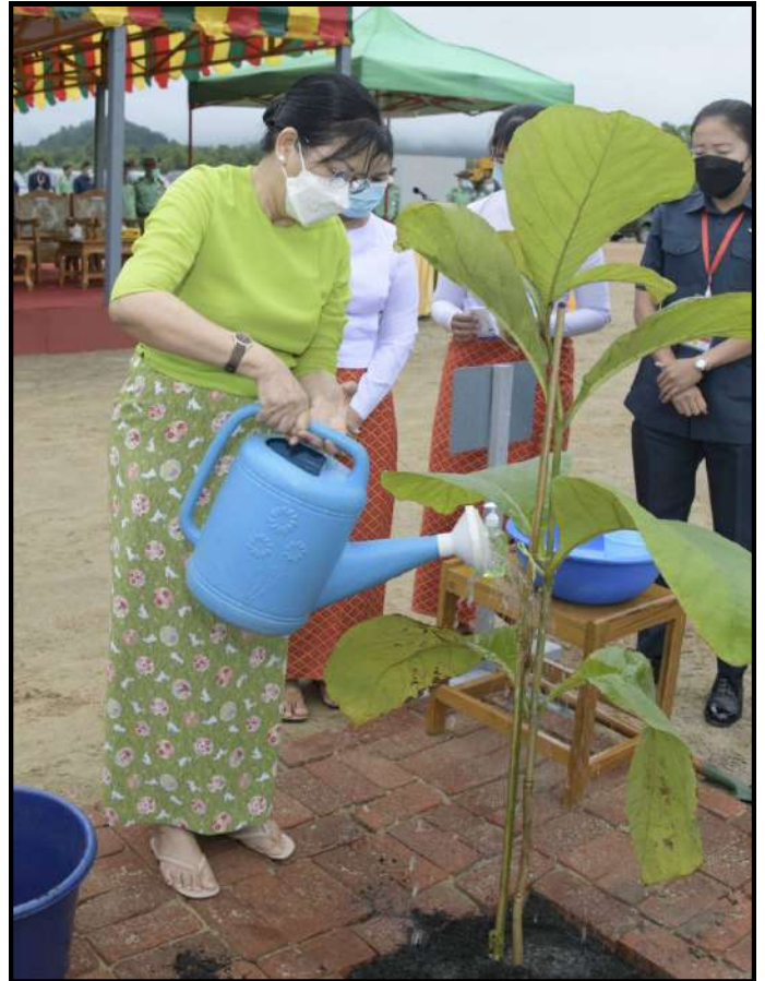
Chairman of the State Administration Council Commander-in-Chief of Defence Services and wife planting precious teak saplings