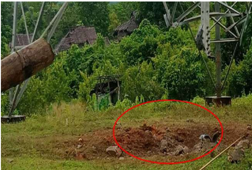
Damages of No. (172) tower in the aftermath of mine attack of KKO (Splinter Group) and PDF terrorists

in Kyondoe, Kawkareik, Myawady and Kyar Inn Seik Gyi townships of Kayin state, it is reported.